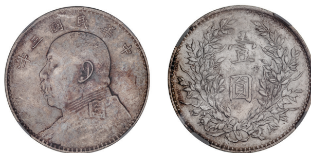
3127* China, Republic, Yuan Shi Kai, silver dollar, Yr 3 (1914) (KM.Y.329). Extremely fine/ good extremely fine.