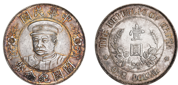
3126* China, Republic, silver dollar, (1912), Li Yuan-Hung (KM.Y.320). Grey toned with golden highlights, extremely fine or better.