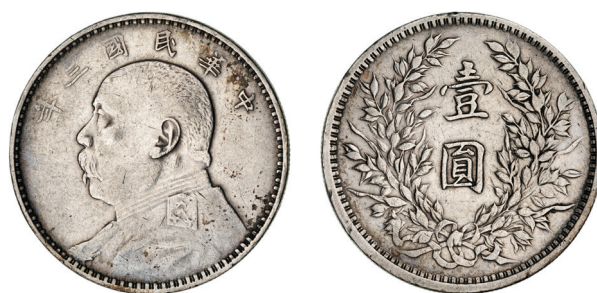
3128* China, Republic, Yuan Shi Kai, silver dollar, Yr 3 (1914) (KM.Y.329). Very fine.