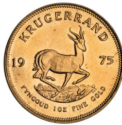
2942* South Africa, Republic, Krugerrand, 1975 (KM.73). Uncirculated.