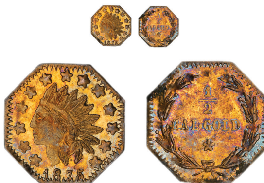
3012* USA, California fractional gold octagonal half dollar, 1875, Indian head. Old tone, nearly uncirculated.