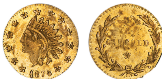
3013* USA, California fractional gold round half dollar, 1876 Indian head. Nearly uncirculated.