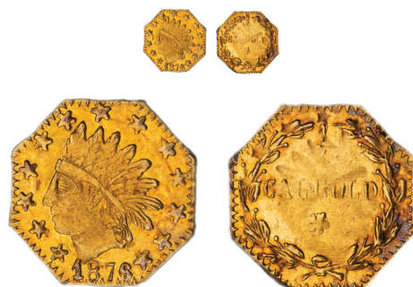
3011* USA, California fractional gold octagonal quarter dollar, 1876, Indian head. Extremely fine.