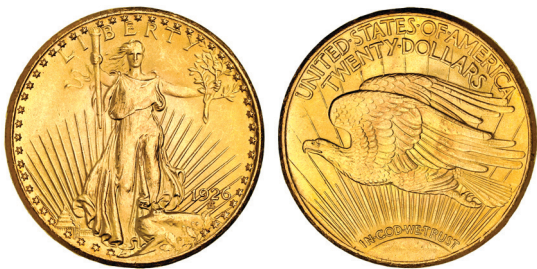
3009 USA, twenty dollars or double eagle, 1926, St. Gaudens. Nearly uncirculated.