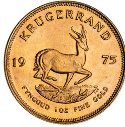
2941* South Africa, Republic, Krugerrand, 1975 (KM.73). Uncirculated.