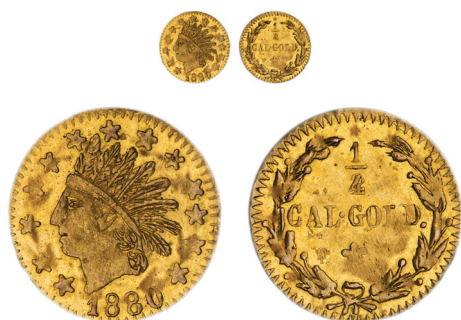
3010* USA, California fractional gold, round quarter dollar, 1880, Indian head. Good extremely fine.