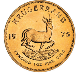
2945* South Africa, Republic, Krugerrand, 1976 (KM.73). Choice uncirculated.