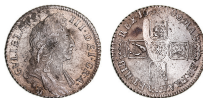
2508* William III, silver shilling, first bust, 1696B (Bristol) (ESC 1081; S.3498). Good fine.