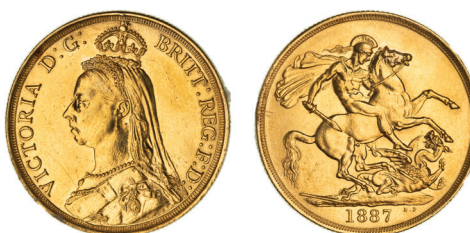
2670* Queen Victoria , Jubilee coinage, two pounds, 1887 (S.3865). Polished otherwise good extremely fine.