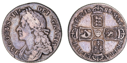
2502* James II, silver shilling, 1688/7 (S.3410; ESC 1074). Toned, good fine.