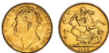
2648* George IV, bare head, two pounds, 1823 (S.3798). Has been mounted, very good.