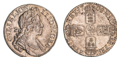
2509* William III, silver shilling, fifth bust, 1700 (S.3516). Good very fine.