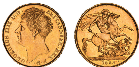
2647* George IV, bare head, two pounds 1823, lettered edge (S.3798). Nearly extremely fine/ extremely fine.