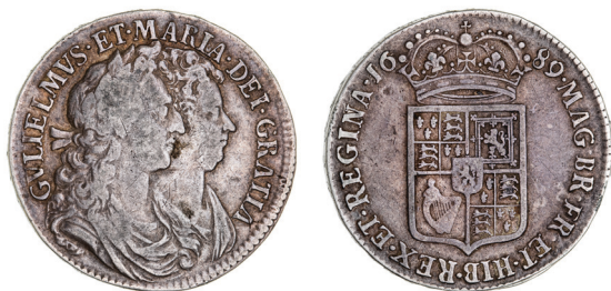
2503* William and Mary, silver halfcrown, first busts, 1689, caul frosted, no pearls (S.3435). Toned, good fine.