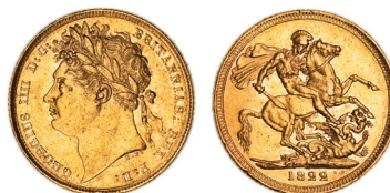
2650* George IV, laureate head, sovereign, 1822 (S.3800). Nearly extremely fine.