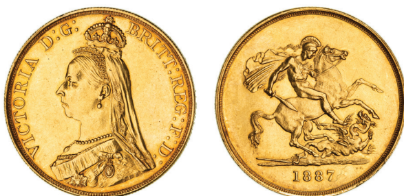
2666* Queen Victoria , Jubilee coinage, five pounds, 1887 (S.3864). A little rubbed otherwise good extremely fine.