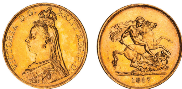
2665* Queen Victoria , Jubilee coinage, five pounds, 1887 (S.3864). Underlying brilliance, nearly uncirculated.