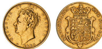
2651* George IV, bare head left, sovereign, 1825 (S.3801). Nearly very fine.