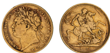
2649* George IV, laureate head left, sovereign, 1821 (S.3800). Fine.