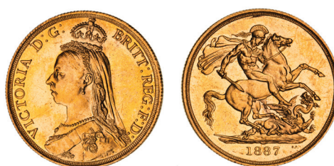
2668* Queen Victoria , Jubilee coinage, two pounds, 1887 (S.3865). Considerable mint bloom, nearly uncirculated.