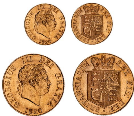
2646* George III, new coinage, half sovereign, 1820 (S.3786). Good extremely fine.