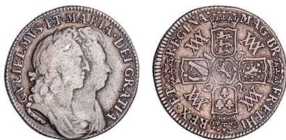
2504* William and Mary, silver shilling, 1692, RE/ET (ESC 1075B; S.3437). Toned fine/ good fine.