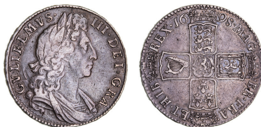
2507* William III, silver halfcrown, first bust, 1698 (S.3494). Grey toned, nearly very fine.