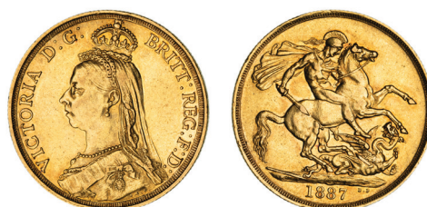
2669* Queen Victoria , Jubilee coinage, two pounds, 1887 (S.3865). Good extremely fine.