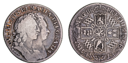
2505* William and Mary, silver shilling, first bust, 1693, 9/E, (ESC 1076; S.3437). Toned, very good/ nearly fine.