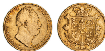
2654* William IV, sovereign, 1836 (S.3829B). Fine.