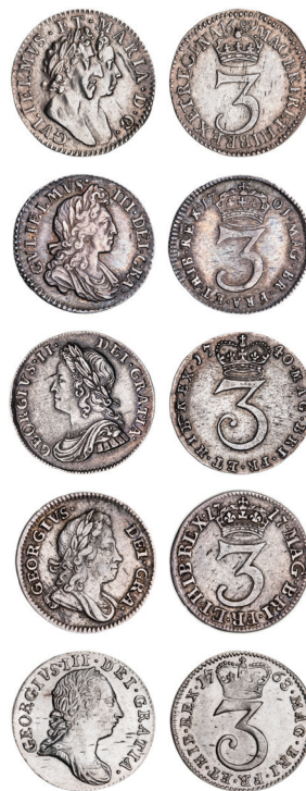
2506* William and Mary, William III, George I, George II, George III, Maundy threepences, 1689 (S.3441); 1701 (S.3550); 1717 (S.3655); 1740 (S.3713D); 1763 (S.3753). Very fine - nearly uncirculated. (5)