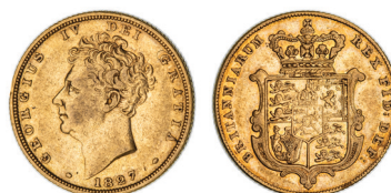
2652* George IV, bare head left, sovereign, 1827 (S.3801). Very fine.