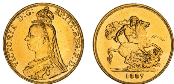
2667* Queen Victoria , Jubilee coinage, five pounds, 1887 (S.3864), jeweller's copy (40.04g). Nearly uncirculated.