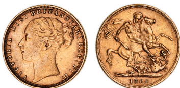
2663* Queen Victoria , young head, sovereign, 1884 (S.3856B). Nearly very fine.