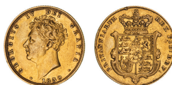
2653* George IV, bare head left, sovereign, 1830 (S.3801). Good very fine.