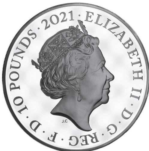
Part Lot 1848