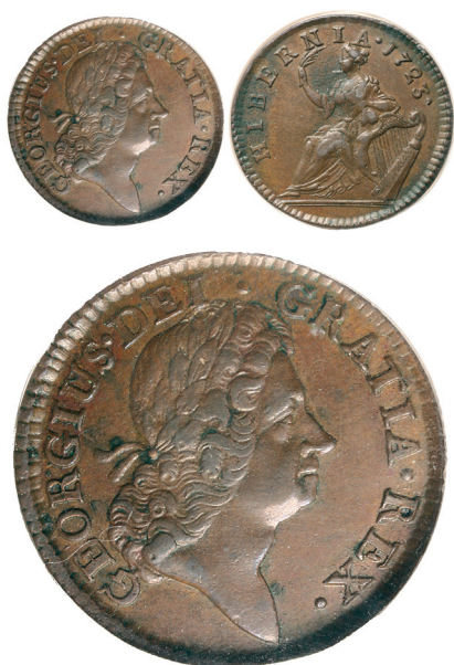
Part of Lot 1856