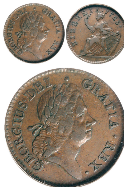
Part of Lot 1858