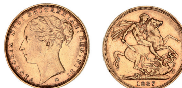
987* Queen Victoria, young head, 1887 Melbourne. Good very fine. $750