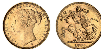
986* Queen Victoria, 1885 no BP (McD.169b). Extremely fine. $800