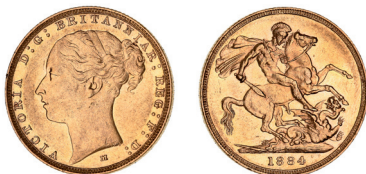
984* Queen Victoria, 1884 Melbourne (McD.167b). Extremely fine. $800