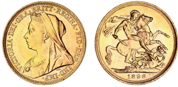
990* Queen Victoria, 1896 Melbourne. Nearly uncirculated. $750