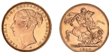
985* Queen Victoria, 1886 Melbourne. Nearly uncirculated. $850