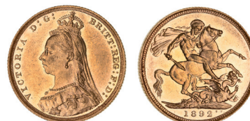
988* Queen Victoria, 1892 Sydney. Good extremely fine. $800