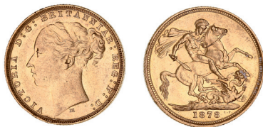
980* Queen Victoria, 1878 Melbourne. Nearly uncirculated. $900