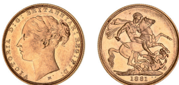
982* Queen Victoria, 1881 Melbourne (McD.161). Nearly uncirculated. $800