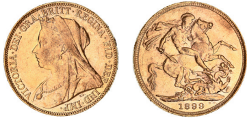
991* Queen Victoria, 1899 Perth. Nearly uncirculated. $1,000

Private purchase from R.C.C. with their tag, 29.5.12.