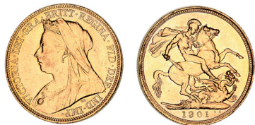
992* Queen Victoria, 1901 Sydney. Nearly uncirculated. $800

Private purchase from R.C.C. with their tag, 29.5.12.