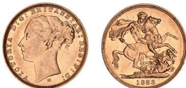
983* Queen Victoria, 1883 Melbourne (McD.165a). Extremely fine/ good extremely fine. $800