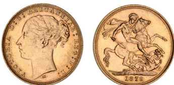
981* Queen Victoria, 1879 Melbourne (McD 157). Good extremely fine. $900