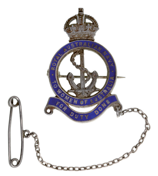
124* Australia, WWI Nearest Female Relative's badge (RAN), By Stokes & Sons, Melbourne, pin-back with safety chain, reverse numbered 521. Very fine and scarce.