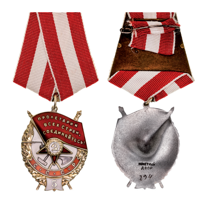
288* Russia, (USSR), Order of the Red Banner Fifth Award, Type 3 Variation 4, with engraved serial number 294. Nearly extremely fine. $3,500