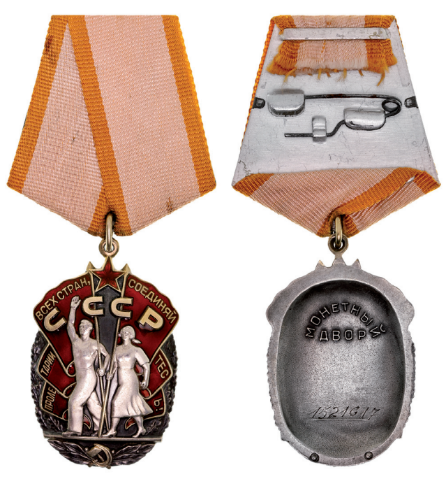
294* Russia, (USSR), Order of Honor, engraved serial number 1521617, together with named award booklet. Good very fine . $210