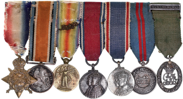
Part of Lot 267