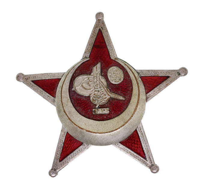
310* Turkey, Ottoman War Medal, commonly called The Gallipoli Star, back stamped with maker's mark, B.B. & Co (Binder Bruder & Co, Ludenschied, Germany). Toned good very fine.