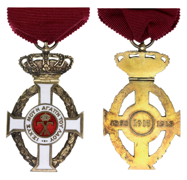
278* Greece, Royal Order of George I, Knight. Good very fine . $200

The Star of the Grand Cross of the Iron Cross was only awarded twice, once in 1815 and again in 1918.