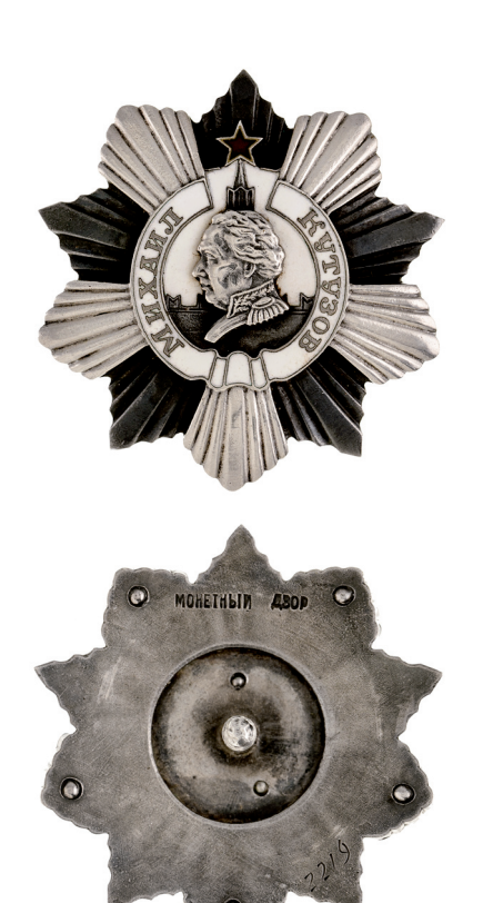
291* Russia, (USSR), Order of Kutuzov 2nd Class, Type 2 Variation 2, with engraved number 2219, screw back fitting. Very fine.