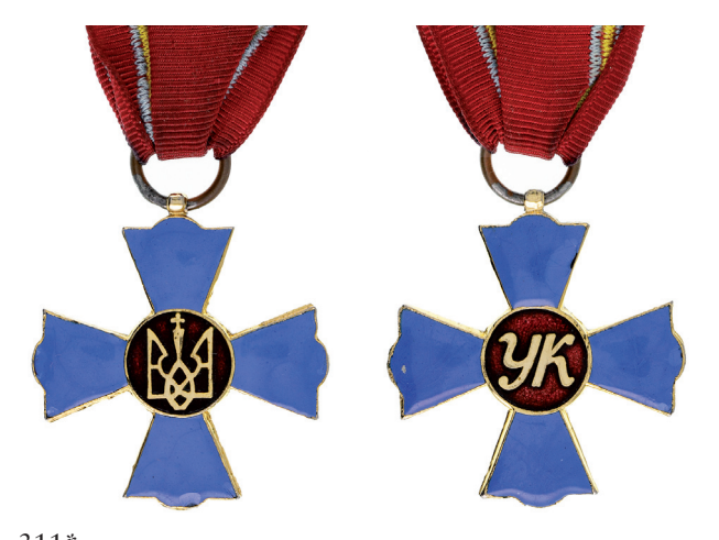
311* Ukraine, Cossack Cross. Extremely fine.