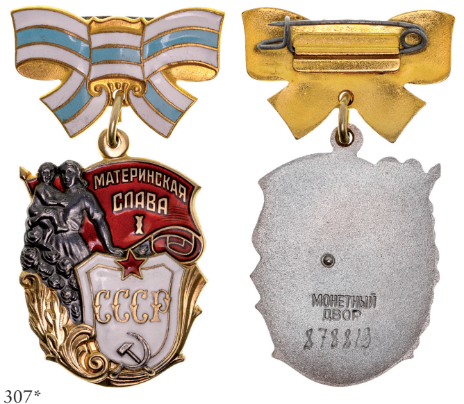
Russia, (USSR), Order of Maternal Glory 1st Class, reverse with engraved serial number 878813. Extremely fine.