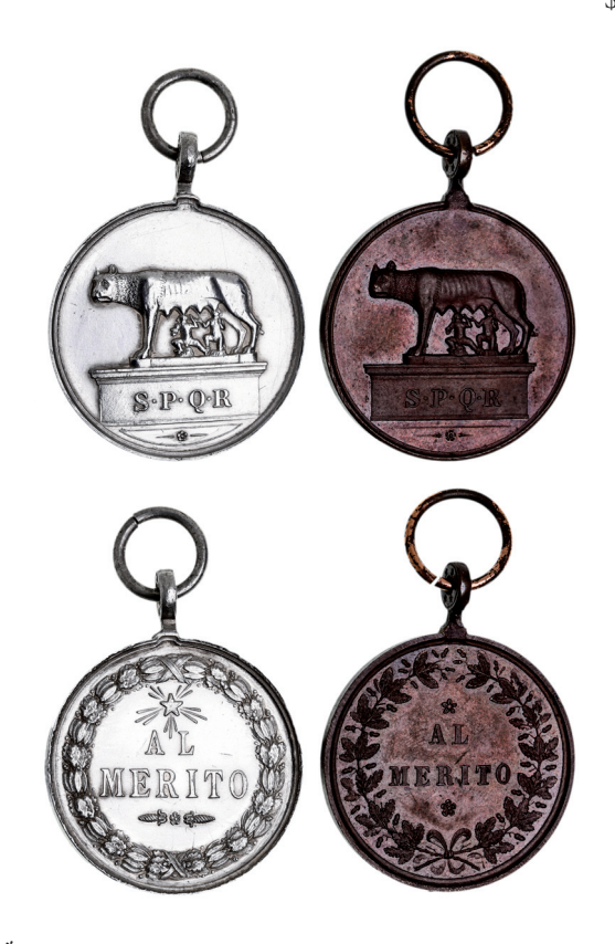
281* Italy, Roman Merit Medal, one in silver and one in bronze. No ribbons, the first very fine, the second toned extremely fine. (2)