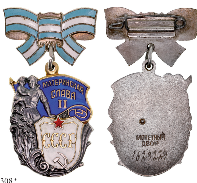
Russia, (USSR), Order of Maternal Glory 2nd Class, reverse with engraved serial number 1629229. Nearly extremely fine .