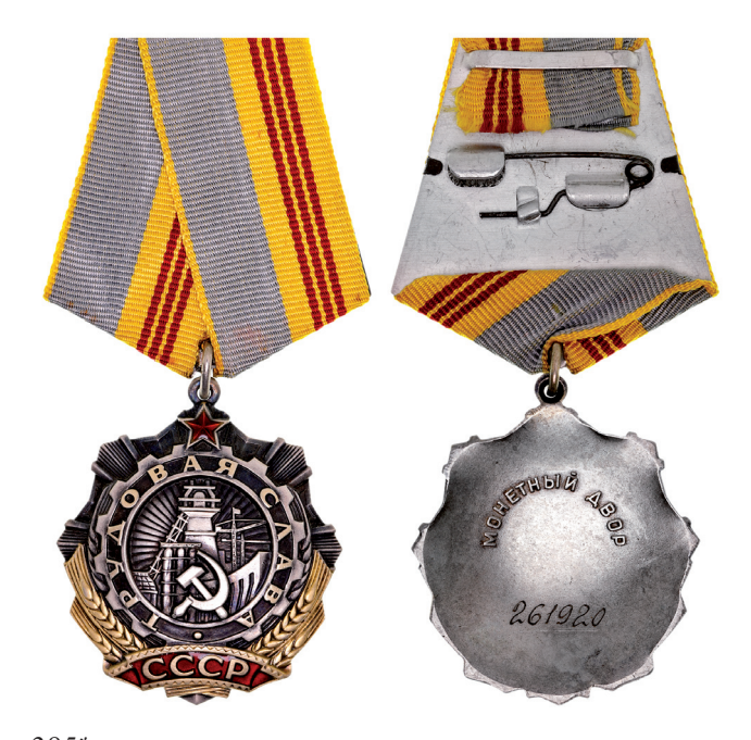
295* Russia, (USSR), Order of Labor Glory 3rd Class, one-piece construction, reverse with engraved number 261920. Extremely fine.