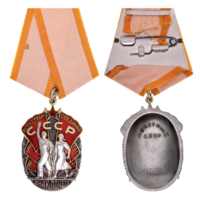
293* Russia, (USSR), Order of the Badge of Honor, Type 4 concave reverse, engraved serial number 257224. Good very fine . $110