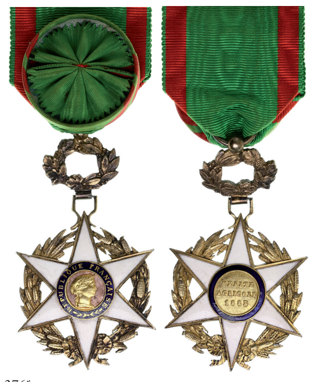
276* France, Order of Agricultural Merit, Officer. Extremely fine .