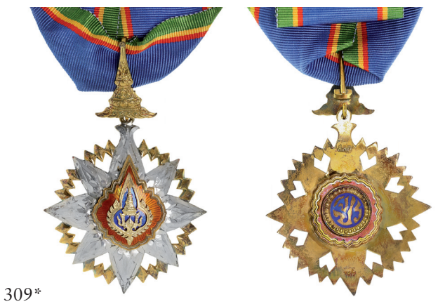
Thailand, Order of the Crown of Thailand, neck badge in silver, gilt and enamel, reverse numbered 38/2. In case of issue, nearly uncirculated.