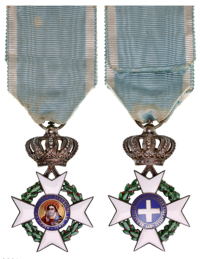
280* Greece, Order of the Redeemer, Knight's Cross. Ribbon toned, the Order extremely fine.