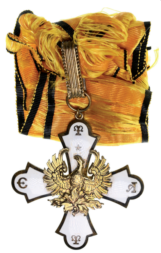
279* Greece, Order of the Phoenix, Type 1, Grand Commander's neck badge, with neck ribbon, in case by Huguenin Freres & Co. The neck ribbon deteriorated, the Order extremely fine .