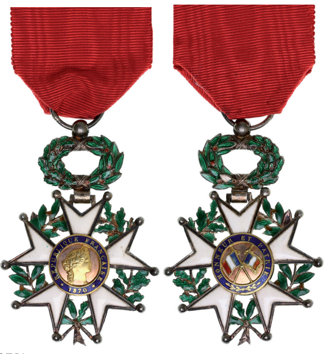
275* France, Legion of Honour 5th Class, Knight. Good very fine.