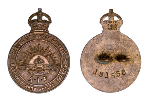
122* Returned From Active Service badge (AIF), by Stokes & Sons, Melb, reverse numbered 131556. Very fine .