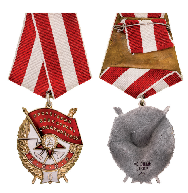
289* Russia , (USSR), Order of the Red Banner Sixth Award, Type 3 Variation 4, with engraved serial number 19. Extremely fine . $4,900