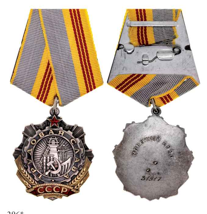
Russia, (USSR), Order of Labor Glory 3rd Class, two rivet construction, reverse with engraved number 31917. Extremely fine.