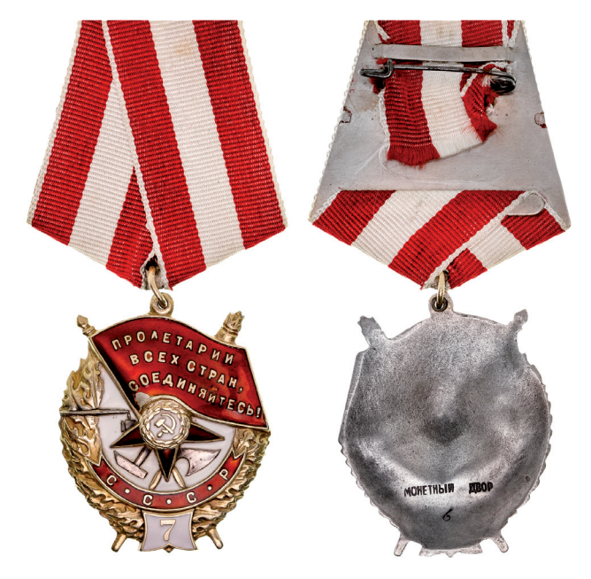
290* Russia, (USSR), Order of the Red Banner Seventh Award, Type 3 Variation 3, with engraved serial number 6. Nearly extremely fine.