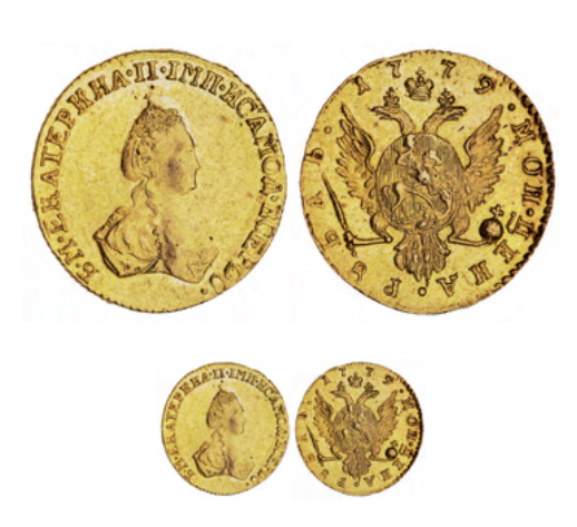
2027* Russia, Catherine II, one rouble, 1779 (KM.C.76). Nearly uncirculated. $600