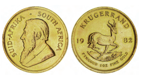
2065* South Africa, Republic, krugerrand, 1982 (KM.73). Uncirculated. $2,400