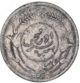
2200* China, Republic, Sinkiang, silver dollar (1917)(KM.Y45) with rosette. Adhesions, nearly extremely fine .