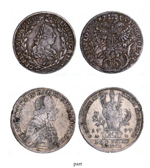
2115* Austria, Joseph I, 20 kreuzer 1769 I.C.S.K (KM.2067.1), another 1780B S.K.P.D. (KM.2067.1) Germany; Wurzburg, Franz Ludwig, 20 kreuzer 1787G MP (KM.422); also Leopold, six kreuzer, 1679 (KM.1185). Very good - very fine. (4)