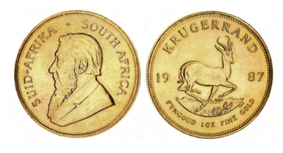
2067* South Africa, Republic, krugerrand, 1987 (KM.73). Uncirculated .