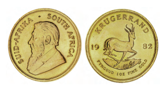
2064* South Africa, Republic, krugerrand, 1982 (KM.73). Choice uncirculated. $2,400