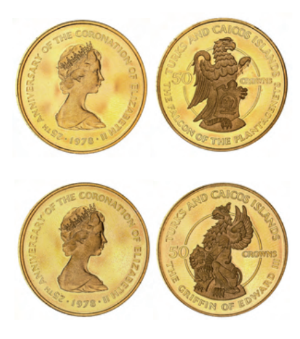
2072* Turks & Caicos Islands, Elizabeth II, proof fifty crowns, 1978, Falcon of Plantagenets (KM.42), White Lion of Mortimer (KM.43). FDC. (2) $800