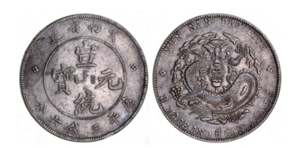
China, Empire, Yunnan Province, silver half dollar, undated (1908 [Kann]), obv. Chinese characters, rev. dragon with large English legend, (KM.Y.253). Good very fine, scarce .

In a slab by PCGS or Scratch VF details.