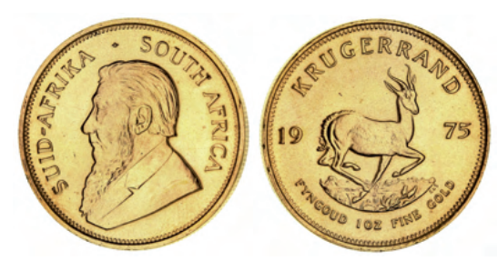
2059* South Africa, Republic, krugerrand, 1975 (KM.73). Uncirculated .