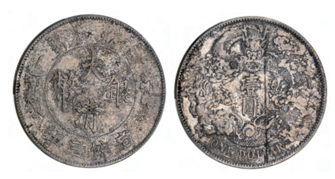
2161* China, Empire, silver dollar, (1911)(KM.Y.31; LM-37) extra flame. Small chopmark on obverse, good fine/very fine. $500

In a slab by PCGS as XF detail chopmark.