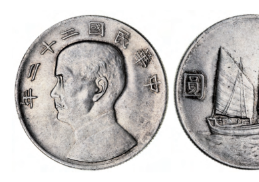
2195* China, Republic, Sun Yat Sen, 'Junk' silver dollar, Yr 22 (1933) (KM.Y345). Extremely fine.