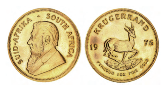
2061* South Africa, Republic, krugerrand, 1976 (KM.73). Uncirculated. $2,400