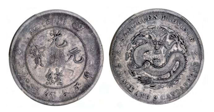
2178* China, Empire, Szechuan silver dollar (1901-8)(KM.Y238). Obverse hairline scratch, nearly very fine.