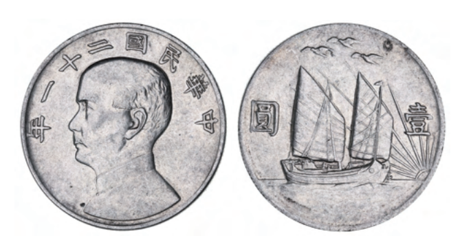
2194* China, Republic, Sun Yat Sen, silver dollar, year 21 (1932), Shanghai mint, 'Birds over junk' (KM Y.344). Some subdued original mint bloom, minimal circulation resulting in hardly noticeable contact marks on shoulder, nearly uncirculated and rare in this condition.