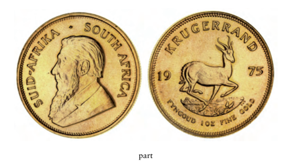
2060* South Africa, Republic, krugerrand, 1975 (KM.73). Uncirculated. (2) $4,800