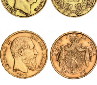
1973* Belgium, Leopold I, twenty francs, 1865 (KM.23); Leopold II, twenty francs, 1876 (KM.37). Good very fine . (2) $1,000