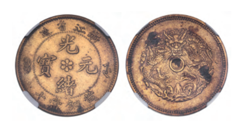
2157* China, Empire, brass ten cash (1903-6)(KM.Y.49a). Cleaned good very fine. $200

In a slab by NGC as AU cleaned environmental damage.