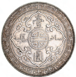
2118* British Trade Dollar, 1929 B incuse (KM.T5). Extremely fine.