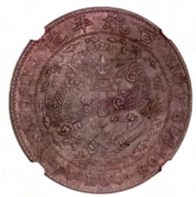
2158^{\ast} China, Empire, bronze, twenty cash (1909) (KM. ). Brown uncirculated.