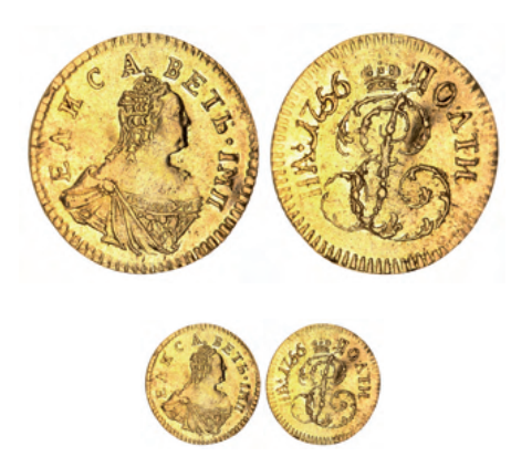
2023* Russia, Elizabeth, fifty kopek, 1756 (KM.C.21). Slight crinkling otherwise extremely fine.