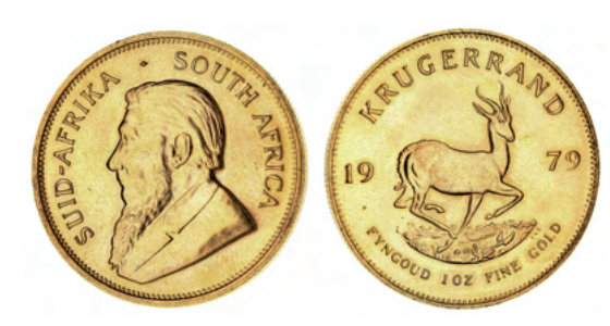
2062* South Africa, Republic, krugerrand, 1979 (KM.73). Uncirculated. $2,400