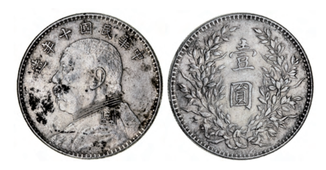
2186* China, Republic, Yuan Shi-Kai, silver dollar, yr 10 (1921) (KM.Y329.6). Very fine.