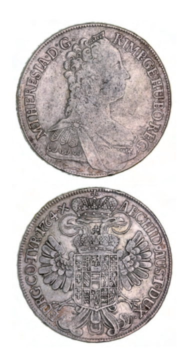
2114* Austria, Maria Theresa, silver thaler, 1764 (KM.1799). Fine/good fine. $100