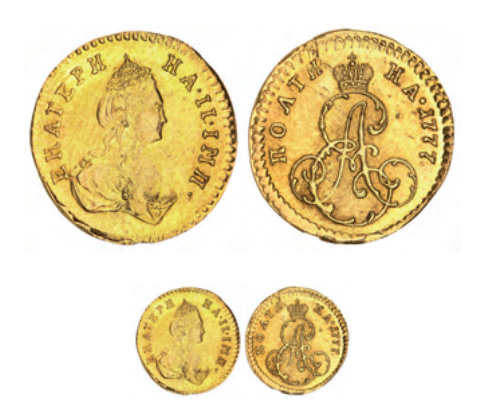
2026* Russia, Catherine II, fifty kopek, 1777 (KM.C.75). Extremely fine. $450