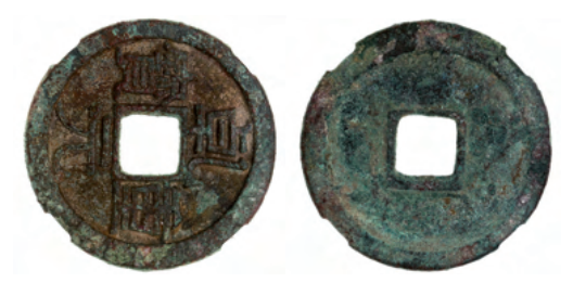
2136* China, Tang Dynasty, Su Zong, (issued 756-762), (4.0 g), round ten cash, obv, 'Qian Yuan zhong bao' with four characters, rev. blank, diameter 30 mm, (Sch.352, cf.TFP 691, Hartill 14.101). Green toning, very fine and rare.