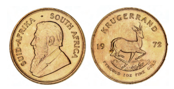
2058* South Africa, Republic, krugerrand, 1972 (KM.73). Light toning in reverse, nearly uncirculated. $2,400