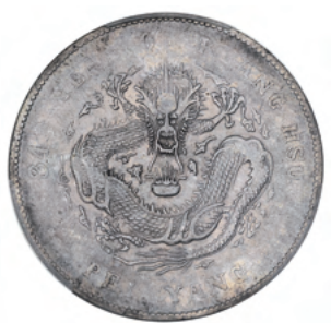
2163* China, Empire, Chihli Province silver dollar (1908)(KM. Y.73.2; LM.465). Cleaned very fine or better. $700

In a slab by PCGS as graffiti very fine detail.