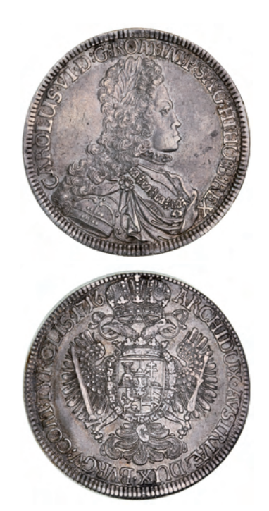
2113* Austria, Charles VI, silver thaler, 1716 (KM.1570). Nearly extremely fine . $300