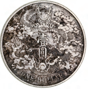
2162* China, Empire, general issue silver dollar Yr3 (1911)(KM. Y31) Republic, Yuan Shih-kai counterfeit silver dollar Yr8 (1919)(KM.Y329.6). Fine-very fine. (3) $200