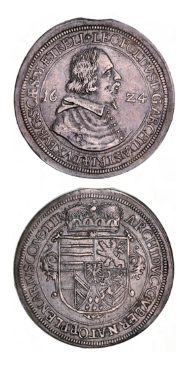
2112* Austria, Leopold, silver thaler, 1624 (KM.2645). Light grey tone, nearly extremely fine . $350