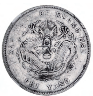
2164* China, Empire, Chihli, silver dollar, Yr 34 (KM.Y.73.2, L&M465). Very fine. $500