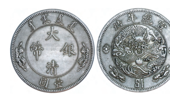
2160* China, Empire, Central Mint of Tientsin, silver dollar, undated (1910) (KM.219). Good very fine and very scarce thus.