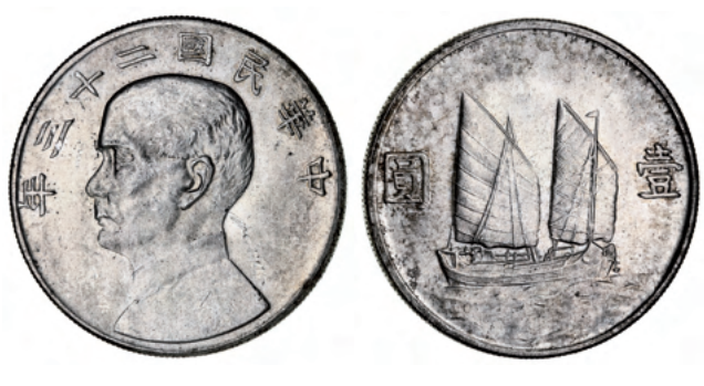
2196* China, Republic, Sun Yat Sen, 'Junk' silver dollar, yr 23 (1934) (KM.Y345). Good very fine/ extremely fine. $150

2197 China, Republic, Sun Yat Sen, 'Junk' silver dollar, yr 23 (1934) (KM.Y345). Very fine.