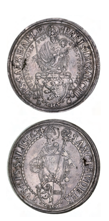
2117* Austria, Salzburg, Paris von Lodron, silver thaler 1624 (KM.87). Toned, nearly extremely fine . $250