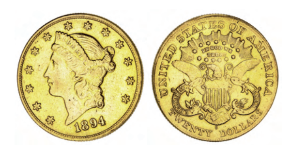
2076* USA, twenty dollars, or double eagle, 1894S, Liberty head (32.01g), possible jeweller's copy. Good very fine .