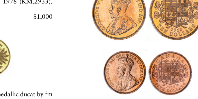
1974* Canada, George V, five and ten dollars 1912 (KM. 26, 7) Uncirculated. (2) $2,800

In PCGS slab as MS64, MS63.Ex Chris Hall Collection, from Pacific Rim