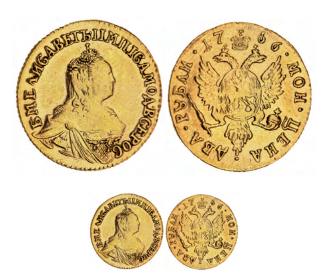
2025* Russia, Elizabeth, two roubles, 1756 (KM.C.23.1). Nearly extremely fine . $750