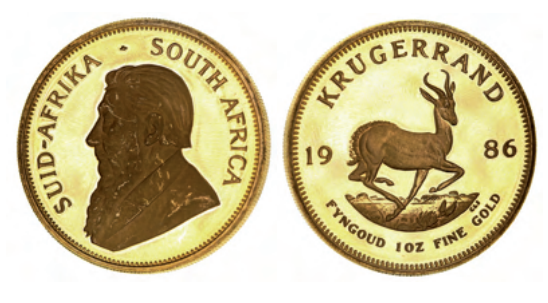
2066* South Africa, Republic, proof krugerrand, 1986 (KM.73). Nearly FDC.