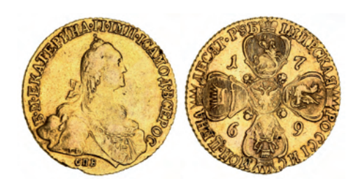
2029* Russia, Catherine II, ten roubles, 1769 (KM.C.79a). Good very fine/nearly extremely fine and rare. $4,000