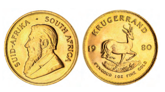
2063* South Africa, Republic, krugerrand, 1980 (KM.73). Uncirculated. $2,400