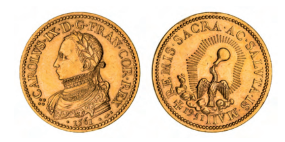
1986* France, Charles IX, gold medal, (1561, coronation commemorative) (33.82g). Good extremely fine and rare. $2,500