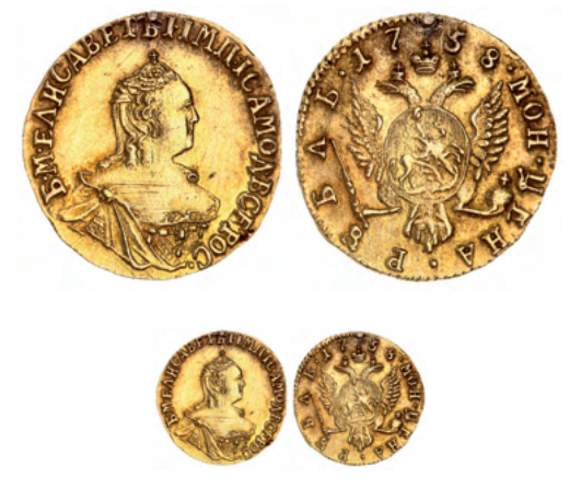
2024* Russia, Elizabeth, one rouble, 1758 (KM.C.22). Adjustment marks on obverse otherwise nearly extremely fine. $450