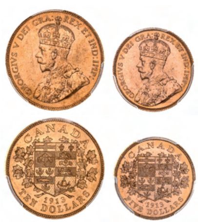
1975* Canada, George V, five and ten dollars 1913 (KM.26,7). Uncirculated. (2) $2,800