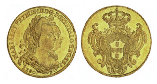
1281* Portugal, Mary and Peter III, gold four escudos (peca) or half Johanna, 1780 (KM.271). Good extremely fine . $1,500

Ex Noble Numismatics Sales 111 (lot 1084) and 127 (lot 1162).