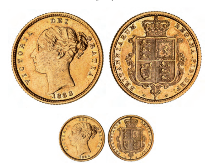
1373* Queen Victoria, 1883 Sydney (McD.25). Extremely fine/good extremely fine. $3,000

Ex David Ross Collection from KJC September 2007.