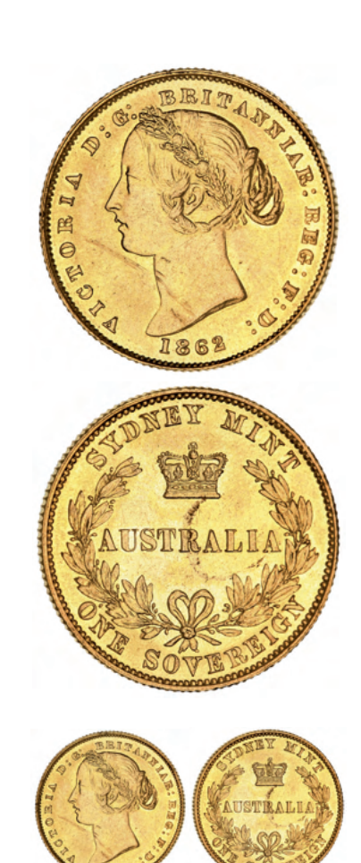
1302* Queen Victoria, second type, 1862. Single scuff below chin across neck, otherwise full original mint bloom with otherwise unmarked surfaces, choice uncirculated and very rare in this condition.