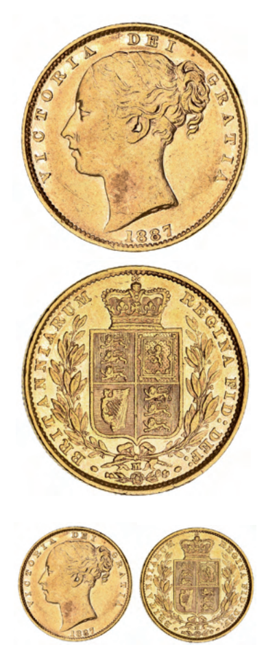
1329* Queen Victoria, 1887 Melbourne. Nearly extremely fine/ extremely fine and rare.