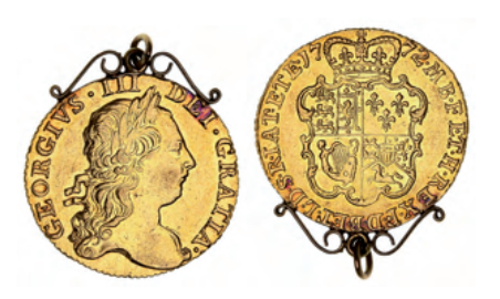
1220* George III, guinea, third laureate head right, 1772 (S.3727). Scroll mount at top, otherwise good very fine. $1,000