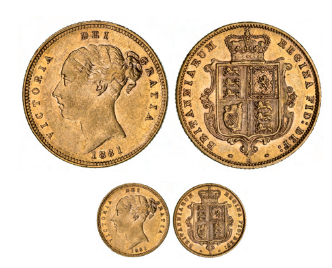
1372* Queen Victoria, 1881 Melbourne. Extremely fine/good extremely fine and rare. $3,400

Ex Noble Numismatics Sale 48 (lot 1636).