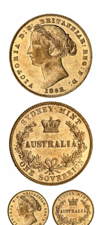
1306* Queen Victoria, second type, 1868. Considerable original mint bloom, uncirculated. $3,200