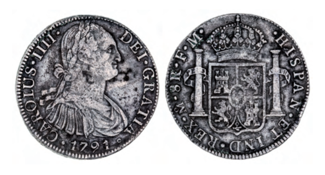
1278* Mexico, Charles IIII, silver eight reales, Mexico City mint 1791 F.M. (Km.109). Uneven dark toned good fine . $150

Ex Noble Numismatics Sale 105 (lots 3408).