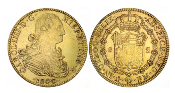
1276* Mexico , Charles IIII, gold eight escudos, 1800FM (27.02 g), (KM.159). Flat in centre, otherwise good very fine. $2,000

1275 Great Britain, George III, copper cartwheel twopence, 1797 (S.3776). Very good . $50