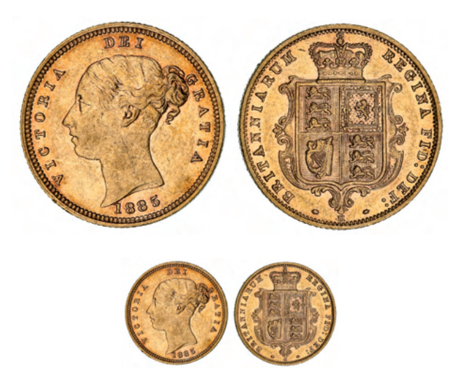
1376* Queen Victoria, 1885 Melbourne. Nearly extremely fine and rare. $2,200

Ex David Ross Collection from KJC Dec 2005.