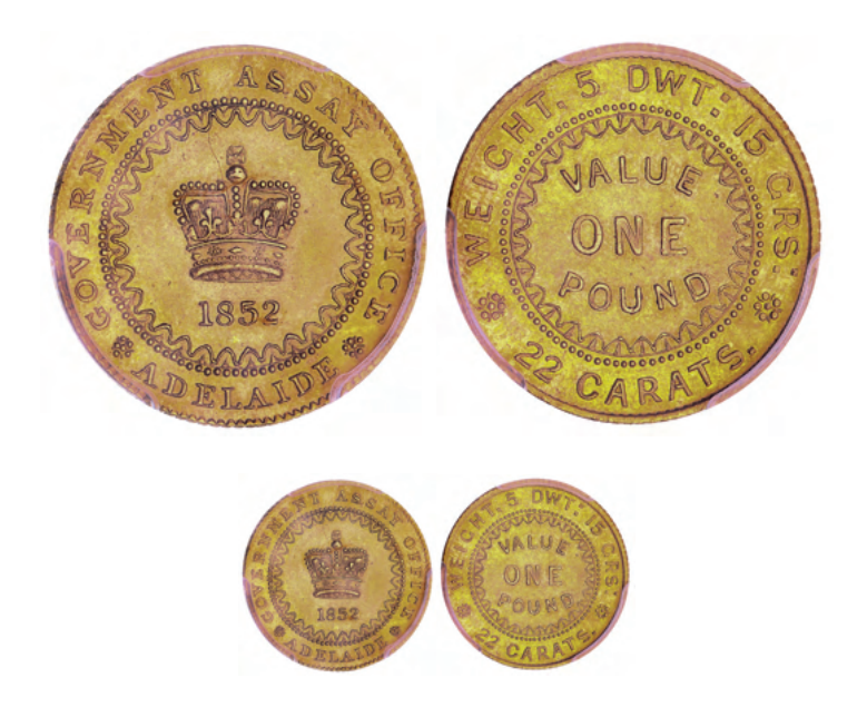
High Grade Adelaide Pound 1852

Private purchase from Spink Australia in March 1981 ($45,000).