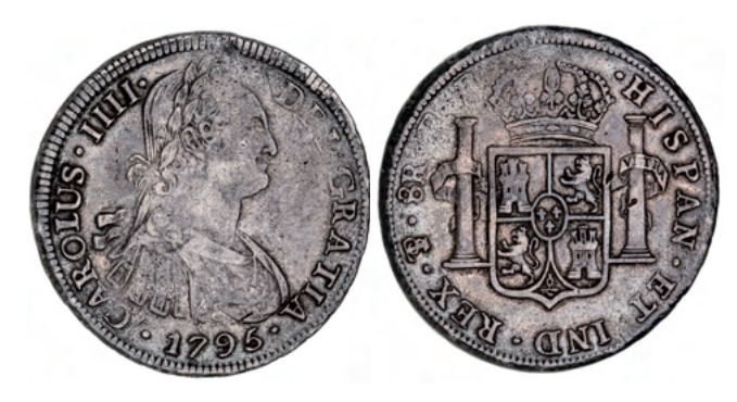
1269* Bolivia, Charles IIII, silver eight reales, Potosi Mint, 1795 P.P. (KM.73). Good very fine .