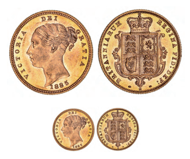
1375* Queen Victoria, 1885 Melbourne. Minor obverse hairlines, otherwise choice uncirculated and very rare in this condition, one of the finest known.

$8,\!000 Ex Spink Australia Sale 26 (lot 853) and Noble Numismatics Sale 48 (lot