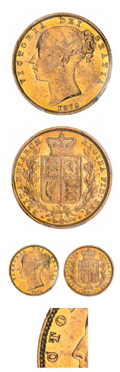
1323* Queen Victoria, 1879 Sydney, C over O in Victoria (McD.126a). Nearly extremely fine/good extremely fine, with considerable mint bloom, a very clear re-entry with diagnostic die break from the rim to the C, extremely rare and one of the finest known.