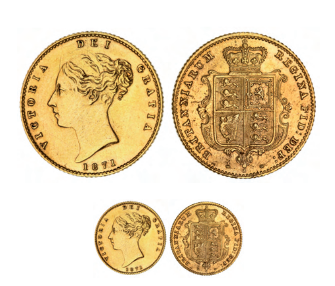
1368* Queen Victoria, 1871 Sydney. Obverse rubbed, otherwise good extremely fine. $800