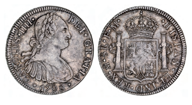
1279* Mexico, Charles IIII, silver eight reales, Mexico City mint 1798 F.M. (KM.109). Good very fine/very fine, flat in centre. $250