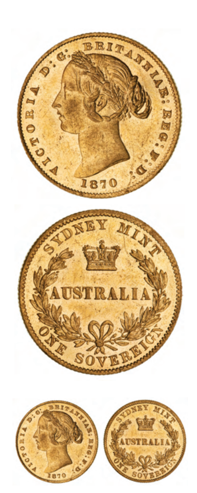
1309* Queen Victoria, second type, 1870. Full mirror-like mint bloom, choice uncirculated. $3,200