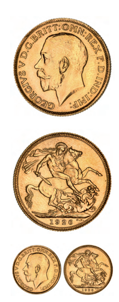
1361* George V, 1926 Sydney. Well struck and unmarked, specimen-like, choice uncirculated and extremely rare. $27,000

Private purchase from Spink Australia in 1981.