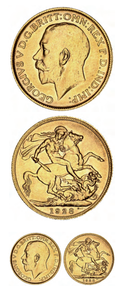
1365* George V, 1928 Melbourne. Extremely fine or better and rare. $2,800

Ex Chris Hall Collection, from Noble Numismatics Sale 90.