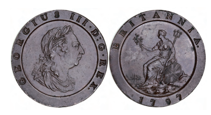
1273* Great Britain, George III, copper cartwheel twopence, 1797 (S.3776). Even chocolate brown tone, good extremely fine. $400