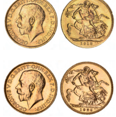
1261* George V, sovereign, 1913 and 1925 (S.3996). Good extremely fine; nearly uncirculated. (2) $1,200