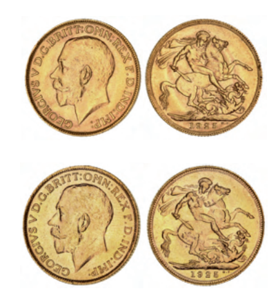
1359* George V, 1925 Melbourne and Sydney. Nearly uncirculated . (2)