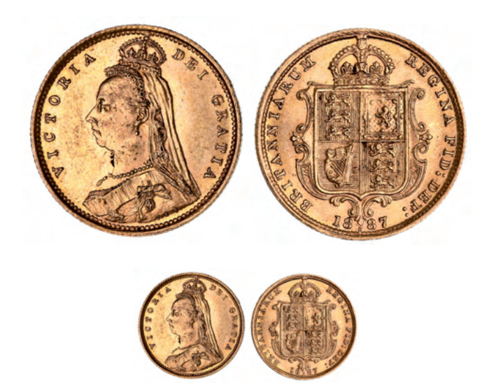
1377* Queen Victoria, Jubilee head, 1887 Sydney (McD.32b). Good extremely fine. $800