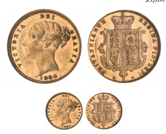
1374* Queen Victoria, 1884 Melbourne. Nearly uncirculated and rare thus. $4,000

Ex Reserve Bank of Australia Sale (lot 702). In a slab by NGC as AU53.