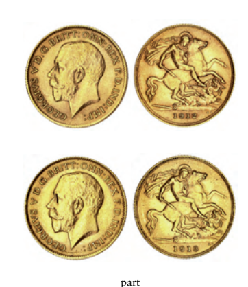
1263* George V, half sovereigns 1912, 1913 (2)(S.4006). Nearly extremely fine - extremely fine. (3) $1,050