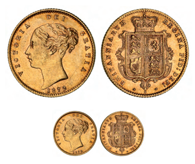
1369* Queen Victoria, 1872 Sydney. Good extremely fine. $1,100

Ex David Ross Collection, private purchase from KJC Sept 2004.