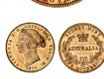
1310* Queen Victoria, second type, 1870. Considerable mirror-like mint bloom, well struck uncirculated and rare thus. $3,200