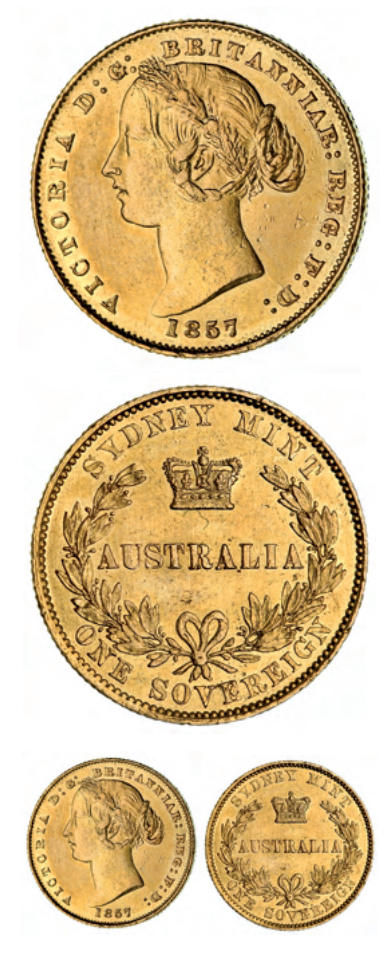
1297* Queen Victoria, second type, 1857, with wreathed head left by L.C.Wyon. Cleaned, good extremely fine and rare thus. $3,200