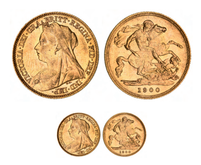
1378* Queen Victoria, 1900 Melbourne. Nearly uncirculated and rare thus. $2,000

Ex Reserve Bank of Australia Sale, lot 849.