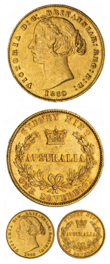
1300* Queen Victoria, second type, 1860. Good extremely fine or nearly uncirculated and very rare in this condition.