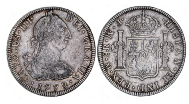
1277* Mexico, Charles III, silver eight reales, 1772 F.M.(inverted) (KM.106.1). Toned nearly very fine.