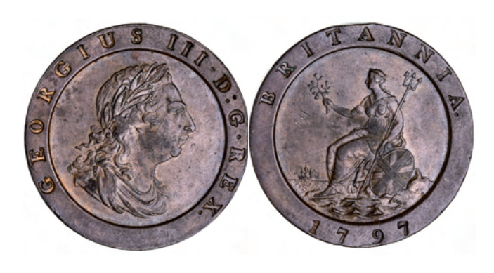
1274* Great Britain, George III, copper cartwheel twopence, 1797 (S.3776). Old scratch in reverse field, edge bump at 5. 30 on the reverse, traces of original red in a few letters, brown patina, good extremely fine. $400

Ex Downies Sale 334 (lot 1873) with their ticket.