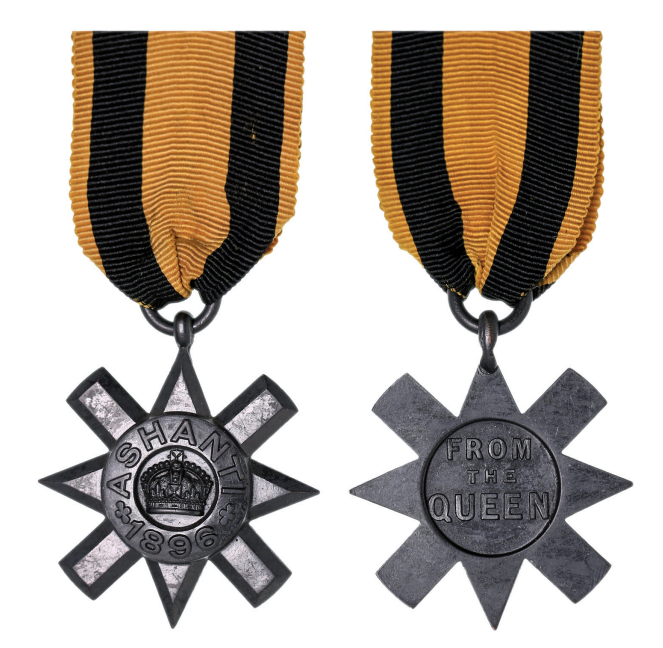
4269* Ashanti Star 1896. Unnamed. Extremely fine.