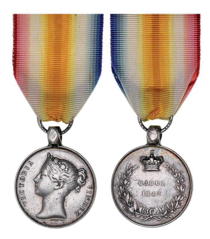
4242* Cabul Medal 1842. Unnamed. Fine .