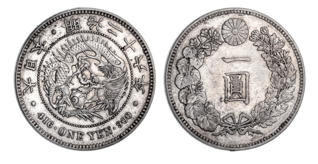
Japan, Meiji silver yen, yr 26 (1893) (KM.Y.A25.3). Extremely fine. $100