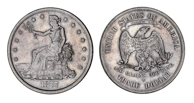
3383* USA, trade dollar, 1877S. Toned , good fine.