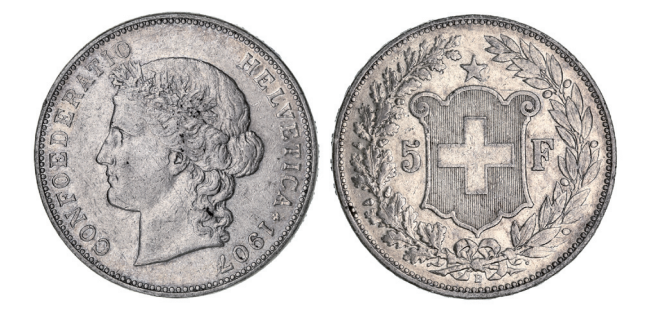
Switzerland, silver five francs 1907B, (KM.34). Very fine or better, scarce. $150