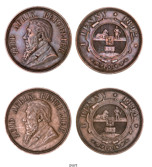
3334* South Africa, ZAR, Paul Kruger, bronze pennies, 1892 (2) and 1894 (2) (KM.2). Very fine - good very fine. (4) $100

Russia, USSR, .900 fine silver proof three roubles, 1990 (KM.247), World Summit for Children commemorative; base metal commemorative medals (3), all relating to WWII events. Uncirculated - FDC. (4)