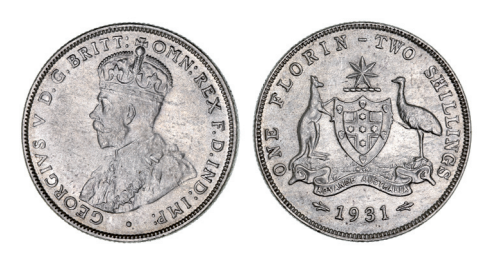
2739* George V, 1931. Subdued mint bloom, nearly uncirculated. $150