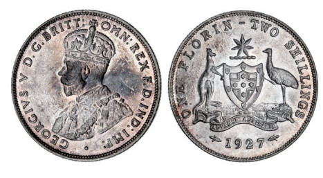
2734* George V, 1927. Nearly uncirculated.