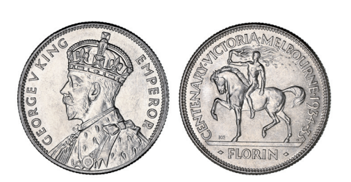
2741* George V, 1934-35 Melbourne Centenary. Good extremely fine.