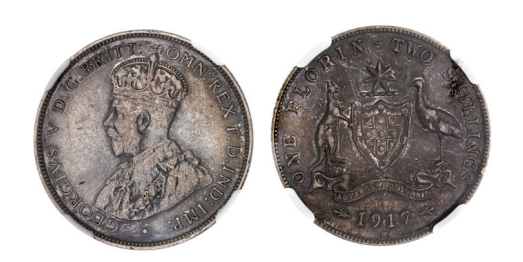
2731* George V, 1917M. Toned, good very fine. $150