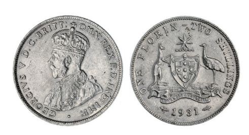
2738* George V, 1931. Subdued mint bloom, nearly uncirculated.