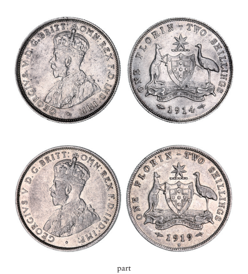
2725* George V, 1913, 1914, 1919M and 1927 Canberra. Fine - good very fine. (4) $240