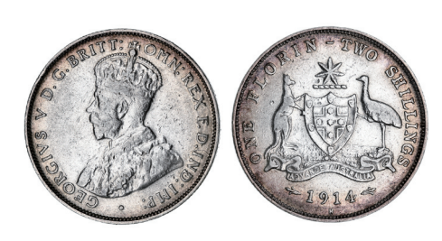
2726* George V, 1914H. Nearly very fine.