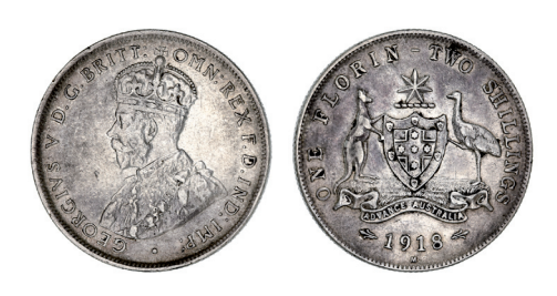
2732* George V, 1918M. Uneven tone, very fine.

In a slab by NGC as AU details, obverse cleaned.