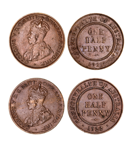
2870* George V, 1921 (thin 2 and 1), 1922, 1924 and 1925. Very fine - good very fine. (4)