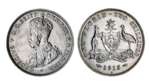
2728* George V, 1915H. Nearly extremely fine.