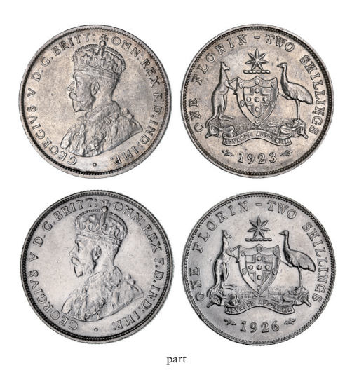
2733* George V, 1921, 1922, 1923, 1924, 1925, 1926, 1927 and 1928. Nearly very fine and extremely fine. (8)