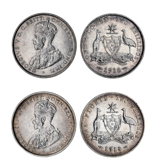
2729* George V, 1916M and 1918M. Nearly extremely fine; good very fine. (2) $200