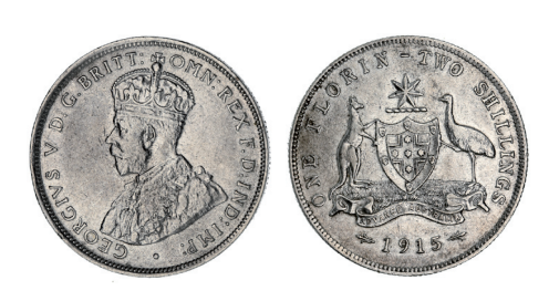
2727^{\ast} George V, 1915. Good very fine.