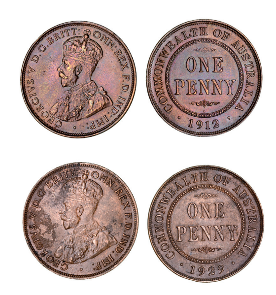
2802* George V, 1912H and 1929 Indian die. Good extremely fine; some porosity on obverse, otherwise good extremely fine. (2)