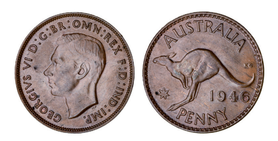
1834* George VI, 1946. Brown, good extremely fine.