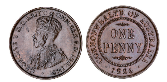
1823* George V, 1926 London die. Glossy brown, nearly uncirculated. $350