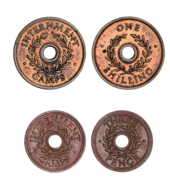
1711* Commonwealth of Australia, World War II, Internment Camps, shilling and threepence (re-entered camps die). Cleaned good very fine; toned extremely fine. (2)