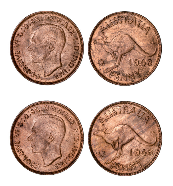
1839* George VI, 1948Y. Dull full mint red, uncirculated and scarce thus. (2)