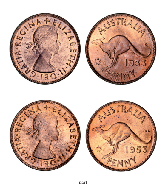
I 1953 Full original mint red choice u

Elizabeth II, 1953. Full original mint red, choice uncirculated. (5) $200