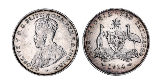
1757* George V, 1914H. Good very fine .