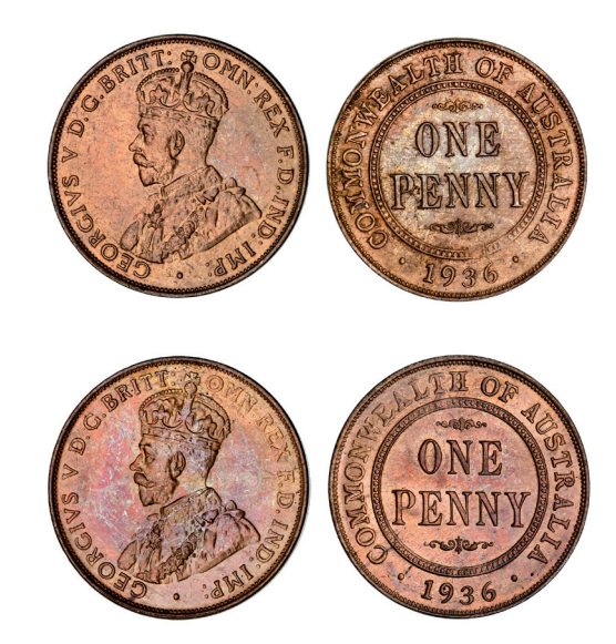
1831* George V, 1936. Nearly full mint red, some light spotting on the reverse, uncirculated. (2) $300