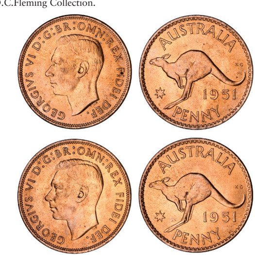
1844* George VI, 1951PL. Full original blazing mint red, choice uncirculated. (6) $300