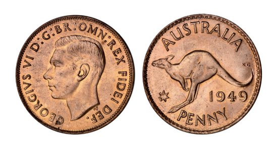
1840* George VI, 1949. Full mint red uncirculated; full blazing mint red choice uncirculated. (2) $200