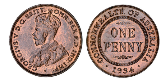
1829* George V, 1934 London die. Red and brown, uncirculated. $250