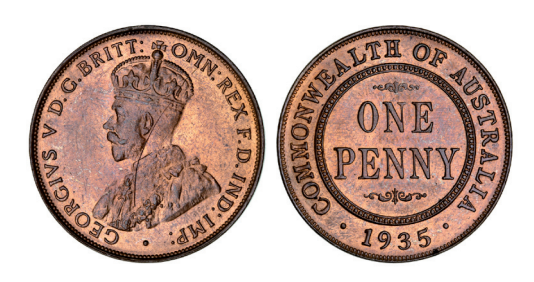
1830* George V, 1935 London die. Nearly full mint red, uncirculated. $300