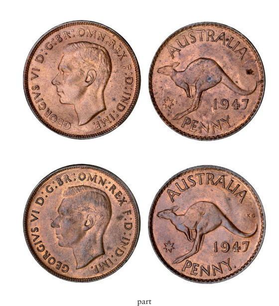
1837* George VI, 1947Y. Red and brown, nearly uncirculated. (3) $600