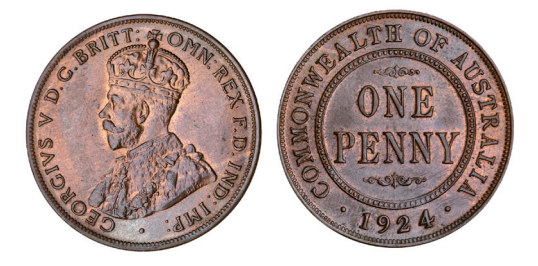
1821* George V, 1924 London die. Brown and red, uncirculated.