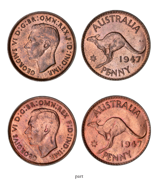
1836* George VI, 1947. Nearly full mint red, uncirculated. (3) $150