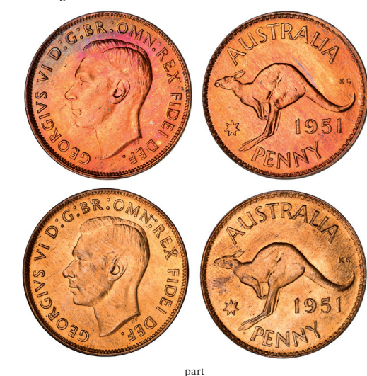
1843* George VI, 1951. Full original blazing mint red, choice uncirculated. (5) $200