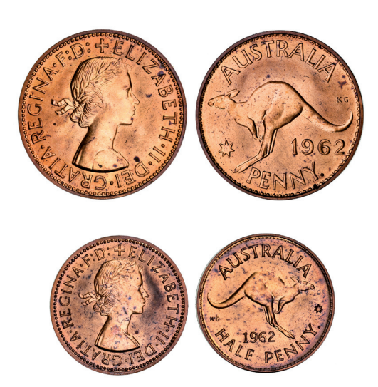
1748* Elizabeth II, Perth Mint proof set, 1962. Spotting, otherwise nearly FDC. (2) $300