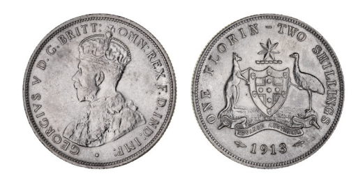
1754^{\ast} George V, 1913. Good extremely fine and rare thus. $1,000