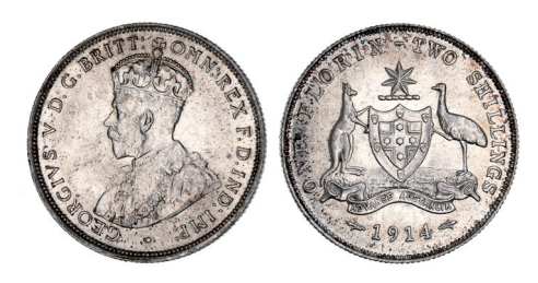
1756* George V, 1914. Underlying golden toned highlights, considerable original mint bloom, uncirculated. $750