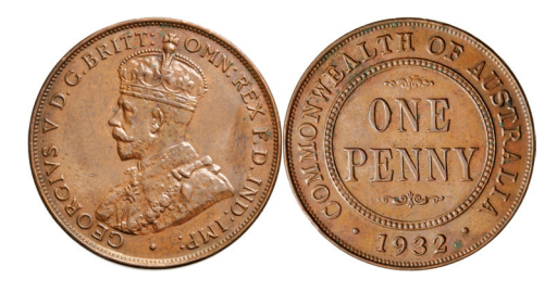
1828* George V, 1932. Glossy blue brown with hints of red, nearly uncirculated.