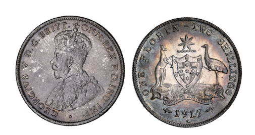
1760* George V, 1917M. Blue and iridescent toned, nearly uncirculated. $300