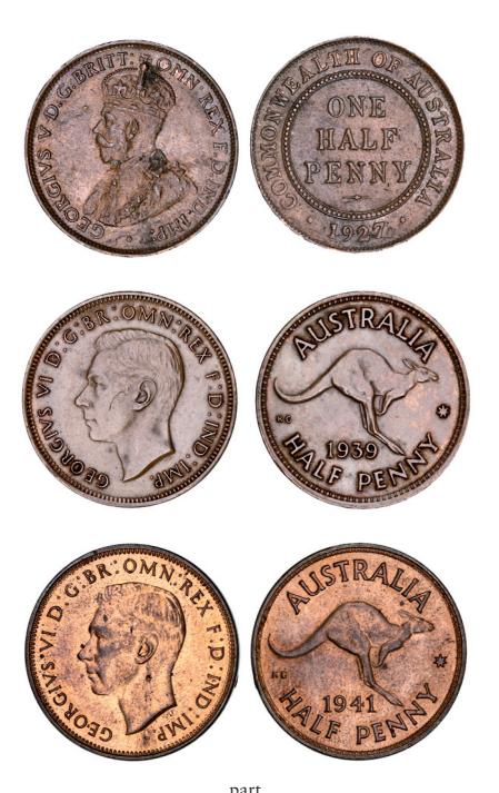
1850* George V - George VI, 1915H, 1918I (3), 1927, 1938 (2), 1939, 1939 roo (4), 1941 (2). Fine - uncirculated. (14) $200