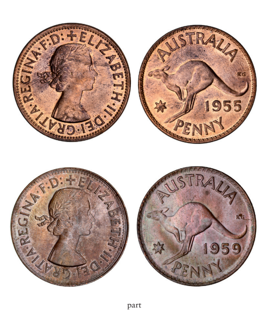
1846* Elizabeth II, 1955 (4), 1956Y. (5), 1957Y. (2), 1958 (3), 1958Y. (5), 1959, 1959Y. Some toning, mostly red uncirculated. (21)