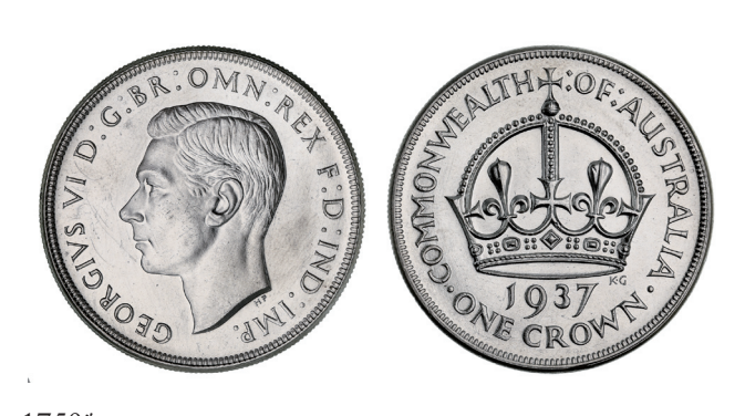
1750* George VI, 1937. Obverse hairlines, has been dipped, full cartwheeling mint bloom, uncirculated/choice uncirculated.