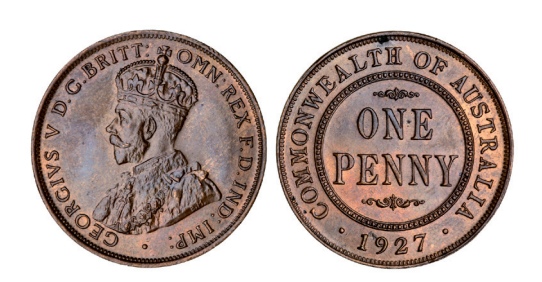
1824* George V, 1927 London die. Brown and red uncirculated. $200