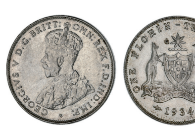
George V, 1934. Good extremely fine/nearly uncirculated. $200