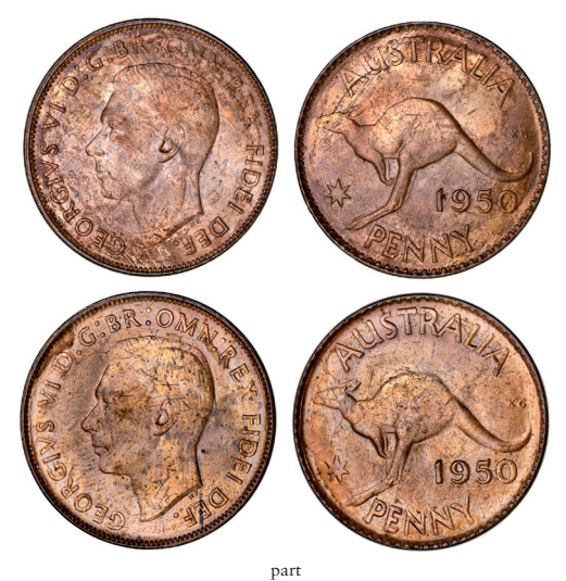
1842* George VI, 1950Y. Full original mint bloom, red to brown patinas, uncirculated. (5) $150