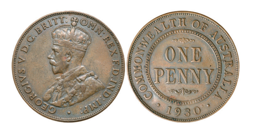
1826* George V, 1930, Indian die. Six pearls, nearly full centre diamond, light obverse scratches, otherwise very fine/good very fine and rare especially in this condition.