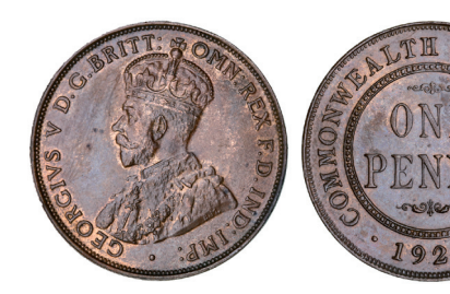
1820* George V, 1923 London die. Brown and red, uncirculated.