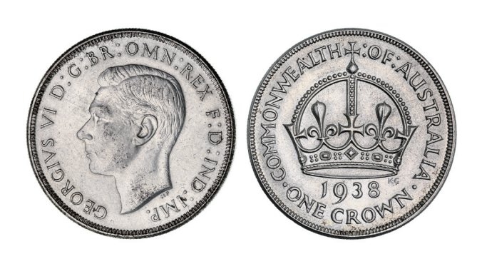
1751* George VI, 1937 and 1938. Good extremely fine . (2) $200

1752 George VI, 1938. Good extremely fine. $200