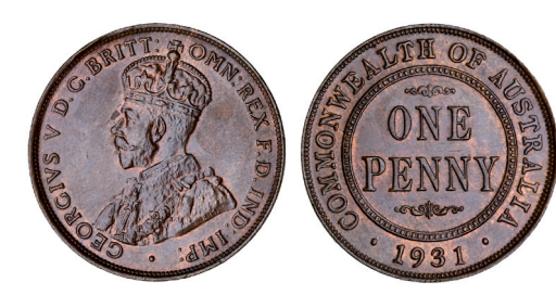
1827* George V, 1931, dropped 1, London die. Glossy brown with traces of red, nearly uncirculated and rare thus .