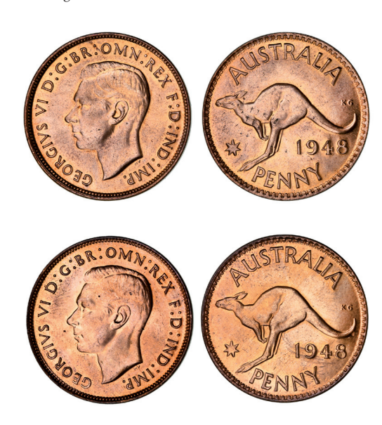
1838* George VI, 1948. Full original mint red, choice uncirculated. (3) $150