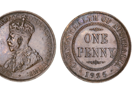
1822* George V, 1925 London die. Partly glossy brown, good extremely fine and rare in this condition. $1,500