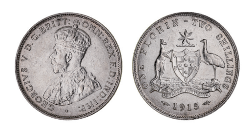
1759* George V, 1915H. Well struck up for this, good extremely fine.