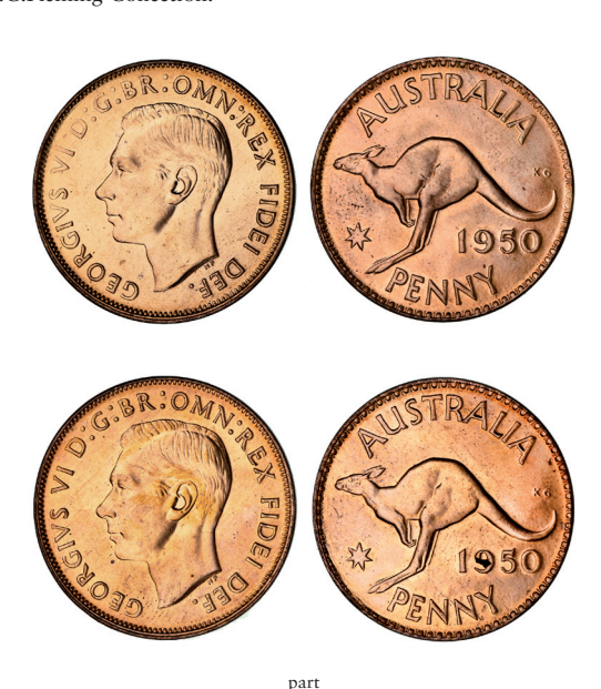
1841* George VI, 1950. Full blazing mint red, choice uncirculated. (4)