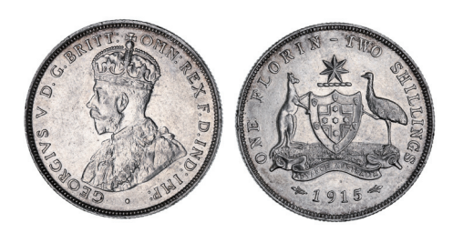
1758* George V, 1915. Light grey toning, good extremely fine or nearly uncirculated and rare in this condition. $1,500