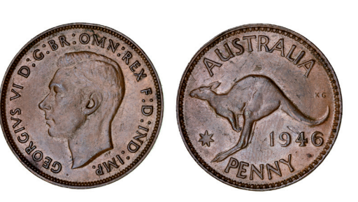
1833* George VI, 1946. Metal flaw above 4, minor contact marks, otherwise glossy extremely fine, scarce thus. $300