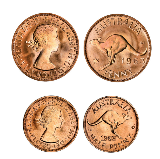
1749* Elizabeth II, Perth Mint proof set, 1963. Nearly FDC. (2) $750