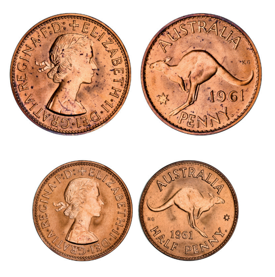
1746* Elizabeth II, Perth Mint proof set, 1961. Slight spotting, otherwise nearly FDC. (2)