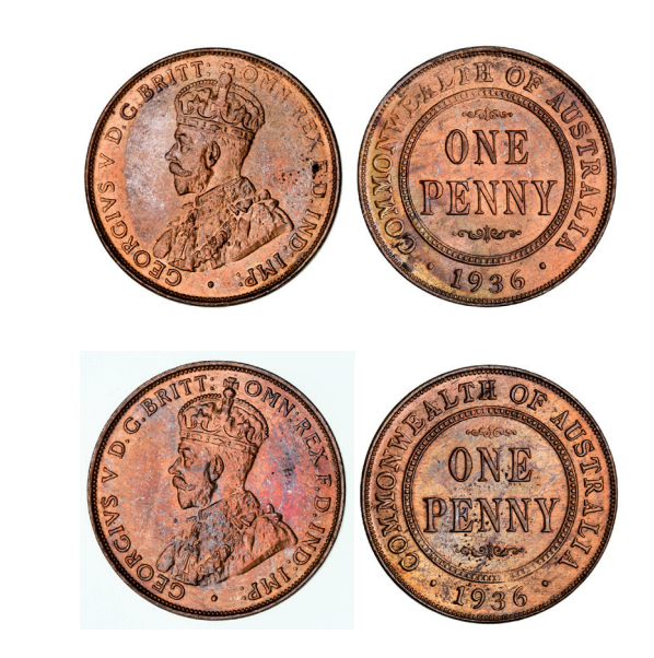
1832* George V, 1936. Mint red, uncirculated. (2)