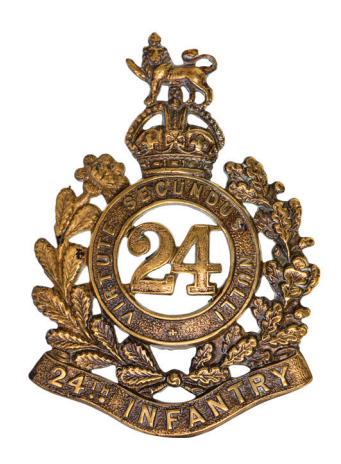
2673* 24th Infantry (East Sydney Regiment), NSW, 1912-18, hat badge in brass (52mm) (Cossum 124), by J R Gaunt, London. Very fine .