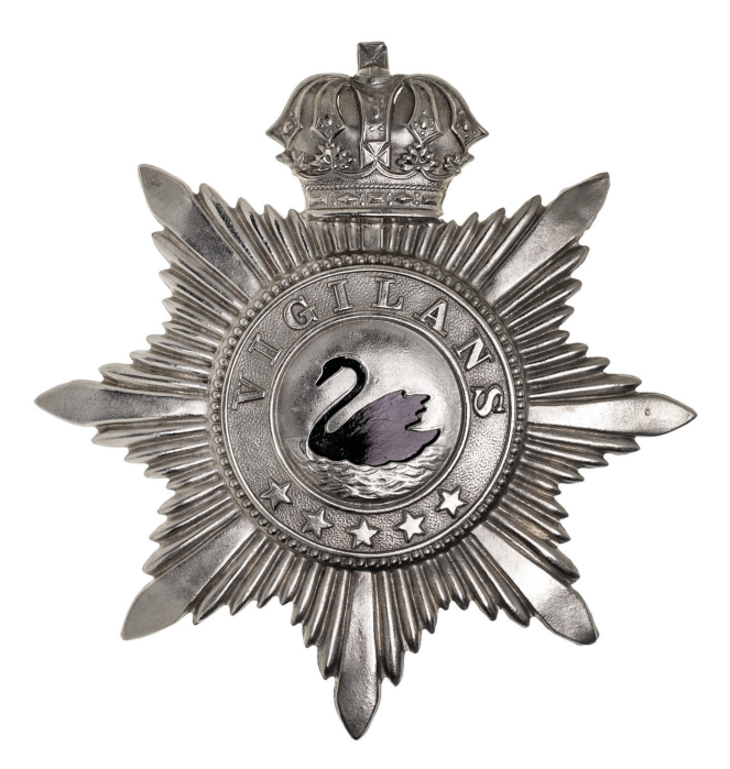
2644* Western Australian Military Forces, 1895, in white metal and enamel (114mm) (Grebert p269). Good very fine . $1,200

This badge also worn by Bunbury Rifle Volunteers (formed 1892) and Guildford Rifle Volunteers (formed 1874).