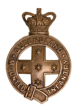
2635* Queensland Mounted Infantry, post 1860, type 2 hat badge in brass (55.5mm) (Grebert p214). Toned good very fine . $250