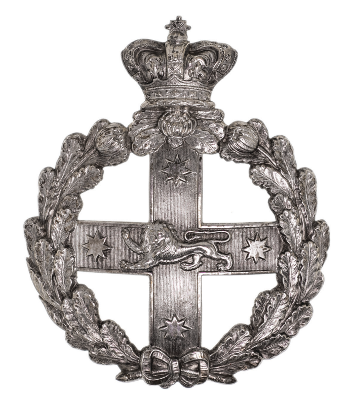
2626* NSW Military Forces, c1885, helmet plate in white metal (103mm) (Grebert p78). Toned extremely fine .