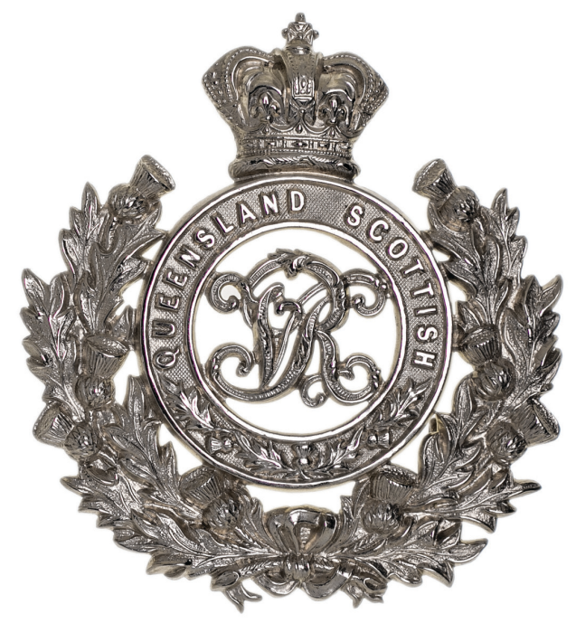
2636* Queensland Scottish Regiment, 1885-96, helmet plate in white metal (91mm) (Grebert p215). Uncirculated . $500