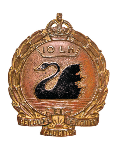
2697* 10th Light Horse Regiment (Western Australian Mounted Infantry), 1930-42, hat badge in gilt brass and enamel (52mm) (Cossum p8, a), by S.S&Co.Ltd, Adelaide. Most gilt missing on front, otherwise good fine.