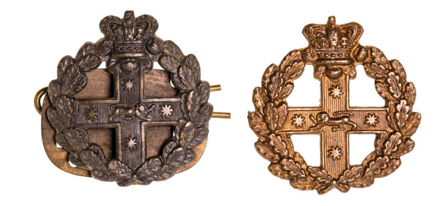
2627* Australia, pre-Federation, New South Wales Mounted Infantry, hat badge (QVC), in brass (32mm) (one lug repaired), and another identical in oxidised brass (32mm), with backing plate. Very fine. (2)