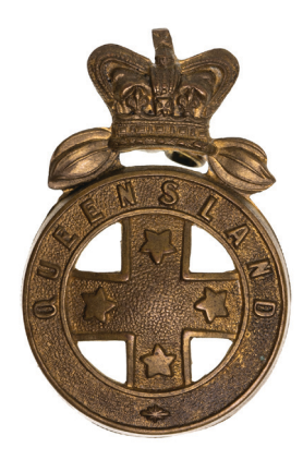
2633* Queensland Mounted Infantry, c1860-90, type 1 hat badge in brass (53mm) (Grebert p212). Good very fine .