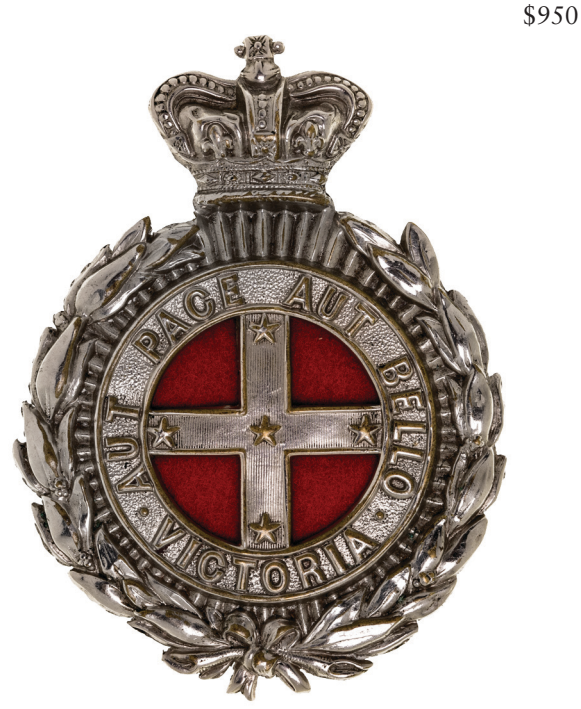
2629* Victorian Volunteer Rifles, 1875, shako plate (single wreath) in white metal (85mm) (Grebert p183), with red velvet backing cloth fitted. Very fine .