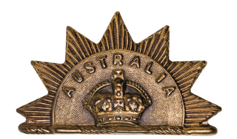
2647* Australian Commonwealth Horse, 1900-12, first pattern hat badge in brass (32mm) (Cossum 1). Very fine . $1,200