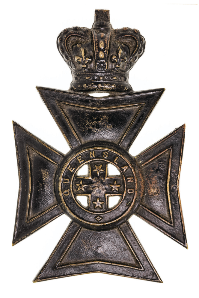
2641* Queensland Military Forces, pre-Federation, horse pack plate or martingale cast in darkened brass (115mm) (not recorded in Grebert but on Digger History website). Good fine .