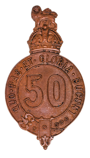
2675* 50th (St. Kilda) Infantry, Victoria, 1912-18, hat badge in copper (61mm) (Cossum 131), by P.J.King, Melb(ourne). Good very fine .

2677* Naval Bridging Train, 1912-18, hat badge in oxidised bronze (52mm) (Cossum 161), with maker's name but difficult to read. Nearly extremely fine and very scarce. $500