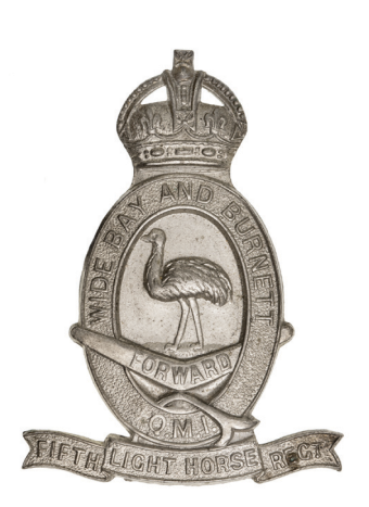
2691* 5th Light Horse Regiment (Wide Bay and Burnett Light Horse), 1930-42, hat badge in white metal (52mm) (Cossum p6, d). Good very fine. $250