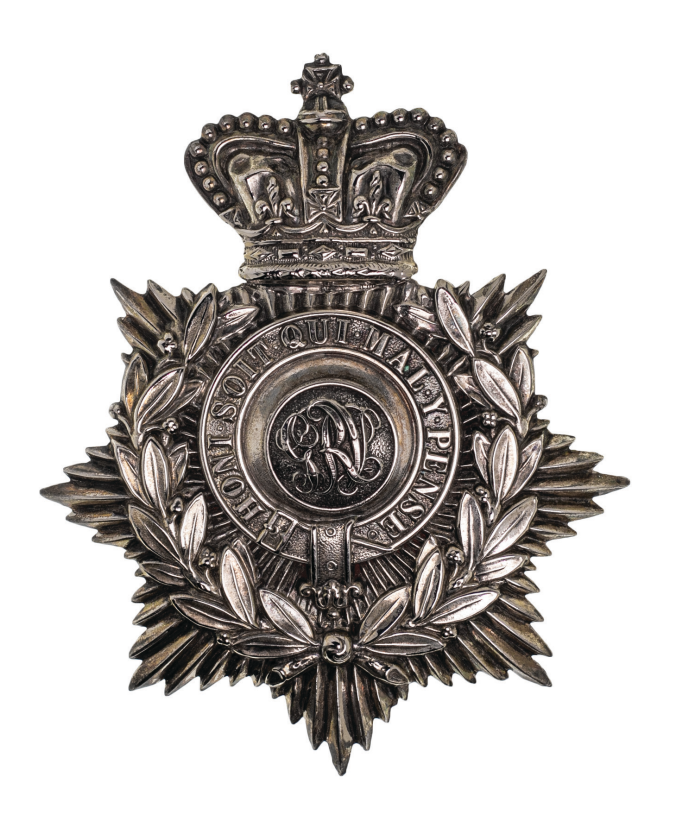
2643* Geraldton Rifle Volunteers, formed 1878, helmet plate in white metal (132mm) (Grebert p267). Good very fine . $1,200

This badge also worn by Bunbury Rifle Volunteers (formed 1892) and Guildford Rifle Volunteers (formed 1874).