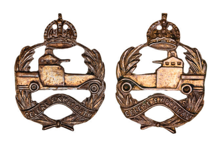
2711* 1st Armoured Car Regiment, 1930-42, first pattern pair of opposing collar badges in brass (30mm) (Cossum p12, b). Very fine. $300