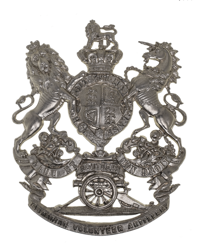
2646* Southern Tasmanian Volunteer Artillery, c1880-90s, helmet plate in white metal (101mm) (Grebert p301). Uncirculated .