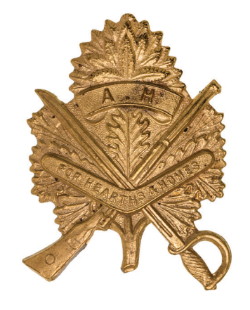
2693* 7th Light Horse Regiment (Australian Horse), 1930-42, hat badge in brass (50mm) (Cossum p7, b). Extremely fine. $300