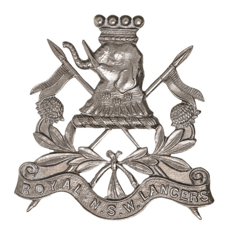
2688* 1st Light Horse Regiment (Royal NSW Lancers), 1930-42, hat badge in white metal (52mm) (Cossum p5, c). Good extremely fine.