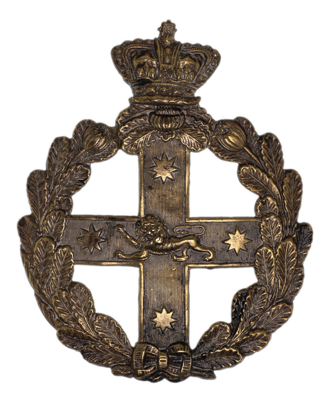
2625* NSW Military Forces, c1885, helmet plate in brass (103mm) (Grebert p78). Cleaned, nearly very fine. $250