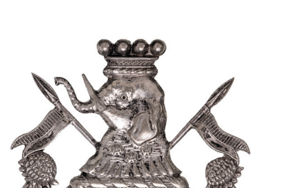
2687* 1/21st Light Horse Regiment (New South Wales Lancers), 1930-42, hat badge in white metal (51mm) (Cossum p5, b). Good very fine. $450