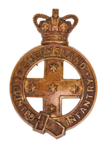
2634* Queensland Mounted Infantry, post 1860, type 2 hat badge in brass (55.5mm) (Grebert p214). Very fine .