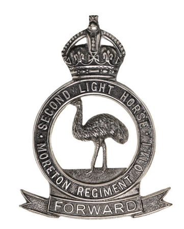
2689* 2nd Light Horse Regiment (Moreton Light Horse), 193042, hat badge in white metal (52mm) (Cossum p5, d). Very fine. $250