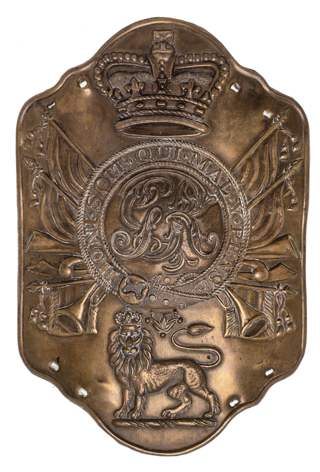
2613* New South Wales, British Universal Pattern Shako Plate in brass (153mm) as worn by Loyal Associate Corps, 1800-01, and Loyal Associations, 1802-10, also worn by NSW Corps (Grebert p3). Two holes at each corner for wearing, otherwise very fine.