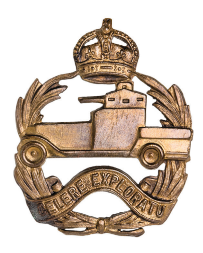
2712* 1st Armoured Car Regiment, 1930-42, second pattern hat badge in brass (56mm) (Cossum p12, c). Good very fine and rare.