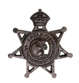
2674* 48th (Kooyong) Infantry, Victoria, 1912-18, collar badge in bronze (29mm) (Cossum 129). Extremely fine . $200