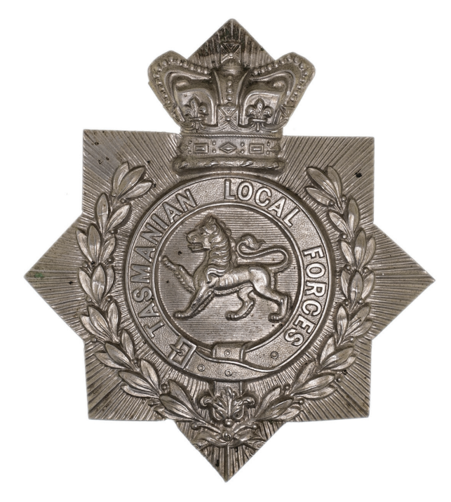
2645* Tasmanian Local Forces , c1880s, helmet plate in white metal (99mm) (Grebert p292). Extremely fine . $600