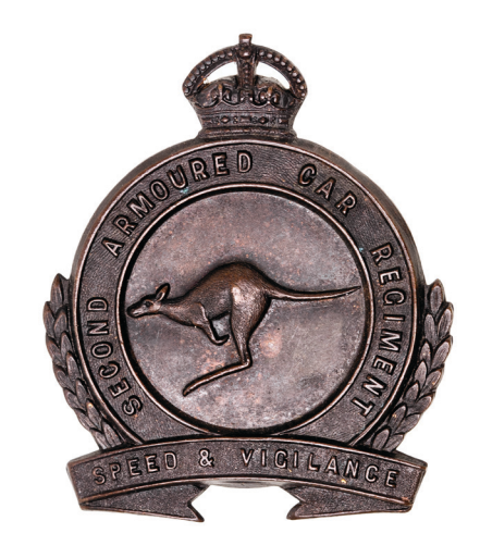
2713* 2nd Armoured Car Regiment, 1930-42, hat badge in oxidised bronze (58mm) (Cossum p12, d), maker's name unclear, appears to be K.G.Luke, Melb(ourne). Nearly extremely fine. $600