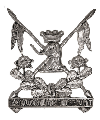
2686* 1/21st Light Horse Regiment (New South Wales Lancers), 1930-42, hat badge in white metal (56mm) (Cossum p5, a). Good very fine.