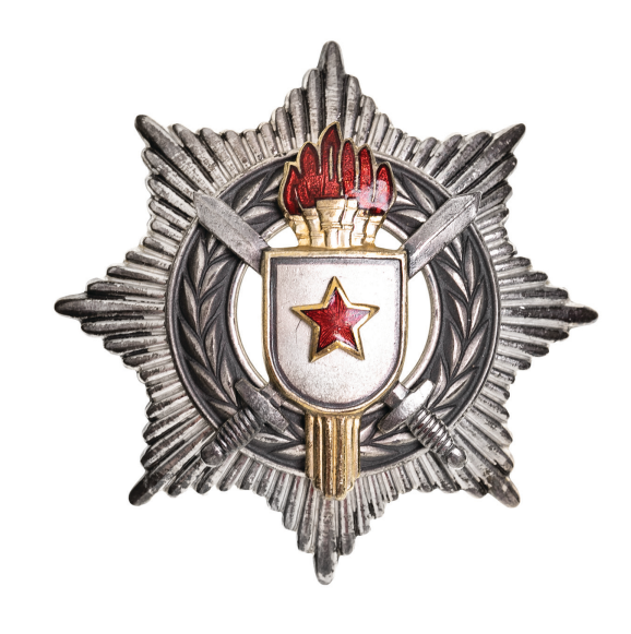
2612* Yugoslavia, Order of Military Merit with Swords 3rd Class, in case with pin-back riband. Good very fine .

Awarded to the next of kin of military personnel who died in the line of duty.