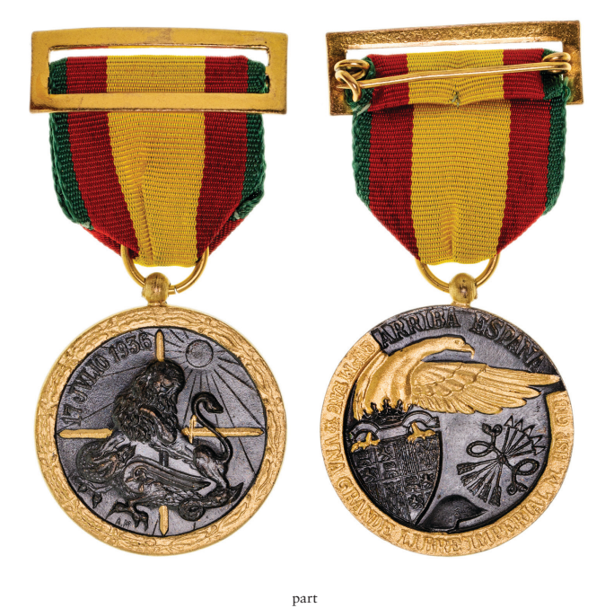
2602* Spain, Civil War Campaign Medal 1936, with pin-back suspender bar. Uncirculated . (2)