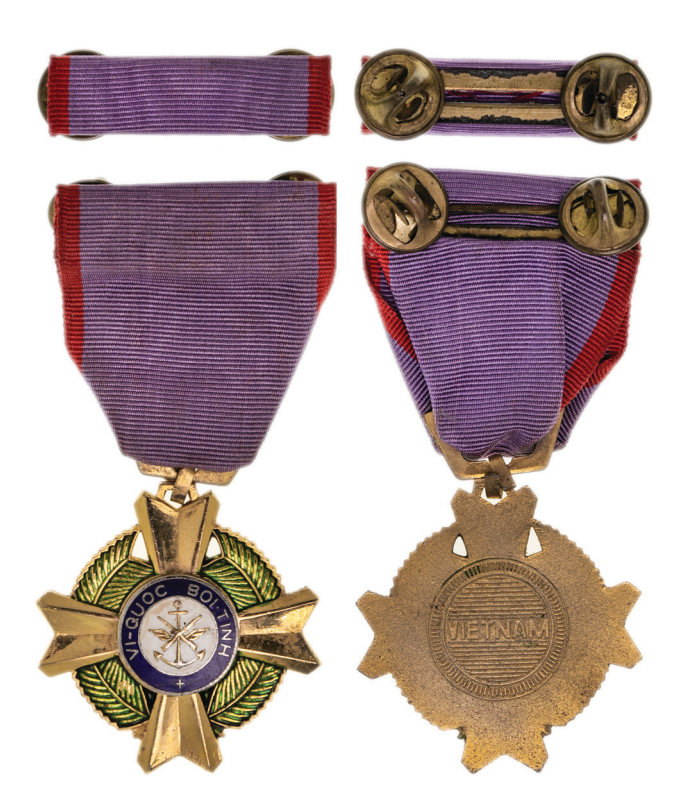
2611* Republic of Vietnam, Medal of Sacrifice (Vi-Quoc Boi-Tinh), also riband bar. Unnamed. Uncirculated . (2)

Awarded to the next of kin of military personnel who died in the line of duty.