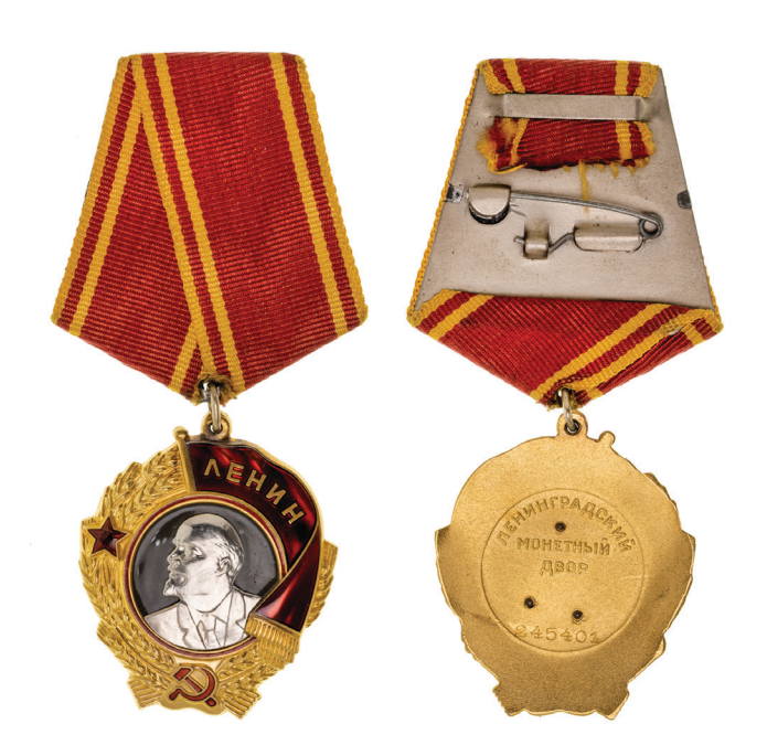
2610* USSR, Order of Lenin, type 6, variation 1, impressed number 245401 on reverse below two bottom rivets. Uncirculated . $1,500