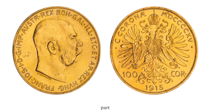
1568* Austria, Franz Joseph, one hundred corona, 1915, restrikes (KM.2819). Uncirculated . (2)