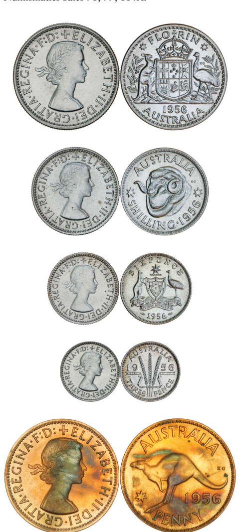
Elizabeth II, Melbourne Mint proof set, 1956. The penny toned brown and brilliant mint red, FDC. (5)

Ex Noble Numismatics Sales 98, 99, 114A.