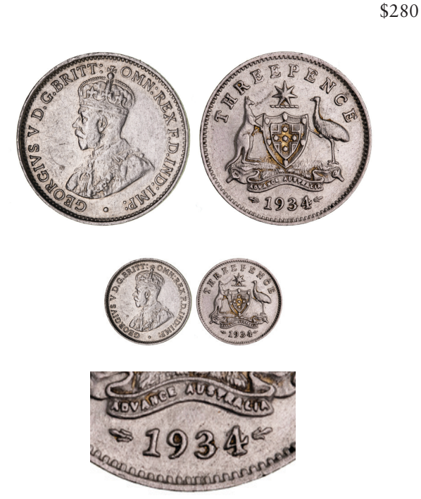
528* George V, 1934/3 overdate. Clean dull tone, however a strong clear overdate, good very fine and rare thus. $280