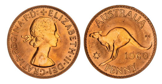
491* Elizabeth II, Perth Mint proof penny, 1960. Full red, FDC.

Ex Noble Numismatics Sale 109 (lot 1553 part).