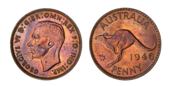
557* George VI, 1946. Brown and light red, nearly uncirculated. $350

Ex Noble Numismatics Sale 116 (lot 1436) (5), Sale 122 (lot 1334, 1338 (3) (4), Sale 104 (lot 1589).