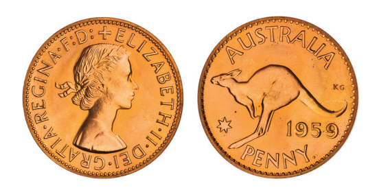
Elizabeth II, Perth mint proof penny, 1959. Red FDC.

Ex Noble Numismatics Sale 108 (lot 1428).