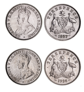
527* George V, 1927 and 1928. Frosty mint bloom, nearly uncirculated. (2)