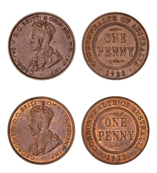
554* George V, 1933/2 overdate; 1933. Good very fine; brown and red, nearly uncirculated. (2)

Ex Noble Numismatics Sale 96 (lot 2022).