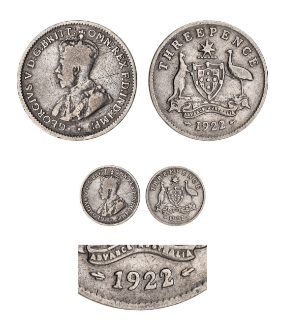
524* George V, 1922/1 overdate. Obverse scratches, otherwise very good with clear Advance Australia, very rare. $2,500