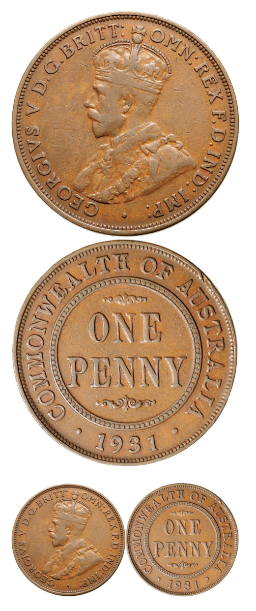
550* George V, 1931 dropped 1, Indian die. Six pearls, nearly very fine and very rare.