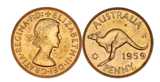
490* Elizabeth II, Perth Mint proof penny, 1959. Tiny carbon spot either side, otherwise red FDC. $280