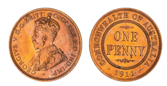
533* George V, 1911. Red uncirculated.