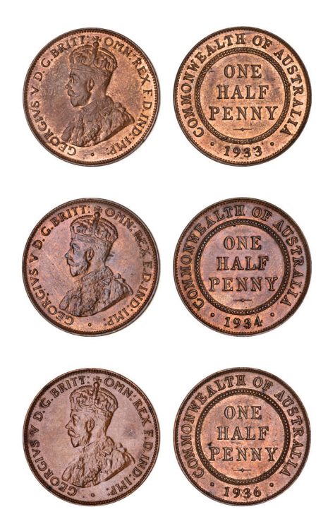
572* George V, 1933, 1934 and 1936. Brown and red uncirculated.