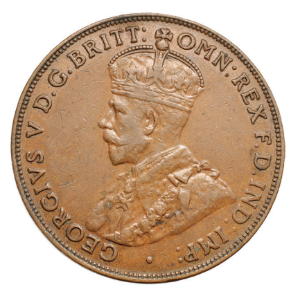
High Grade 1930 Penny

Ex Noble Numismatics Sale 117 (lot 1441).