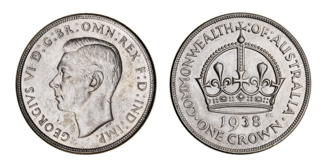
494* George VI, 1937 (2) and 1938 (2). First two cleaned, good very fine; toned extremely fine; good extremely fine. (4)