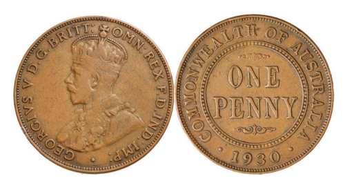
549* George V, 1930, Indian die. Minor contact marks, otherwise six pearls, good fine/nearly very fine and rare.