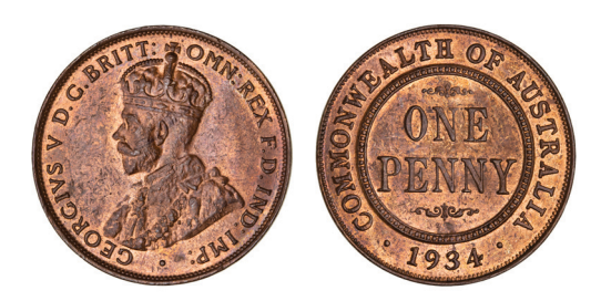
555* George V, 1934. Brown and red, uncirculated.

First ex Noble Numismatics Sale 101 (lot 1330), second ex Noble Numismatics Sale 104 (lot 1583).