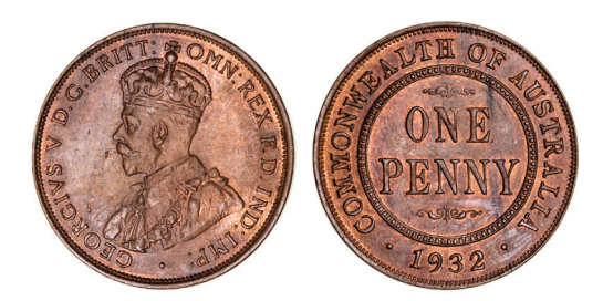
George V, 1932 London die. Attractive brown and red uncirculated.

Ex Noble Numismatics Sale 96 (lot 2022).