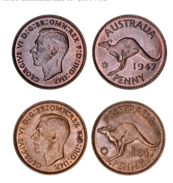
558* George VI, 1947 and 1947Y. Glossy red brown uncirculated; good extremely fine softly struck in centre. (2) $120

Ex Noble Numismatics Sale 117 (lot 1448).