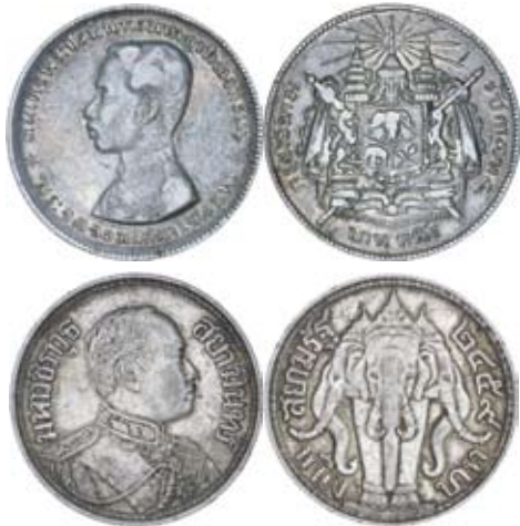
3262* Thailand , Rama V, silver baht (1876-1900) (KM.Y.34); Rama VI, silver baht, BE 2459 (1916) (KM.Y.45). Cleaned very fine; toned good very fine. (2)