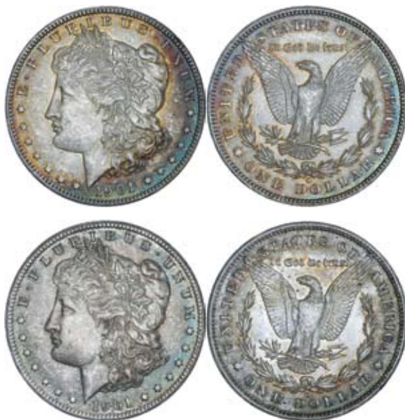
part 3297* USA, Morgan dollars, 1901O. Well struck up eagle, toned nearly uncirculated. (3) $150