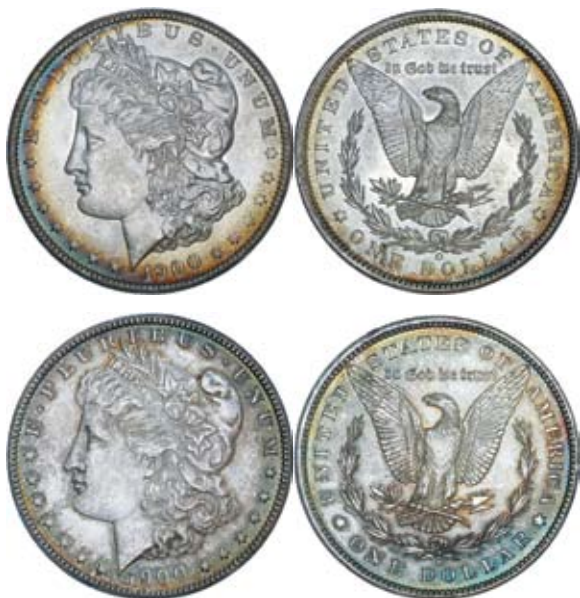
3295* USA, Morgan dollars, 1900O. Attractively toned, nearly uncirculated. (2) $100