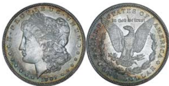
part 3298* USA, Morgan dollars, 1901O. Peripheral toning, nearly uncirculated. (3) $150