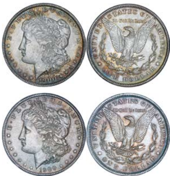
part 3296* USA, Morgan dollars, 1900O. Attractive peripheral toning, nearly uncirculated. (3) $150