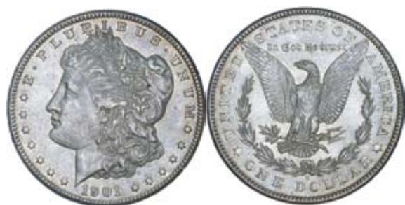
3299* USA, Morgan dollar, 1901S. Unmarked, uncirculated and rare in this condition. $600