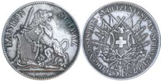
3261* Switzerland , Shooting Festival thaler, Schwyz, 1867 (KM. X.S9). Toned, nearly extremely fine.