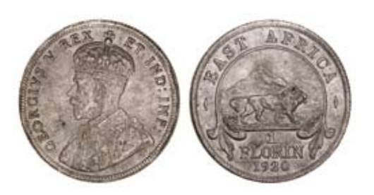
2971* East Africa, George V, florin 1920 (KM.17). Subdued original mint bloom, nearly uncirculated.