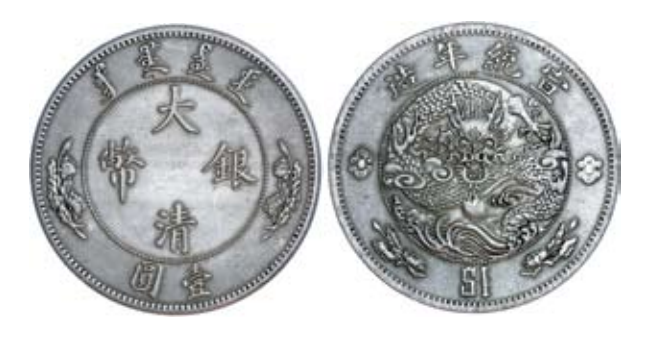
2894* China, Empire, Central Mint of Tientsin, silver dollar, undated (1910) (KM.219). Good very fine and very scarce thus.