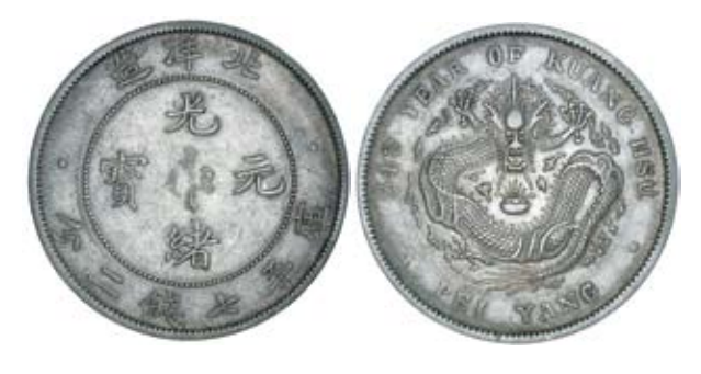
2901* China, Empire, Chihli Province, silver dollar, year 34 (1908) (KM.Y.73.3). Very fine . $200