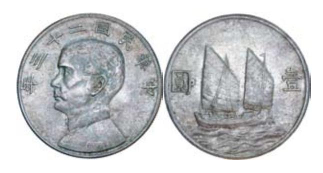
2937* China, Republic, Sun Yat Sen, 'Junk' silver dollar, yr 23 (1934) (KM.Y345). Toned, nearly uncirculated . $250