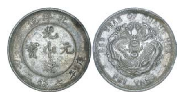
2898* China, Empire, Chihli Province, silver dollar, year 25 (1899) (KM.Y.73). Very fine . $200