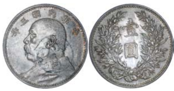
2921* China, Republic, Yuan Shi-kai, silver dollar, yr 3 (1914) (KM.Y329), with ink chopmark on obverse. Dark toned, underlying mint bloom, nearly uncirculated.