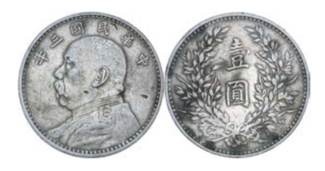
China, Republic, Yuan Shi-kai, silver dollar, yr 3 (1914) (KM. Y.329). Two obverse chopmarks, otherwise very fine.