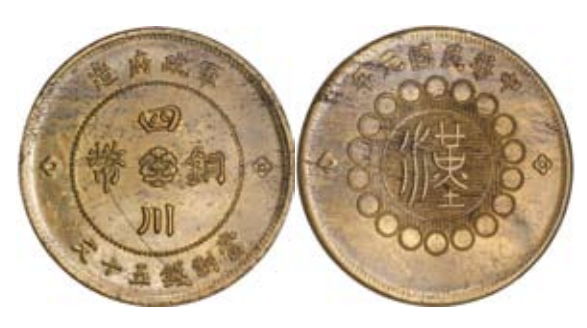
2941* China, Republic, Szechuan Province, brass fifty cash (1912) (KM.Y449a). Extremely fine. $50