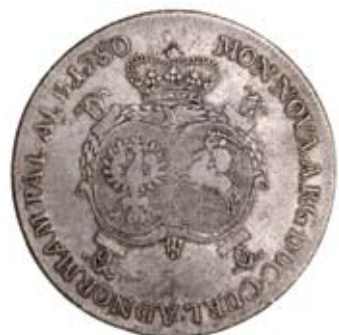
2967* Courland, Peter Biron, silver thaler, 1780 (KM.32). Even grey tone, fine.