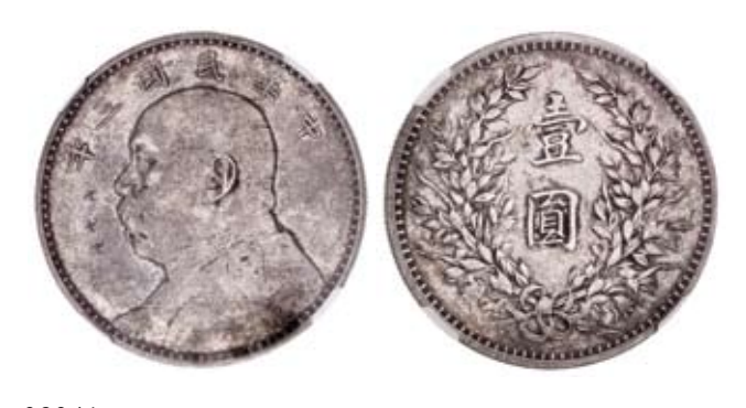
2924* China, Republic, Yuan Shi-kai silver dollar, yr 3 (1914) (KM. Y329). Toned, tiny chopmarks in front of face, otherwise very fine.

In a slab by NGC as VF details chopmarked.