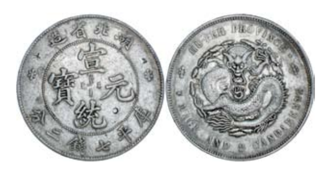
2906* China, Provincial, Hu Peh Province, silver dollar, undated (KM.Y127.1). Three chopmarks on the obverse, nearly very fine.