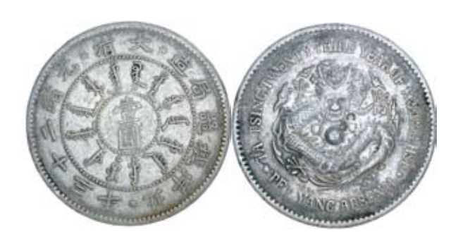
2897* China, Empire, Chihli Province, silver dollar, year 23 (1897) (KM.Y.65.1). Nearly very fine . $300