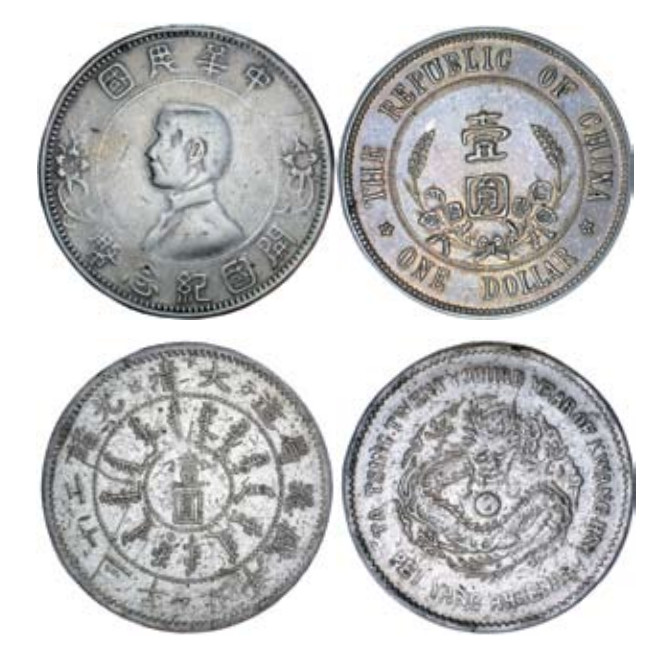
2935* China, Republic, Sun Yat Sen, silver dollar, undated (KM. Y319); Provincial, Chihli province, silver dragon dollar undated (KM.Y73.3). Both removed from silver bowl or plate, edges affected, otherwise very good. (2) $100