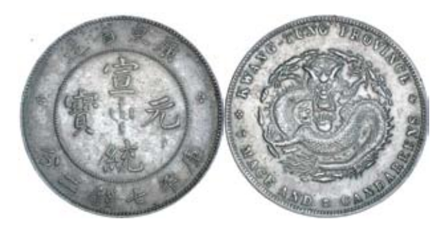
2918* China, Empire, Kwang Tung Province, silver dollar (1908-11) (KM.206). Good very fine . $250