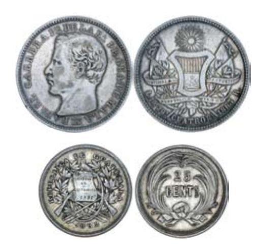
2997* Guatemala, Republic, silver four reales 1863R (KM.140); 25 cents decimal 1882 no star (KM.209.1). Very fine, both scarce. (2) $100