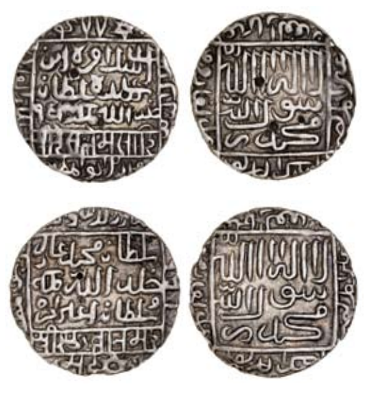
Ex Dr L.J. Sherwin Collection, previously from C. Pitchfork Collection Noble Numismatics Sale 50 (lot 1811).