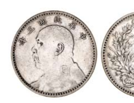
2923* China, Republic, Yuan Shi-kai, silver dollar, year 3 (1914) (KM.Y329). Very fine .