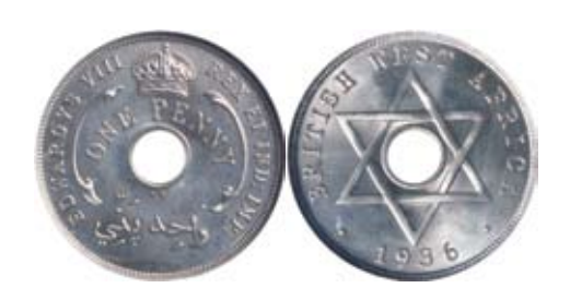
2866* British West Africa, Edward VIII, specimen cupro-nickel penny, 1936 KN (KM.6). Gem uncirculated specimen strike.