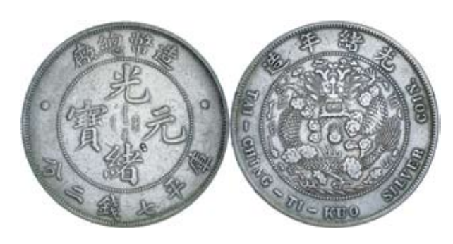
2892* China, Empire, Central Mint of Tientsin, silver dollar (1908) (KM.Y.14). Very fine .