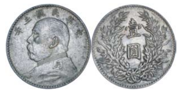
2922* China, Republic, Yuan Shi-kai, silver dollar, yr 3 (1914) (KM.Y32a). Some mint bloom, extremely fine. $250