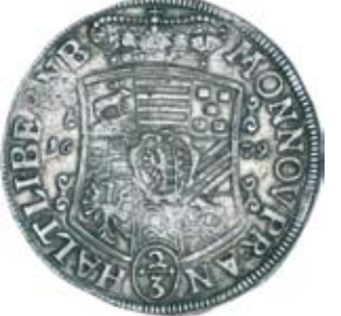
2982* Germany, Anhalt-Harzgerode, Wilhelm, two thirds thaler, 1679 (KM.1.1). Very fine .