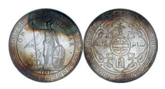
2864* British Trade dollar, 1929/1 B incuse (KM.T5). Uneven tone area, full frosty mint bloom, uncirculated.