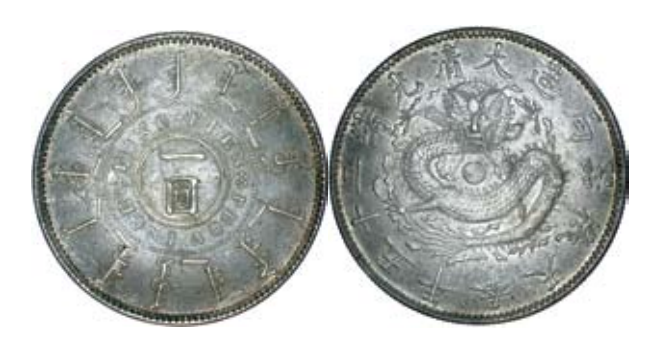
2903* China, Empire, Feng Tien Province, silver dollar, yr 25 (1899) (KM.Y.87.1). Shallow strike, copy dies, frosty mint bloom, nearly uncirculated. $500