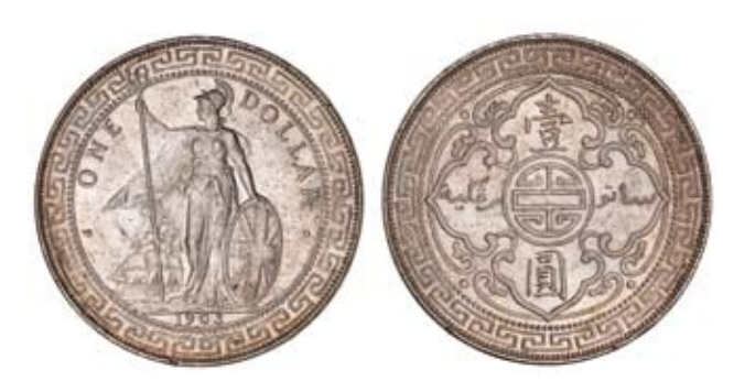
2863* British Trade Dollar, 1903B (KM.T5). Lightly toned good extremely fine.