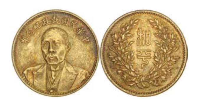
2939* China, Republic, President Tuan Chi-jui, dollar (1924) in brass (cf KM.683 and KM.pn74). Good very fine .