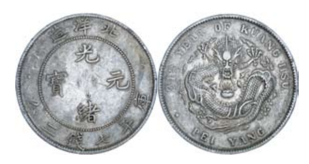
2899* China, Empire, Chihli province, silver dollar, year 34 (1908) (KM.Y73.2). Good fine . $100