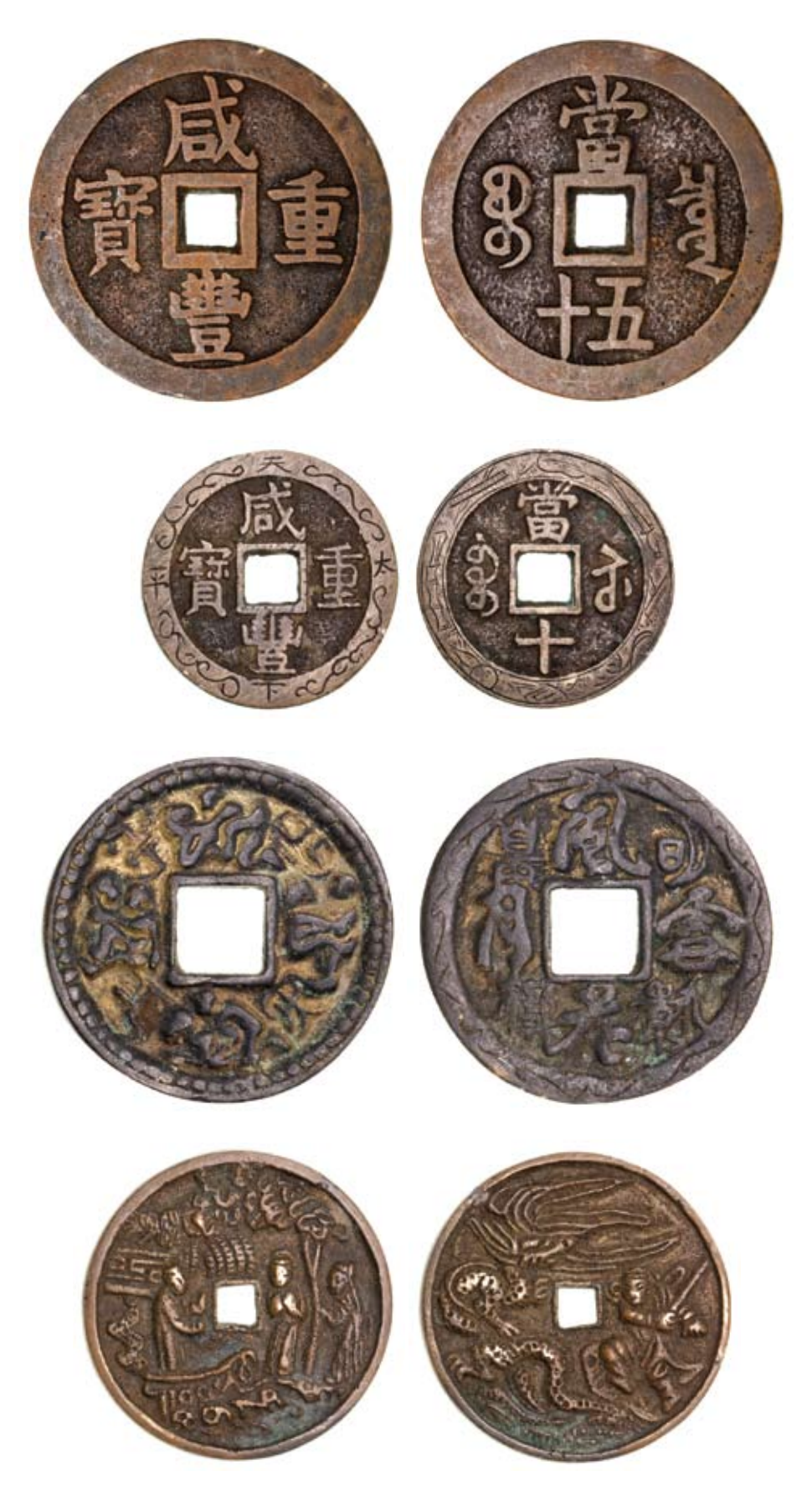
2885^{\ast} China, bronze charms, multiple cash style. Good fine - good very fine. (4)