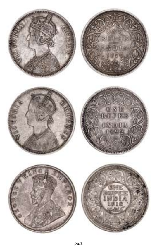
India, British, Queen Victoria, rupee 1876 dot (KM.473.2), 1891B incuse and 1892 C incuse (KM.492); Edward VII, rupee 1904 B incuse (KM.508); George V, rupees 1911 (KM.523), 1913; 1913 dot, 1918 (3), 1918 dot (3) (KM.524). Nearly fine - extremely fine. (13)