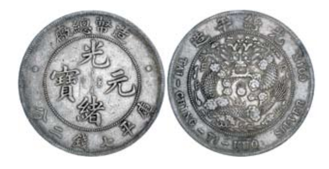
2893* China, Empire, Central Mint of Tientsin, silver dollar, undated (1908) (KM.Y14). Fine .