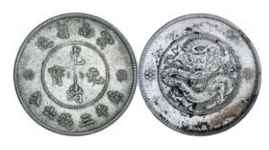
2920* China, Empire, Yunnan Province, silver fifty cents (1906) (KM.Y.257). Good very fine .