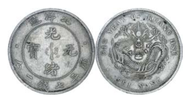
2900* China, Empire, Chihli Province, silver dollar, Year 34 (1908) (KM.Y73.2). Very fine .