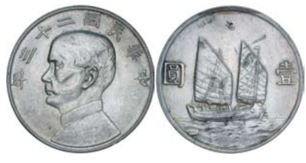
2936* China, Republic, Sun Yat Sen, 'Junk' silver dollar, yr 23 (1934) (KM.Y345). Good extremely fine. $250