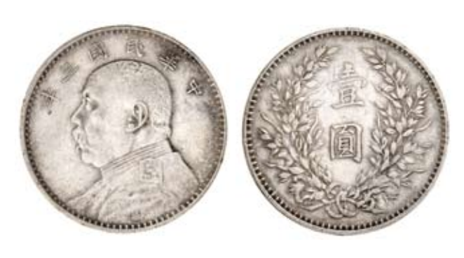
2925* China, Republic, Yuan Shi-kai, silver dollar, year 3 (1914) (KM.Y329). Very fine . $150

In a slab by NGC as VF details chopmarked.