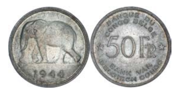
2842* Belgian Congo, silver fifty francs, 1944 (KM.27). Toned, subdued mint bloom, good extremely fine.