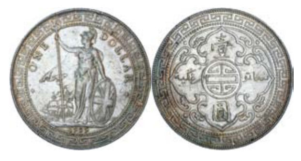
2865* British Trade Dollar, 1929 B incuse (KM.T5). Extremely fine.