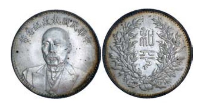
2938* China, Republic, dollar, undated (1924), President Tuan Chijui; (KM.683). Edge dark toned (held in leather?), otherwise original mint bloom, nearly uncirculated and rare.