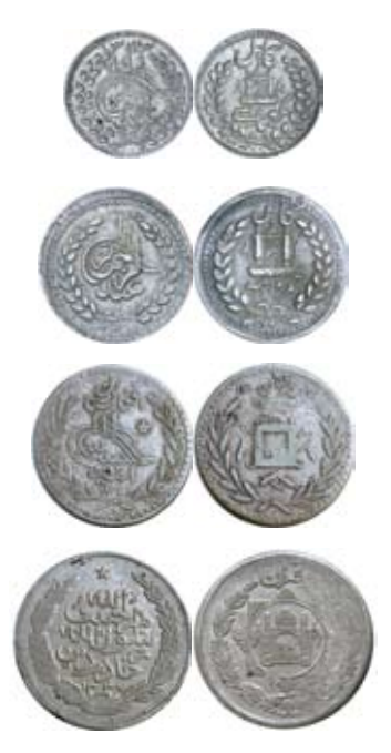
lot 2813 part