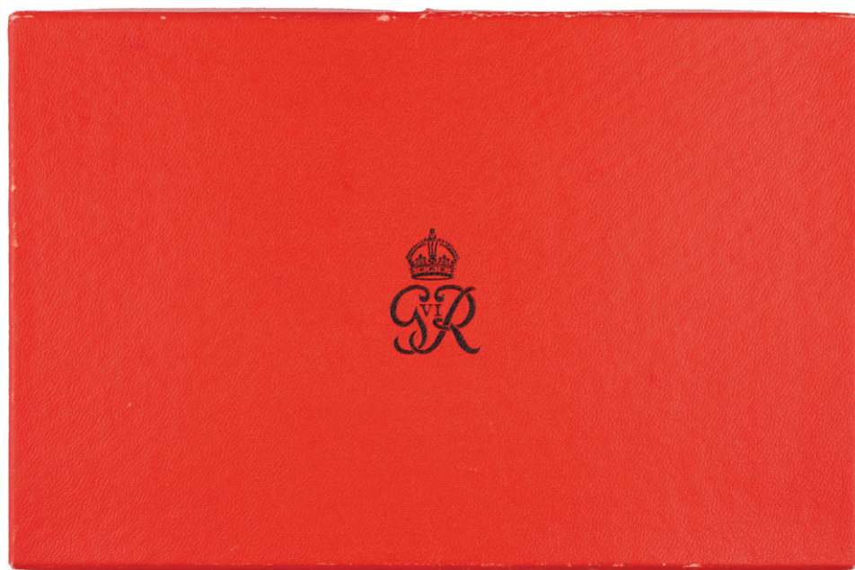
lot 2778 part