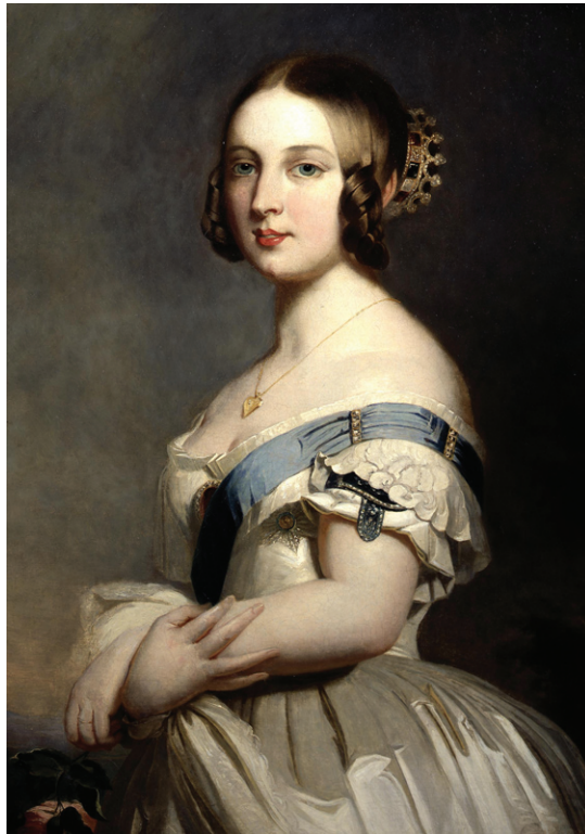
Queen Victoria 1837 - 1901