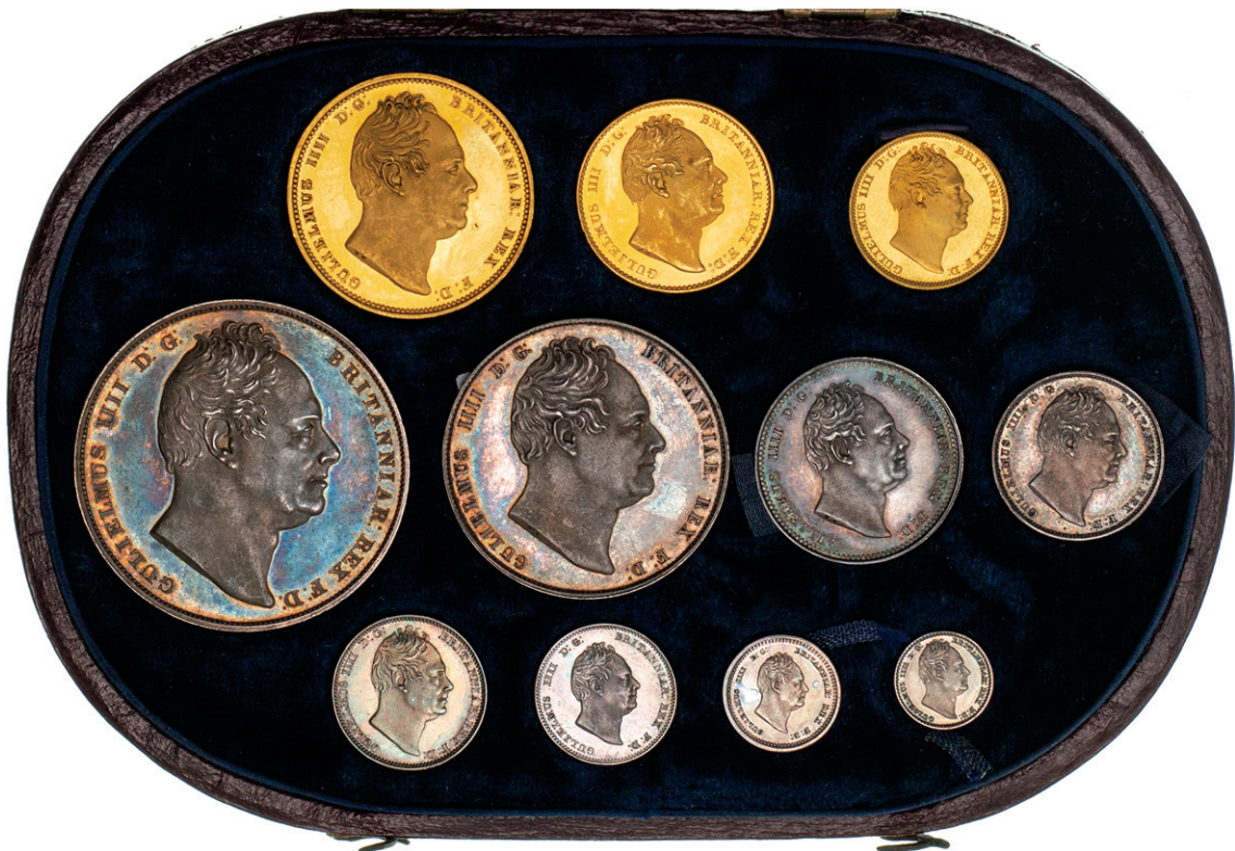
1831 proof set