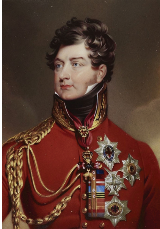
George IV 1820 - 1830