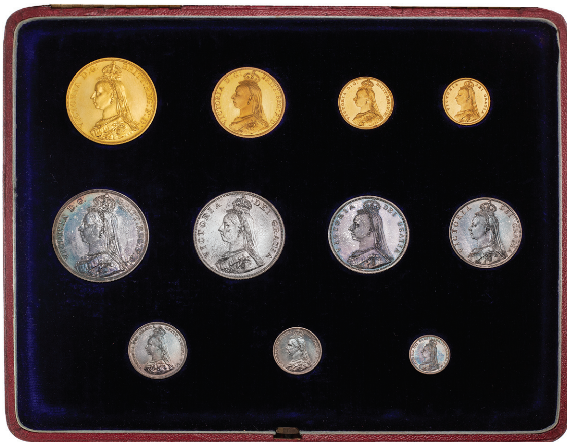
1887 proof set