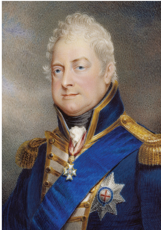
William IV 1830-1837