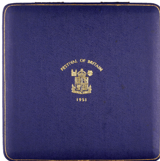
LOT 2782 PART

The festival of Britain was held to boost the population's morale by celebrating British achievements. It coincided with the gradual lifting of wartime austerity and restrictions and envisaged a future driven by science and industry. The festival ran throughout the summer principally on the south bank of the Thames in London. This set is distinguished by the return of the crown, which was very popular as a festival crown struck from polished dies and sold at a sixpenny premium. The coin comes in two varieties varying in the definition of the reverse design, and this is most easily seen in the horse's leg and the dragon's arm. The rest of the set has identical designs to the 1950 proofs, excluding the date. Edges are straight-grained, excepting the crown, brass and bronze coins, which have smooth edges; reverse die axes are all struck en Medaille. The borders on all denominations have denticles except the brass threepence, which has plain dodecagonal rims.