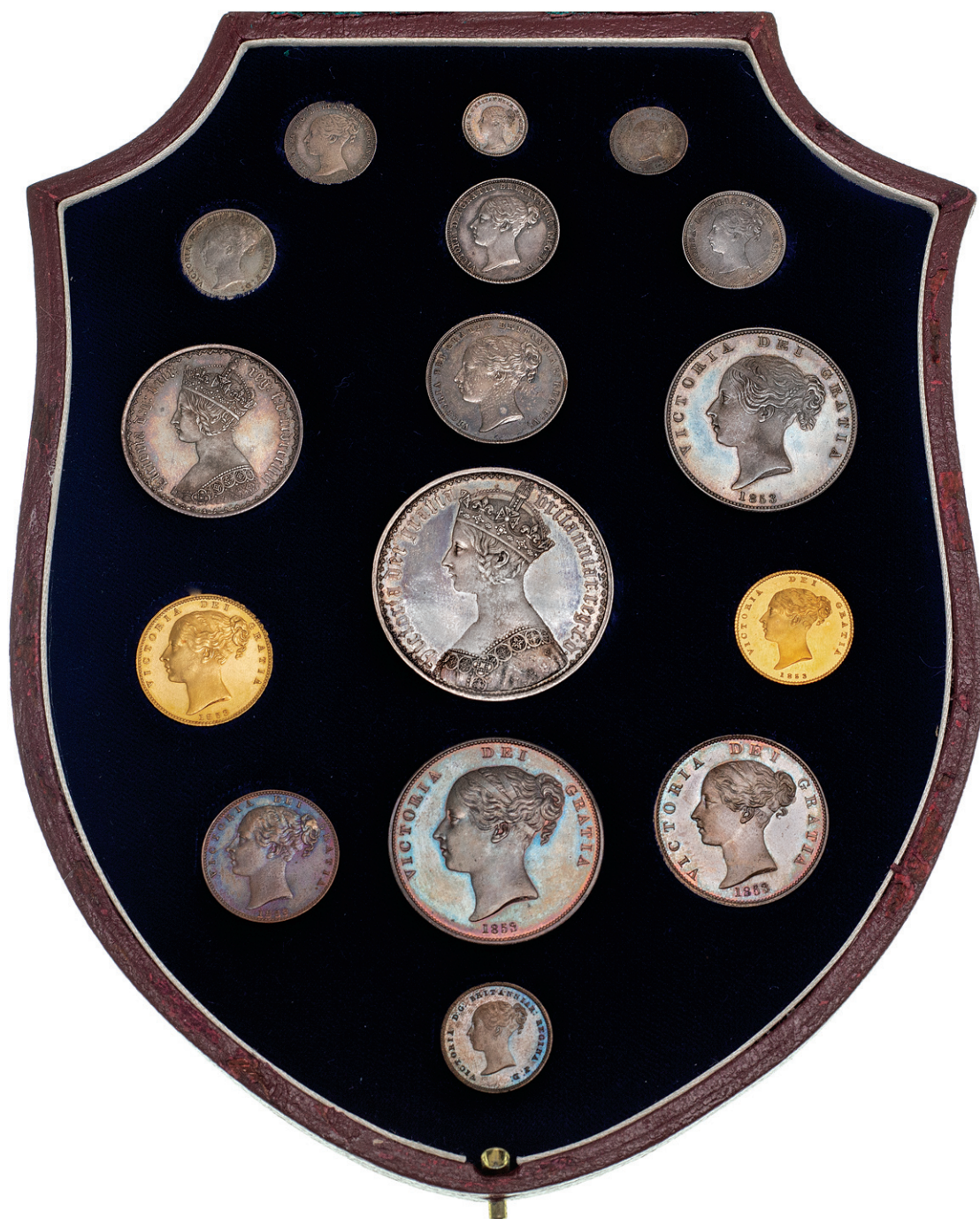
1853 proof set