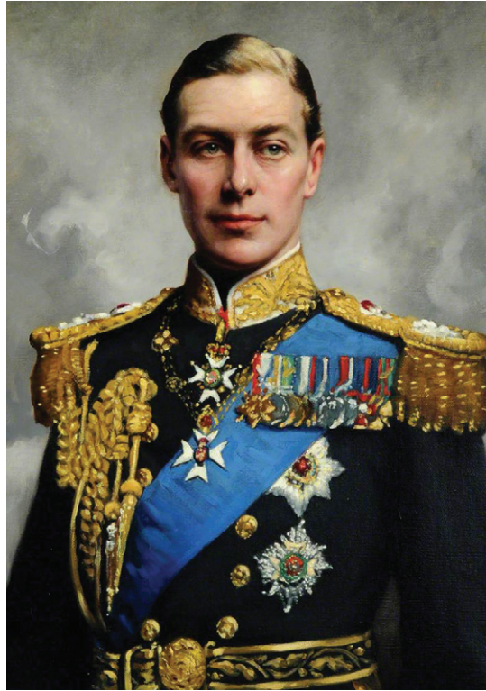
George VI 1936 - 1952