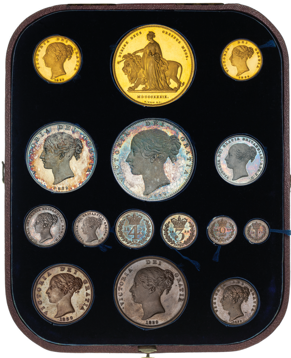
1839 proof set