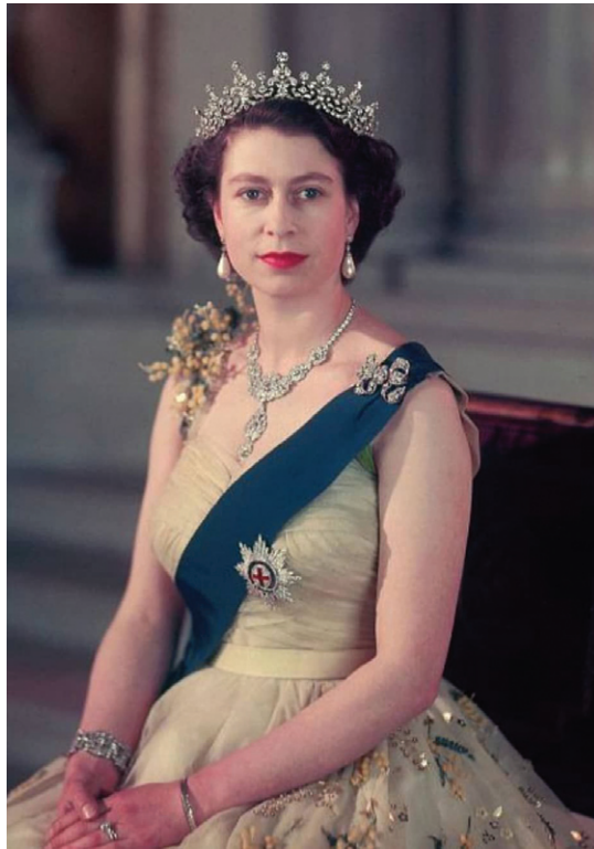
Elizabeth II 1952 -