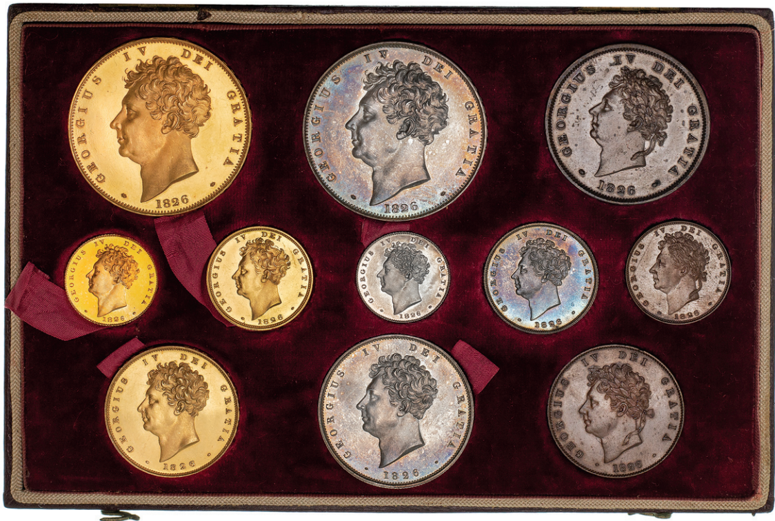
1826 proof set