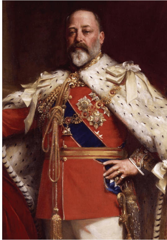
Edward VII 1901 - 1910