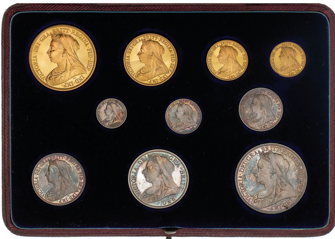
1893 proof set