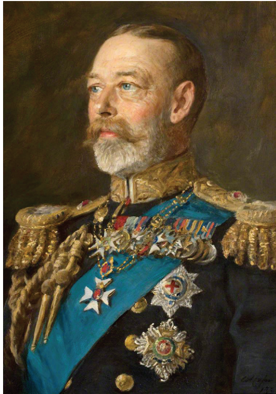
George V 1910 - 1936