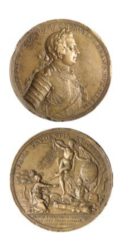
lot 2255 part