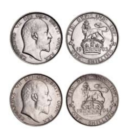
2198* Edward VII, shillings, 1903 and 1904 (S.3982). Good extremely fine. (2) $250

Ex Lieut. Cmdr. Maurice G. Rose Collection, purchased 12/10/76 ($12), 20/4/78 ($85), last two 29/1/77 ($85) ($80).