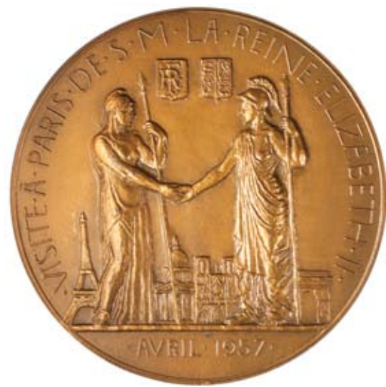
lot 2299 next page