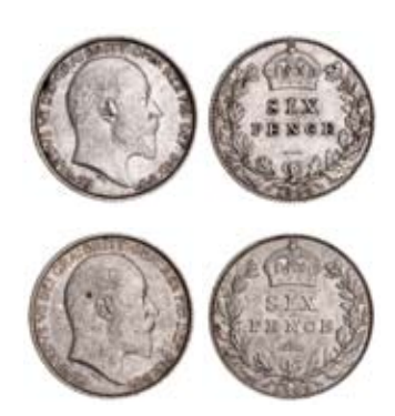
2203* Edward VII, sixpences, 1908 and 1909 (S.3983). Extremely fine; good extremely fine. (2) $100

Ex Lieut. Cmdr. Maurice G. Rose Collection, purchased 29/1/77 ($60), 28/7/80 ($60).