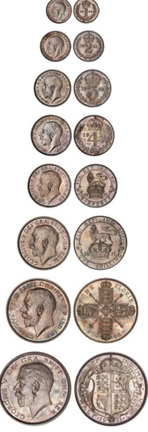
2121* George V, proof set, five pounds to Maundy penny, 1911 (S.PS11). In a case of issue, the five, two pounds and half sovereign have minute contact marks, otherwise FDC and scarce. (12)