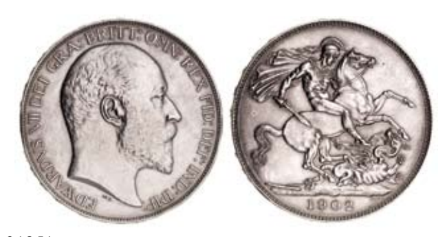
2195* Edward VII, crown, 1902 (S.3978). Reverse rim bruise at 9 o'clock, a little rubbed, otherwise extremely fine.