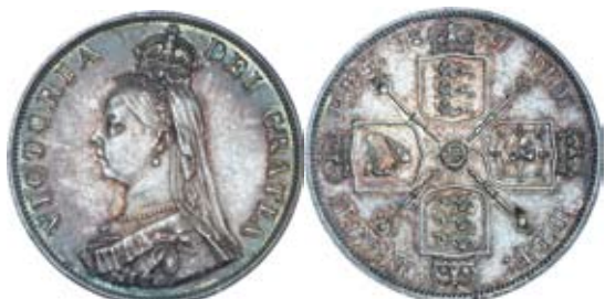
lot 2180 part