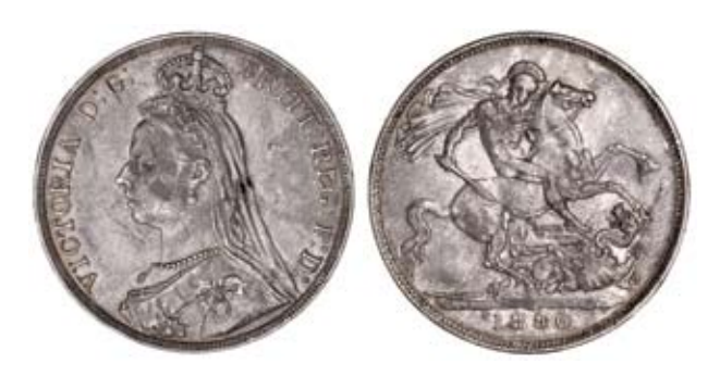
2179* Queen Victoria, Jubilee coinage, silver crown, 1890 (S.3921). Toned, nearly extremely fine. $150

Private purchase from M.R.Roberts with their ticket, 'Ex Colin Cooke Collection'.