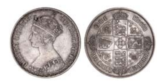
2177* Queen Victoria, Gothic florin, 1867 (S.3891). Toned, nearly extremely fine.