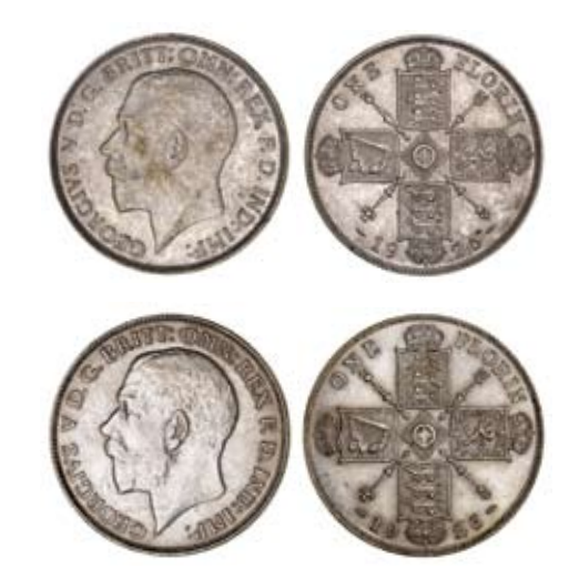
2209* George V, florins, 1925 and 1926 (S.4022A). Dull tone over some bloom, extremely fine, the first rare thus. (2) $250

Ex Lieut. Cmdr. Maurice G. Rose Collection, purchased 18/11/77 ($23.50); 29/1/77 ($35).