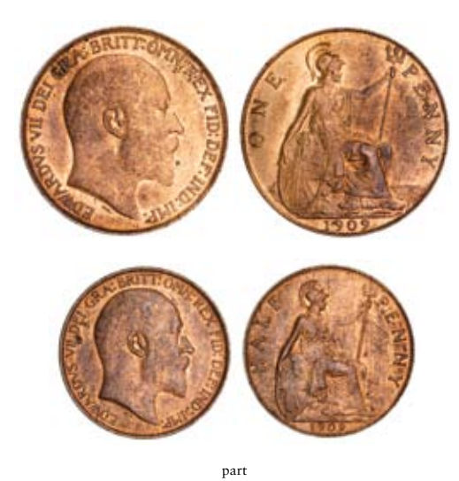
2206* Edward VII, pennies 1909 (4) (S.3990) and halfpenny 1909 (S.3991). Mostly red uncirculated. (5)

2205 Edward VII, sixpences, 1909 (S.3983). Extremely fine . (2)