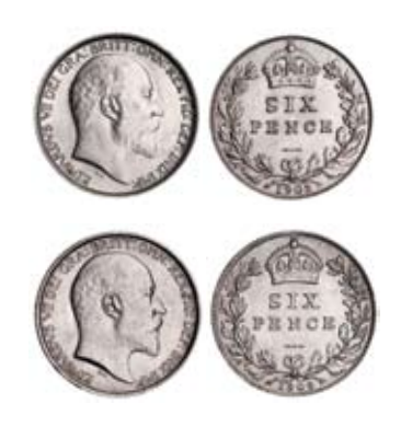
2202* Edward VII, sixpences, 1903 and 1909 (S.3983). Nearly uncirculated; extremely fine. (2)