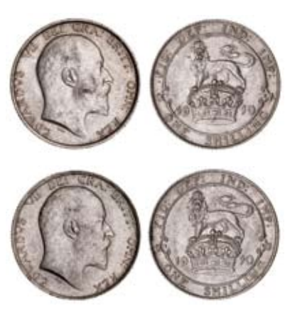
2201* Edward VII, shilling, 1910 (S.3982). Good extremely fine. (2) $150