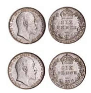
2204* Edward VII, sixpences, 1909 (S.3983). Good extremely fine; nearly uncirculated. (2)