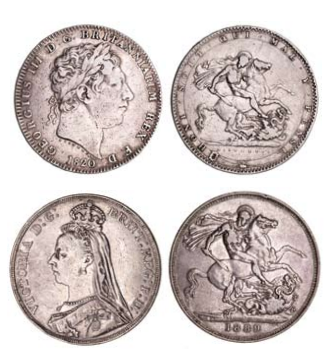
lot 2166 part

George III, Maundy threepences, 1763 (3) and twopence, 1772 (S.3753, 3756); Queen Victoria, Jubilee coinage, sixpence 1887 (S.3928) (3). Two toned, extremely fine or better. (7)