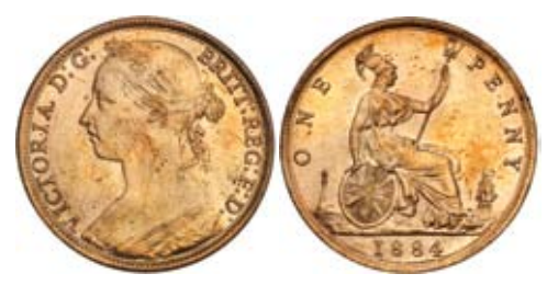
2185* Queen Victoria, bun head penny, 1884 (S.3954). Full original mint red, gem uncirculated.