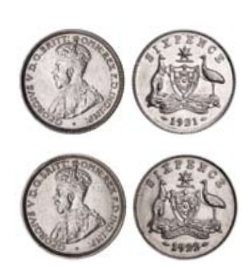
1613* George V, 1921 and 1922. Extremely fine; nearly extremely fine. (2) $200