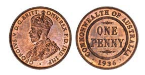
1680* George V, 1936 London die. Nearly full red uncirculated. $150