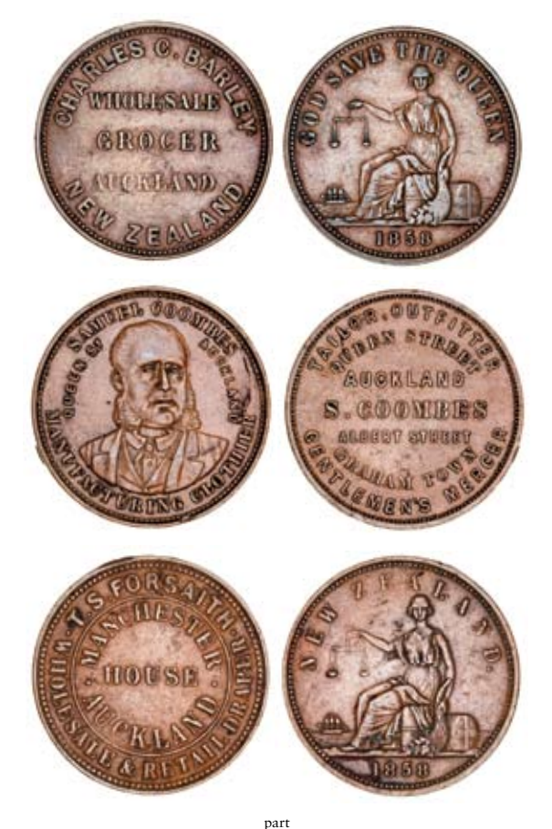
1723* New Zealand issuers, as per Andrews nos, A.27, 77, 131, 378, 455, 459. Nearly very fine - nearly extremely fine. (6) $270