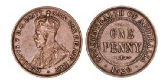
1663* George V, 1920 dot above top scroll only, Indian die. Very fine and very rare .