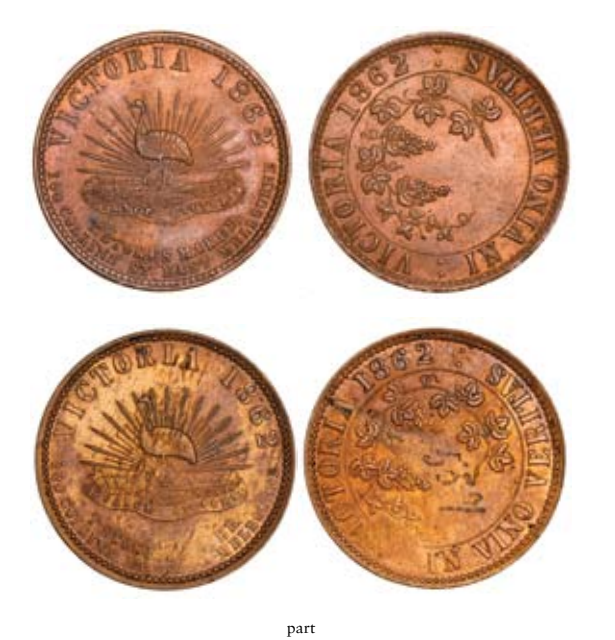
1718* Stokes, T., Melbourne pennies, 1862 (A.556 (2), 557). Inked number on last, nearly extremely fine; good extremely fine; extermely fine. (3)

Ex Ranald Hill Collection, Noble Numismatics Sale 96 (lot 1040 part).