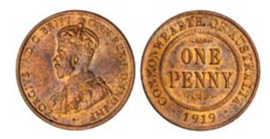
1652* George V, 1919 London die. Softly struck, mostly red uncirculated.

Ex Noble Numismatics Sale 96 (lot 2976).