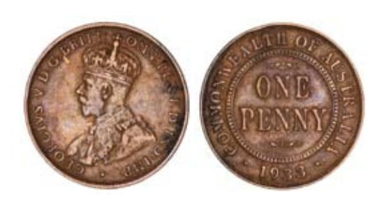
1677* George V, 1932 and 1933/2 overdate, London dies. Good very fine; nearly very fine. (2)

Ex Noble Numismatics Sale 96 (lot 2022).