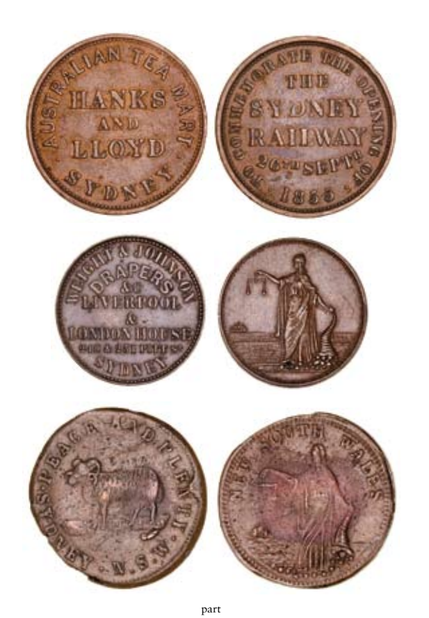
1724* Sydney issuers, as per Andrews no A 188, 292, 363, 617, 630, 634. Very fine or better. (6) $180