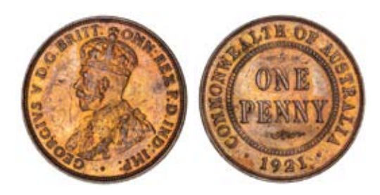
1664* George V, 1921, Indian die. Subdued original mint red, uncirculated and rare in this condition.

Ex Noble Numismatics Sale 101 (lot 1657).