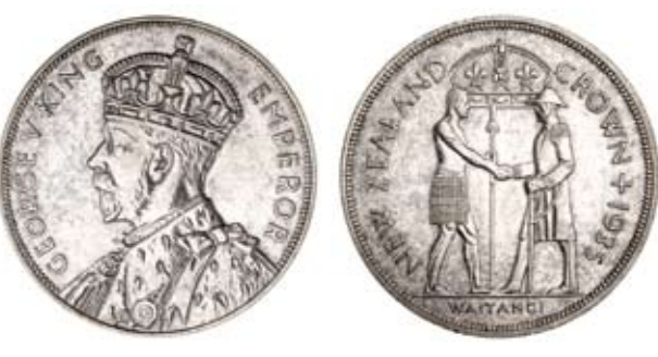
George V, Waitangi crown, 1935. Minor surface marks, otherwise nearly uncirculated and rare.