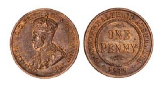
1653* George V, 1919, London die, dot below, small dot above top scroll. Brown and red, nearly uncirculated.

Ex Noble Numismatics Sale 96 (lot 2976).