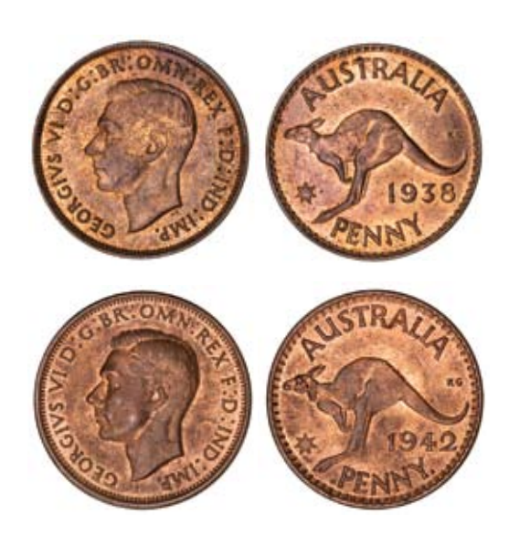
1681* George VI, 1938 and 1942I. Mostly red uncirculated. (2) $250

Ex Noble Numismatics Sale 96 (lot 2025).