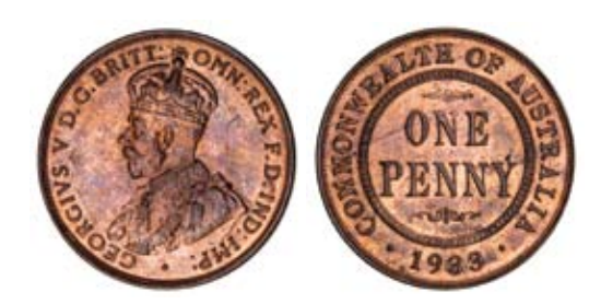
1678* George V, 1933 London die. Nearly uncirculated .