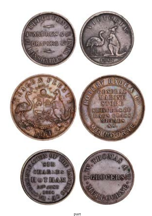
1722* Melbourne issuers, as per Andrews nos A 11, 14, 105, 237, 281, 283, 284, 434, 461, 576. Fine - good very fine. (10) $350