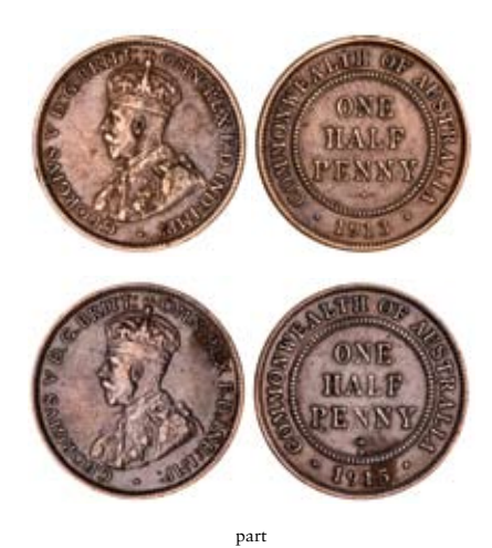
1691* George V, 1913 (2, one with 3 further to right), 1914, 1914H, 1915H, 1916I, 1917I and 1918I. Fine - good very fine. (8) $200

Ex Status Sale 297 (May 2013, lot 5665).