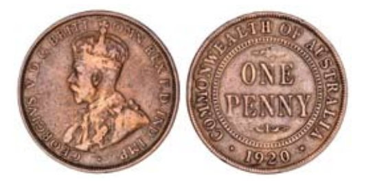
1655* George V, 1920 London die. Very good.

Ex Jon Saxton Collection, Noble Numismatics Sale 108 (lot 2362 part).