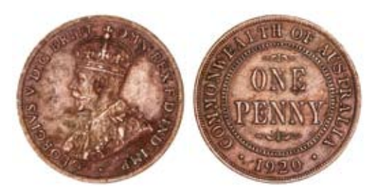
1660* George V, 1920 dot above, Indian die. Slightly pitted, otherwise good very fine.