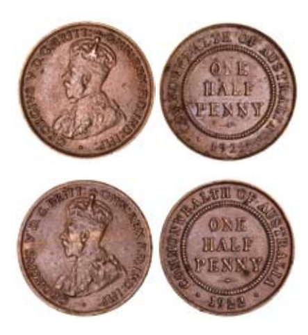
1694* George V, 1921 (thin 2 and 1), 1922, 1924 and 1925. Very fine - good very fine. (4) $80