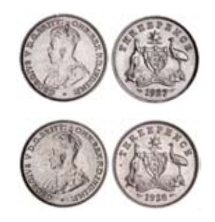
1639* George V, 1927 and 1928. Frosty mint bloom, nearly uncirculated. (2) $300