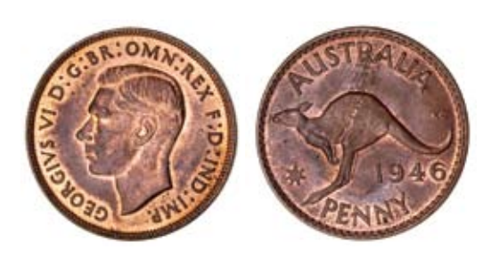
1685* George VI, 1946. Red and brown uncirculated/brown and red uncirculated.