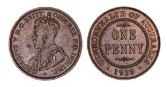
1645* George V, 1913. Grey brown patina, hints of red, nearly uncirculated.

Ex Noble Numismatics Sale 96 (lot 2962).