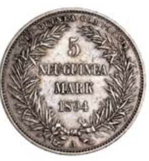
1730* German New Guinea, silver five mark, 1894A. Toned very fine.