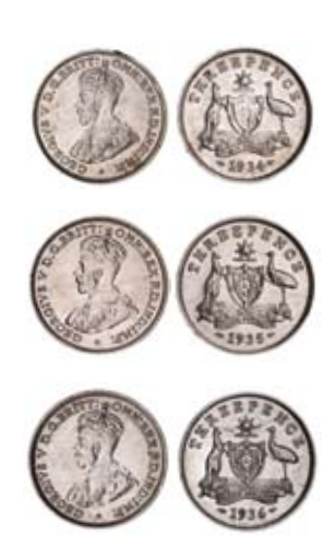
1641* George V, 1934, 1935 and 1936. Obverse scratch good extremely fine; nearly uncirculated; nearly uncirculated.