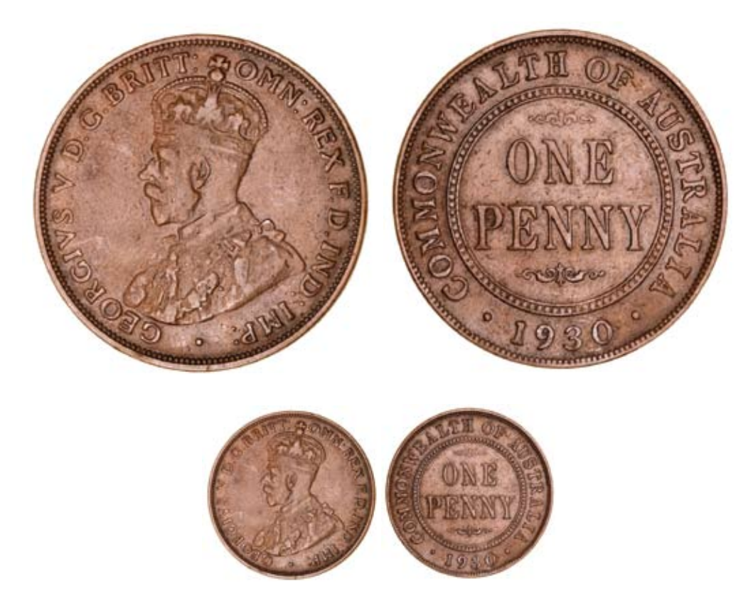
1673* George V, 1930 Indian die. Good fine and rare .

$15,000 Private purchase in 2016, sold with a letter of authenticity from J.B.Joslin, Controller of the Mint 16 January 1978.