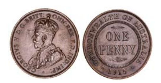
1647* George V, 1915. Good extremely fine.

Ex Noble Numismatics Sale 96 (lot 1973).