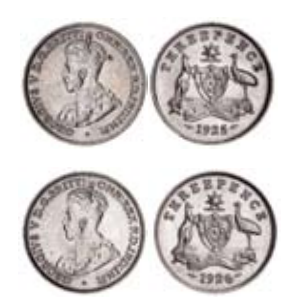
1638* George V, 1925 and 1926. Nearly extremely fine/extremely fine. (2)