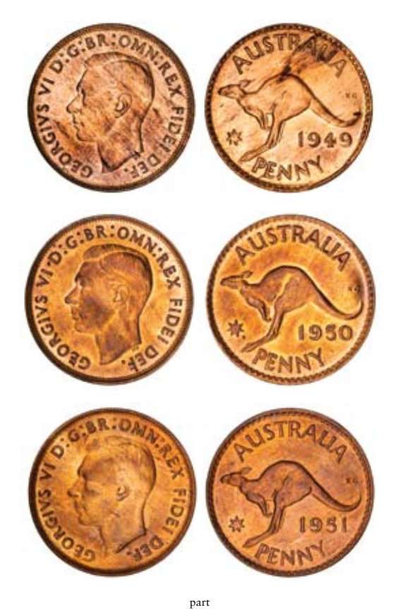
1688* George VI, 1949, 1950, 1951, 1951PL. Full original mint red, all choice uncirculated. (4)

Third ex Noble Numismatics Sale 95 (lot 26 part) and fourth Sale 96 (lot 16 part).