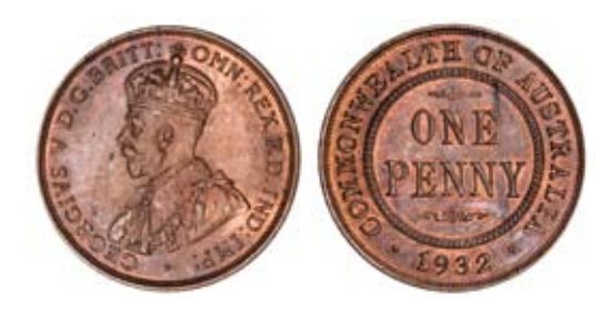
1676* George V, 1932 London die. Attractive brown and red uncirculated .

First private purchase in 2010, second ex Noble Numismatics Sale 98 (lot 33).