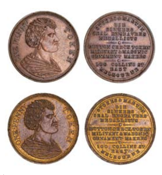
1719* Stokes & Martin, Melbourne penny, undated (A.566), another but upset 180 degrees die axis. Good very fine, second possibly has been gilded and rare thus. (2) $600

Ex Ranald Hill Collection, Noble Numismatics Sale 96 (lot 1040 part).