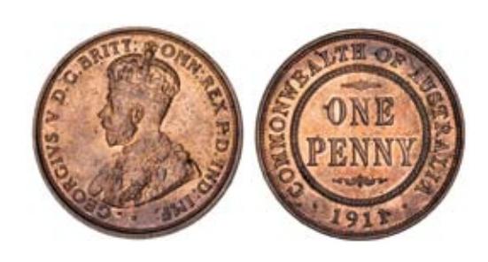
1643* George V, 1911. Red and brown uncirculated.