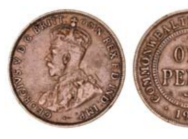
1666* George V, 1922, Indian die. Reverse rim nicks at 3 o'clock, otherwise fine.