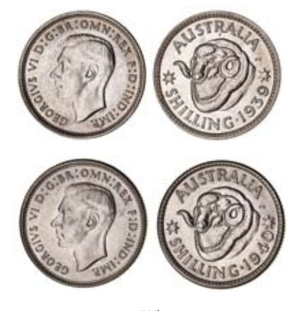
1601* George VI, 1938, 1939 and 1940. Nearly uncirculated, the last two scarce thus. (3) $300