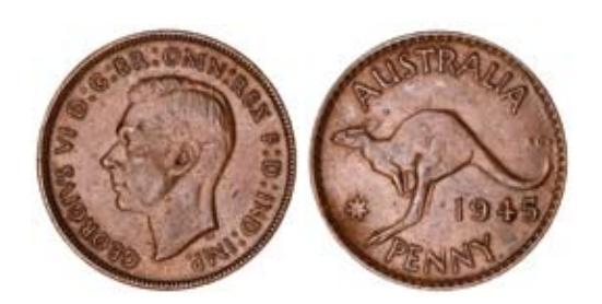
1684* George VI, 1945Y. KG. Dot after KG die state variety, very fine.