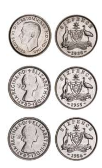
1621* George VI - Elizabeth II, 1938 to 1963. The 1955 and 1956 are proofs, very fine - FDC. (28) $700

The 1955 ex Noble Numismatics Sale 114A (lot 1155 part).