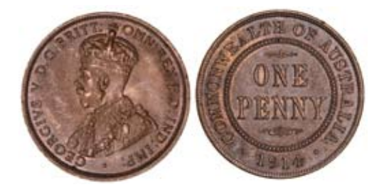
1646* George V, 1914. Even medium red brown patina with traces of red, nearly uncirculated and rare in this condition. $400

Ex Noble Numismatics Sale 95 (lot 2010).