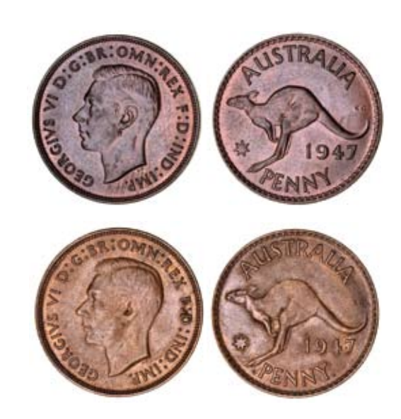
1687* George VI, 1947 and 1947Y. Glossy red brown uncirculated; good extremely fine softly struck in centre. (2) $150

The third from Noble Numismatics Sale 75 (lot 11 part) and fourth Sale 95 (lot 84) (illus).