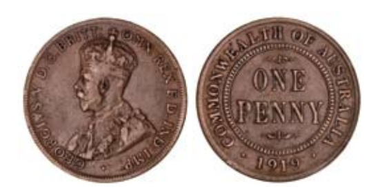
1654* George V, 1919 London die, dot below and small dot above. Brown patina, fine. $50