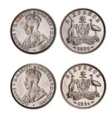
1620* George V, 1935 and 1936. Good extremely fine. (2)