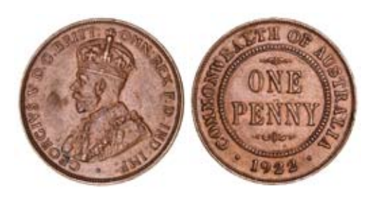
1665* George V, 1922, London die, 9 tilts left. Red brown patina, good extremely fine and rare thus.