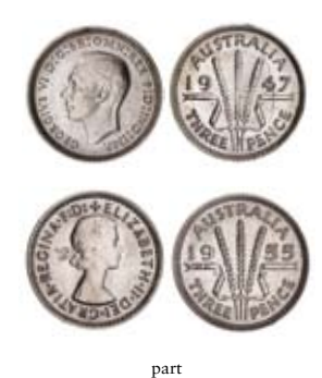
1642* George VI - Elizabeth II, 1938 to 1964. The 1942 only good fine, others good very fine - uncirculated, the 1955 said to be proof. (30)