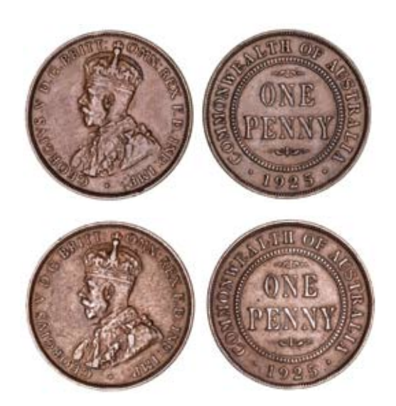
1669* George V, 1925, London dies. Horizontal line on neck, and broken N die states, good very fine. (2)

Ex Noble Numismatics Sale 97 (lot 1570).