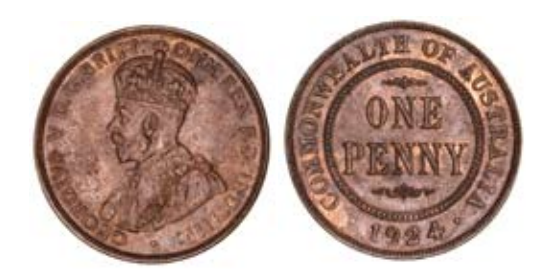
1668* George V, 1924, London die. Brown and red, uncirculated.