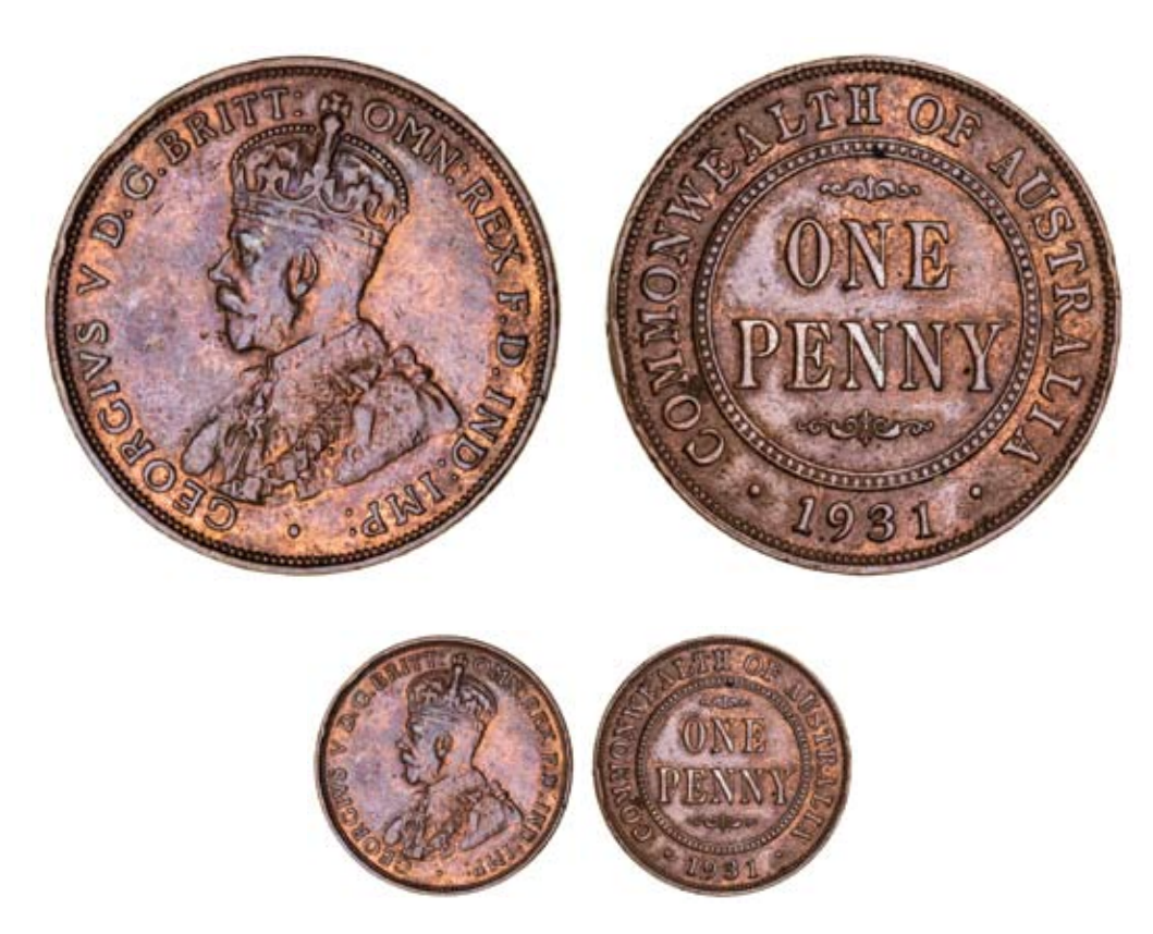
1674* George V, 1931 dropped 1, Indian die. Nearly very fine and very rare , one of the great rarities of the series.

$15,000 Private purchase in 2016, sold with a letter of authenticity from J.B.Joslin, Controller of the Mint 16 January 1978.