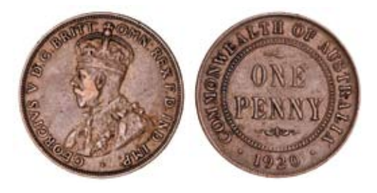
1661* George V, 1920 dot below, Indian die, ten percent die rotation. Good very fine. $50