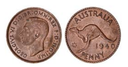
1683* George VI, 1940K.G. Lightly toned, extremely fine.

Several from Noble Numismatics Sales 75 (3), 95, 96 (5), 98.