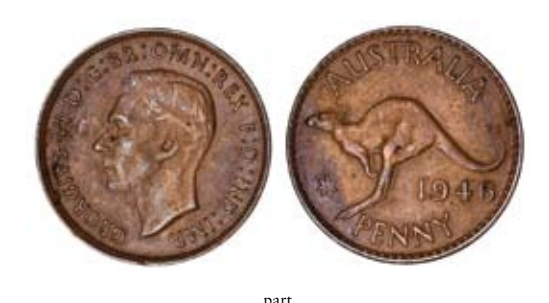
1686* George VI, 1946. Nearly very fine or better. (4)