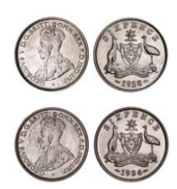
1619* George V, 1928 and 1934. Nearly extremely fine/extremely fine; good extremely fine. (2) $280