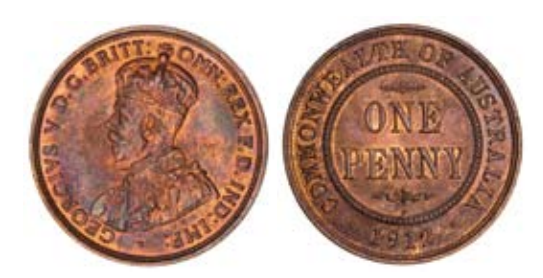
1644* George V, 1912H. Brown and red uncirculated, rare with mint red.

Ex Noble Numismatics Sale 96 (lot 2962).