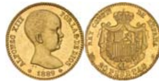
767* Spain, Alfonso XIII, twenty pesetas, 1889(89)M (KM.693). Scratches, otherwise extremely fine. $660