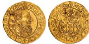
714* Poland , Danzig, Sigismund III, trade coinage ducat, 1612 (3.45g) (KM.5.4; Fr.10). Nearly extremely fine and very scarce. $2,500

From an old Austrian collection, purchased from Schlessinger, Berlin 1930, MK35, with old packet.