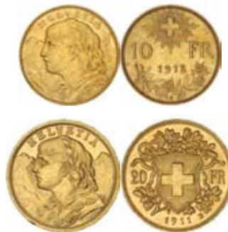
768* Switzerland, ten francs, 1912B (KM.36), twenty francs, 1911B (KM.35.1). Nearly uncirculated. (2) $600