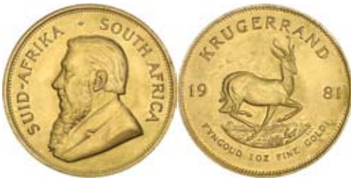
762* South Africa, Republic, krugerrand, 1981 (KM.73). Dull toned reverse, uncirculated. $2,200