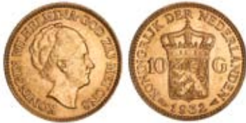
712* Netherlands , Wilhelmina, ten gulden, 1932 (KM.162). Nearly uncirculated. $400