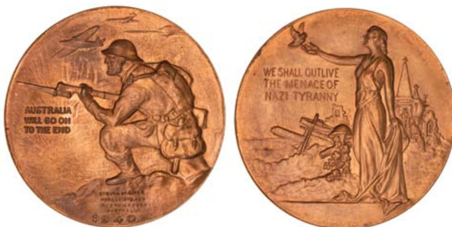
561* Australia Will Go On To The End, 1940, in bright copper (57mm), by Amor (C.1940/1). Nearly full mint red, nearly uncirculated.