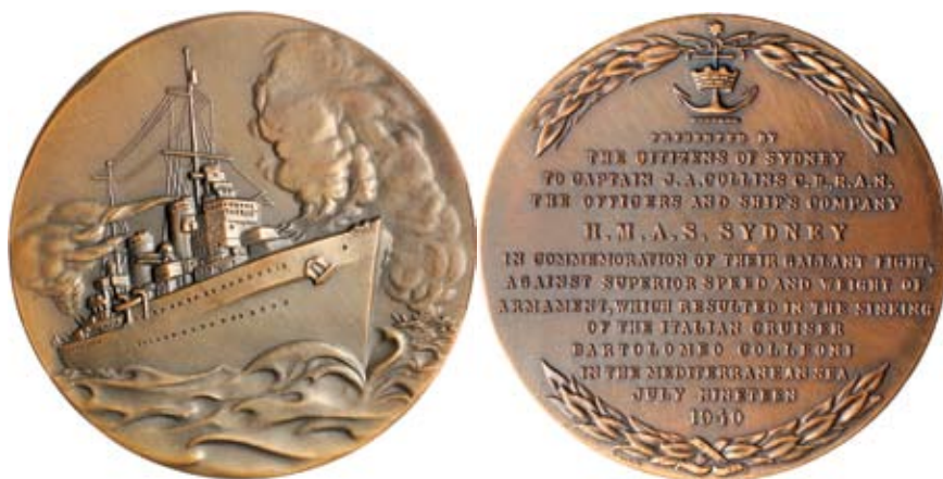
560* WWII, Bartolomeo Colleoni Medal, 1940, restrike in bronze (57mm) (C.1940/2), by Amor. A few small edge marks, otherwise nearly uncirculated.