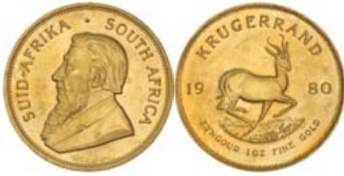
758* South Africa, Republic, krugerrand, 1980 (KM.73). Nearly uncirculated. $2,200