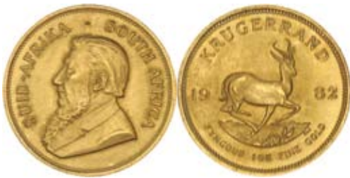
763* South Africa, Republic, krugerrand, 1982 (KM.73). Uncirculated. $2,200