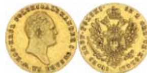
715* Poland , Alexander I (of Russia), twenty five zlotych 1817B (KM.C.102; Fr.106). Very fine with mint bloom within the legend and devices, rare as such. $2,500

From an old Austrian collection with a ticket from Wilhelm Trinks of Vienna.