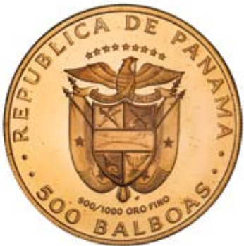
713* Panama , Republic, proof five hundred balboas, 1976 (KM.42). In pack of issue, FDC. $2,500