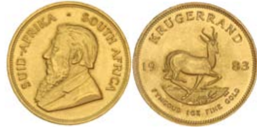
765* South Africa, Republic, krugerrand, 1983 (KM.73). Nearly uncirculated. $2,200