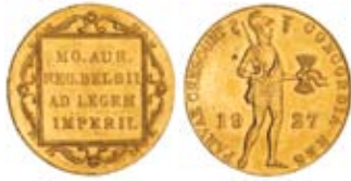
710* Netherlands , trade ducat, 1927 (KM.83.1a). Uncirculated. $200