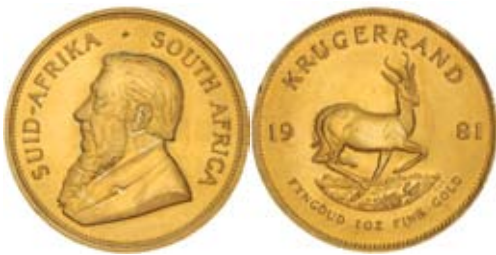
760* South Africa, Republic, krugerrand, 1981 (KM.73). Uncirculated. $2,200