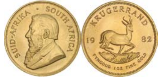
764* South Africa, Republic, krugerrand, 1982 (KM.73). Uncirculated. (2) $4,400