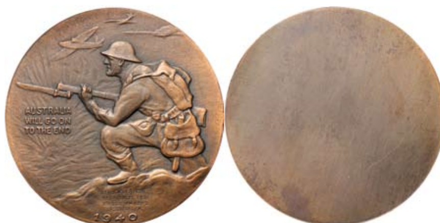
562* Australia Will Go On Until The End, 1940, uniface striking in bronze (57mm) (C.1940/1), by Amor. Uncirculated.