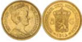
711* Netherlands , Queen Wilhelmina, five gulden, 1912 (KM.31). Nearly uncirculated. $250