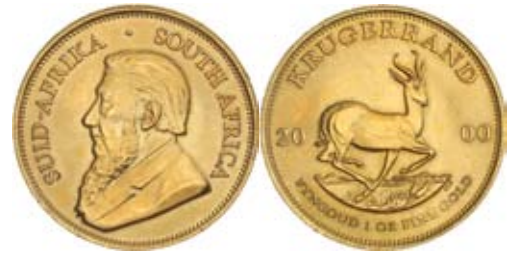
766* South Africa Republic, krugerrand, 2000 (KM.73). Uncirculated. $2,200