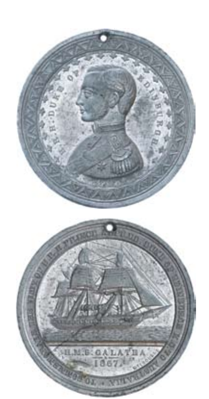
302* Visit Of The Duke Of Edinburgh, H.M.S. Galatea, 1867, in white metal (47mm) (C.1867/1), by T.Stokes, Melbourne, holed for suspension, obverse with triangular motif border. Some spotting and very minor edge nicks and small nick in exergue on reverse, otherwise extremely fine.