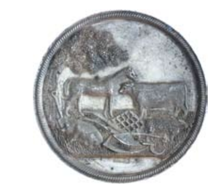
Ex E.J.Andrews Collection, Noble Numismatics Sale 47 (lot 544, part) and David Allen Collection, Noble Numismatics Sale 98 (lot 2111).