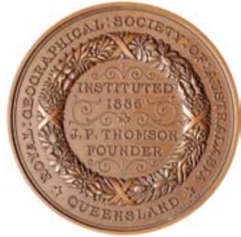
353* Royal Geographical Society Of Australasia, Queensland, Instituted 1885, James Park Thomson Medal, in bronze (45mm) (C.1885/7), by Allan Wyon. Uncirculated .