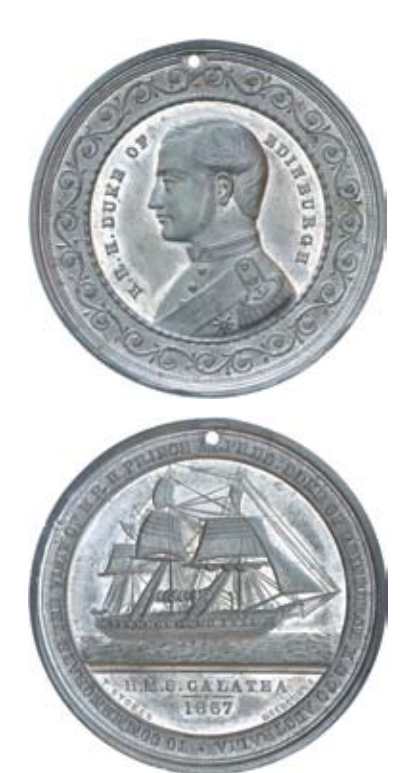
303* Visit Of The Duke Of Edinburgh, H.M.S. Galatea, 1867, in white metal (47mm) (C.1867/2), by T.Stokes, Melbourne, holed for suspension, obverse with scrolled border. Very minor edge nicks, otherwise nearly uncirculated and very rare in this condition.