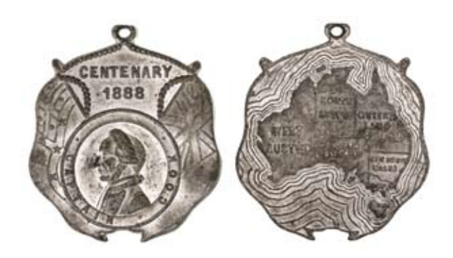
366* (Australia's) Centenary, , (1888), Captain Cook, in silvered white metal (36x36mm) (C.1888/4), no maker, ring top suspension. Extremely fine and very scarce in white metal $80