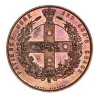
373* Exhibition Of Women's Industries, Sydney, 1888, in bronze (39mm) (C.1888/14), by Amor, Sydney. Nicely toned, much mint red, good extremely fine and very scarce in this condition.