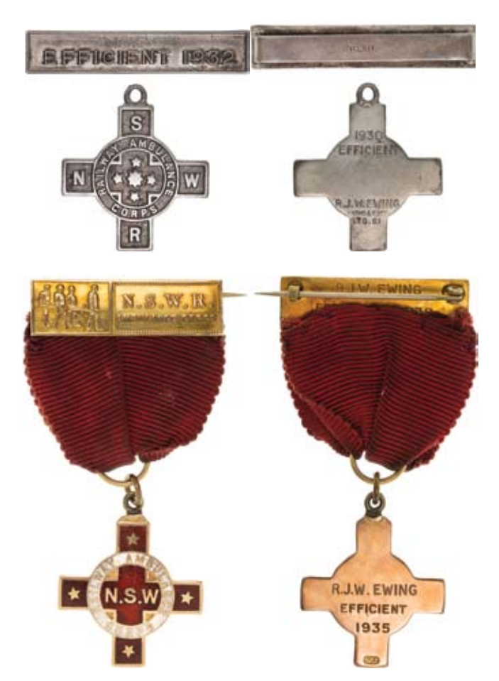
lot 527 part

The above slogan was used in 1919 for the upcoming federal election. It was also used in an appeal to women voters in the 1925 election. Then again, in 1932 the Telegraph in Brisbane, Queensland ran a slogan competition and one of the entrants submitted the slogan 'Be Rational Vote National'.