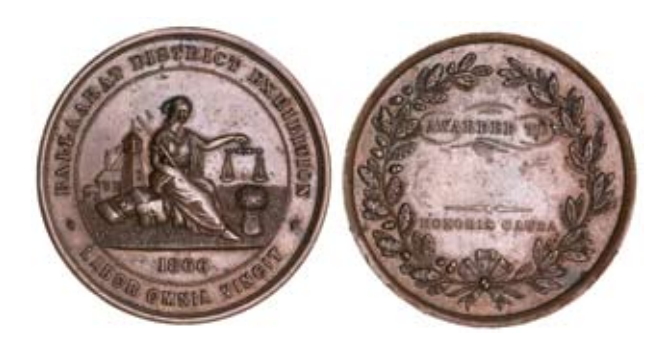
301* Ballaarat District Exhibition, 1866, in bronze (38mm), no maker, unnamed. Some spotty toning and very small edge nicks, otherwise very fine and rare. $300

Ex Noble Numismatics Sale 113 (lot 3242).