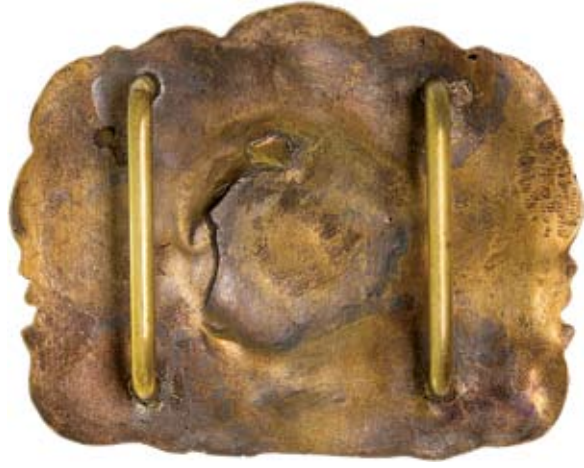
464* Advance Australia, belt buckle, post 1912, in brass (75x59mm), two belt brackets on reverse. Very fine. $100