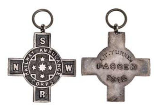
465* NSWR, Railway Ambulance Corps award cross, reverse with 'Passed 1912' in relief, in silver (36x36mm), ring top suspension, reverse inscribed, 'A.T.Turner'. Good very fine and scarce type with reverse lettering in relief.