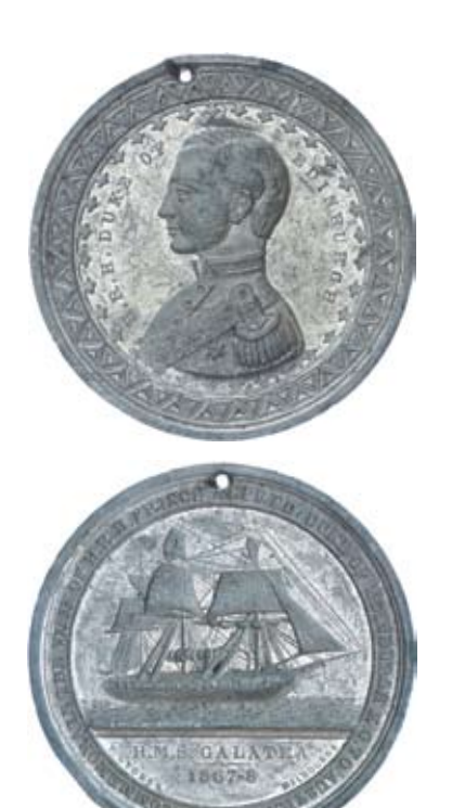
304* Visit Of The Duke Of Edinburgh, H.M.S. Galatea, 1867-8, in white metal (47mm) (C.1867-8/1), by T.Stokes, Melbourne, holed for suspension, obverse with triangular motif border. Toning and a few light scratches, otherwise very fine.