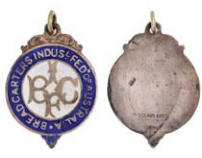
471* Breadcarters Indusl Fedn (Industrial Federation) of Australia, BCIF, badge in sterling silver and blue enamel (24x28mm) (Smith 198), by Bridgland & King, scroll and ring top suspension. Very fine .