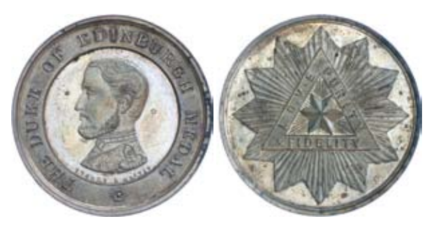
305* The Duke Of Edinburgh Medal, undated (c1867), in silvered (38mm) (C.T/3), by Stokes & Martin. Some toning and spotting, otherwise nearly extremely fine and scarce. $150