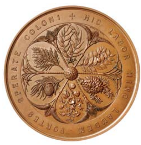
300* Exhibition Of Colonial Products, Brisbane, Queensland, 1866, in bronze (64mm), obverse by J.S.Wyon, reverse by J.S.& A.B.Wyon, Pinches die numbers 195A and 196A, unnamed as issued. Some oxidation marks on obverse, otherwise nearly uncirculated.

Ex Noble Numismatics Sale 113 (lot 3242).