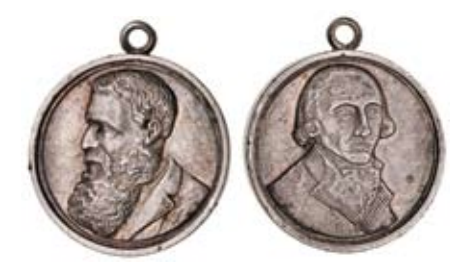
374* Sir H.B.Loch K.C.B./Arthur Phillip, undated (c1888), in silver (24mm) (unlisted in Carlisle but see C.1888/22, 22b), no maker, ring top suspension. A few small edge nicks, otherwise toned very fine and very rare.