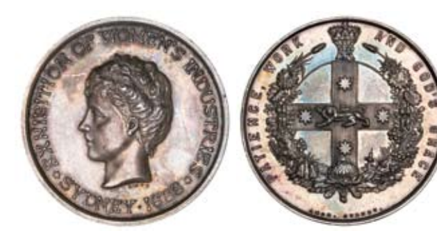
372* Exhibition Of Women's Industries, Sydney, 1888, in silver (39mm) (C.1888/14), by Amor, Sydney. Nicely toned extremely fine .