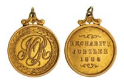
355* Rechabite Jubilee, 1885, in gold (probably 9ct; 7.72g; 22mm) (C.1885/9), by Stokes & Martin, scroll and ring top suspension, reverse, 'IOR' (Independent Order of Rechabites), only 32 issued in gold. Good very fine and rare .