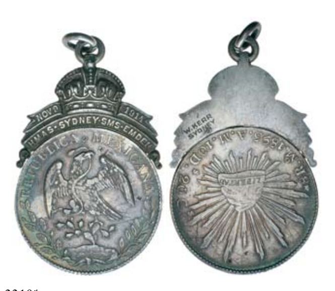
2210* HMAS Sydney - SMS Emden, Nov 9, 1914, medal by W.Kerr, Sydney (C.1914/4), with chopmarks. Good very fine . $2,500

Sydney-Emden Memorabilia (Lots 2210 - 2232)