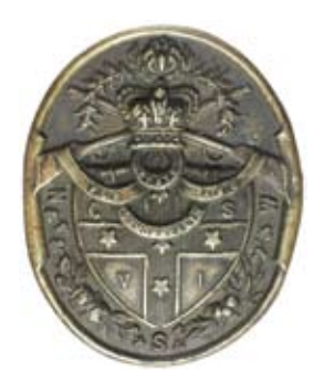
2352* NSW Civil Service Volunteer Infantry Corps, 1900-03, hat badge in white metal (42mm) (Grebert p143). Dark toned, very fine.