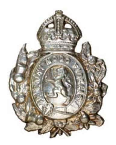
2372* 1st & 2nd NSW Scottish Regiments, 1900-12, hat badge in silver (55mm), the reverse lead filled (Cossum 18). Fine . $150