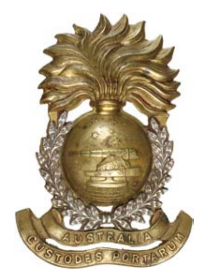
2400* Australian Garrison Artillery (Militia), 1900-12, officer's helmet plate in brass with silver wreath (70mm) (Cossum