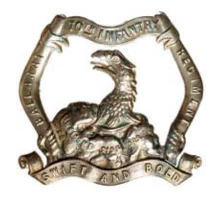
2433* 70th Infantry (Ballarat Regiment), Victoria, 1912-18, hat badge in white metal (48mm) (Cossum 143). One lug damaged and right side boomerang loose at bottom, both repairable, otherwise nearly extremely fine and rare.