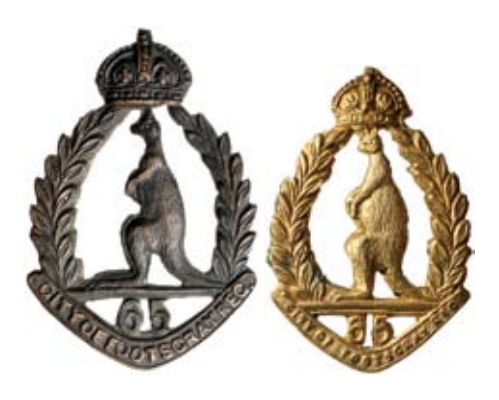
2430* 65th Infantry (City of Footscray Regiment), Victoria, 191218, hat badge in oxidised bronze (46mm), and a collar badge in gilt (41mm) (Cossum 141). Very fine - good very fine. (2)