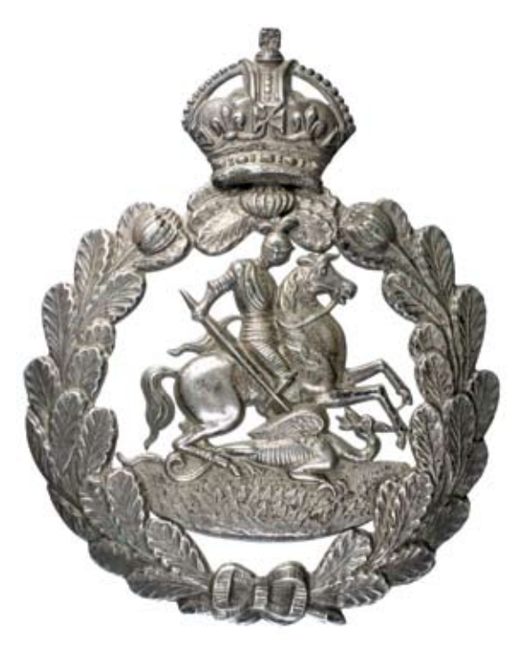
2341* New South Wales, St George's English Rifle Regiment, 1903, helmet plate in white metal (106mm) (Grebert p46). Toned good very fine and rare.