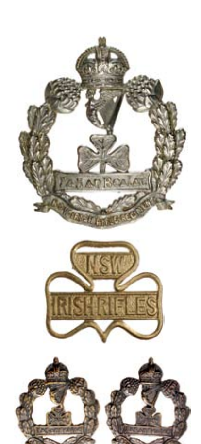
2373* NSW Irish Rifles, 1900-12, hat badge in white metal (53mm), and a pair of collar badges, one in oxidised brass and one in oxidised bronze (27mm), also a shoulder title 'NSW/IRISH RIFLES' in brass voided shamrock (Cossum 19). Very fine - extremely fine. (4) $500