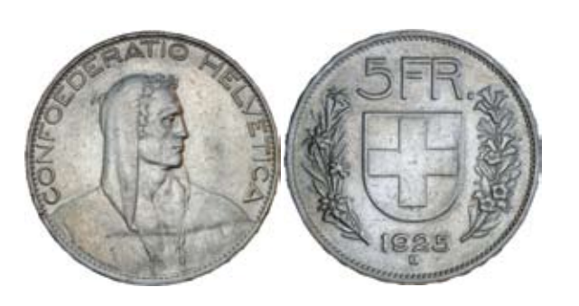
1522* Switzerland, silver five francs, 1925B (KM.38). Good very fine. $80

In a slab by NGC as AU Details, Cleaned.