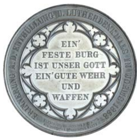
1684* Germany, Worms, Lutheran Festival in Worms, 1868, in white metal (60mm) by Chr. Schnitzspahn, Darmstadt. In card case of issue, proof-like uncirculated.