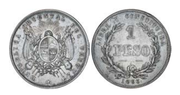
1564* Uruguay, Republic, silver peso, 1893SO, flat top 3 (KM.17a). Extremely fine.