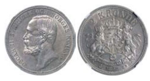
1521* Sweden, Oscar II, silver two kronur, 1897EB (KM.761). Toned, nearly extremely fine. $80

Ex D.Featherstone/L.McNaught Collection.