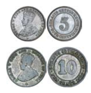
1518* Straits Settlements, George V, silver five cents, 1918 (KM.31), ten cents 1920 (KM.29a). Nearly uncirculated; very good and very scarce. (2)