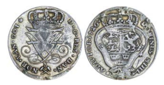
1451* Norway, Frederick IIII (of Denmark), silver four mark (krone), 1726 HCM (KM.222). Has been brooch mounted and gilt in antiquity, otherwise good fine.