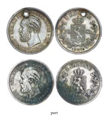
1462* Norway, Oscar II, silver krone, 1875 (KM.351), 1877, 1898 (KM.357). First two holed, otherwise extremely fine; fine; good fine. (3)