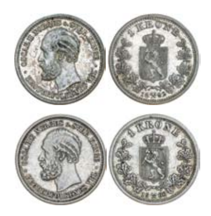
1464* Norway, Oscar II, silver krone, 1892 and 1900 (KM.357). Patchy obverse toning, otherwise good extremely fine; good very fine. (2) $300