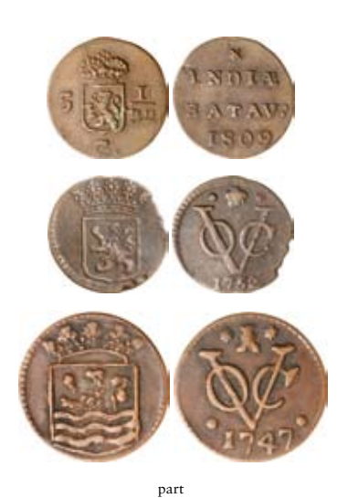
1447* Netherlands East Indies, Batavia, copper half duit, 1809 (KM.75); United East India Company, half duit 1752 (KM.72), duits 1734, 1744, 1753 (KM.70), 1747 (KM.152.2), 1791 (KM.50.2), 1790 (KM.111.1), two duit (?), 1790 (KM.111.1). Very good - very fine. (9)