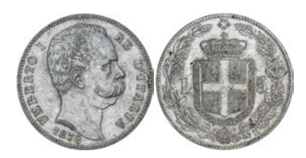
1402* Italy, Umberto I, silver five lire, 1879R (KM.20). Some original mint bloom, nearly extremely finelextremely fine and very scarce thus.