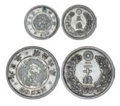
1405* Japan , Meiji, Mutsuhito, silver five sen, yr 10 (1877) (KM. Y.22); silver twenty sen, yr 6 (1873) (KM.Y24). Extremely fine ; good very fine. (2) $100

Ex D.Featherstone/L.McNaught Collection.