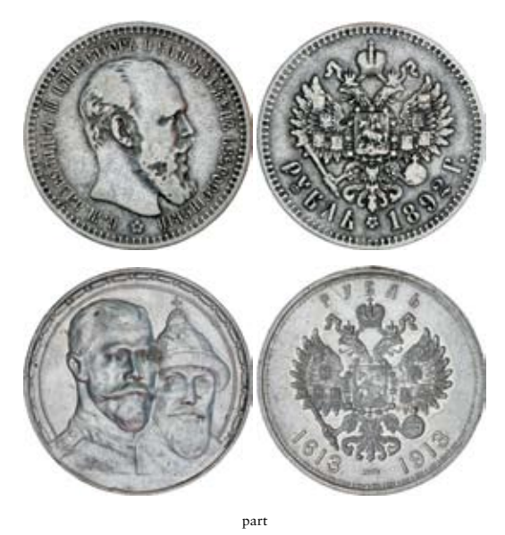
Russia, Alexander III, silver rouble, 1892 (KM.Y46); Nicholas II, silver roubles, 1898, 1899 (KM.Y59.3) and 1913 (KM.Y.70). Fine - extremely fine. (4) $350

Ex D.Featherstone/L.McNaught Collection.