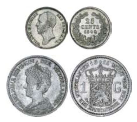
1446* Netherlands, Willem II, silver twenty five cents, 1849 (KM.76); Wilhelmina, silver one gulden, 1911 (KM.148). Extremely fine; good very fine or better. (2)