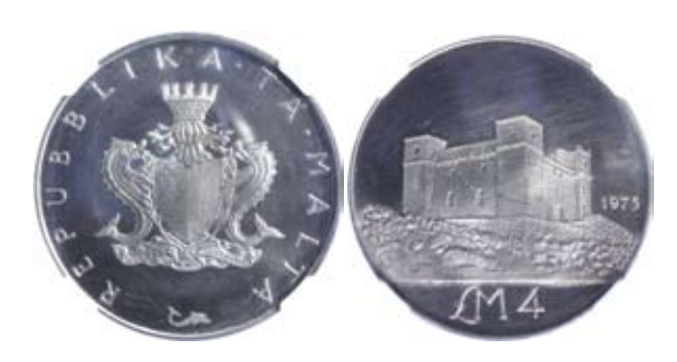
1424* Malta, silver four pounds, 1975 (KM.32). Uncirculated . $60

Ex D.Featherstone/L.McNaught Collection.