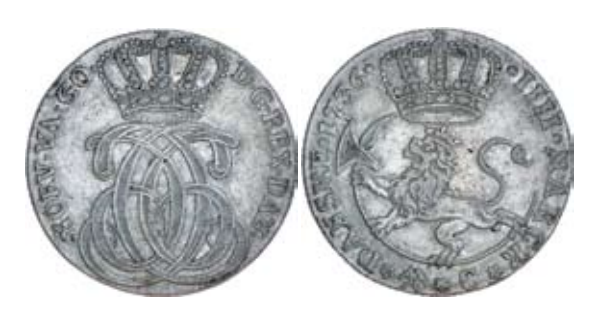
1452* Norway, Christian VI (of Denmark), silver four mark (krone) 1736C (KM.233). Very fine and rare .