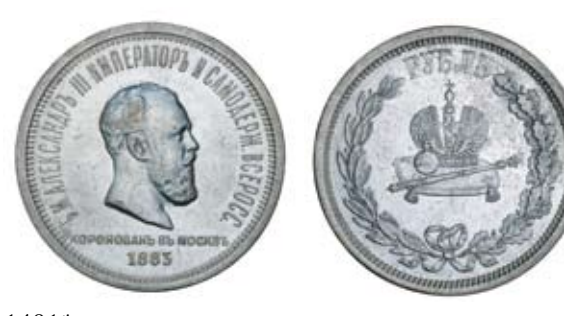
1481* Russia, Alexander III, rouble, 1883, Coronation (KM.Y.43). Extremely fine.