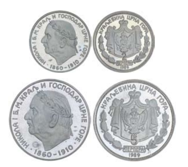
1430* Montenegro, proof silver two and five perpera 1989 (KM-). FDC . (2)