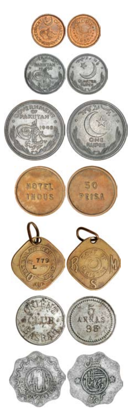
lot 1469 part

Ex D.Featherstone/L.McNaught Collection.