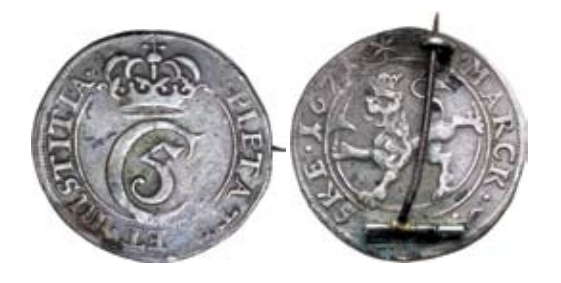
1450* Norway, Christian V (of Denmark), silver two mark, 1671 (KM.105). Heavy brooch pin mounting on the reverse, otherwise good fine and rare.