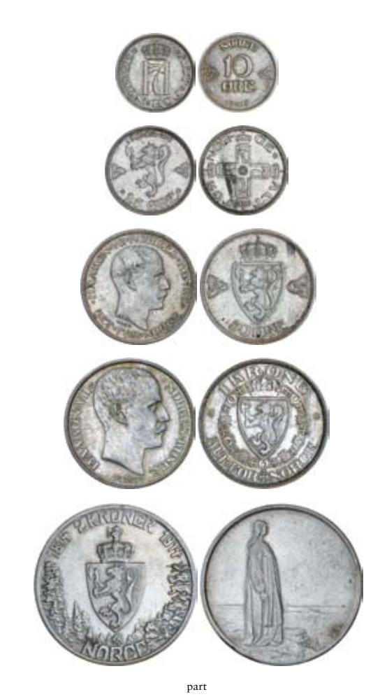
1467* Norway, Haakon VII, silver ten ore 1911, 1913 (2), 1917 (KM.372) (4), silver twenty five ore 1909, 1912, 1918 (KM.373), cupro-nickel 1921, 1922 (KM.382), 1929 (KM.384); silver fifty ore 1909 (KM.374), silver krone 1908 (KM.369), crossed hammers on shield silver two kroner, 1914 (KM.377) (2). The sixth rare in uncirculated, others very fine - good extremely fine. (14)