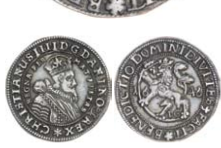
1449* Norway, Christian IIII (of Denmark) silver quarter species daler, 1646PG (Peter Gruner) (KM.10). Attractively toned very fine and very rare.