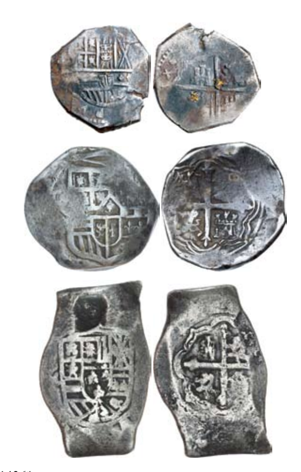
1426* Mexico, Philip V cob four reales and eight reales (round, another oblong) (2) (KM.40, 47a). Toned very good - good fine. (3)