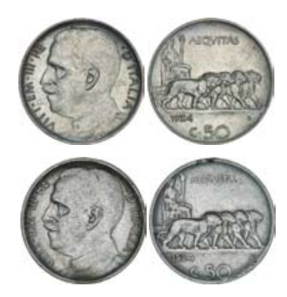
1403* Italy, Victor Emanuel III, cupro-nickel fifty centesimi, 1924R, plain edge (KM.61.1), 1924R, milled or reeded edge (KM.61.2). Extremely fine; fine, the first very rare in this condition. (2)