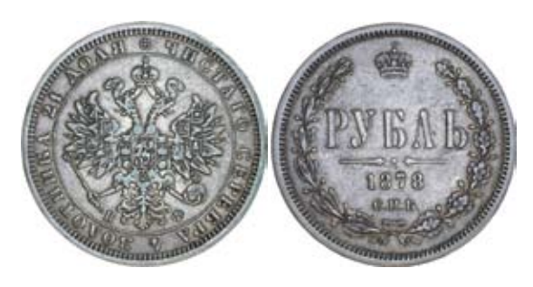
1480* Russia, Alexander II, silver rouble, 1878 (KM.Y25). Toned very fine.