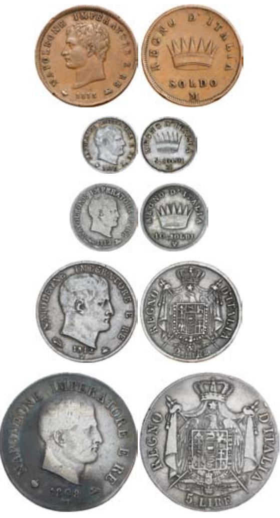
lot 1393 part