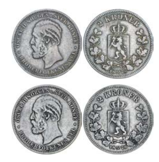
1466* Norway, Oscar II, silver two kroner, 1878 (KM.359). Toned , good fine. (2)