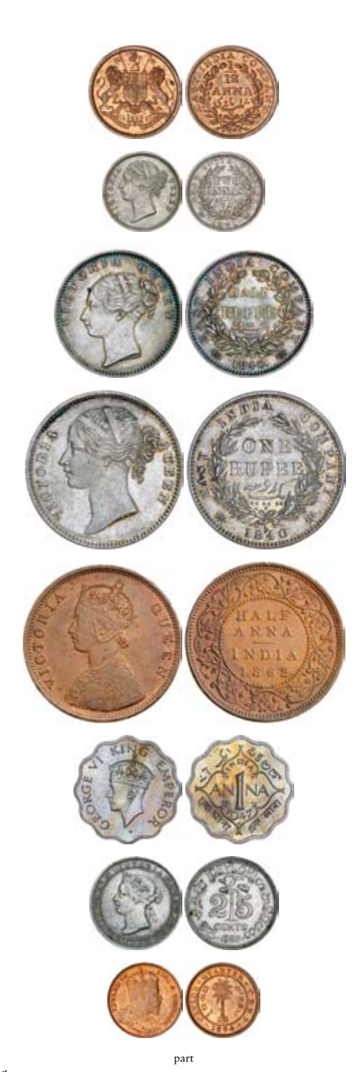
1293* India, British, EIC and Imperial, William IV - George VI, described in 2x2 holders, 1/12th annas to one rupees, noted 1919 eight annas, some better grade (illus); also Ceylon from George III, 2 stiver 1815 plated, rest 1870 on by types some better grade (illus), all in white binder album. Fine - proof FDC . (118)