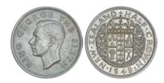
693* George VI, halfcrown, 1949. Toned, subdued original mint bloom, uncirculated and scarce thus.