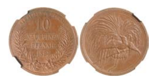
631* German New Guinea, bronze ten pfennig, 1894A. Brown patina, uncirculated. $350