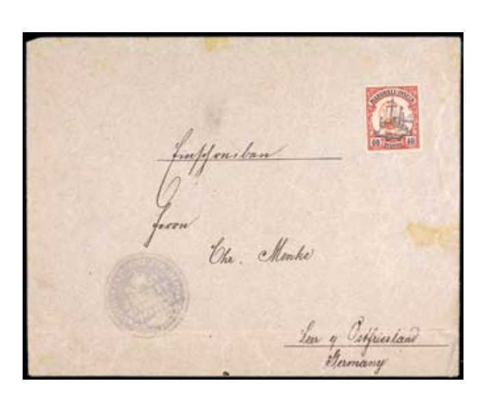
lot 828 part (next page)

Germany, including German states and Austria in a leather bound small stock book, noted 1872 issue including 5 g (Cat £140) (illustrated), Oldenburg 3g mint (SG 38, cat. £325), Hamburg 2 1/2s (SG 27 cat. £190), also Prussia, Bavaria, Hannover, Wurttemberg etc singles in all (47); a few Samoa 'yacht' type; Germany noted includes 30 pf stamp cent. (SG 1037, £90) (illustrated); 30 + 10 pf (SG 1042 1072 (illustrated), both cat.£150 each); others to 1950s, noted 5DM blue mostly in blocks of 4 (SG A135 cat £35 each); Austria, 1950 birds noted 20c eagle (7), other values (60g-20s) (set of 7, CV £475), noted other scarce issues etc. Mint and used. (approx 200)