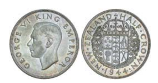
688* George VI, halfcrown, 1944. Some mint bloom, nearly extremely fine/extremely fine and scarce.