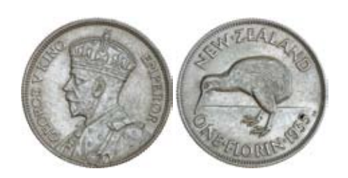
669* George V, florin, 1935. Lightly toned, good extremely fine.