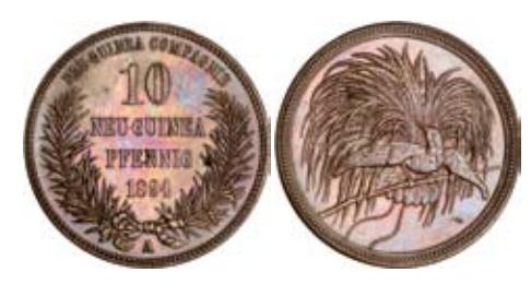
628* German New Guinea, bronze ten pfennig 1894A. Bluish red brown, nearly uncirculated. $750

Private purchase from M.R.Roberts with their ticket, with PCGS certificate as MS64BN.