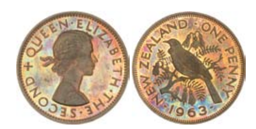
659* Elizabeth II, Royal Mint London, proof penny, 1963. Blue brown and red, FDC and extremely rare.