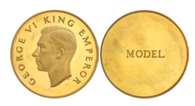
650* George VI, proof pattern or model crown, in aluminium bronze (or brass) obverse only by Hugh Paget. FDC. $1,000

Private purchase from M.R.Roberts, with their ticket.