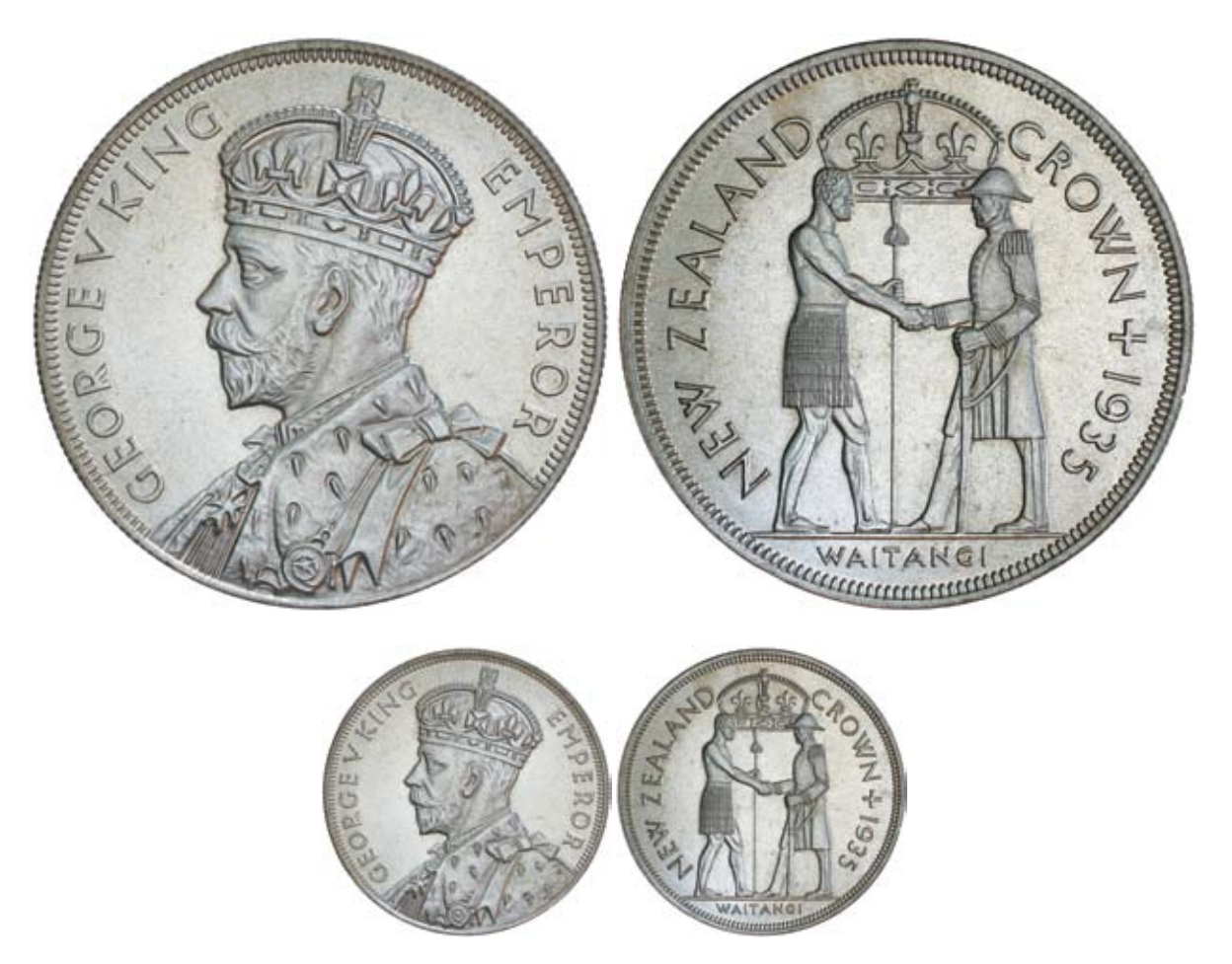
643* George V, Royal Mint London, proof Waitangi crown, 1935. Untoned, brilliant FDC and rare.