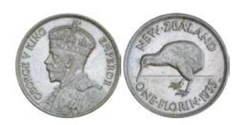
666* George V, florin, 1933. Good extremely fine/extremely fine. $100