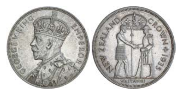
644* George V, Royal Mint London, proof-like Waitangi crown, 1935. Lightly toned, nearly FDC and rare.