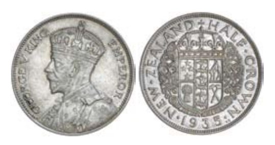
664* George V, halfcrown, 1935. Toned nearly extremely fine or better. $70