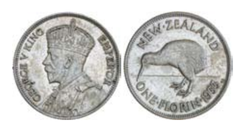
665* George V, florin, 1933. Nearly uncirculated/good extremely fine. $150