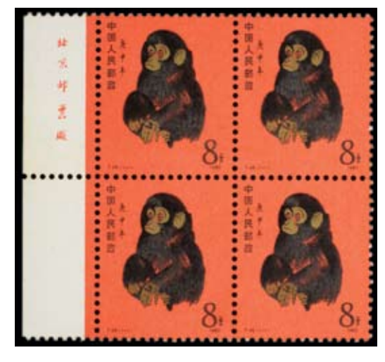
820* China, 1980, T46 Monkey stamp for New Year issue of 1980, block of 4 with side selvedge with imprint (SG 2968, Scott 1586). MUH . (4)