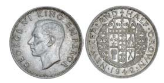
685* George VI, halfcrown, 1942. Lightly toned, nearly uncirculated.