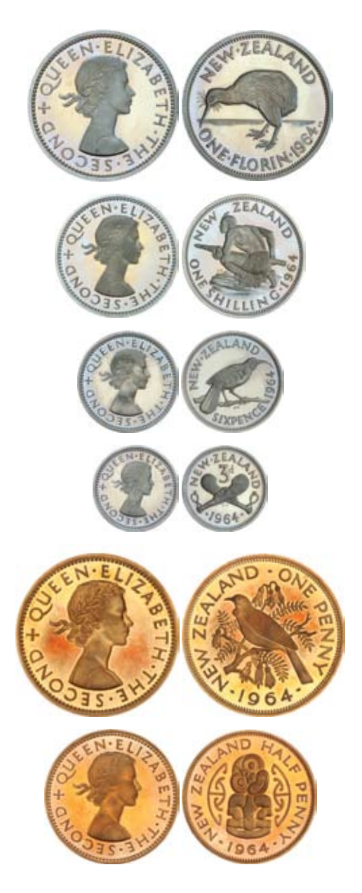
Elizabeth II, Royal Mint London, proof set, 1964, florin, shilling, sixpence, threepence, penny and halfpenny. FDC and very rare, only four sets in private hands. (6)