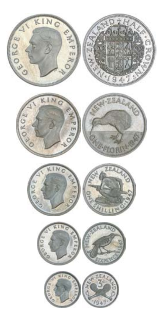
652* Elizabeth II, Royal Mint London, proof set, 1947, halfcrown, florin, shilling, sixpence and threepence. FDC and extremely rare. (5)