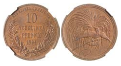
630* German New Guinea, bronze ten pfennig, 1894A. Brown and red, uncirculated. $400