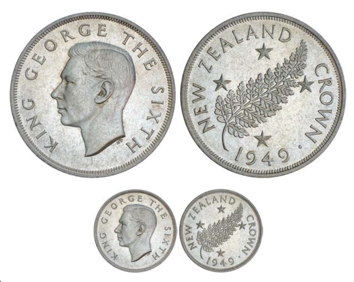
George VI, Royal Mint London, proof crown 1949. Semi frosted and brilliant FDC and extremely rare, only three or four in private hands.