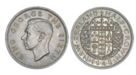
692* George VI, halfcrown, 1948. Underlying mint bloom, nearly uncirculated.