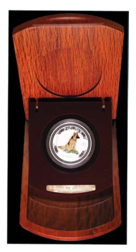
196* Elizabeth II, Perth Mint coloured specimen five ounce silver eight dollars, 2006, Year of the Dog. In case of issue, with certificate, FDC.