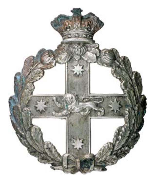
3426* NSW Military Forces, c1885, helmet plate in white metal (102mm) (Grebert p78). Some oxidation and a few bends on cross, otherwise good fine.