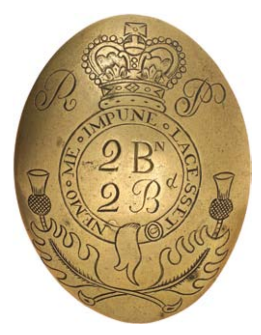
3461* 2nd Battalion, 2nd Brigade Royal Perthshire Militia, c1800, cross belt plate in brass (62x83mm). Good very fine and scarce in this condition.

This badge was issued to promote the above League that encouraged all photographers to produce images of soldiers' loved ones at home.