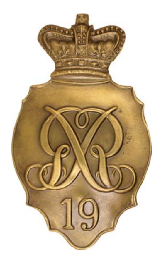
3462* George III 19th British Regiment of Foot, Belgic shako plate, c1812, in brass (76x130mm), reverse stamped, 'B O/1804'. Good very fine.