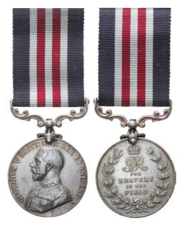
3316* Military Medal (GVR). 3548 Pte H.H.Slogget 2/Aust Pnr. Bn. Fine.