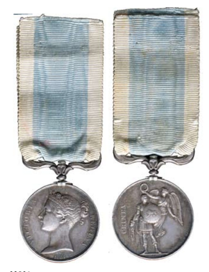
3293* Crimea Medal 1854. Unnamed. Ribbon faded, toned, nearly extremely fine.