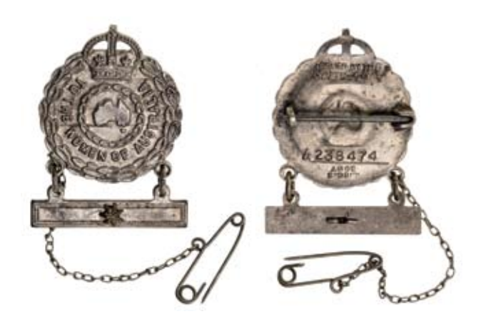
3414* Australia, Female Relative badge WWII, with one star, reverse numbered A238474, by Amor, Sydney, pin-back with safety chain. Extremely fine .