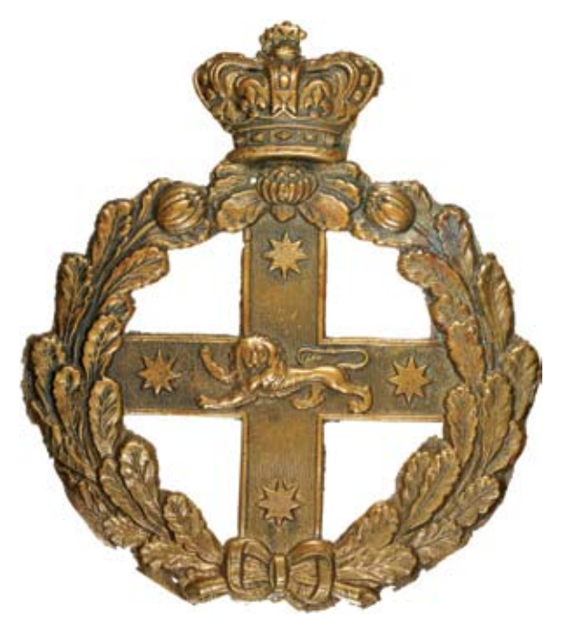
3427* NSW Military Forces, c1885, helmet plate in cast bronze (103mm) (Grebert p78), missing lugs. Fine . $100