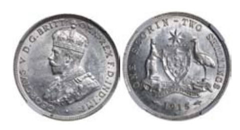
1088* George V, 1915H. Nearly uncirculated.