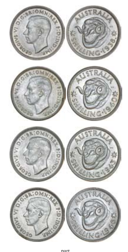
1125* George VI, 1938, 1940, 1943, 1944, 1946, 1946 dot (Perth). Nearly all with full original frosty mint bloom, uncirculated or better. (6)