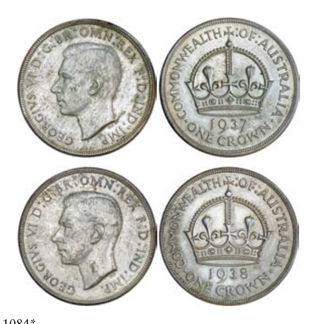
George VI, 1937 and 1938. Extremely fine or better. (2) $150