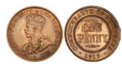
1166* George V, 1915. Traces of mint red, good extremely fine or nearly uncirculated and rare in this condition.