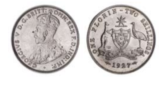
1092* George V, 1927. Peripheral die break along base of the date, full pearl-like mint bloom, minor obverse contact marks, otherwise choice uncirculated.

Ex A.H.Baldwin 1978, Spink Australia and an IAG sale. In a slab as MS65+.