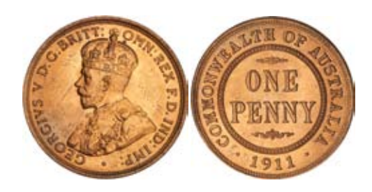
1162* George V, 1911. Full original mint red uncirculated.