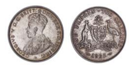
1099* George V, 1935. Obverse peripheral gold toning, reverse dark golden brown around highlights, unmarked surfaces, choice uncirculated and one of the finest known. $1,200