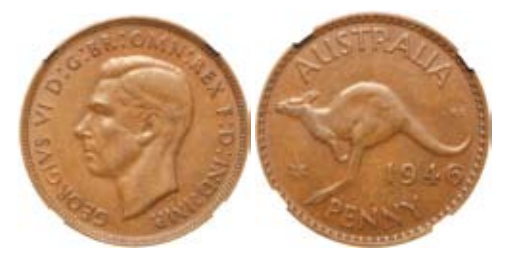
1189* George VI, 1946. Good extremely fine.