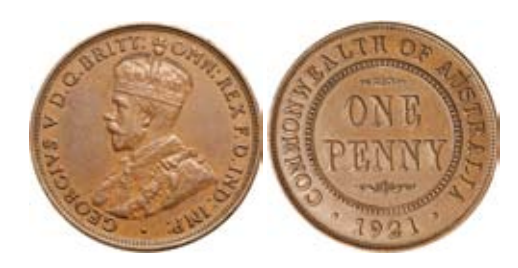
1175* George V, 1921, Indian die. Obverse rim nicks, otherwise good extremely fine. $120