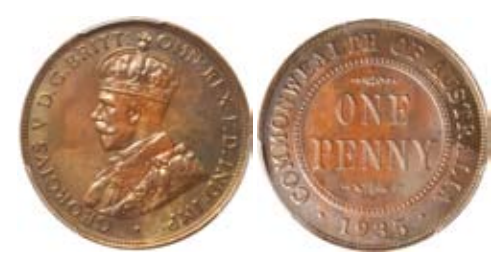
1056* George V, Melbourne Mint proof penny, 1935. Blue brown toning over brilliant fields, nearly FDC.