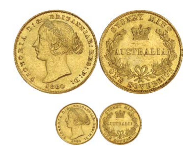
962* Queen Victoria, second type, 1860. Reverse rim filing, otherwise good extremely fine and very rare in this condition. $4,500