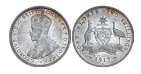
1090\ensuremath{^{*}} George V, 1917M. Nearly extremely fine.