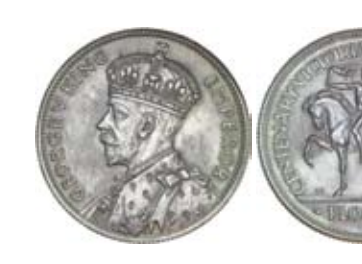
1098* George V, 1934-35 Melbourne Centenary. Light grey matte tone, nearly uncirculated. $300