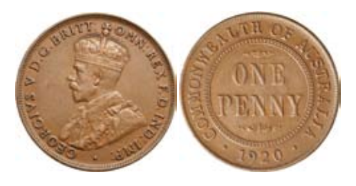
1172* George V, 1920 plain, Indian die. Good very fine and rare thus.