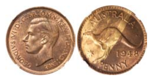
1190* George VI, 1948. Mint red uncirculated.