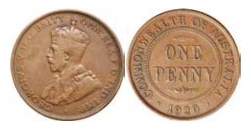
1173* George V, 1920 dot below, London die. Fine/good fine and rare . $100