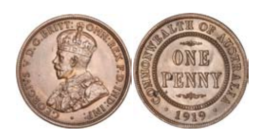
1171* George V, 1919. Grey brown uncirculated.