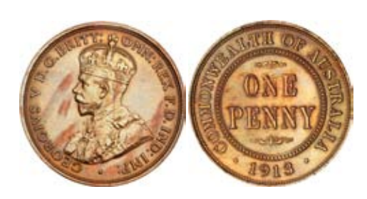
1165* George V, 1913. Cleaned and a little rubbed, otherwise good extremely fine. $200