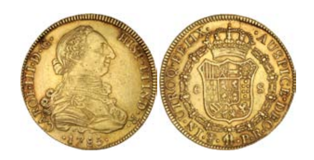
944* Bolivia, Charles III, gold eight escudos, 1785 P.R., Potosi Mint (KM.59). Toning, good very fine .