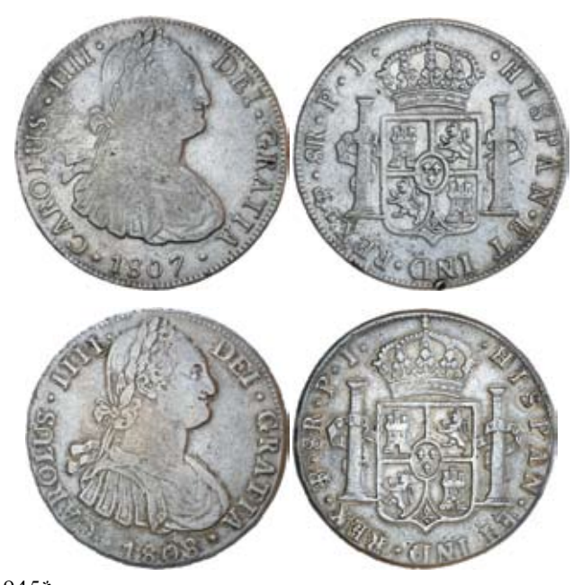
945* Bolivia, Charles IIII, silver eight reales, 1807 P.J., 1808 P.J., Potosi Mint (KM.73). Nearly very fine. (2) $200