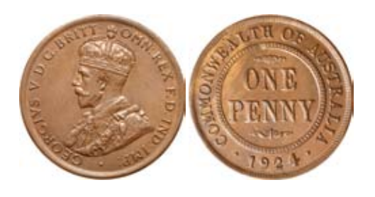
1177* George V, 1924 London die. Peripheral die breaks, die clash above scroll on inner circle, attractive glossy red brown uncirculated. $320