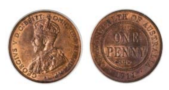
1163* George V, 1911. Red and brown, uncirculated.