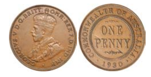
1185* George V, 1930 Indian die. Barely noticeable flaw diagonally in the reverse field, even brown patina, nearly eight pearls, full band and centre diamond, good very fine and rare, one of the finest fifteen known.