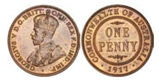
1169* George V, 1917I. Red and brown uncirculated.