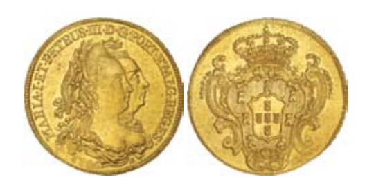
946* Brazil, Maria and Peter, gold 6,400 reis or half Johanna, 1785R (Rio) (14.21g) (KM.199.2). Nearly extremely fine extremely fine.