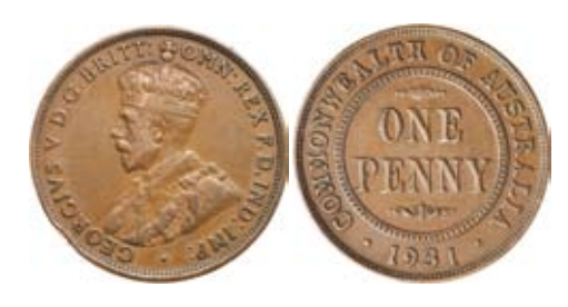
1186* George V, 1931 dropped 1 Indian die. Contact marks in reverse fields, partial scuffing on part of King's face and crown, clear six pearls, very fine and very rare. $1,250

Sold with an International Auction Galleries letter of authenticity, undated but believed to be 1987, as research.