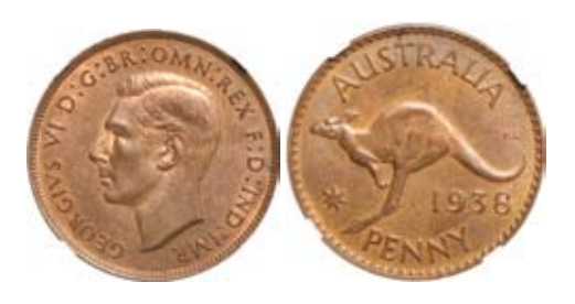
1188* George VI, 1938. Mint red, uncirculated.