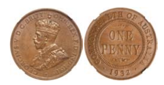
1187* George V, 1932. Glossy brown, uncirculated.