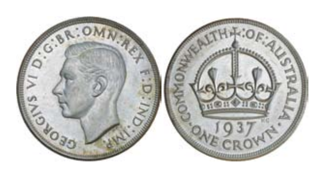
1083* George VI, 1937. Well struck, unmarked semi mirror-like fields, dot die marker midway between right of crown and letter I, uncirculated.