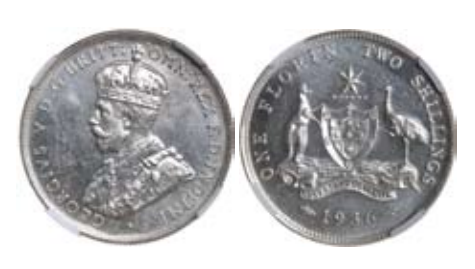
1100* George V, 1936. Mirror-like fields, uncirculated. $200 In a slab by NGC as MS 62.