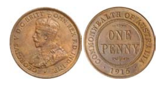
1167* George V, 1915H. Brown and red, nearly uncirculated and rare thus.