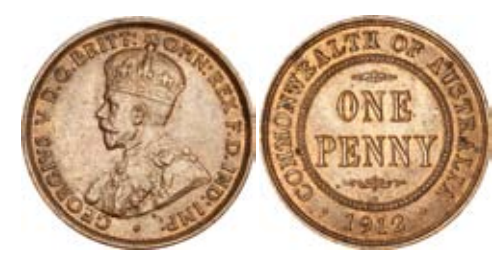
1164* George V, 1912H. Brown with some red, nearly uncirculated. $280