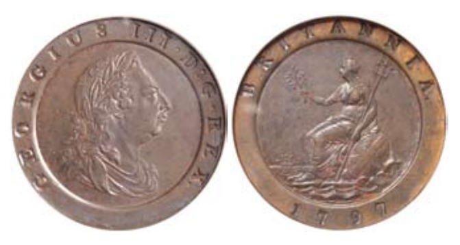
949* Great Britain, George III, copper cartwheel twopence, 1797 (S.3776). Attractive brown tone, nearly uncirculated. $350