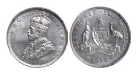
1101* George V, 1936. Uncirculated. $200 In a slab by NGC as MS 62.