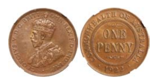
1176* George V, 1922. Brown, nearly uncirculated. $100