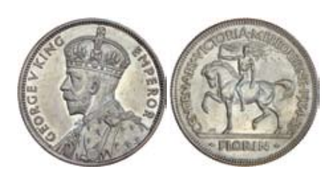
1096* George V, 1934-35 Melbourne Centenary. Sharp wreath and nipple (flaw) heavily brushed to clean, otherwise extremely fine.