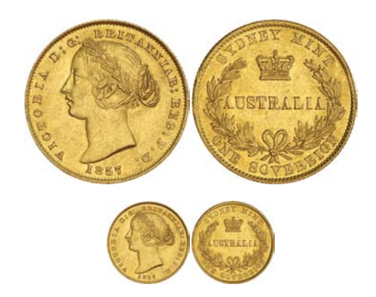
961* Queen Victoria, second type, with wreathed head left by L.C.Wyon, 1857. Good extremely fine and rare in this condition. $3,500