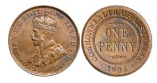
1058* George V, Melbourne Mint proof penny, 1935. Purple brown toned, nearly FDC and rare. $1,500