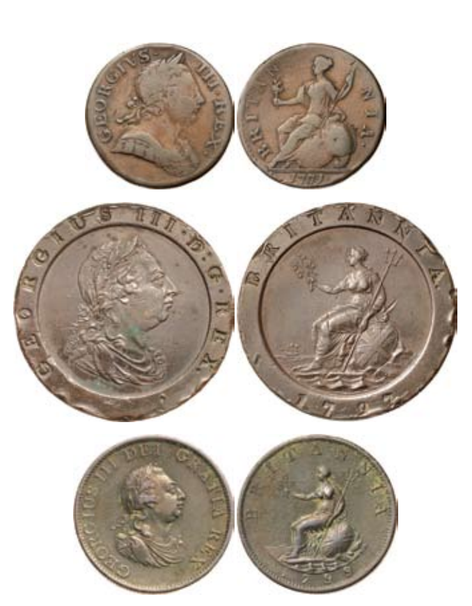
lot 813 part