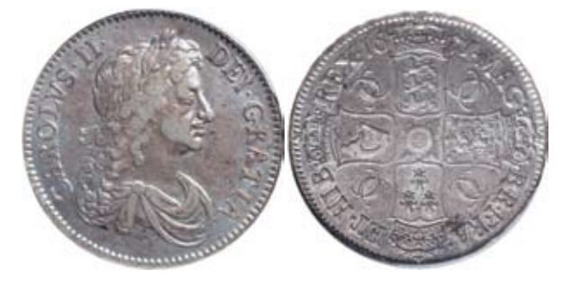
786* Charles II, crown, third bust, 1671, tertio (S.3358; ESC 43). Light uneven toning, very fine.