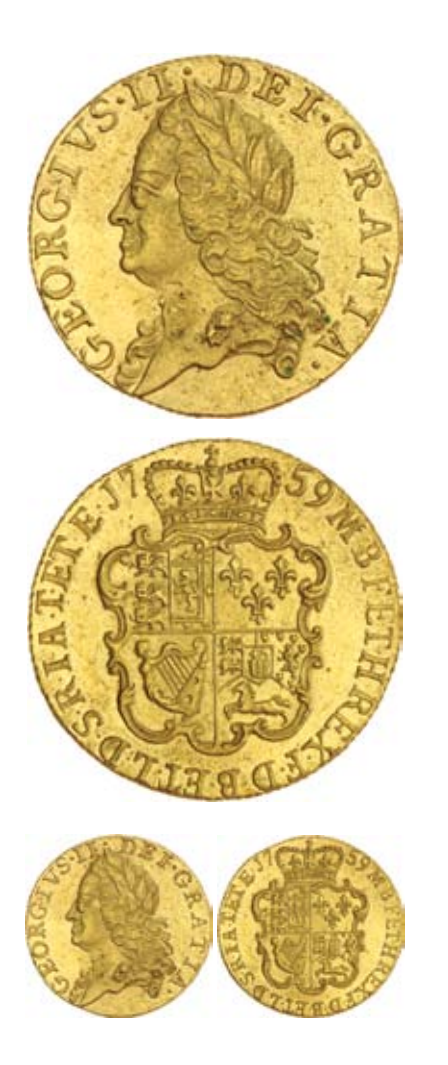
George II , old head, guinea, 1759 (S.3680). Considerable original mint bloom, nearly uncirculated and rare thus. $3,000

Ex Noble Numismatics Sale 112 (lot 2224).