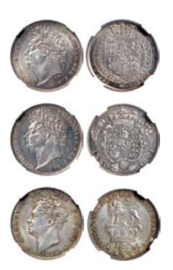
George IV, sixpences, 1821 (S.3813), 1825 (S.3814) and 1828 (S.3815). Uncirculated. (3)