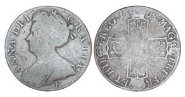
lot 797 part