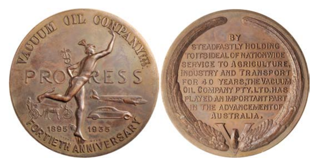
573* Vacuum Oil Company Fortieth Anniversary, 1935, in bronze (69mm) (C.1935/7), by Stokes, Melb. Toned good extremely fine and rare as not listed in this metal by Carlisle.