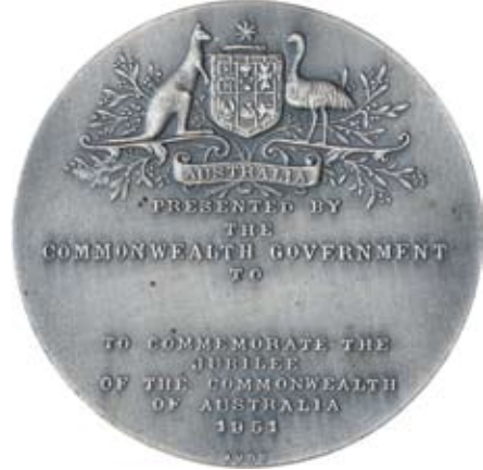
592* Jubilee of the Commonwealth of Australia, 1951, in silvered (57mm) (C.1951/7), by Amor, unnamed. Some small spotting, otherwise good very fine.