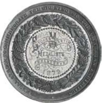
448* Commemorating The Opening Of The Victorian Exhibition, 1872, in white metal (47mm) (C.1872/3), by Stokes & Martin, Melbourne. Toned, a few small nicks, otherwise nearly extremely fine.