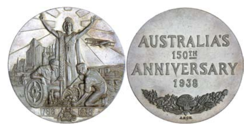
580* Australia's 150th Anniversary, 1938, in silver (51mm) (C.1938/17), by Amor. Hairlines, otherwise nearly uncirculated and scarce in silver.