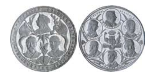
516* The Australian Commonwealth, Inaugurated Jan.1.1901, in aluminium (30mm) (C.1901/57), by A.H.W. (A.H.Wittenbach), Melb. Some edge nicks, otherwise nearly uncirculated and scarce.