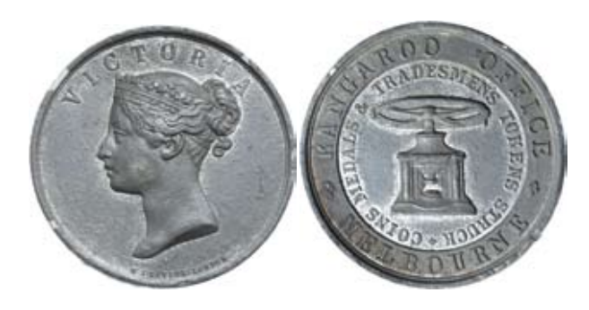
446* Kangaroo Office, Melbourne, in white metal (38mm) (C.V/2), by W.J.Taylor, London. Small edge nicks and dark toning, otherwise very fine and very rare.