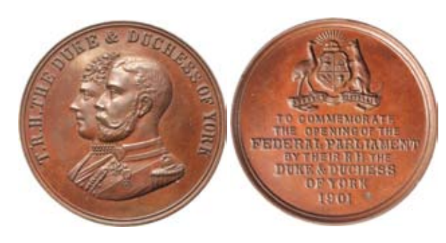
514* Opening of the Federal Parliament by Their R.H. The Duke & Duchess of York, 1901, in bronze (39mm) (C.1901/43). Minor edge nick, proof-like appearance, nearly uncirculated and scarce.