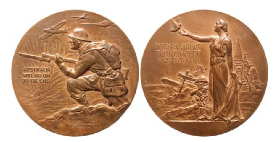
584* Australia Will Go On To The End, undated version, in bronze (57mm) (C.1940/1), by Amor. Traces of mint red, nearly uncirculated and rare.