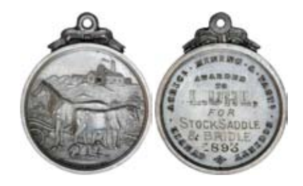
497* Gympie Agricl (Agricultural) Mining & Pastl (Pastoral) Society, in silver (25mm), by Wittenbach & Co, ribbon top suspension, reverse inscribed, 'L.Uhl,/For/Stock Saddle/& Bridle/1893'. Uncirculated .