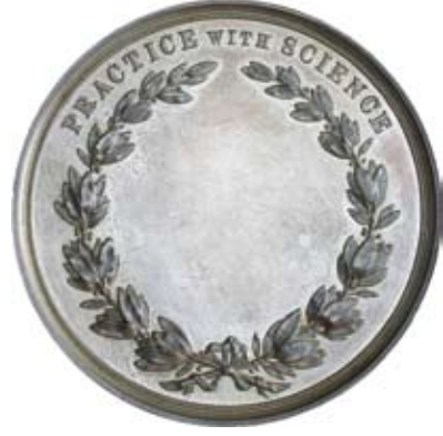
450* Agricultural Society Of New South Wales, in silver (51mm), by Hardy Brothers, Sydney, unnamed. Small impressed mark on edge near top, some hairlines, otherwise toned nearly uncirculated.