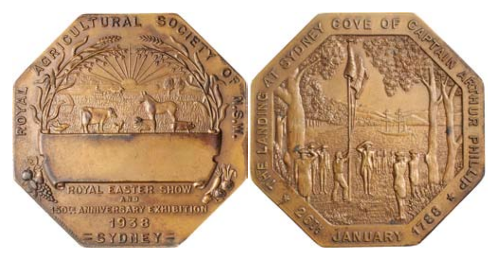
579* Royal Agricultural Society Of N.S.W., Royal Easter Show and 150th Anniversary Exhibition, Sydney, 1938, in bronze (hexagonal 63x63mm) (C.1938/15), by Stokes, Melb., unnamed. Toned, nearly uncirculated and scarce.