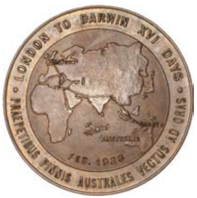
557* Bert Hinkler, Airman, Bundaberg, Queensland, in bronze (51mm) (C.1928/1). Dark toned, otherwise extremely fine. $250