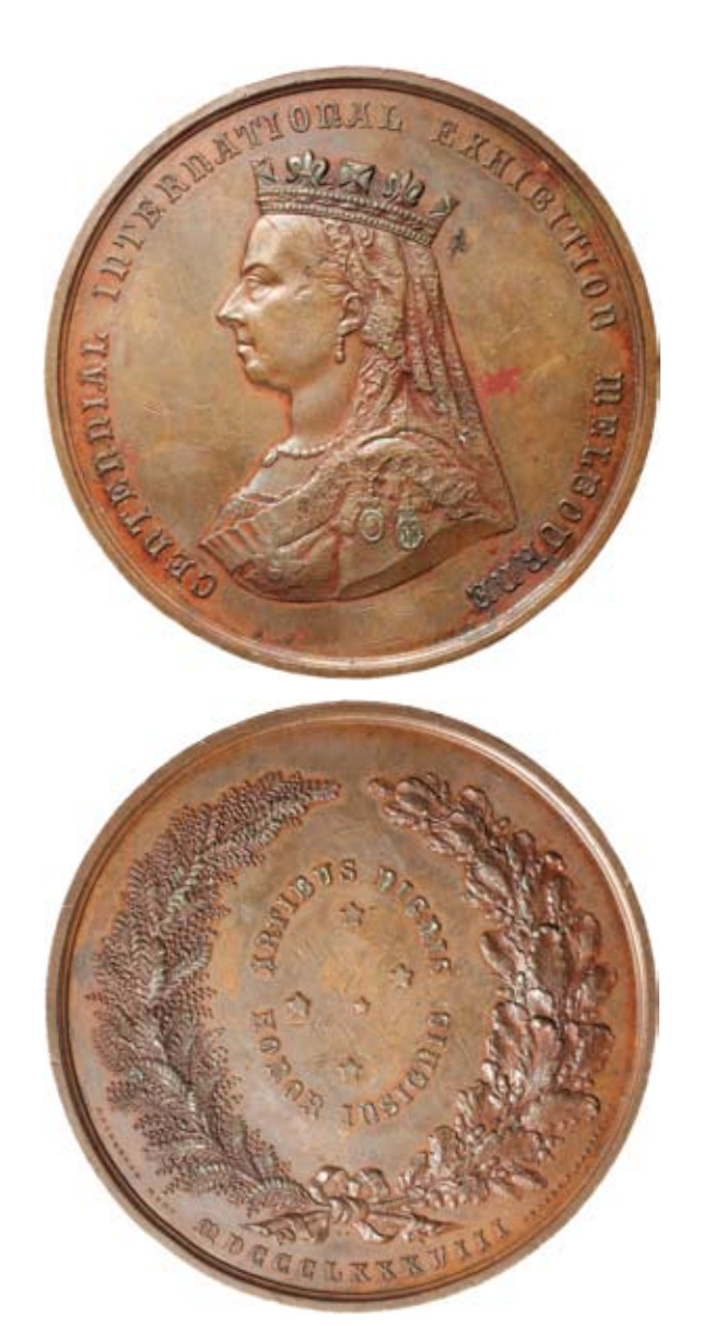
485* Centennial International Exhibition, Melbourne, 1888, in bronze (76mm) by Melbourne Mint & Stokes & Martin, impressed around edge 'A.Galli and Co'. Obverse and reverse with cut marks, otherwise very good.

A.Galli and Co, Wine Merchants at 190 Bourke St, Melbourne. Awarded the bronze medal for Red Hermitage (1882), pg 1075 in the Official Record of the Exhibition.