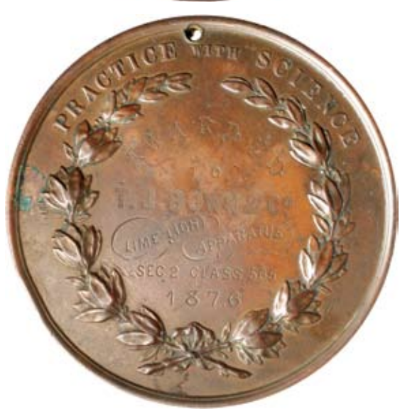
449* Agricultural Society Of New South Wales, in bronze (89mm), by Hardy Brothers, London & Sydney, reverse inscribed, 'Awarded /To/T.J.Brown & Co./Lime Light/Apparatus/Sec.2. Class 565/1876'. Pierced hole at top, edge bumps and small nicks, some oxidation spots, otherwise very fine.