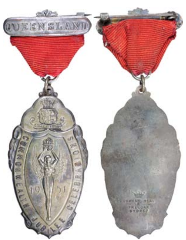
593* Commonwealth Jubilee Celebrations, 1951, in silvered (36x64mm) (C.1951/1), by Denham, Neal & Treloar, Sydney, ring top suspension with ribbon and brooch bar, 'Queensland'. Ribbon aged, bend in bar, toned, otherwise very fine.