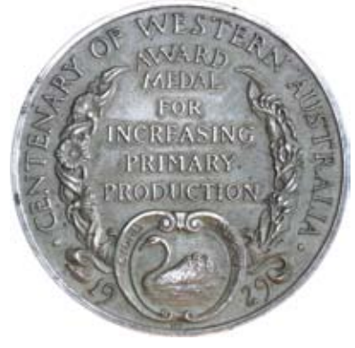
558* Centenary of Western Australia, 1929, in silver (51mm; 71g), George V by Sir E.B.MacKennal, For Increasing Primary Production (C.1929/1), by Perth Mint. Nearly extremely fine and rare.