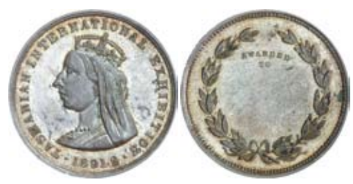
493* Tasmanian International Exhibition, 1891-2, in silver (32mm) (C.1891-2/4) variety with 'Awarded/To' on reverse, unnamed. Toned good very fine .