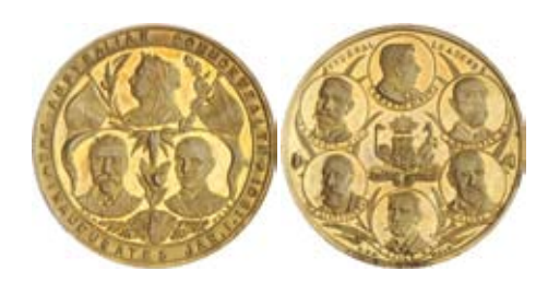
515* The Australian Commonwealth, Inaugurated Jan. 1.1901, in gilt silver (30mm) (C.1901/57), by A.H.W. (A.H.Wittenbach), Melb. Nearly uncirculated and scarce.