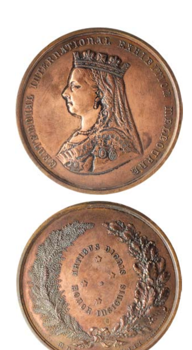
486* Centennial International Exhibition Melbourne, 1888, in bronze (76mm) (C.1888/8), by Stokes & Martin, edge impressed, 'H.E.Liardet'. Cleaned, otherwise very fine. $100

A.Galli and Co, Wine Merchants at 190 Bourke St, Melbourne. Awarded the bronze medal for Red Hermitage (1882), pg 1075 in the Official Record of the Exhibition.