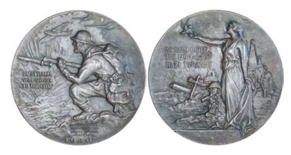
583* Australia Will Go On To The End, 1940, in silver (57mm) (C.1940/1), by Amor. Toned, extremely fine and rare.