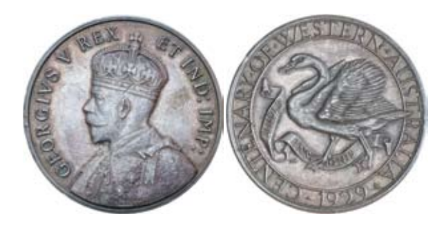
559* Centenary Of Western Australia, 1929, in silver (38mm) (C.1929/2), reverse by K.G (Kruger Gray) for Perth Mint. A few minor edge nicks, toned, extremely fine.