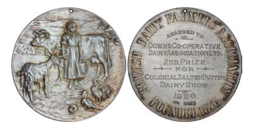
575* British Dairy Farmers' Association, Founded 1876, award medal in silver (51mm), by MnWb (Mappin & Webb, London), reverse inscribed, 'Awarded To/Downs Co-operative/Dairy Association Ltd./2nd Prize/For/Colonial Salted Butter/Dairy Show/1936'. With small hole at top, extremely fine and scarce.