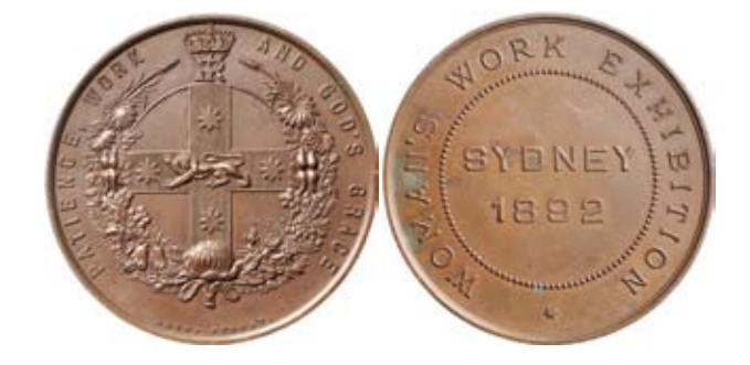
495* Woman's Work Exhibition, Sydney, 1892, in bronze (39mm) (C.1892/3), by Amor, Sydney. A few oxidation spots on obverse, otherwise toned extremely fine and scarce.