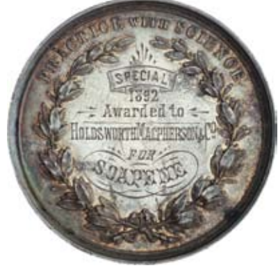
494* Agricultural Society Of New South Wales, in silver (51mm), by Hardy Brothers, Sydney, reverse inscribed, 'Special/1892/ Awarded to/Holdsworth Macpherson & Co./For/Soapene'. Edge nicks, otherwise toned very fine.