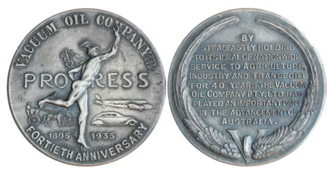
574* Vacuum Oil Company Fortieth Anniversary, 1935, in silvered (69mm) (C.1935/7), by Stokes, Melb. A few very small edge nicks, some marks on obverse, otherwise toned good very fine. $100