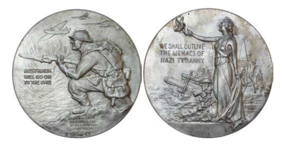
582* Australia Will Go On To The End, 1940, in silver (57mm) (C.1940/1), by Amor, edge inscribed 'MS1' (Manufacturers Strike Number 1). Uncirculated and rare .