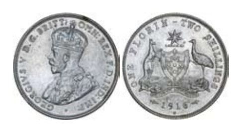
269* George V, 1916M. Extremely fine.

In a slab by NGC as UNC Details, Cleaned.