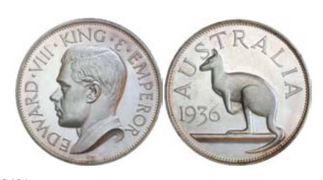
242* Edward VIII, 1936, fantasy by Pinches for G.Hearn. FDC . $100