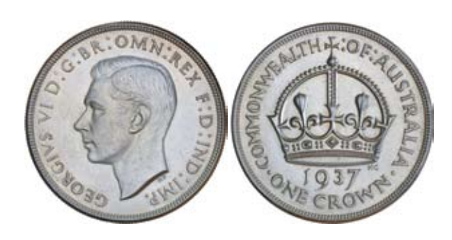
243* George VI, 1937. Nearly uncirculated.