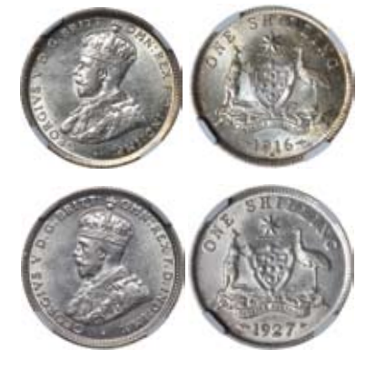
305* George V, 1916M, 1927. Virtually uncirculated; nearly uncirculated. (2) $300