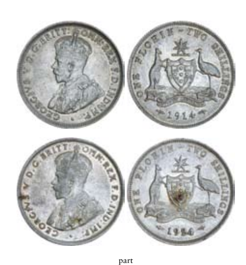
264* George V, 1914 (2), 1924 and 1927. very fine. (4)

In slabs by NGC as Au Details Cleaned; MS 61, respectively.