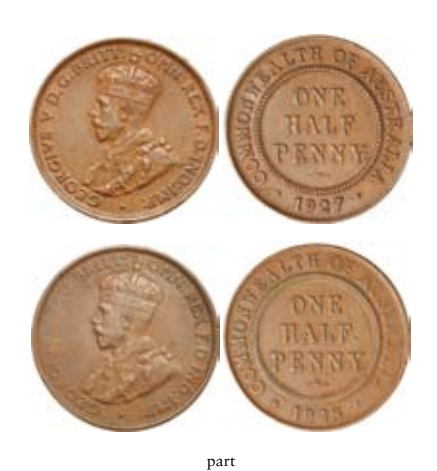
George V, 1926, 1927, 1928 dot after HALF (illus). Extremely fine/good extremely fine; good extremely fine; good extremely fine; very fine. (4)