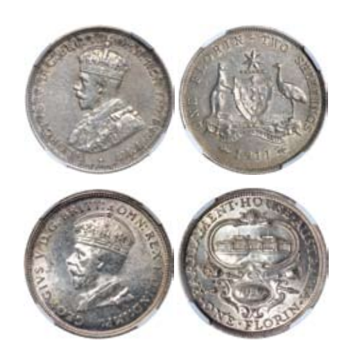
263* George V, 1911 and 1927 Canberra. Cleaned nearly uncirculated; uncirculated. (2) $300

In slabs by NGC as Au Details Cleaned; MS 61, respectively.