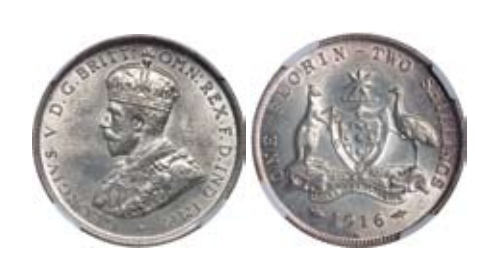
268* George V, 1916M. Cleaned otherwise, nearly uncirculated. $100

In a slab by NGC as UNC Details, Cleaned.