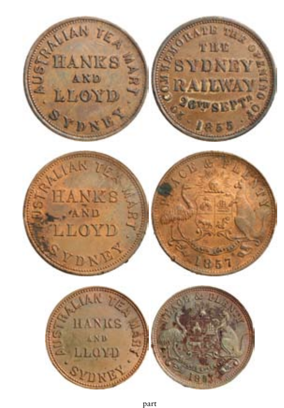
411* Hanks and Lloyd, Sydney pennies and halfpennies, 1855 and 1857 (A.188, 189, 190, 193 (2)). Some corrosion, otherwise very fine - extremely fine. (5)