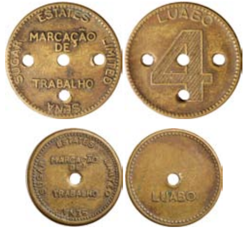
3300* South Africa , Mozambique, Luabo, Sen Sugar Estates Limited, value 4 units (31mm) (Hern 506e), one unit (Hern 510a). Very fine. (2)

Ex Mark E.Freehill Collection, from D.Allen at Status(?) with his holders.