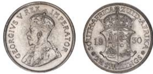
3294* South Africa, George V, 2 1/2 shillings, 1930 (KM.19.2). Considerable mint bloom, nearly uncirculated.