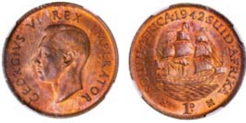
3296* South Africa , George VI, penny, 1942 (KM.25). Red and brown uncirculated.