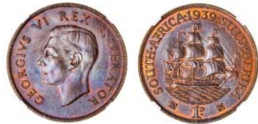
3295* South Africa, George VI, penny, 1939 (KM.25). Brown and red, uncirculated.