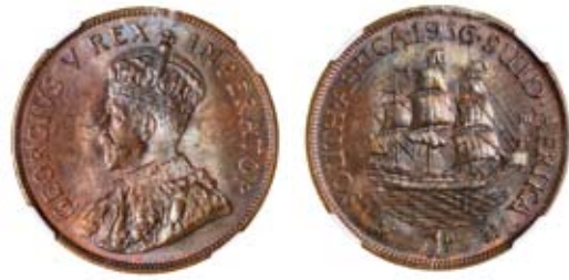
3293* South Africa, George V, penny, 1936 (KM.14.3). Full brown and grey mint bloom, uncirculated.