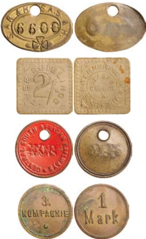
lot 3310 part