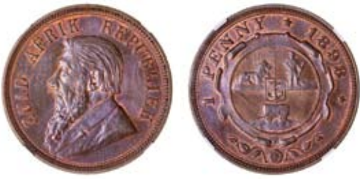
3289* South Africa, ZAR, Paul Kruger, penny, 1898 (KM.2). Brown and red, uncirculated.