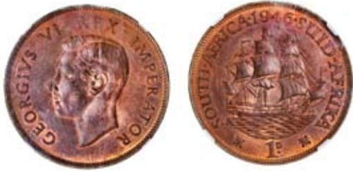
3297* South Africa , George VI, penny, 1946 (KM.25). Red and brown uncirculated.