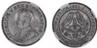
3291* South Africa, George V, 1/4 penny, 1931 (KM.12.2). Dark blue grey patina, full mint bloom; choice uncirculated.

In a slab by NGC as MS62. Ex Bakewell Collection.