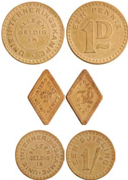
3299* South Africa , in general, Union Internment Camps tokens for one penny, threepence and one shilling in fibre (1941) (T.SA4, Hem 606e, 606g, 606h). Good very fine. (3)