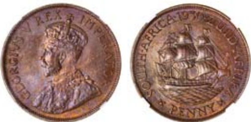
3292* South Africa, George V, penny, 1930 (KM.14.2). Red blue brown mint bloom uncirculated.