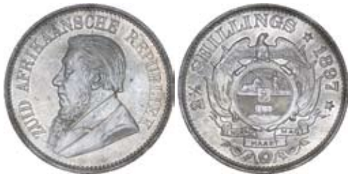
3290* South Africa, ZAR, Paul Kruger, two and a half shillings, 1897 (KM.7). Extremely fine.

In a slab by NGC as MS66BN. Ex Bakewell Collection.