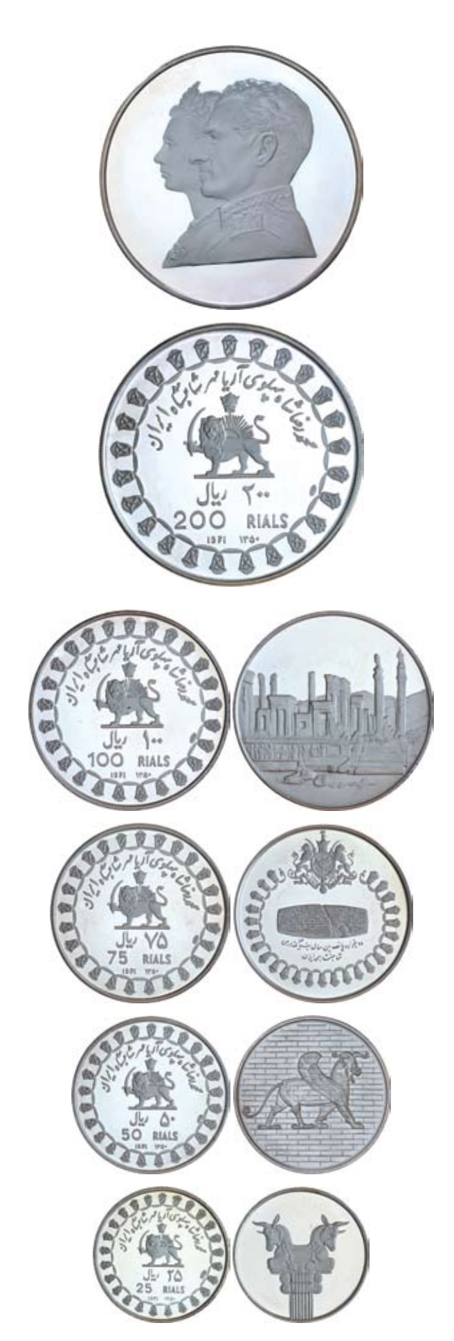
3175* Iran, Muhammad Reza, five coin silver proof set, 1971 (KM. PS3). In wallet of issue, FDC.