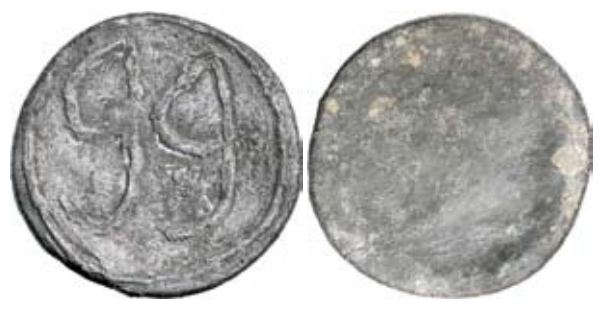
lot 3211 part