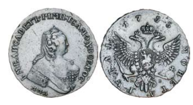
3272* Russia, Elizabeth, silver rouble 1755 MMA (KM.C19C.1). Cleaned and polished, otherwise very fine.