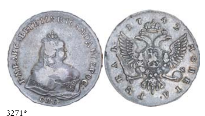
Russia, Elizabeth, silver rouble, 1742, St Petersburg Mint (Dav.1677; KM.C.19b.3). Toned nearly very fine/very fine. $200