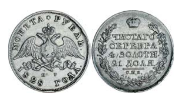
3273* Russia, Nicholas I, silver rouble, 1828 (KM.C.161). Cleaned very fine.