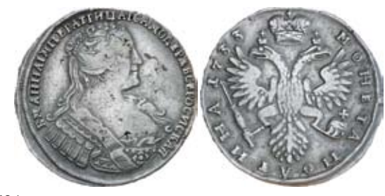
3269* Russia, Anna, silver half rouble or poltina, 1733, Moscow Mint (KM.195). Nearly very fine/very fine.