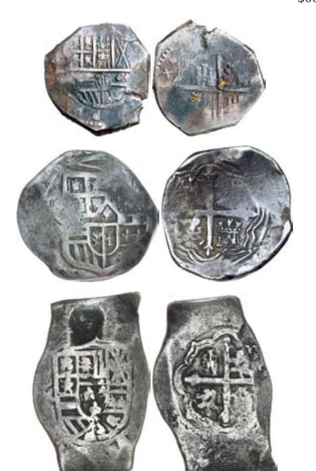
3217* Mexico, Philip V cob four reales and eight reales (round, another oblong) (2) (KM.40, 47a). Toned very good - good fine. (3)