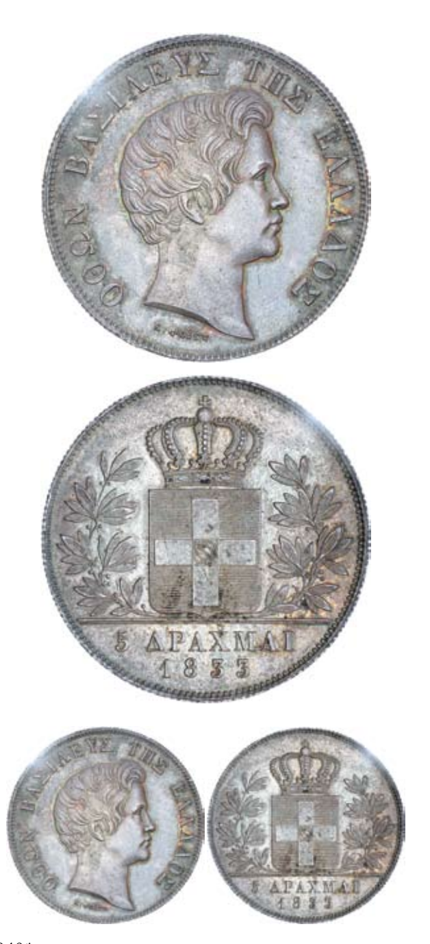
3040* Greece, Othon, five drachma, 1833 (KM.20). Attractive grey and gold iridescent patina, underlying brilliance on the obverse, uncirculated and very rare in this condition, one of the finest known.