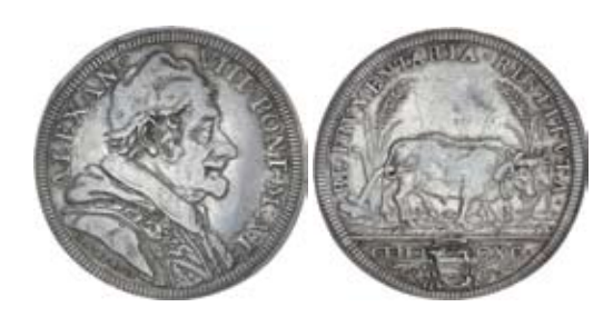
3180* Italy, Papal States, Alexander VIII, silver testone, 1690 (CNI p.472, 27; KM.528). Toned good very fine .

Ex Dr L.J.Sherwin Collection, from I.S.Wright Sale 78 (lot 6614) 11.3.93.