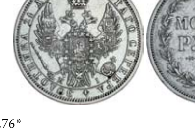
3276* Russia, Nicholas I, silver rouble 1854 (KM.C.168.1). Cleaned very fine. $150