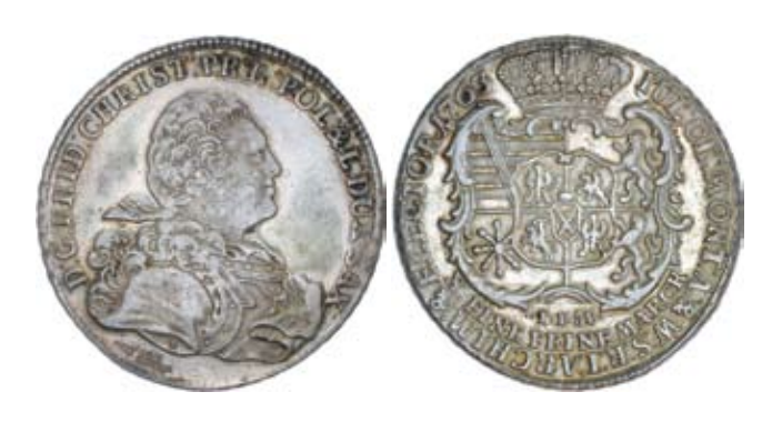
3017* Germany, Saxony, Friedrich Christian, silver thaler, 1763 (KM.962; Dav.2677). Toned, good very fine.