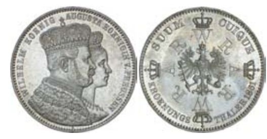
3007* Germany, Prussia, Wilhelm II, thaler 1861A (KM.488). Uncirculated .