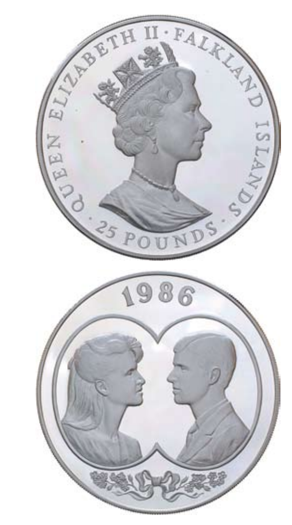
3001* Falkland Islands, proof sterling silver commemorative twenty five pounds, 1986. In cases of issue, FDC. (2)

Ex R.J.Ford (lot 420) collection and Simmons Sale 10 (lot 434 part), ex Noble Numismatics Sale 61 (lot 1717) and Mark E.Freehill collection.