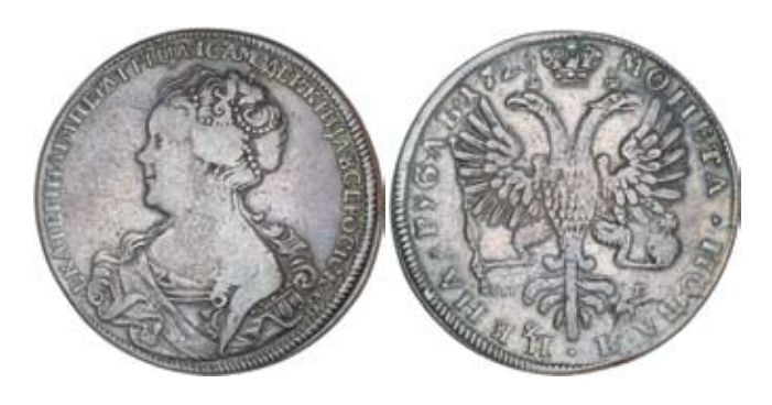
Russia, Catherine I, silver rouble, 1726, St. Petersburg (KM.168; Dav.1664; Sev.825 et seq). Fine/good fine.