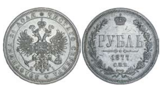
3278* Russia, Alexander II, silver rouble 1877 cnb (KM.Y.25). Cleaned very fine. $100