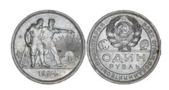
Russia, USSR, rouble, 1924 (KM.90). Mint lustre, very small edge nick, otherwise nearly uncirculated. $100