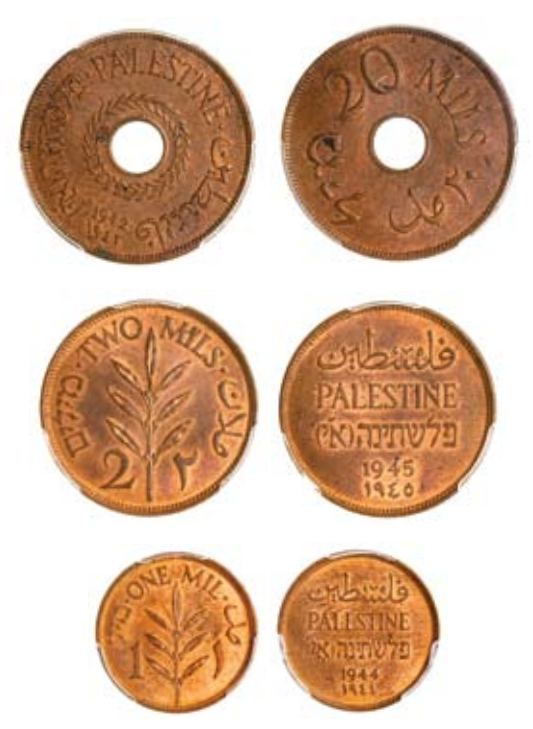
3254* Palestine, one mil, 1944 (KM.1) (PCGS MS64RD); two mils, 1945 (KM.2) (PCGS MS63RB); twenty mils, 1942 (KM.5a) (PCGS MS62BN). Uncirculated . (3)