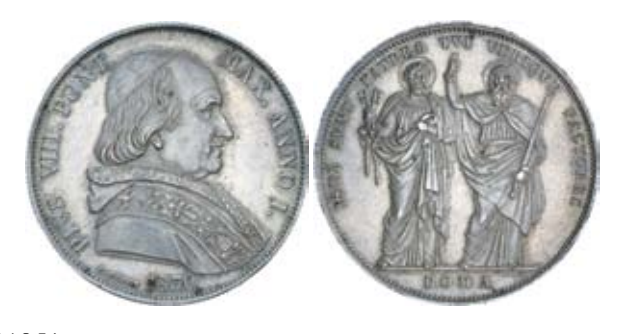
3185* Italy, Vatican, Pius VIII, silver scudo, 1830, Rome (KM.1310). Toned good extremely fine. $200

Ex Dr L.J.Sherwin Collection, from CNG E-sale 200 (lot 916).