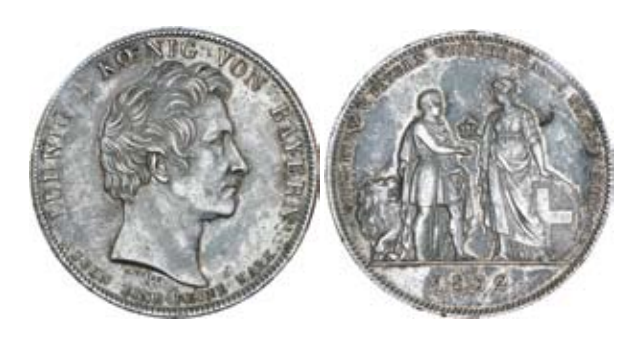
3004* Germany, Bavaria, Ludwig, thaler 1832, Prince Otto, first king of Greece (KM.761). Patchy toning, nearly extremely fine.