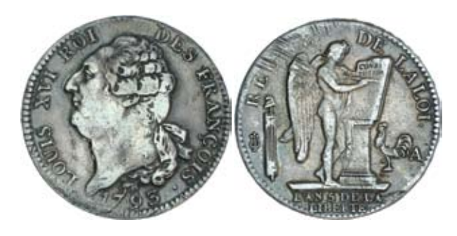
3003* France, Louis XVI, ecu d'argent, 1793A (KM.615.1). Adjustement marks at 10 o'clock on the reverse, toned very fine.