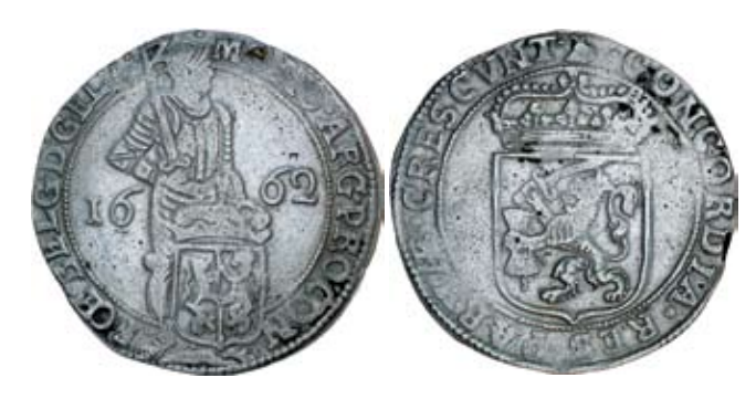
3245* Netherlands, Gelderland, ducaton, 1662 (KM.41.1). Good fine .