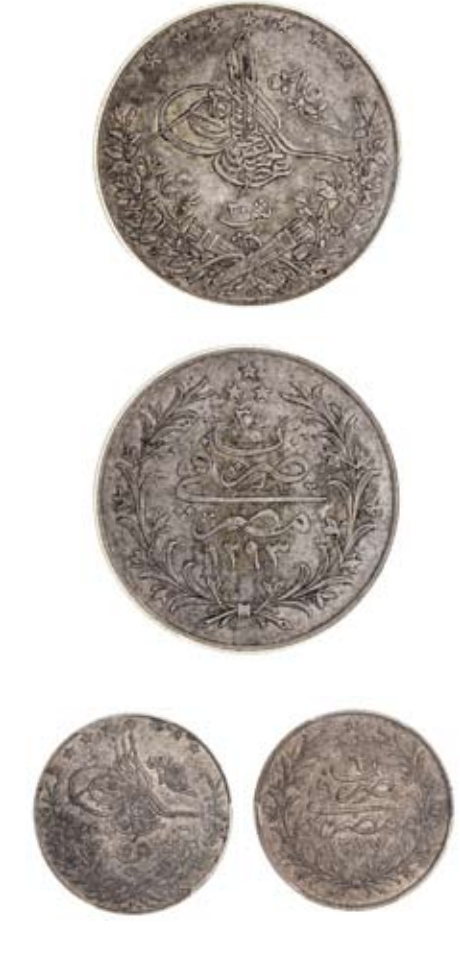
2997* Egypt, five qirsh, AH1327/6 (KM.308) (PCGS MS62); twenty Qirsh, 1293/30 AH1293/33 (KM.296) (PCGS XF45). Extremely fine - uncirculated. (2)