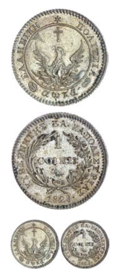
3037* Greece, Republic, one phoenix 1828 (KM.4). Some spotting, subdued original golden mint bloom, uncirculated and very rare in this condition.