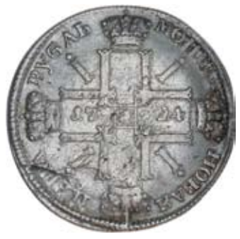
3265* Russia , Peter I, silver rouble, 1724, St. Petersburg (KM.166.1). Good very fine/nearly very fine.