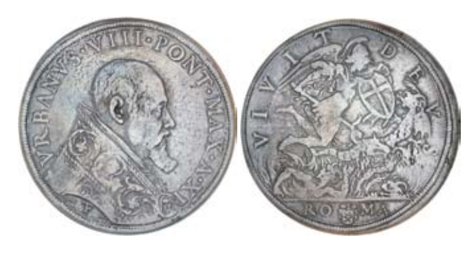
3183* Italy, Papal States, Urban VIII, silver piastre, undated, yr XI (KM.178; Dav.4055; Berman 1712). Good fine .

Ex Dr L.J.Sherwin Collection, from Noble Numismatics sale 57 (lot 1992), with old ticket.