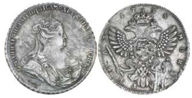
3270* Russia , Anna, silver rouble, 1738, St. Petersburg (KM.204). Heavy spade marks on reverse, otherwise good very fine. $200

Ex Dr L.J.Sherwin Collection, from Noble Numismatics Sale 74 (lot 3638).