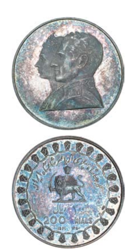
3176* Iran, Mohammad Reza l