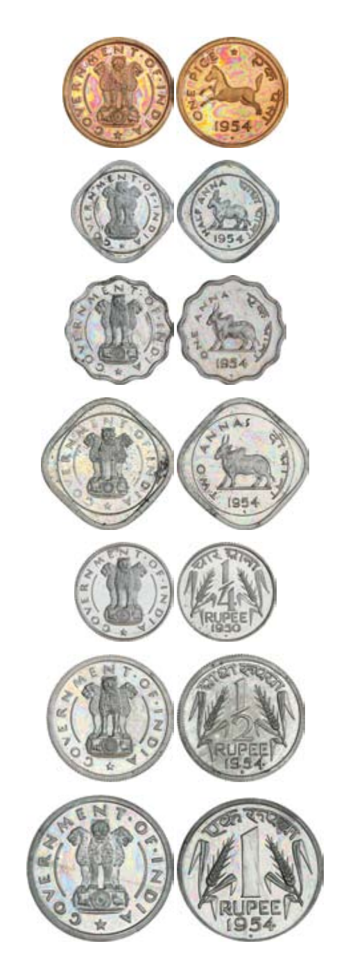
3125* India, Republic, standard coinage, Bombay Mint, proof set, one pice to one rupee, 1954 (KM.PS2). Virtually FDC . (7) $1,500