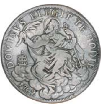
3182* Italy, Papacy, Clement XI, silver scudo 1702 Rome (KM.665; Dav.1430). Evenly worn, very good.