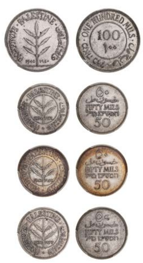
3255* Palestine, fifty mils, 1933, 1934 & 1942 (KM.6) (PCGS AU55; PCGS AU58; PCGS AU58); one hundred mils, 1940 (KM.7) (PCGS MS63). Good extremely fine - uncirculated. (4)