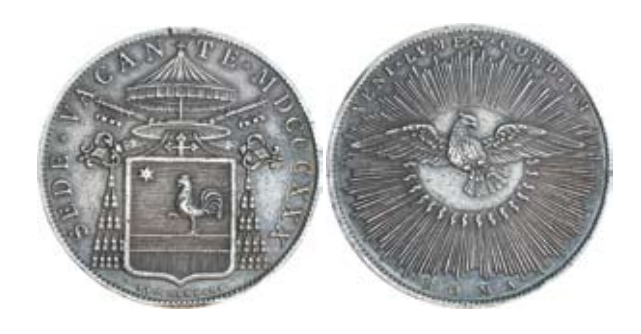
3184* Italy, Vatican, Sede Vacante silver scudo, 1830 Rome (KM.1311). Toned extremely fine.

Ex Dr L.J.Sherwin Collection, from Noble Numismatics sale 57 (lot 1992), with old ticket.