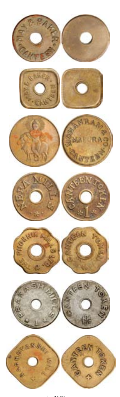
lot 3159 part