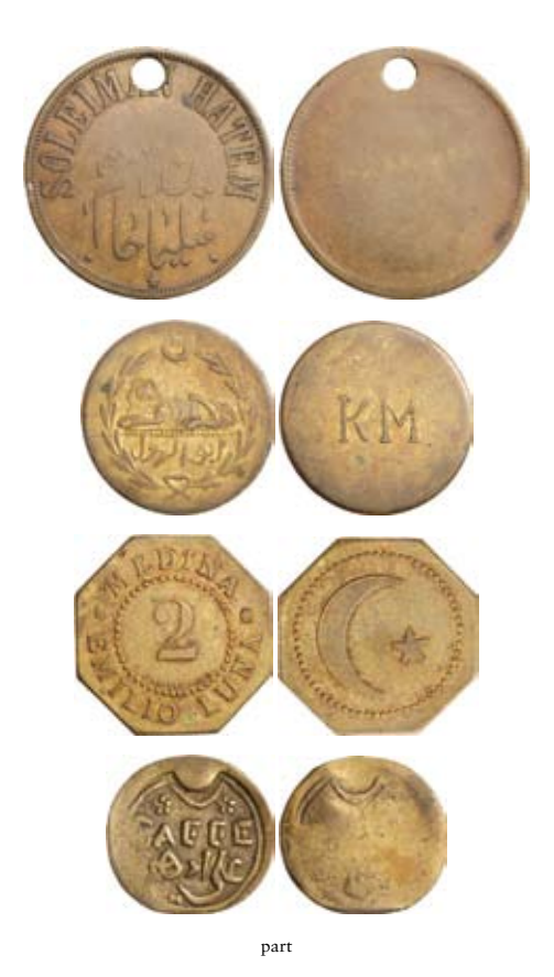
Egypt, Caf Bar Emad El Din/I in brass (26mm); New Caf Bar Bourse C.D. in centre/1 in brass (26mm); Fantasio Garden, G.Demetriades uniface in brass (25mm); Soleiman Hatem, uniface in brass (30mm) holed at top (illus); Sphinx/KM in brass (23mm)(cf Ford lot 449 reverse crown)(illus); Medina, Emilio Luna around 2 signed A Popert Paris, octagonal in brass (23mm)(illus); Caffe in brass (20mm)(illus); Shampoo Diva (A.H. 1330) in brass (20mm) another no English legend in brass (16mm); Musee Egyptian in aluminium (22mm). Fair - very fine some rare. (10)