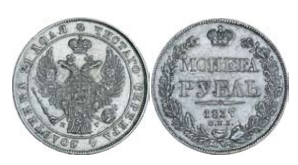
3275* Russia, Nicholas I, silver rouble 1837 (KM.C.168.1). Good very fine/very fine. $180