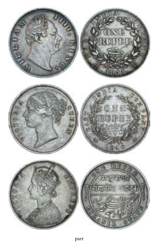
3117* India, British, William IIII, rupee 1835 F incuse (KM.450.3); Queen Victoria, rupees, 1840 (KM.458.1); Princely States, Bikanir, rupee (1897) (KM.72). Very fine or better. (4)