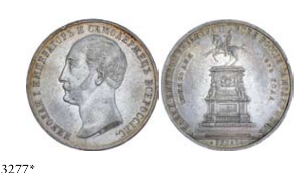
Russia, Nicholas I, commemorative, silver rouble, 1859 (KM. Y28). Nearly extremely fine. $200

Ex Dr L.J.Sherwin Collection, from Spink Noble Sale 43 (lot 2408). $150