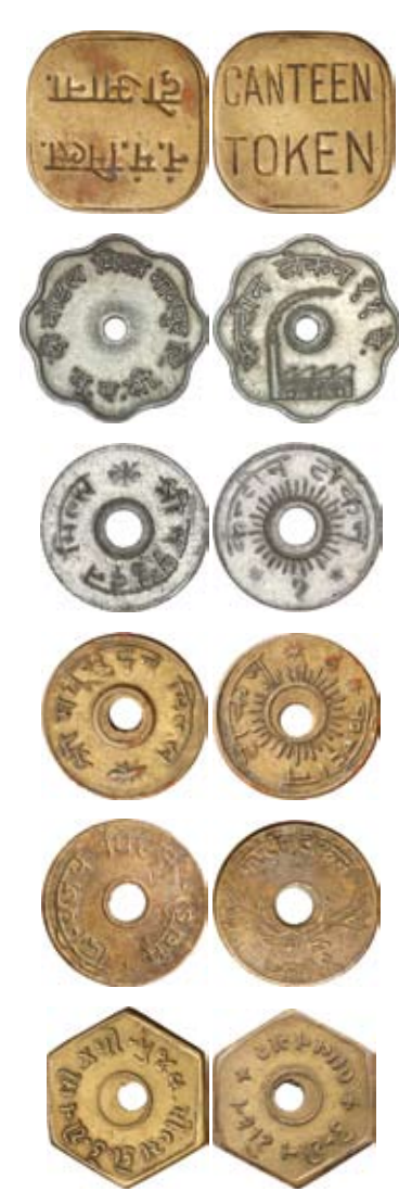
lot 3160 part