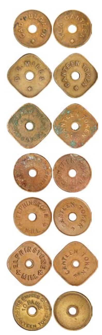
lot 3157 part