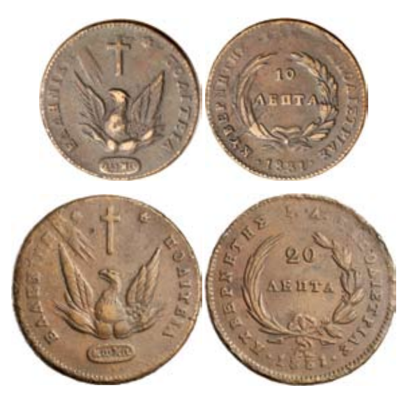
3038* Greece, Republic, copper ten lepta, 1831 (KM.10) and twenty lepta (KM.11). Toned, good very fine or better. (2) $300