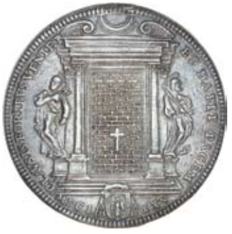
3179* Italy, Papal States, Clement X, silver piastre, 1675 Rome (KM.369; Dav.4079; Berman 2003). Good very fine .