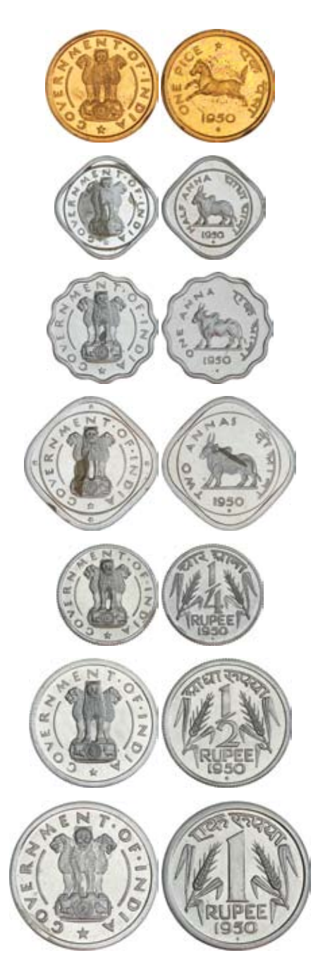
3122* India, Republic, standard coinage, Bombay Mint, proof set of seven coins, pice, half anna, anna, two annas, quarter, half and one rupee, 1950 (KM.1.2, 2.1, 3.1, 4.1, 5.1, 6.1, 7.1; or PS1). FDC. (7)