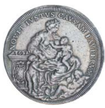
3181* Italy, Papal States, Innocent XII silver piastre 1693, Rome (Berman 2229; Dav.4103; KM.569). Polished, blue grey patina, very fine or better.