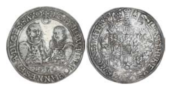
3015* Germany , Saxe-Old-Weimar, Friedrich Wilhelm I and Johann III, silver half thaler 1590 (KM.MB58). Good very fine . $150