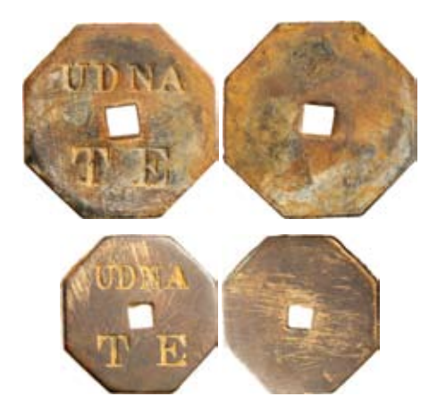
3144* India, British, Assam Tea Estate, Udna T(ea) E(state) Kajalolhara, Sylhet in brass (29mm); another (24mm) (Pridmore 153, 154). Good fine; very fine. (2)

Ex Mark E.Freehill Collection, from the Carnegie Museum of National History, Pittsburgh.