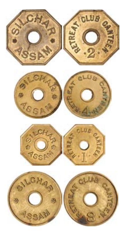
3154* India, British, Assam, Silchar, canteen tokens, value 4 (Pridmore 200A); value 1 (Pridmore 201); value 8 (Thakar 100.6.4.). Extremely fine - nearly uncirculated. (4)