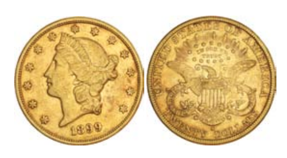
2871* USA, twenty dollars or double eagle, 1899S, Liberty head. Good very fine. $1,800