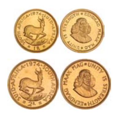
2849* South Africa, Republic, nine coin proof set, 1974, including one and two rand (KM.PS90). In case of issue, nearly FDC. (9)