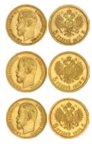
2819* Russia, Nicholas II, five roubles, 1901, 1902, 1904 (KM. Y62). Extremely fine - good extremely fine. (3) $900