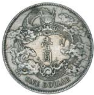
2970* China, Empire, silver dollar, year 3 (1911) (KM.Y.31). Very fine.