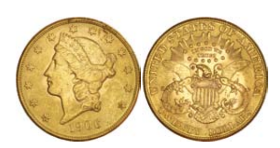
USA, twenty dollars or double eagle, 1906S, Liberty head. Slight rim bruise, extremely fine or better.