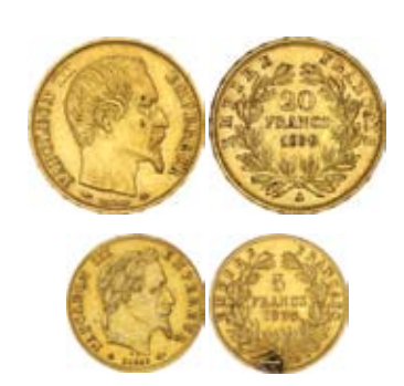
2775* France, Napoleon III, twenty francs, 1859A (KM.781.1); five francs, 1863A (KM.801.1). Good very fine; mounted on reverse at six o'clock, good very fine. (2) $500

Ex Dr L.J.Sherwin Collection, from Status Sale 266 (lot 7405) 28.5.10.