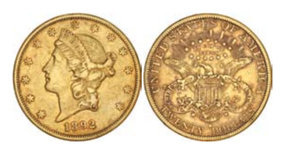
2868* USA, twenty dollars or double eagle, 1892S, Liberty head. Nearly very fine. $1,800