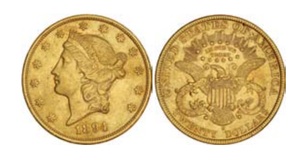
2869* USA, twenty dollars or double eagle, 1894S, Liberty head. Nearly extremely fine.