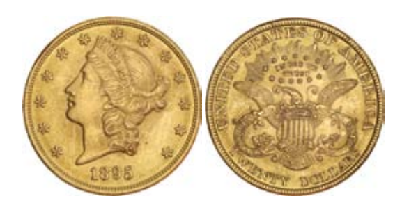
2870* USA, twenty dollars or double eagle, 1895, Liberty head. Minute rim nicks, otherwise good extremely fine.