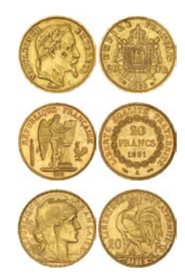
2776* France, Napoleon III, twenty francs 1868BB (KM.801.2); Third Republic, twenty francs 1891A (KM.825) and 1913 (KM.857). Good very fine - good extremely fine. (3)

Ex Dr L.J.Sherwin Collection, first from M.R.Roberts in 1972 ($16), second from Bournemouth (£3.50).