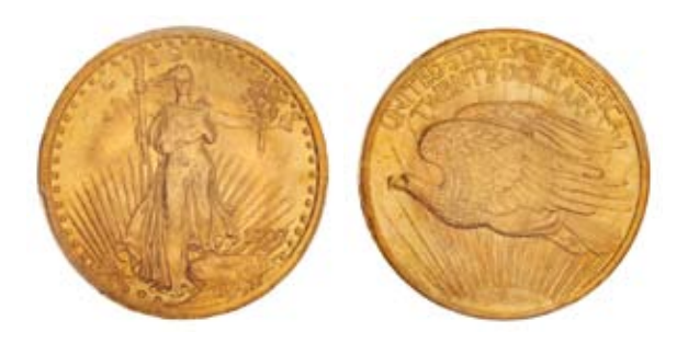
2873* USA, twenty dollars or double eagle, 1907, St. Gaudens, no motto, Arabic numerals. Choice uncirculated . $3,000