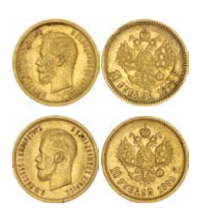
2820* Russia, Nicholas II, ten roubles, 1898 and 1899 (KM.Y64). Good very fine; nearly extremely fine. (2) $1,000