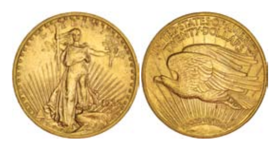
2874* USA, twenty dollars or double eagle, 1922, St.Gauldens. Good extremely fine .