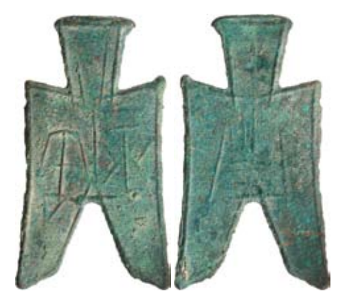
2951* China, Warring States, Ping Dao (c350-250 B.C), State of Zhao, pointed foot spade (5.77 g, height 55 mm) (Harthill#. H3.103 page 30). Green patina , good very fine and rare. $100