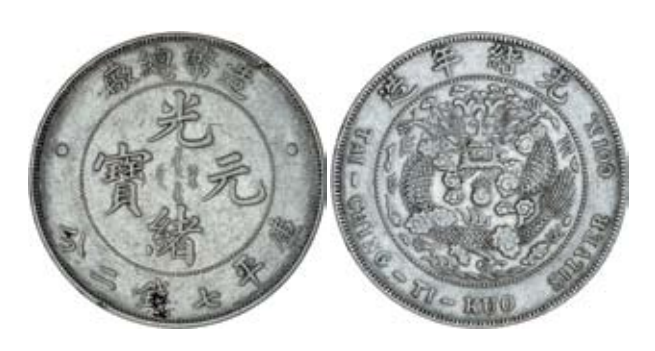
2968* China, Empire, Central Mint of Tientsin, silver dollar (1908) (KM.Y14). Cleaned, good very fine.

Ex Peking Chong Xuan Auction 2019 (realised 63,250 RMB).