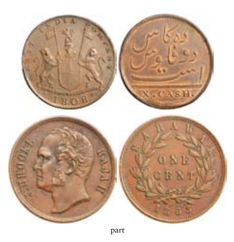
Ex. R.A.Climpson Collection, Sale 85B (lot 2308).