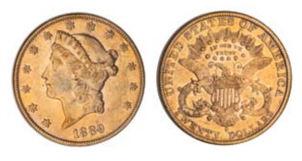
2867* USA, twenty dollars, or double eagle, 1889S, Liberty head. Good very fine. $2,000