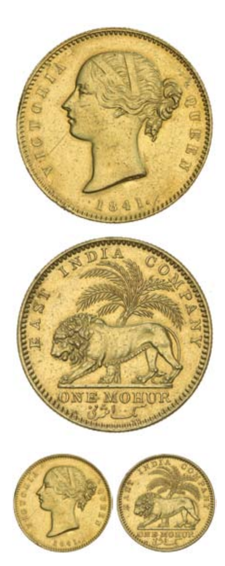
2792* India, British East India Company, Queen Victoria, mohur, 1841, incuse WW (KM.462.2). Obverse rim bruise at 9 o'clock, scratches, otherwise extremely fine/good extremely fine.

Ex Mark E.Freehill Collection, from Noble Numismatics Sale 82 (lot 1221) and 94 (lot 4227).