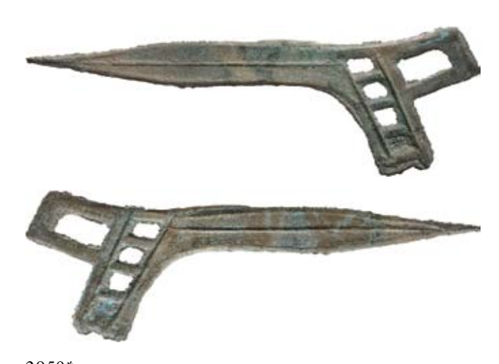
2950* China, Zhou Dynasty (c400-300 B.C), Shaoxing, Zhejiang bronze Ge Bi - Halbert money (5.04g). (1 piece). Very fine . $80