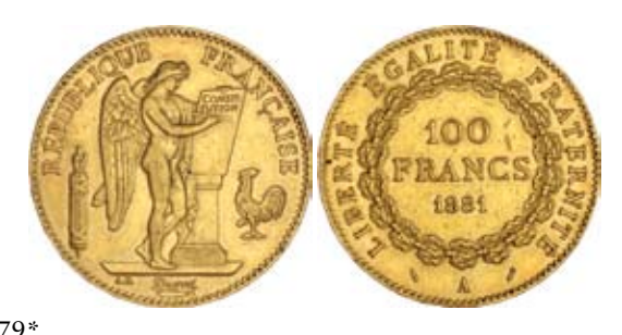
France; Third Republic, one hundred francs, 1881A (KM.832). Nearly extremely fine. $2,000

Ex Dr L.J.Sherwin Collection, from Status Sale 266 (lot 7416) 28.5.10.