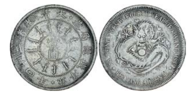
2971* China, Empire, Chihli Province, silver dollar (1898) (KM. Y65.2). Good fine .