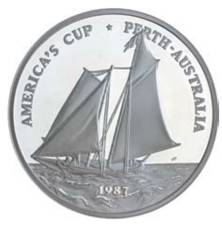
Western Samoa, proof set of gold one hundred dollars, five ounce silver twenty five dollars and one ounce silver ten dollars, 1987, America's Cup in Perth, Australia. In case of issue with certificate no 0749, struck by the Singapore Mint, FDC. (3)