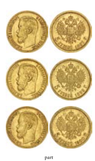
2818* Russia, Nicholas II, five roubles, 1897, 1898 (2) and 1900