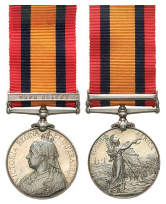
1564* Queen's South Africa Medal 1899, (type 3 reverse), - clasp - Cape Colony. 3470 Pte W.F.Boyes, N. Zealand M.R. Impressed. Extremely fine.

Records show entitlement also to clasp South Africa 1901 receipt of which was acknowledged by Private Boyes on 01Dec1906.