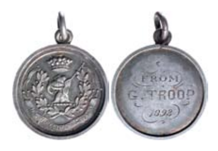
1626* Australia, N.S.W. Regiment Cavalry (NSW Lancers), presentation fob medal in silver (26mm), no maker, ring top suspension, reverse inscribed, 'From/G. Troop/1892'. Toned