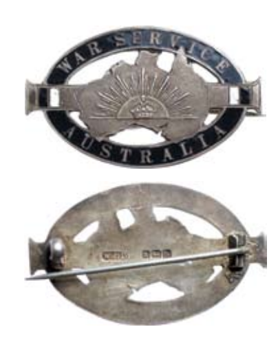
1581* Australia, WWI War Service badge (type 2, c1918), in voided silver and enamel (44x26mm), hallmarked for Birmingham 1917 by maker W.J.D (W.J.Davis), pin-back. Good very fine and scarce .