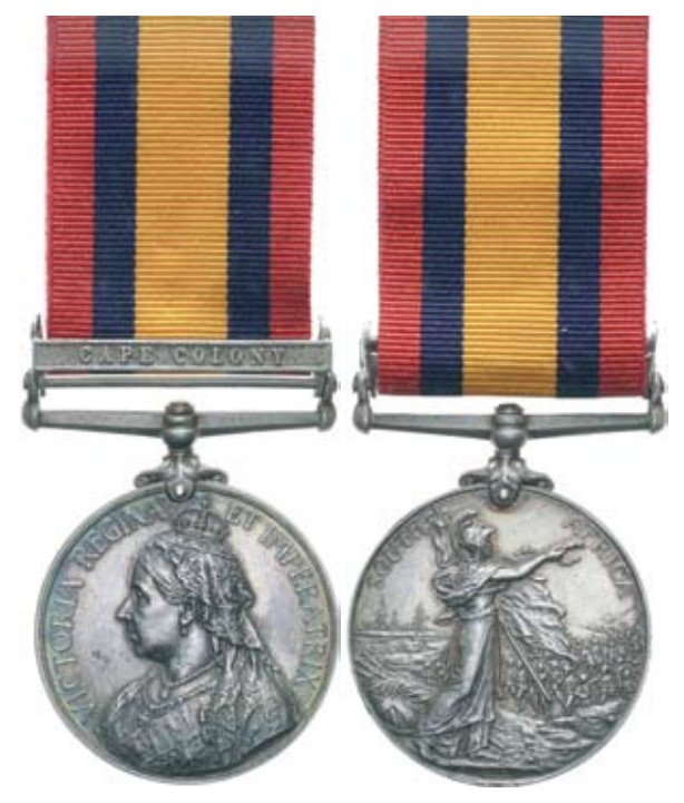
1446* Queen's South Africa Medal 1899, (type 3 reverse), - clasp - Cape Colony. 146 Pte H.O.Leach. Queenstown R.V. Impressed. Toned, nearly extremely fine .