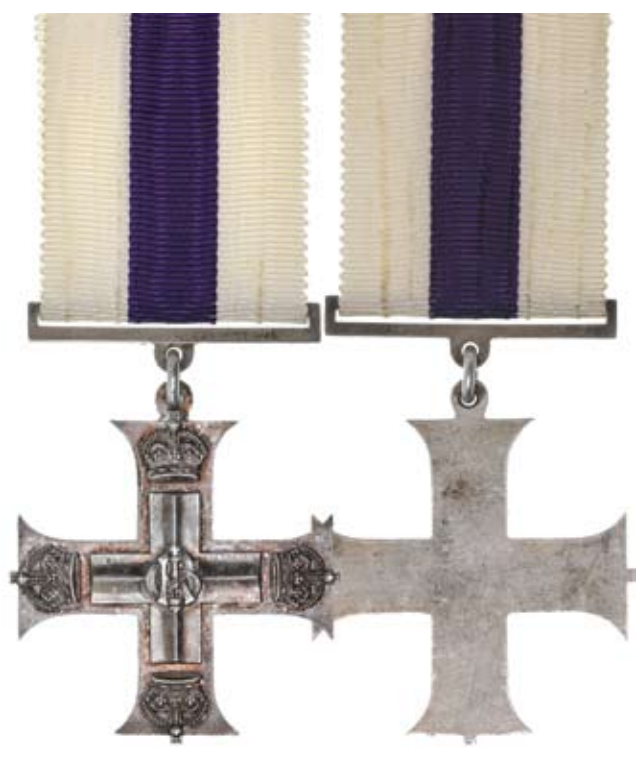
1412* Military Cross, (GRI), with pin-back ribbon suspender. Unnamed, front toned, back cleaned with scratching, otherwise very fine.