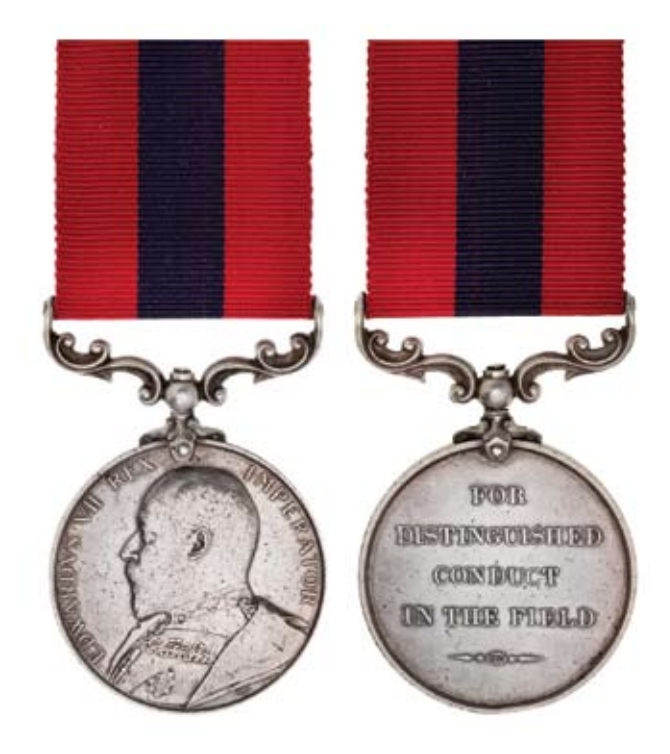
1416* Distinguished Conduct Medal (EVIIR). Sergt W.M.Strong Thorneycroft's M.I. Impressed. Edge bruise on reverse at 6 o'clock, very fine.