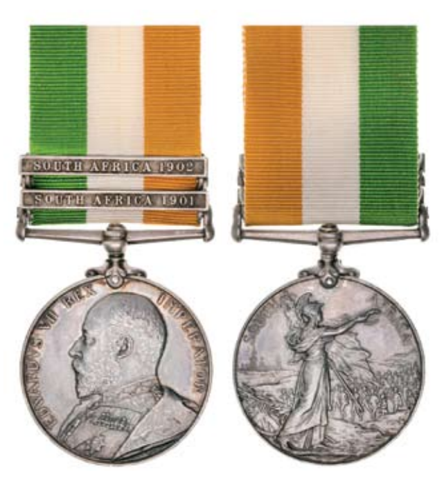
1472* King's South Africa Medal 1902, - two clasps - South Africa 1901, South Africa 1902. Tpr: F.Lount. Steinaecker's Horse. Impressed. Nicely toned, extremely fine .