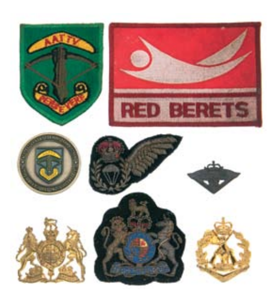
Lot 1553 continued

Ex Noble Numismatics Sale 88 (lot 4255).