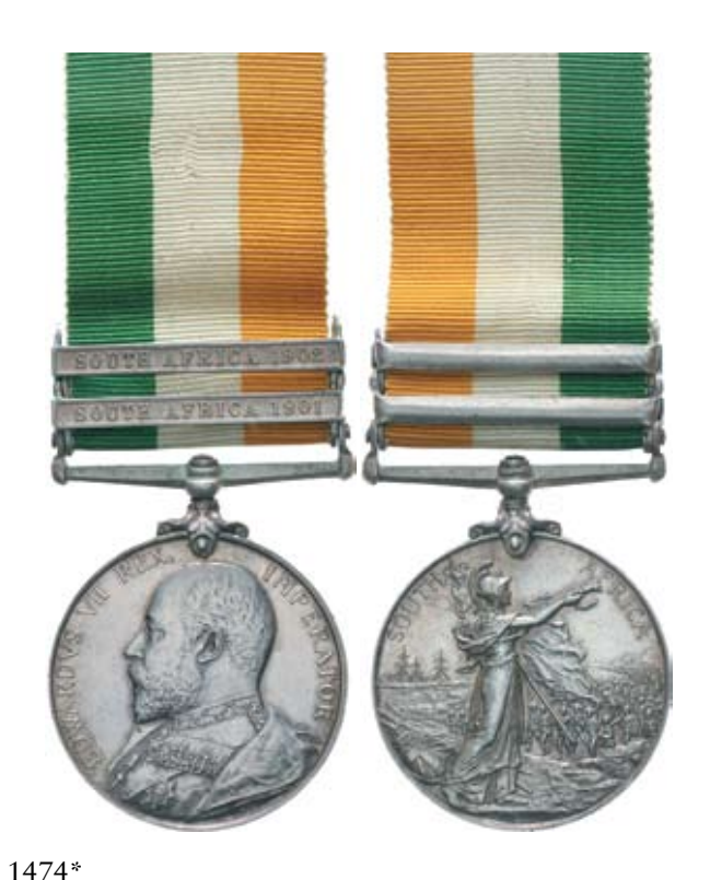
King's South Africa Medal 1902, - two clasps - South Africa 1901, South Africa 1902. Agent G.Taylor. F.I.D. Impressed. Light hairlines, otherwise nearly extremely fine.