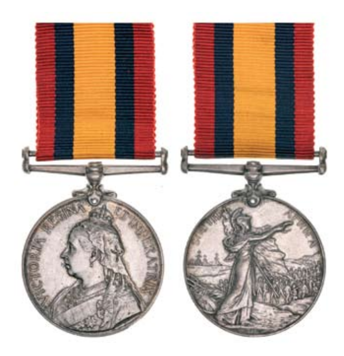
1466* Queen's South Africa Medal 1899, (type 3 reverse). M.Spring. Remount Dept: Impressed. Toned very fine . $250