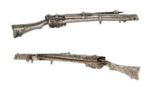
1635* Australia, AIF sweetheart brooch in the form of a Lee Enfield rifle, in silvered, pin-back. Very fine .

Australia, AIF sweetheart brooch in form of a slouch heart on a Lee Enfield rifle, in bronze and hat with a brown powder coating, pin-back. Very fine .