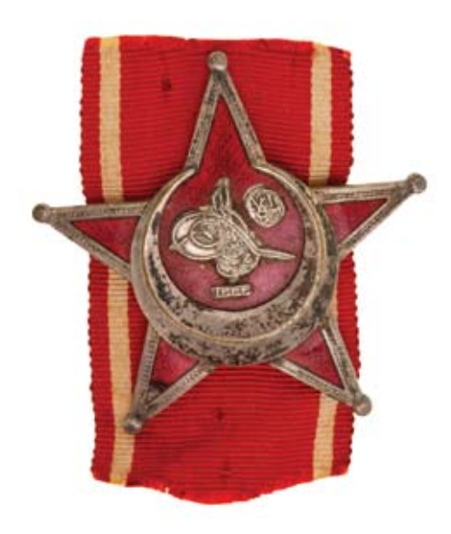
1570* Turkey, WWI Gallipoli Star, in silvered tombac and red enamel, back stamped with maker's mark B.B.& C (Binder Bruder & Co, Ludenschied, Germany). Toned, very fine .