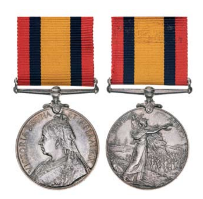
Queen's South Africa Medal 1899, (type 3 reverse). Cpl V.C.Van Blommestein. Cape Infty: Impressed. Small hairline scratch in obverse field, otherwise nicely toned extremely fine. $200

Confirmed on medal rolls for Cape Infantry.