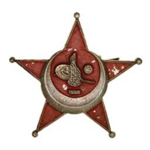
1571* Turkey, WWI, Gallipoli Star, other ranks issue. Paint missing in some areas, fine.