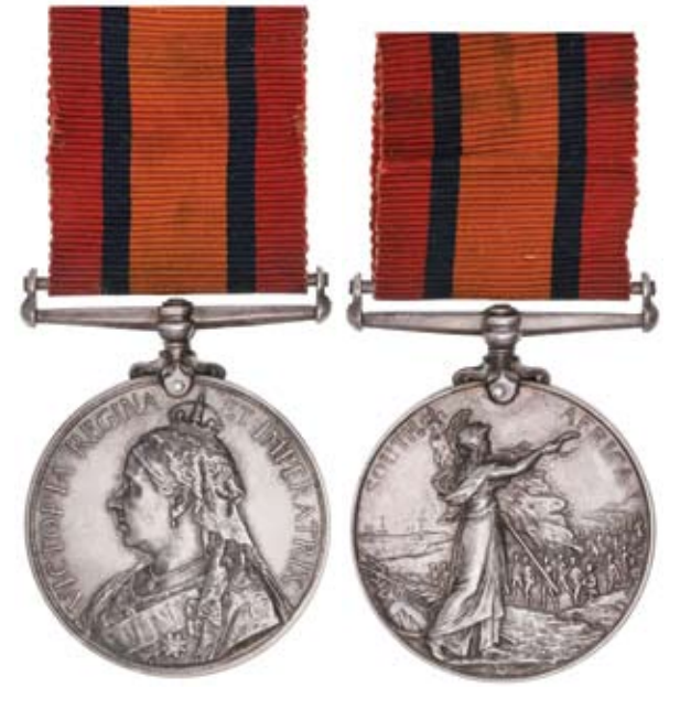
1464* Queen's South Africa Medal 1899, (type 3 reverse), - no clasps. F.E.McGeoch. C.G.R. Impressed. Ribbon damaged, otherwise good very fine.