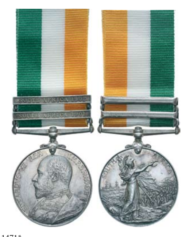
King's South Africa Medal 1902, - two clasps - South Africa 1901, South Africa 1902. Scout J.W.Legge. F.I.D. Impressed. Hairlines and some light scratches in obverse field, otherwise good very fine.