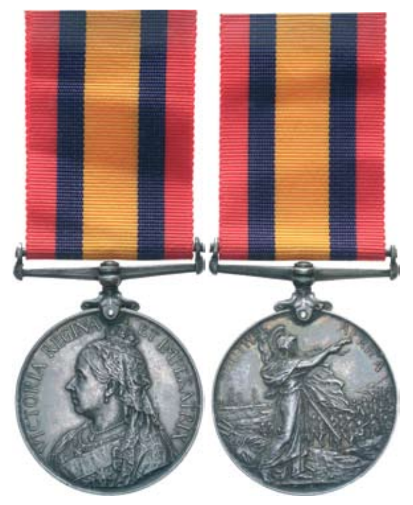
1462* Queen's South Africa Medal 1899, (type 3 reverse). 807 O.R.Sjt: P.H.Gilder. Grahamstown T.G. Impressed. Toned good very fine.

807 Orderly Room Sergeant P.H.Gilder confirmed on roll of 1st Battalion Grahamstown Town Guard, no clasp entitlement.