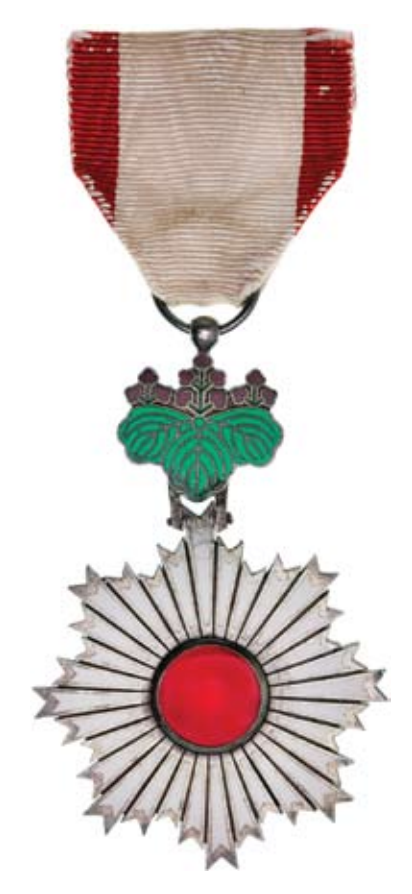
1568* Japan, Order of the Rising Sun 6th Class. Ribbon torn, otherwise nearly extremely fine.