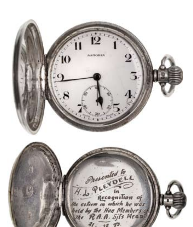
lot 1522 part