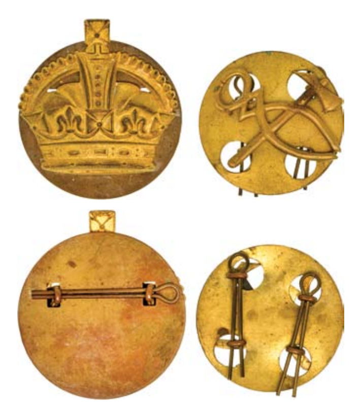
lot 1559 part

Together with miniature of each medal, a riband for first medal, spare ribbons for both full size medals and a case of issue with official description card for first medal.