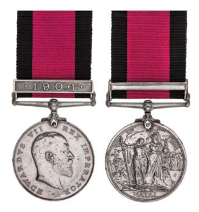
1475* Natal Rebellion Medal, - clasp - 1906. Tpr G.W.Bayley , Umvoti Mtd Rifles. Impressed. Some edge knocks, good very fine.