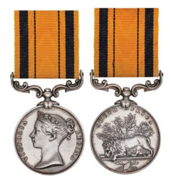
1439* South Africa Medal 1877-79, - no clasp. Qr Mr Sergt T.D.Wheeler. Rl Dn Rifles. Officially engraved. Very fine . $700

94 medals issued to Royal Durban Rifles, all without clasp. Ex. W (Bill) Woolmore Collection.