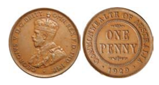
1382* George V, 1929 London die. Brown patina, nearly extremely fine. $100