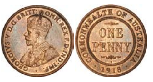
1367* George V, 1918I. Red and brown uncirculated and rare in this condition. $1,250