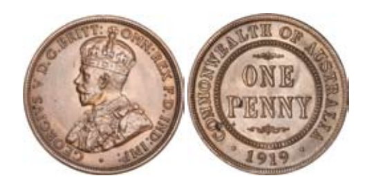
1368* George V, 1919. Grey brown uncirculated.