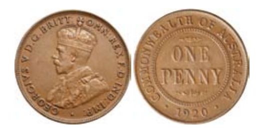
1372* George V, 1920 plain, Indian die. Good very fine and rare thus.