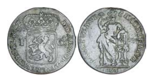
1159* Netherlands, Gelderland, silver gulden, 1763 (KM.100.1). Has been mounted, otherwise good fine. $70