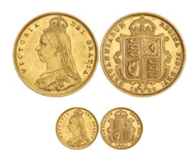
1224* Queen Victoria, 1889 Sydney. Nearly uncirculated and scarce thus. $2,500