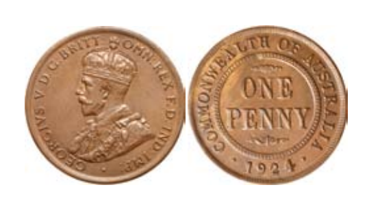
1376* George V, 1924 London die. Peripheral die breaks, die clash above scroll on inner circle, attractive glossy red brown uncirculated.