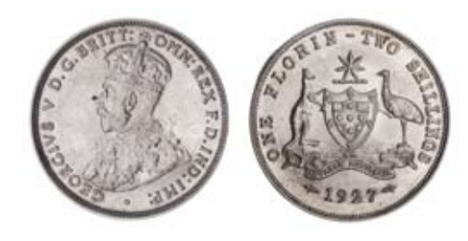
1259* George V, 1927. Peripheral die break along base of the date, full pearl-like mint bloom, minor obverse contact marks, otherwise choice uncirculated.