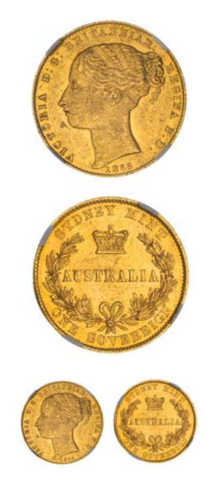
Queen Victoria, first type, 1855, with filletted head left by James Wyon. Traces of mint bloom, minor surface marks, otherwise nearly uncirculated and rare in this condition, one of the finest known.