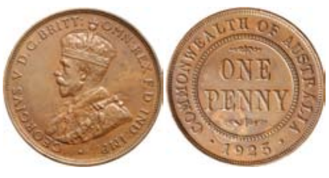
1378* George V, 1925 London die. Two blobs on E die state, contact mark in front of bust, otherwise extremely fine and rare in this condition. $900