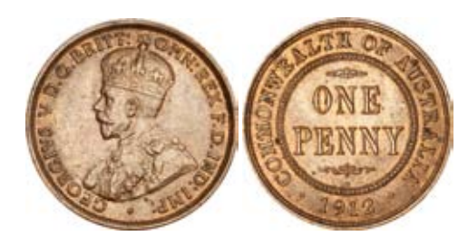
1360* George V, 1912H. Brown with some red, nearly uncirculated.