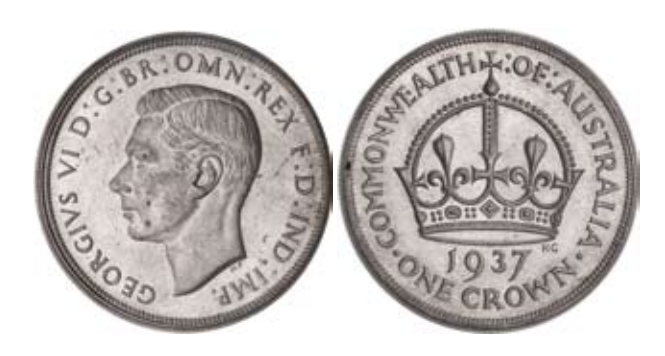
1234* George VI, 1937. Well struck, full original satin-like mint bloom, uncirculated.