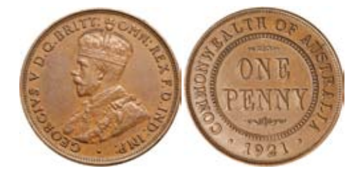
1373* George V, 1921, Indian die. Obverse rim nicks, otherwise good extremely fine. $150