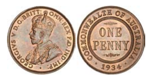
1387* George V, 1934 London die. Red and brown uncirculated . $250