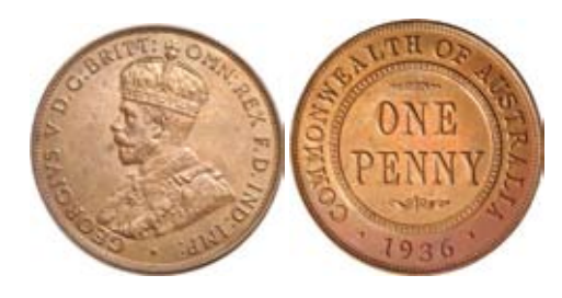
1389* George V, 1936 London die. Mostly red uncirculated. $250