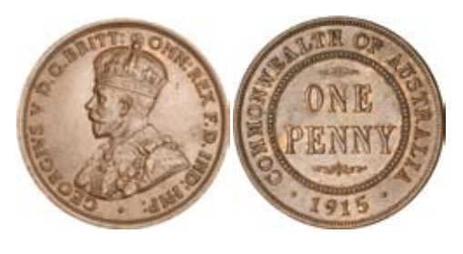
1363* George V, 1915. Brown with traces of red, particularly on the reverse, good extremely fine and rare in this condition. $750