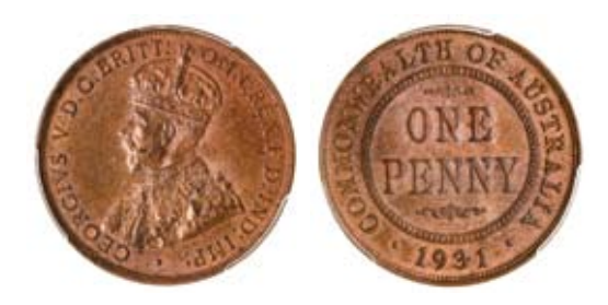
1385* George V, 1931 dropped I, London die. Uncirculated . $1,000