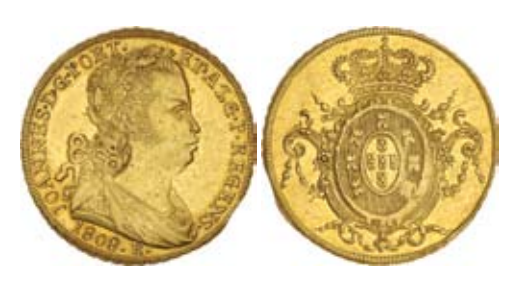
1147 Brazil , John VI, gold 6,400 reis, 1806R (KM.236.1). Extremely fine . $1,200

Ex Noble Numismatics Sale 111 (lot 1080).