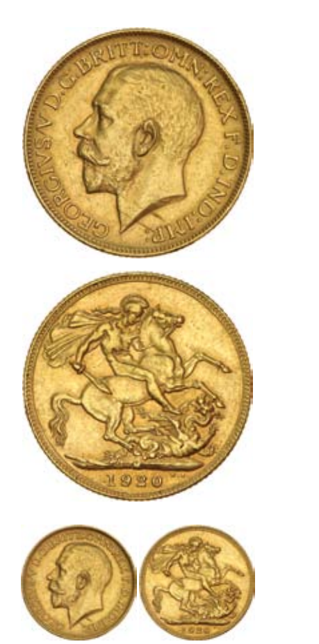
1213* George V, 1920 Melbourne. Old diagonal scratches on obverse, otherwise good very fine and rare. $3,000