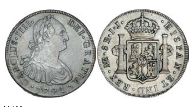
1161* Peru, Charles IIII, eight reales, 1791IJ, Lima Mint (KM.97). Hairlines and cut under OLU of CAROLUS, otherwise very fine.