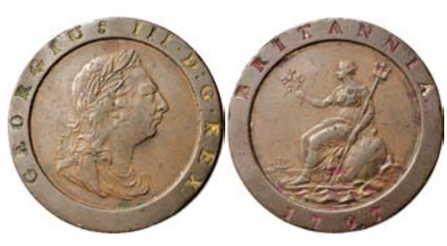
1150* Great Britain, George III, copper 'cartwheel' twopence, 1797 (S.3776). Very fine .