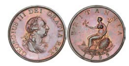
1154 Great Britain, George III, third copper issue, halfpenny, 1799 (S.3778), five incuse gun ports. Obverse vertical hairline die break, extremely fine.