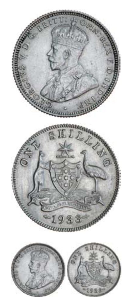
1293* George V, 1933. Well struck, nearly uncirculated and rare in this condition. $1,500