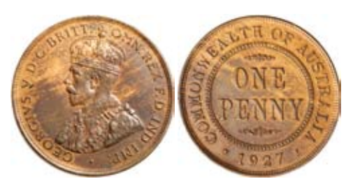
1380* George V, 1927 London die. Fine die breaks left to right above crown. Red brown and dark brown toned, nearly uncirculated.