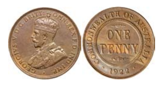
1374* George V, 1922, London die. Streaky tone, rubbed, otherwise good extremely fine. $150