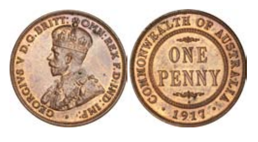
1366* George V, 1917I. Red and brown uncirculated.