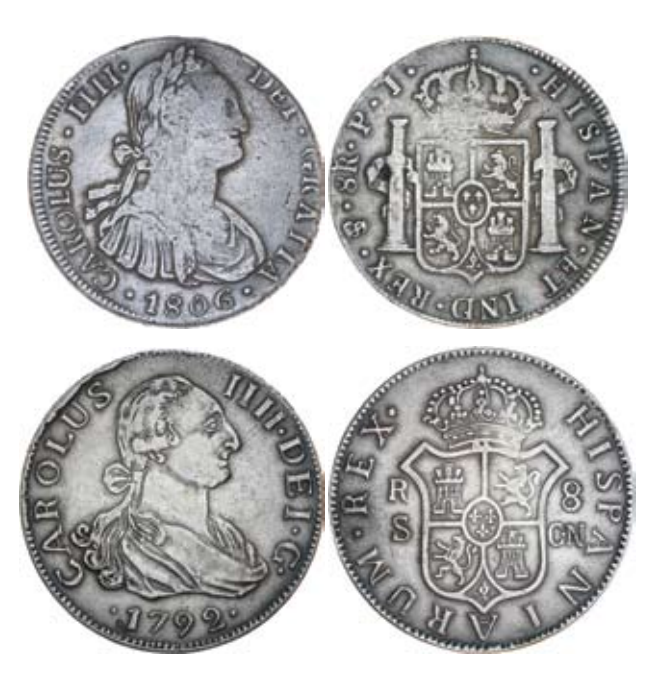
1146* Bolivia, Charles IIII, eight reales 1806 PJ, Potosi Mint (KM.73), also Spain, eight reales 1792 Seville die struck copy of (KM.432.2). Fine ; very fine . (2) $100