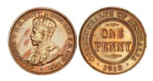
1361* George V, 1913. Cleaned and a little rubbed, otherwise good extremely fine. $250