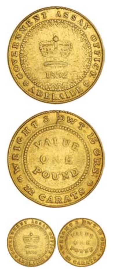
1174* Adelaide pound, 1852, first type with beaded inner circle and die break on the reverse. Has been sweated in a mount, very good and very rare. $10,000