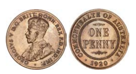
1371* George V, 1920 dot above scroll, Indian die. Usual crashed denticles, red and brown patina, uncirculated. $1,000