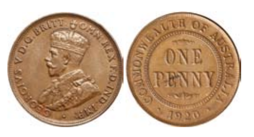
1370* George V, 1920 dot below, Indian die. Brown glassy patina, nearly uncirculated .