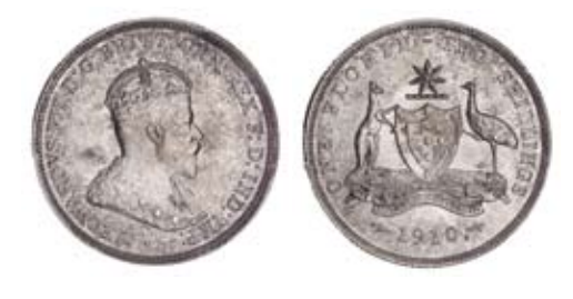
1237* Edward VII, 1910. Blue grey toning over full original subdued mint bloom, minute contact marks only, choice uncirculated and rare in this condition, one of the finest known.