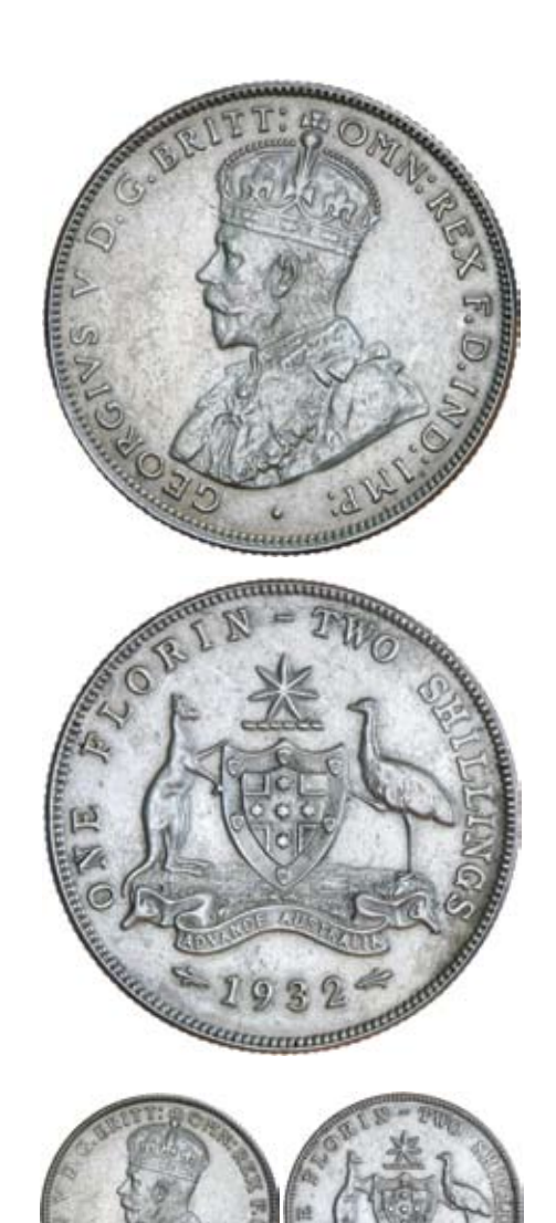
1263* George V, 1932. Nearly uncirculated and rare.