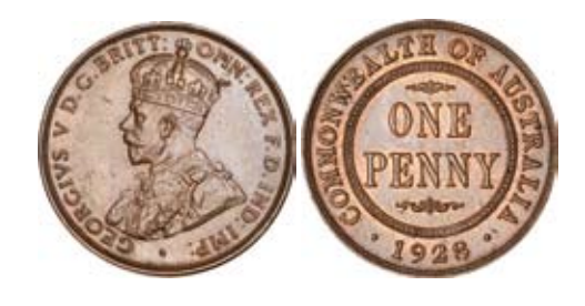
1381* George V, 1928 London die. Almost broken 8, brown and brown with red traces on the reverse, nearly uncirculated/uncirculated.