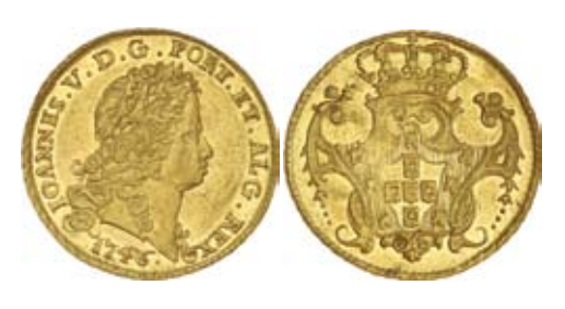
1162* Portugal, John V, gold four escudos or half Johanna, 1746 (KM.221). Adjustment mark through face, extremely fine. $1,500

Ex Noble Numismatics Sale 112 (lot 1625).