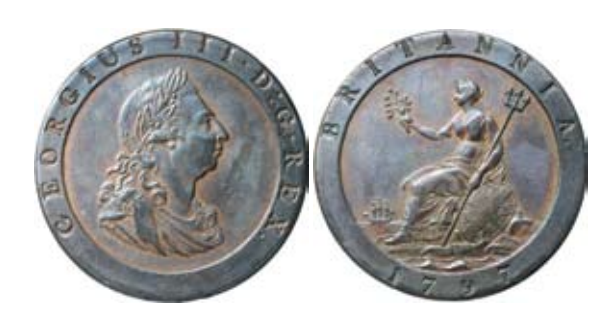
1152* Great Britain, George III, copper 'cartwheel' penny, 1797 (S.3777). Nearly extremely fine.