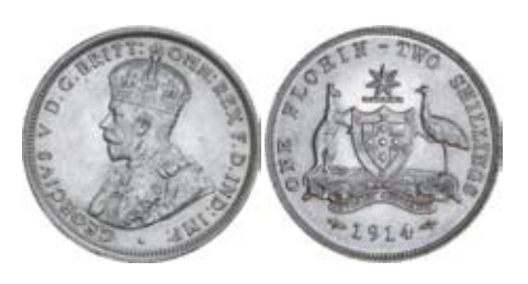
1243* George V, 1914. Nearly uncirculated.