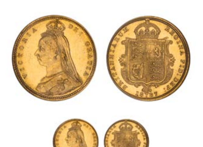
1222* Queen Victoria, Jubilee head, 1887 Sydney (McD 32a). Subdued mint bloom, uncirculated. $2,000

In a slab by NGC as MS64. Ex Reverse Bank of Australia Sale (lot 750).