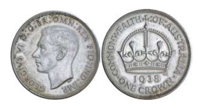
1235* George VI, 1938. Lightly toned, nearly uncirculated. $150

In a slab by PCGS as MS64. Private purchase from A.H.Baldwin & Son, 6/1/07.