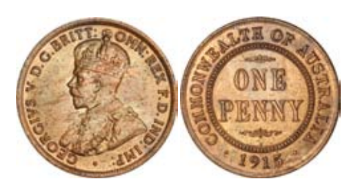
1364* George V, 1915H. Mostly red uncirculated and rare in this condition, one of the finest known. $1,250