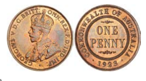
George V, 1923 London die. Cleaned and retoned, brown and red, good extremely fine. $200