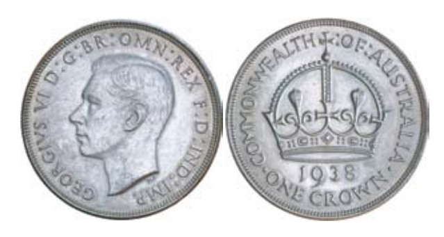
1236* George VI, 1938. Lightly toned, nearly uncirculated.