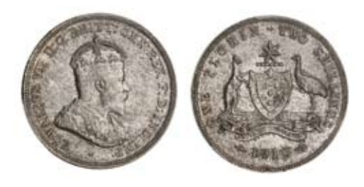
1239* Edward VII, 1910. Minor surface contact marks mentioned only for accuracy, attractive cartwheeling mint bloom, uncirculated.

Ex Noble Numismatics Sale 95A (lot 1516).