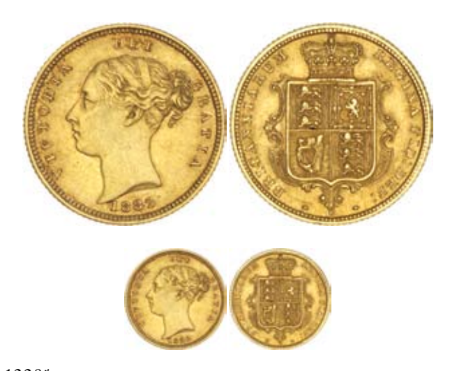
1220* Queen Victoria, 1882 Sydney. Nearly extremely fine and very rare in this condition.