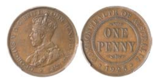
1377* George V , 1925, London die. Q die state , glossy brown with hints of red, good extremely fine or nearly uncirculated and very rare thus.