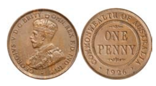
1379* George V, 1926 London die. Subdued red brown mint bloom patina, nearly uncirculated. $650