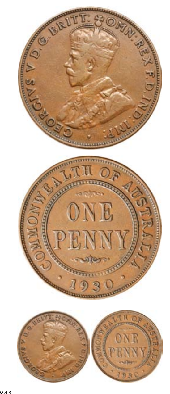
1384* George V, 1930 Indian die. Six pearls, 'Wartenburg or pounce wheel' mark through band of crown, otherwise nearly very fine/very fine and rare.