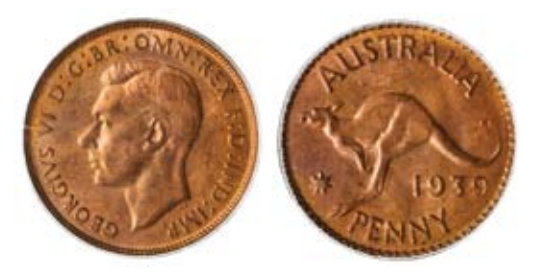
1390* George VI, 1939. Subdued full original mint red, uncirculated.