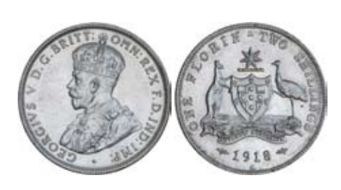
1249* George V, 1918M. Nearly uncirculated.