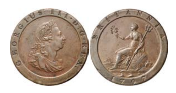
1153* Great Britain, George III, copper 'cartwheel' penny, 1797 (S.3777). Good very fine .