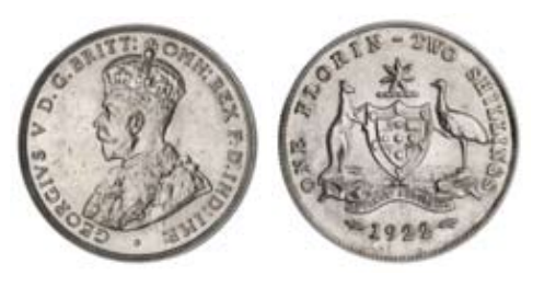
1252* George V, 1922. Uncirculated.

Ex P.F.Tripovich Collection, in a holder by Klaus Ford (gEF/aUNC $1950).