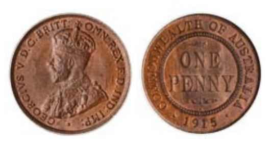
1365* George V, 1915H. Brown and red mint bloom, uncirculated. $1,200