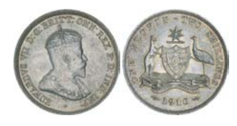
1238* Edward VII, 1910. Well struck up obverse, light golden brown tone on the reverse, choice uncirculated and rare in this condition, one of the finest known.