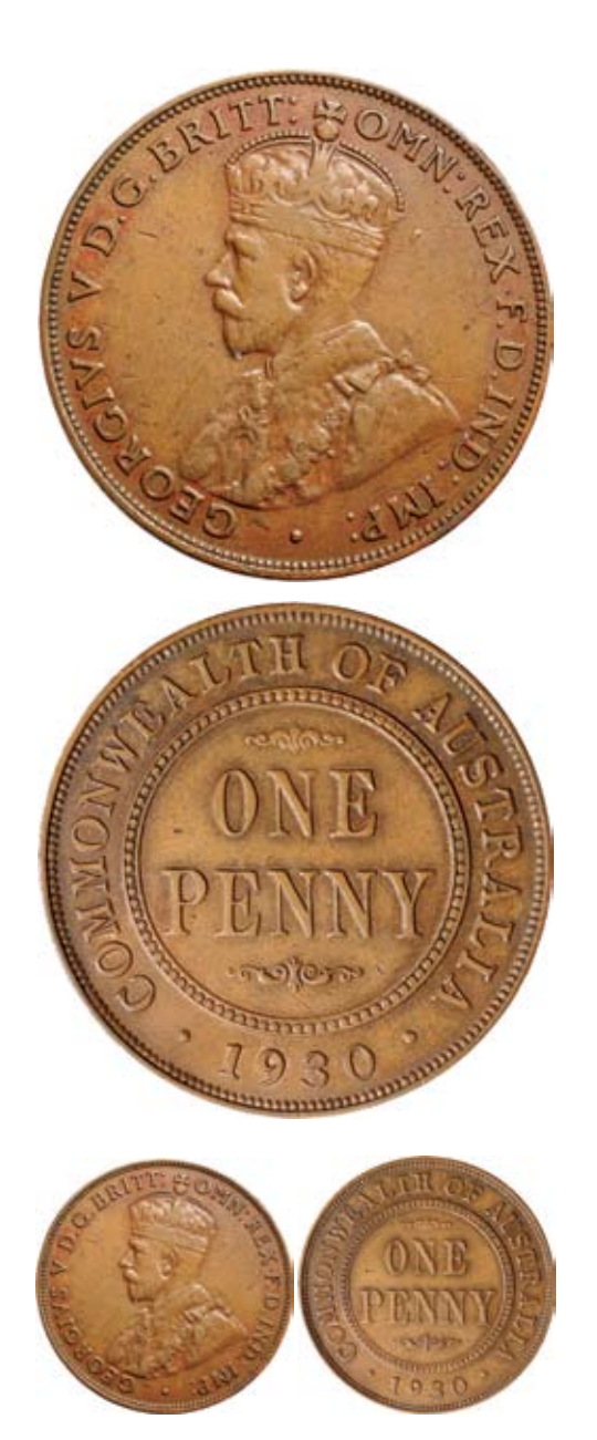
1383* George V, 1930 Indian die. Six pearls, full bottom line to band of crown, nearly very fine/very fine, well above average and rare, especially in this condition.