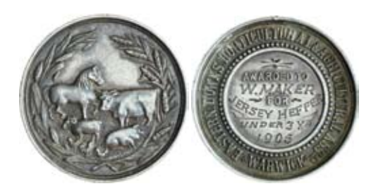
953* Eastern Downs Horticultural & Agricultural Asson, Warwick, in silver (31mm), no maker, reverse inscribed, 'W.Maker/(For)/Jersey Heffer/Under 3 Yr/1905'. Dark toned, a few edge nicks and surface marks, otherwise very fine.