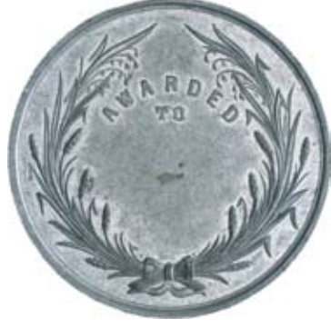
866* Commemorating the Opening of the Victorian Exhibition, 1872, prize medal in white metal (47.5mm) (see C.1872/3 reverse for this medal's obverse), by Stokes & Martin, unawarded. Toned, otherwise extremely fine and rare. $200