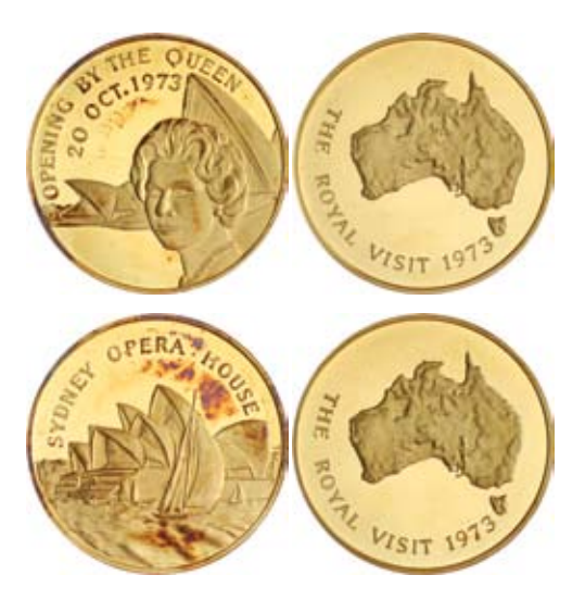
1075* Royal Visit, Opening of the Sydney Opera House, .750 fine gold medals (2) (31mm) (total 46.65g) by Matthey Garrett (C.1973/16, 17). In case of issue with certificate 0625 , FDC. (2)