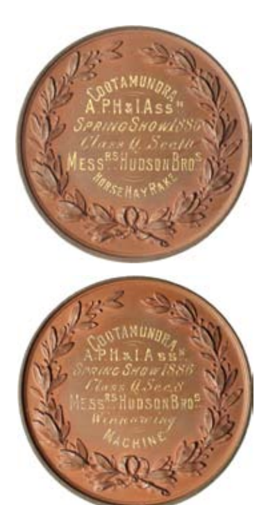
lot 899 part