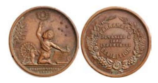
894* Parramatta, Juvenile & Industrial Exhibition, 1883, in bronze (30mm) (C.1883/2). Extremely fine . $90