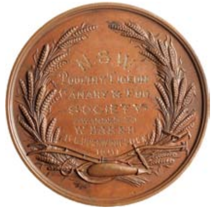
924* N.S.W. Poultry, Pigeon, Canary & Dog Society, 1889, in bronze (53.5mm) by Ottley Birmm, inscribed on reverse 'N.S.W./Poultry, Pigeon/Canary & Dog/Society/Awarded To/W.Baker/B.G.Duckwing Cock/1891'. Toned extremely fine .