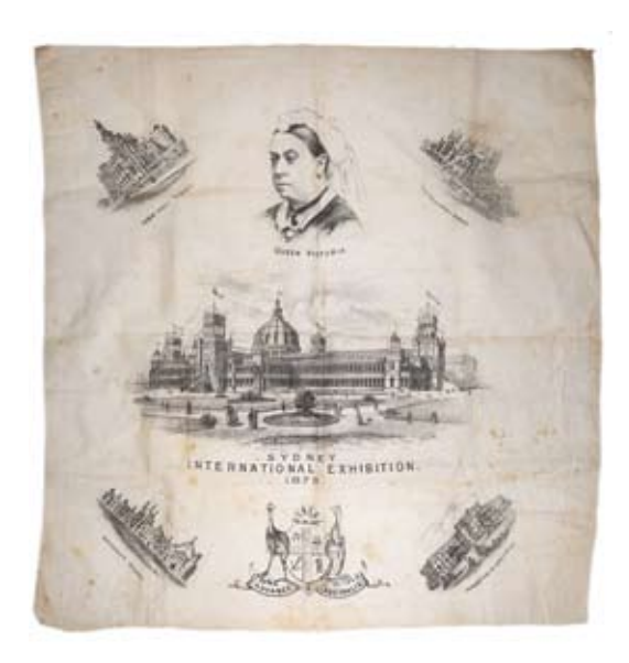
885* Sydney International Exhibition 1879, large printed scarf (45x45cm). Slight rust, otherwise very fine and very rare. $150