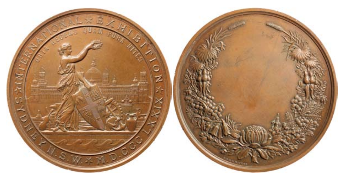
882* Sydney International Exhibition, 1879, in bronze (76mm) by J.S. & A.B.Wyon, no stop after CCC in date, unnamed. Some scratches on reverse and some remnants of cleaning cream, otherwise good very fine.