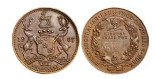
955* First Australian Exhibition Of Womens Work, Melbourne, 1907, prize medal in bronze (29.5mm) (C.1907/4), by Newman, reverse inscribed, (Highest/Award For) 'Wands/ St Kilda S.S.'. Very small edge bump, otherwise good very fine.