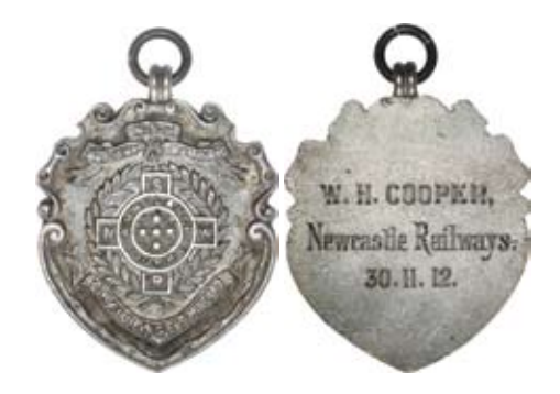
973* N.S.W. Railways & Tramways Ambulance Corps, Challenge Shield medal, in silver (29x33mm), no maker, ring top suspension, reverse inscribed, 'W.H.Cooper,/Newcastle Railways/30.11.12.'. Dark toned, very fine .