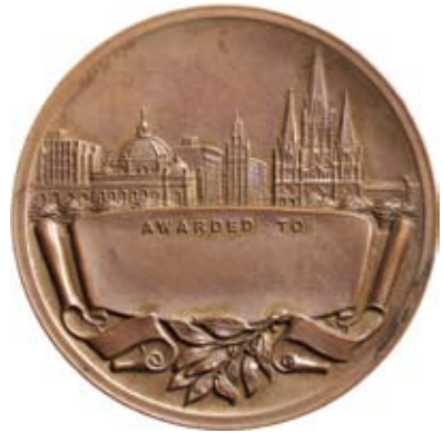
1026* Professional Photographers Of Victoria, Melbourne Centenary, 1934, in bronze (50mm) (C.1934/7), by Stokes, unnamed. Toned good extremely fine with very small edge bump, very low mintage and rare.