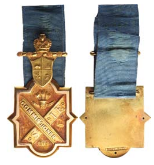
876* S(ydney) I(nternational) E(xhibition) 1879, commissioner's admission badge in gold (22 carat, 30x55mm, 14.05g) by Evan Jones, maker's name stamped at the base of plain back. With blue ribbon attached, extremely fine and extremely rare.

Ex Gregory J.Smith Collection, from the W.J.Noble Collection Sale 33 (lot 2651).