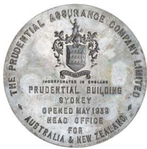
1041* Prudential Building Sydney, Opened May 1939, in silver (64mm) (C.1939/4), by Amor. Toned uncirculated, a scarce VIP issue in silver.