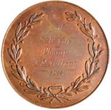
976* U.Q.A.C. (University of Queensland Athletics Club), in bronze (50mm), no maker, reverse inscribed, '2nd/220 Yds/Champ./J.F.Neilson/1914'. A few tone spots, traces of mint red, a small edge bump and an edge nick, otherwise good very fine.