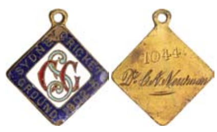
lot 1142 part