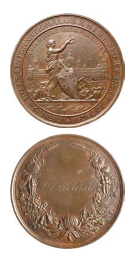
Sydney International Exhibition, 1879, in bronze (51mm, small size as awarded to school children), by J.S. & A.B.Wyon, stop after CCC in date, reverse chisel cut cursive engraved, 'J A Mitchell'. A few small edge nicks or bumps, dark toned, otherwise good very fine.