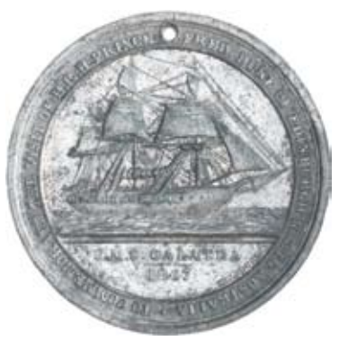
864* Visit of The Duke of Edinburgh, H.M.S. Galatea, 1867, in white metal (47mm) (C.1867/2), by T.Stokes, Melbourne, holed for suspension. Reverse with usual oxidation stains, otherwise good very fine.