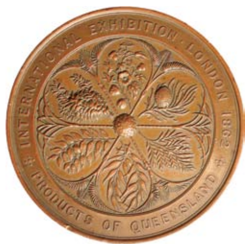
861* International Exhibition London, Products of Queensland, 1862, in bronze (64mm) (BHM2748), by J.S. & A.B. Wyon, reverse inscription, 'Queensland Offers/Her First Fruits/ To Britain'. Edge nicks and some marks in reverse field, otherwise very fine and rare.