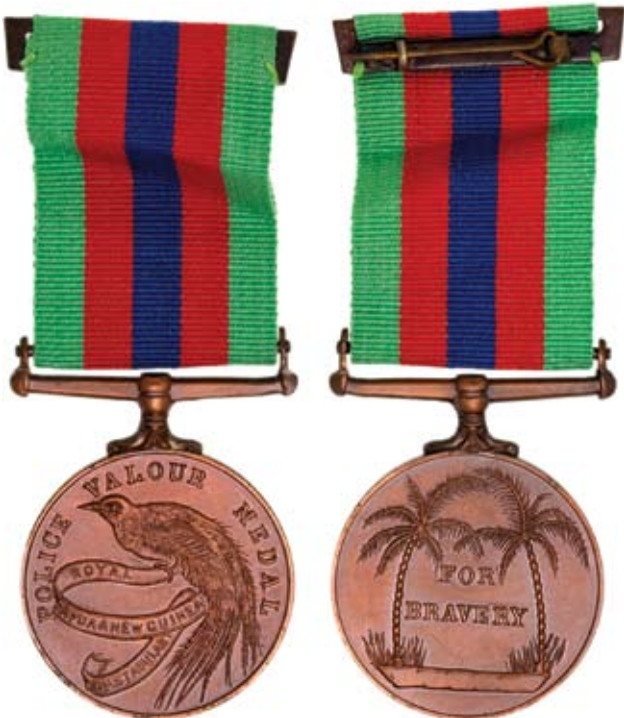
510* Royal Papua & New Guinea Constabulary, Police Valour Medal, unnamed. Uncirculated.