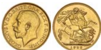
454* George V, 1926 Melbourne. Good extremely fine.