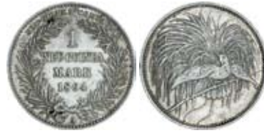
485* German New Guinea , silver one mark, 1894A. Nearly extremely fine.

In a slab by ANACS as MS61. Ex Status Sale 250 Oct 2008 (lot 8858).