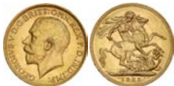
450* George V, 1925 Melbourne. Uncirculated.