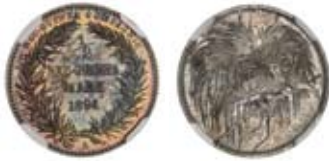
482* German New Guinea , proof silver half mark, 1894A. Dark grey blue toning over brilliant fields, nearly FDC.