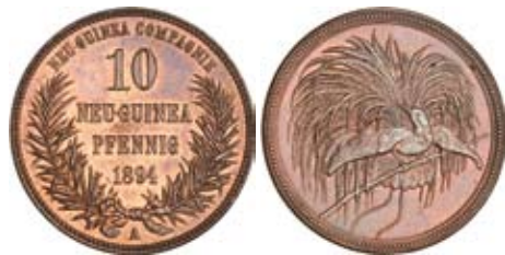
489* German New Guinea , bronze ten pfennig, 1894A. Red and brown / brown and red uncirculated.