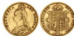
458* Queen Victoria, 1891 Sydney (McD.38). Nearly very fine.