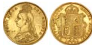
457* Queen Victoria, Jubilee head, 1887 Sydney (McD.32a), 1889 Sydney. Both ex mounts as cufflinks, damage, otherwise very fine or better. (2)