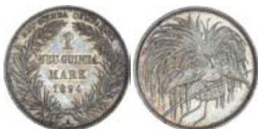
484* German New Guinea , silver one mark, 1894A. Light grey and slight iridescent toning, uncirculated.