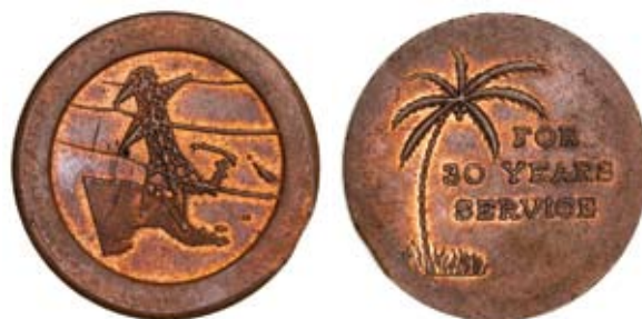
515* Papua And New Guinea Electricity Commission, 30 Years Long Service Medal , a trial strike in bronze, legend on obverse barely visible but shows Papua And New Guinea, not the revised Papua New Guinea, finished 30 Year Medals were struck in gold plated silver so this unfinished medal was obviously a trial. Traces of mint red, good very fine and rare with only 2 finished 30 Year Medals known to be issued. $100