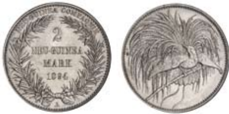
481* German New Guinea , silver two mark, 1894A. Nearly uncirculated.