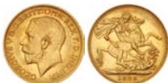
453* George V, 1925 Sydney. Good extremely fine.