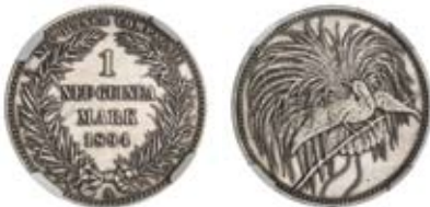
483* German New Guinea , proof silver one mark, 1894A. Has been cleaned of heavy dark toning, surface marks, otherwise good extremely fine.