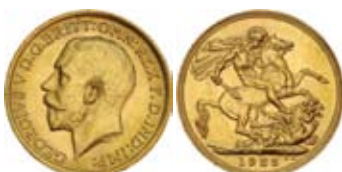
452* George V, 1925 Sydney. Die breaks on obverse at six o'clock, uncirculated.