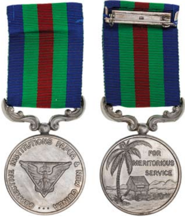
509* Papua & New Guinea Corrective Institutions, Meritorious Service Medal, unnamed. Uncirculated.