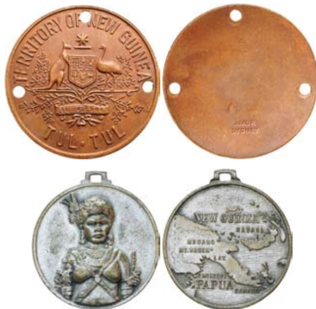
514* Papua New Guinea, WWII, Loyal Service Medal , reverse impressed '70', and around rim 'Stokes Stg.Sil.' Holed at top to use on a neck chain. Very fine and rare issued variety. $600