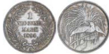
486* German New Guinea , silver one mark, 1894A. Good very fine.