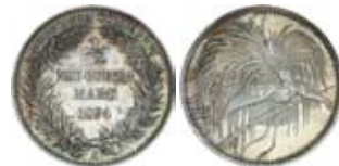
488* German New Guinea , silver half mark, 1894A. Attractive blue grey peripheral toning, mirror-like fields, choice uncirculated.

In a slab by NGC as proof AU details surface hairlines. Ex Heritage Sale 3031 (lot 2861).