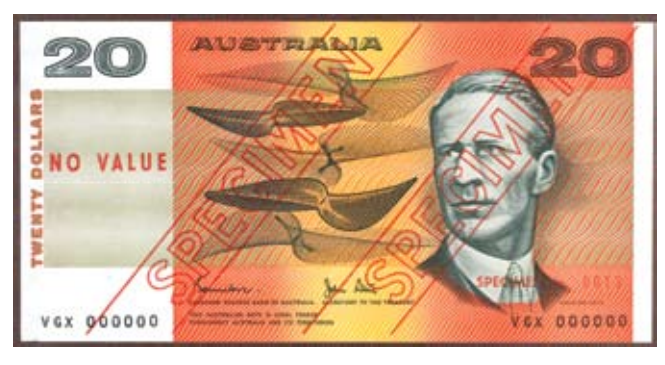
lot 2346 part