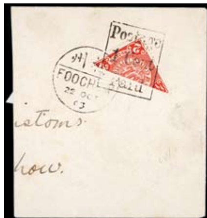
lot 1959 part