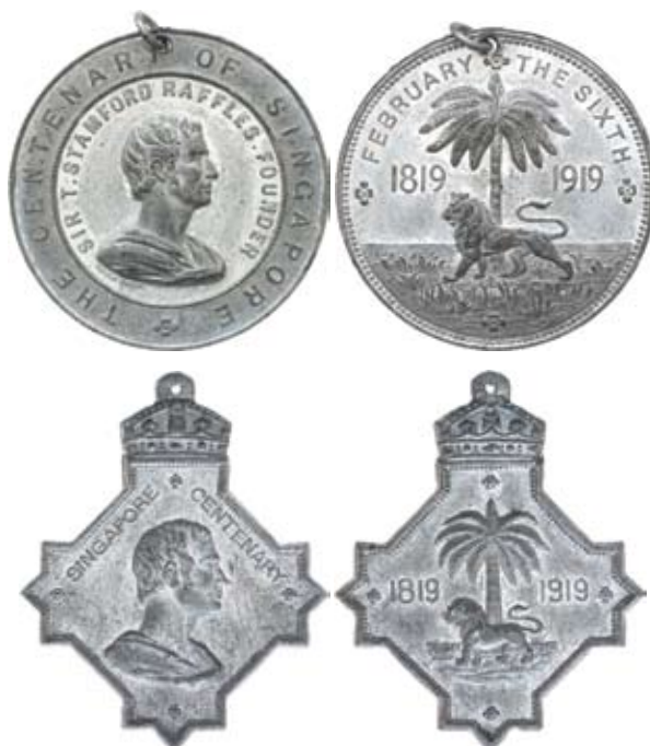
1793* Singapore, Centenary 1919, Sir Stamford Raffles in white metal (39mm) by Spink, pierced with suspension ring; Singapore Centenary crowned cross shape in white metal (38x45mm). Nearly uncirculated; extremely fine. (2)