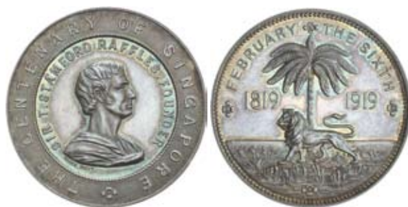
1792* Singapore, Centenary 1919, Sir Stamford Raffles, in silver (39mm) by Spink. Attractively toned, nearly FDC.