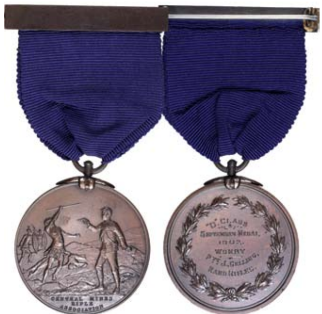
lot 1804 part