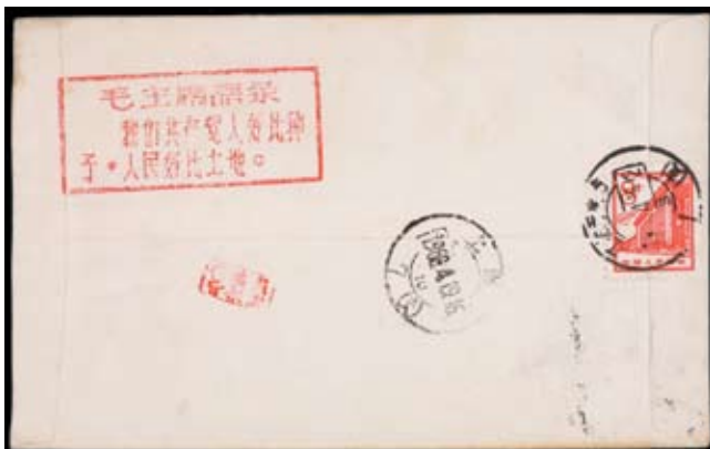
lot 1982 part