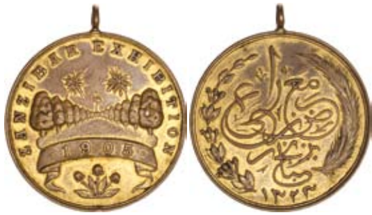
1715* East Africa, Zanzibar Exhibition, 1905 in gilt bronze (34mm), with loop ring mount at top. Very fine.