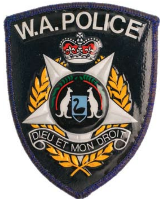
lot 1830 part