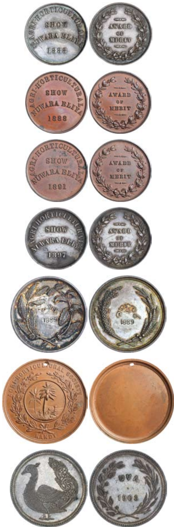
lot 1704 part