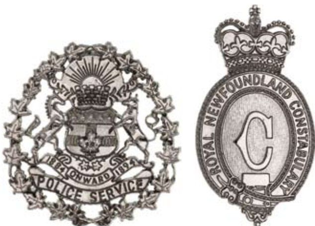
lot 1891 part