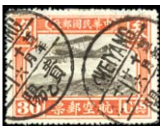
lot 1955 part

1955* China , two stock books of mint and used issues of the Empire and Republic with issues from 1898 with much duplication, noted used 50c green with O/P, SG 203 (6); junk and reaper lots, some with O/P, noted junk lot $2 (12), $5 (5); $5 Sun Yat Sen (8) (SG 405; 1921 air noted 30c used (SG 353) (illustrated); Martyrs and 1932 air stamps (both each approx 100) mint and used; multiple examples of singles 1936 commems; Sun Yat Sen 1938-1941 values (approx 100) to $20 (9) mint and used (SG 500B); Martyrs to 50c quantities (approx 100) some as blocks; 1940 airs mostly as mint blocks of 4 (approx 150); O/P on pieces (about 100) mint blocks (SG 576 - 582); Thrift movement set used most on pieces (SG 599-604); 30th anniv. O/P blocks to $1 etc; Provincial surcharges in quantity; 20th anniv. of Sun Yat Sen death blocks of 4 and singles, used set on piece (illustrated) (SG 746-751); 1945 equal treaties blocks singles, Chiang inauguration used singles (SG 784-789); large quantity of other issues including postage dues;+ Local post issues for Amoy, Shanghai Municipality, WuHu, Foochow Kewkiang etc. Mint, MUH and used. (1000s) $750