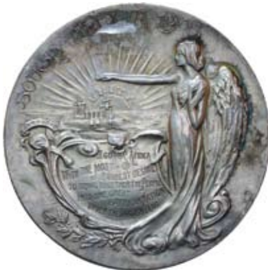
lot 1797 part