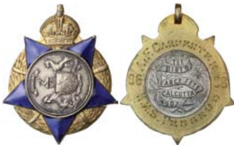
lot 1747 part