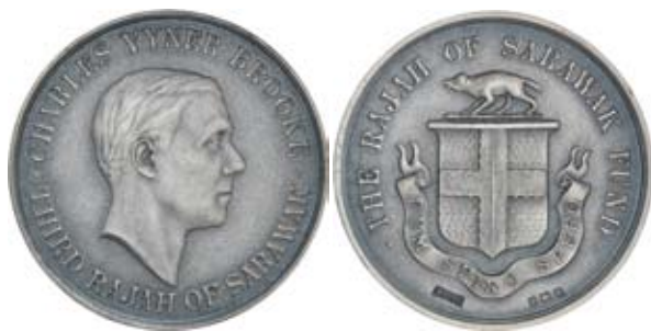
1791* Sarawak, Charles Vyner Brooke, The Rajah of Sarawak Fund, in silver (38mm) hallmark M.BLD (B'han H). Matte finish, uncirculated.