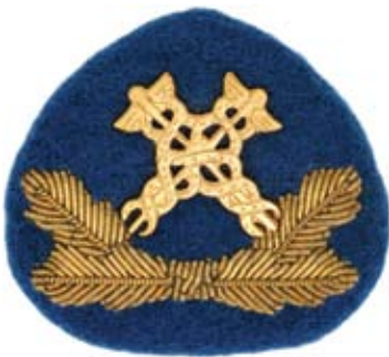
lot 1886 part