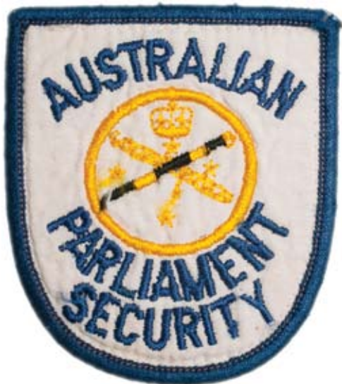
lot 1862 part