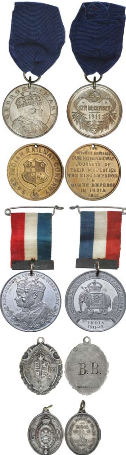
lot 1756 part