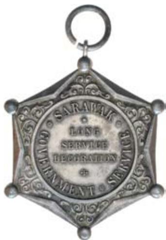
1790* Sarawak, Vyner Brooke Rajah, Government Service medal, Long Service Decoration, in silver (38x50mm) with loop suspension. Toned extremely fine.