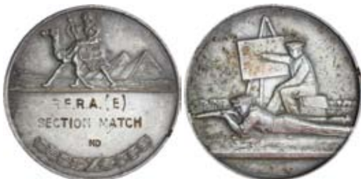
lot 1716 part