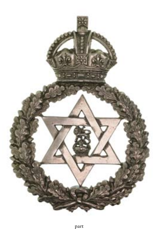
Trinidad and Tobago, Police helmet badge (KC), struck in voided white metal (59x83mm); cap badge (KC), in voided white metal (33.5x39mm); and collar badges (QC) also in voided white metal (20x23mm), all badges with two lugs on reverse. Extremely fine. (4)