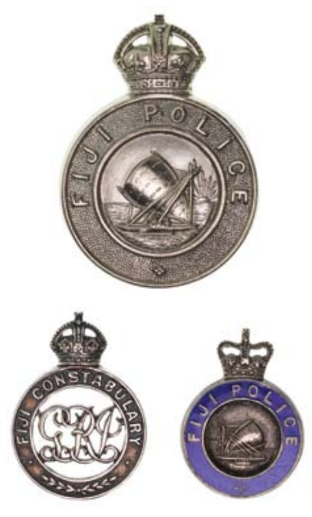
lot 4236 part