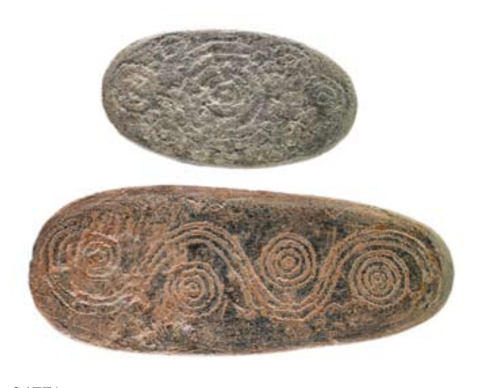
2477* Australia, Aboriginal stone churinga, flat stone, with incuse rings and lines on one side and incuse rings and winding lines on the other side (9.5x24cm); another but with incuse rings on both sides (8x14.8cm). The first with traces of red ochre, nearly fine, the second with no red ochre, good. (2)