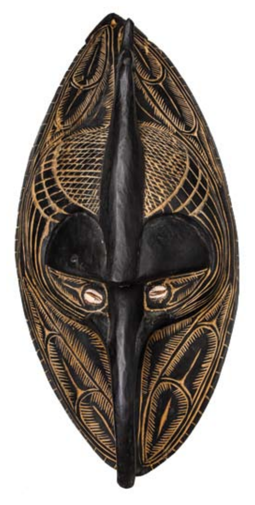
2486* Papua New Guinea, Sepik, 19th century, large hardwood spiritual face mask, of elongated form with stylised nose and headdress, (610mm long). Very fine and scarce. $100

New Guinea , Sepik River area, wooden mask, of blackened timer, elongated face with carved ears and shell eyes, (82cm long). Very fine .