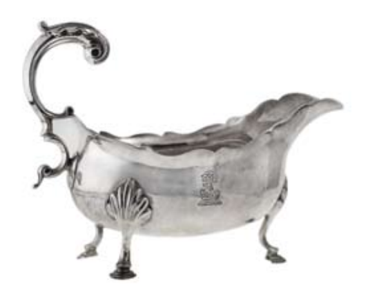
2406* Sterling Silver Gravy Boat, (185g weight), hallmarked for London 1777, makers mark, C H (Charles Hougham), with three hoof legs and shell mounts, acanthus handle and scalloped rims. Very fine .