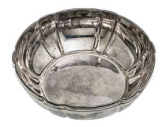
2416* Sterling silver bowl, 20th century, Western Mining Corporation, presentantion piece, of deep round form with fluting, banding around rim, (180mm diameter), 510g weight. Extremely fine.