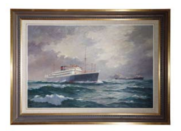
2423* Hansen, Ian, (1948-), oil on canvas, framed, (90cm x 60cm), 'The MV Duntroon', off the coast of Australia. Very fine . $1,500

Royal Caroline was one of the most sumptuously decorated vessels of all time. She was sailed for pleasure cruises by the royal family, and as a transport for members of court sailing between England and Holland. She was usually escorted by as many as four frigates and, when the King was aboard, accompanied by the First Lord of the Admiralty.