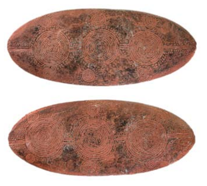
2476* Australia, Aboriginal stone churinga, flat stone covered in red ochre, with incuse rings, lines and dots on both sides (10.5x26cm). Very fine .