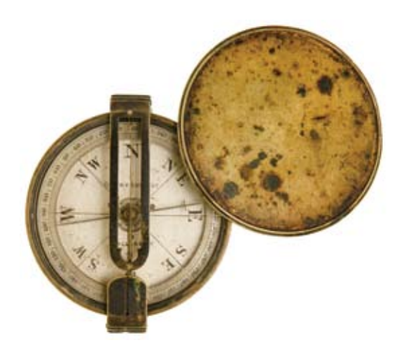
2411* Prismatic surveyor's compass, 19th century, brass case with steel dial, with lift-off lid, maker, 'Drury & Wright, Ballaarat (sic). Very good .