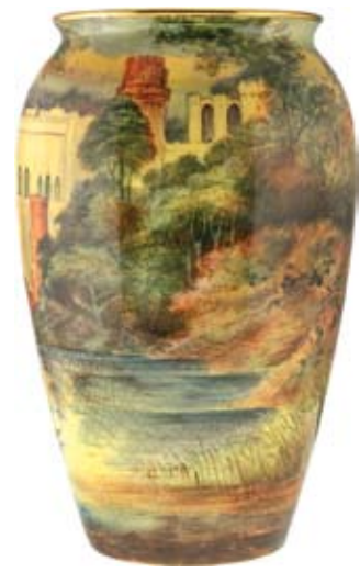
2417* Royal Winton, Tiber shape vase, c.1930, 'Warwick Castle', hand painted by B.Austin, decorated all over woodland scenes and the castle behind, (190mm high). Very fine .