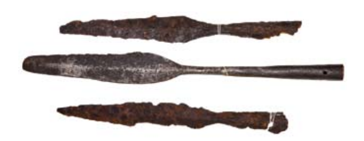
2461* Carolingian Empire, thrusting spearheads, c9th century, in bronze. Two in poor condition, the other very good. (3) $150

All with tags indicating ex Sotheby's 1 Nov 1978 (one indicates lot 64). No mail out for this lot, collection only from the Sydney Office, or buyer to make own arrangements.