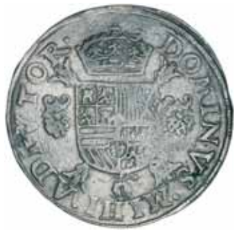
2014^{\ast} Netherlands, Spanish Netherlands, Philip II, silver ecu, 1573, mm hand, Brabant Mint (Del.17). Good very fine. $200