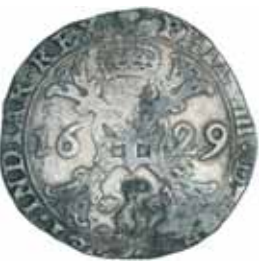
2017* Netherlands , Spanish Netherlands, Brabant, Philip IV, silver half patagon, 1629 Brussels Mint, mm angel face (KM.46.6). Fine and rare.