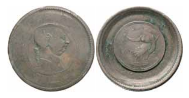
2154* Singapore, Malay Peninsula, fighting cock token struck over a George III copper penny 1806-7 (cf Pridmore 68; SS.84). Very fine for piece and very rare.