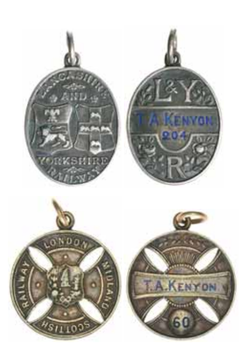
lot 2500 part