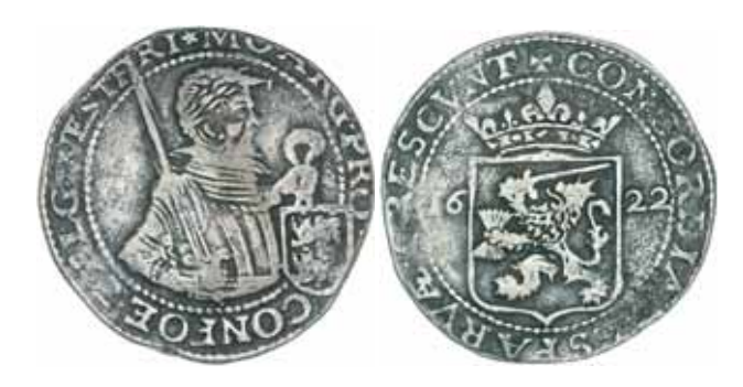
2050* Netherlands, Westfriesland, silver rijksdaalder, 1622 (KM.15.1; Dav 4842). Good fine.