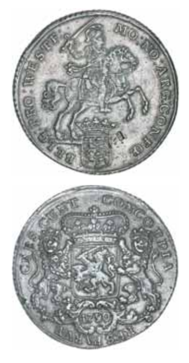
2052* Netherlands , Westfriesland, silver rider or ducat, 1790/89 (KM.127). Old test mark on reverse, otherwise toned very fine with clear overdate.

Ex Jim Duncan Collection, Noble Numismatics Sale 84 (lot 2330 part).