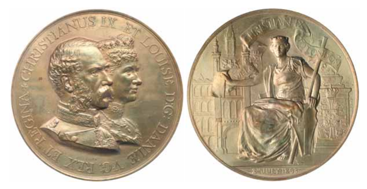
2495* Christian IX and Louise of Denmark Visit to the City of London, 1893 in bronze (75mm) by F.Bowcher (Eimer 1783); BHM 3454). With silvered(?) finish, good extremely fine.