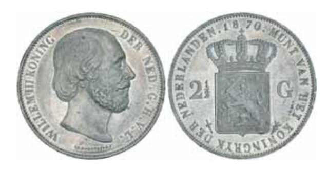
2077* Netherlands, William III, silver two and a half gulden, 1870 (KM.82). Good very fine.