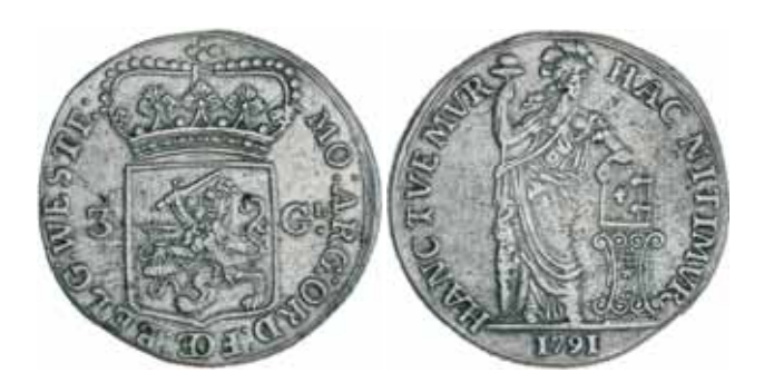
2053* Netherlands, Westfriesland, three gulden, 1791 (KM.141.2). Good very fine. $220

Ex Jim Duncan Collection, Noble Numismatics Sale 84 (lot 2319 part).