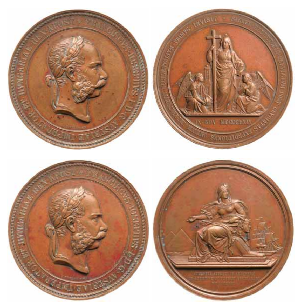
2341* Austria , Franz Joseph 1869 in bronze (72mm), another 1869 with Egyptian Pyramids in bronze (72mm) both by J.Tautenhayn. Second housed in a Spink and Son 17 & 18 Piccadilly WI box, very fine. (2) $100