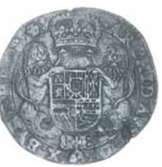
2018* Netherlands , Spanish Netherlands, Brabant, Philip IV, silver ducaton, 1651 (KM.50). Hoard patina, otherwise fine. $100