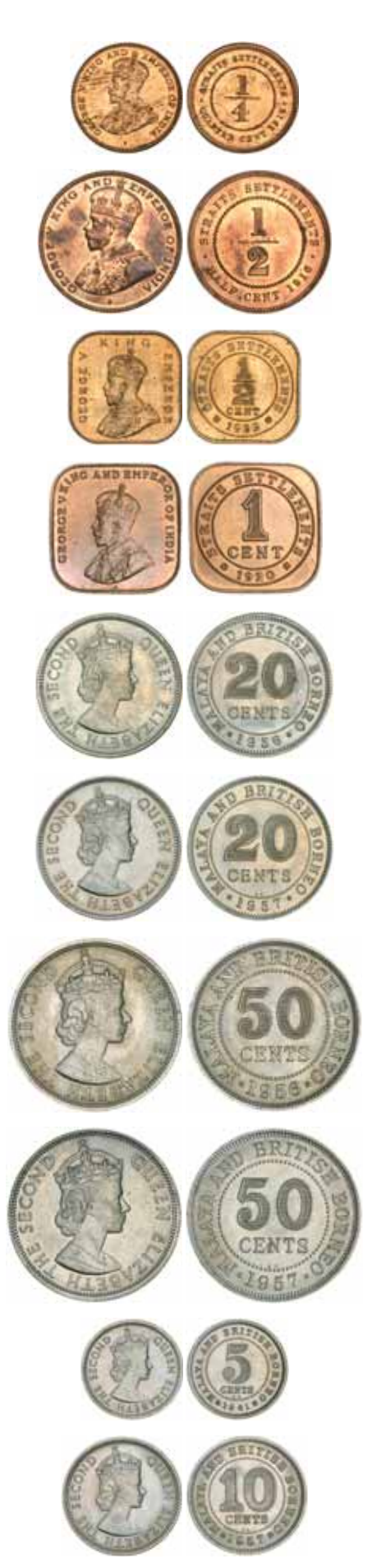
lot 2176 part

Straits Settlements, Queen Victoria - George V; Malaya, George VI - Elizabeth II, quarter cents, 1901 (2), 1905 (2), 1908; half cents, 1845, 1884, 1889, 1908 (2); one cent, 1845, 1862, 1872, 1874, 1874H, 1884, 1885, 1887-91, 1894, 1895, 1897 (2), 1898 (2), 1900, 1901, 1903, 1904, 1906, 1907, 1908 (2); George V, quarter cents, 1916 (2, full red uncirculated); half cents, 1916 (2, one red uncirculated), 1932 (2, one full mint red); one cent, 1919, 1920 (2, one red uncirculated), 1926 (2); Malaya, George VI, half cent, 1940 (2); one cent, 1939, 1940 (2), 1941I (uncirculated); Elizabeth II, twenty cents, 1954, 1956, 1957KN, 1961 (2); fifty cents, 1954 (very fine), 1955H, 1956, 1957KN, 1958H (2), 1961, all these nearly uncirculated - uncirculated, five and ten cents similar condition and dates, in savings bank covers (8) in clip seal plastic bag. Fair - uncirculated. (111)