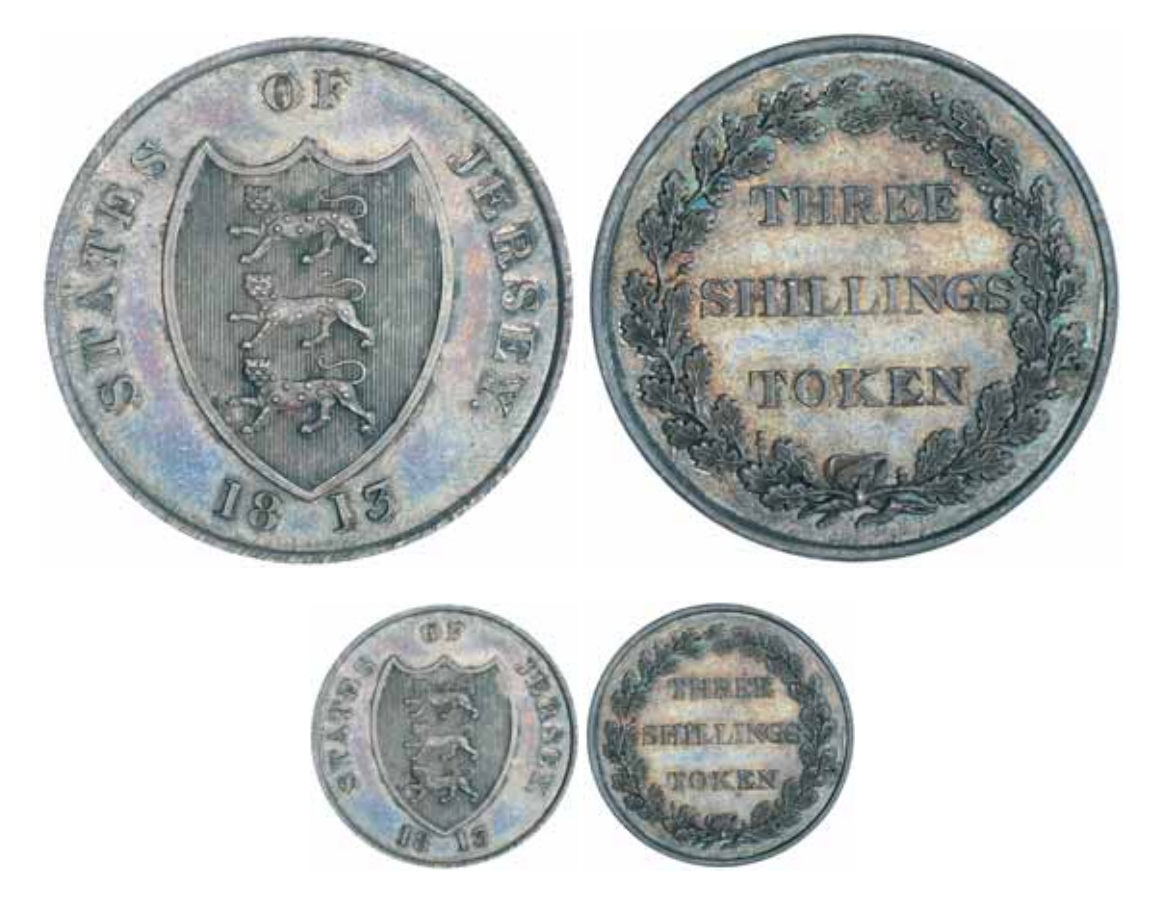
2422* Jersey , proof silver three shillings (Bank) token, 1813 (D.2; Pridmore 1; KM.Tn6). Toned, nearly FDC and rare.