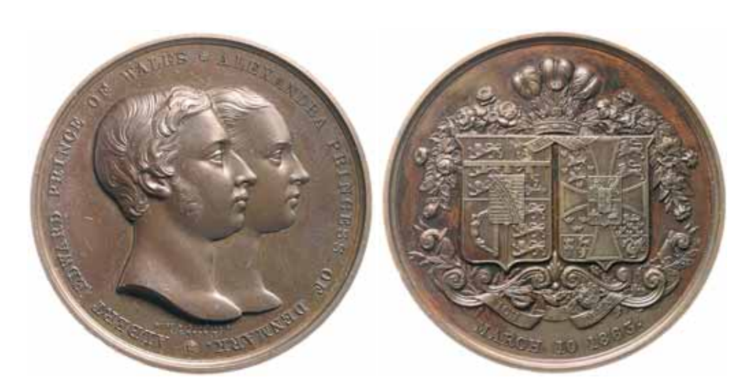
2485* Marriage of the Prince of Wales to Princess Alexandra, 1863, in bronze (63mm) by L.C.Wyon (Eimer 1562a; BHM 2770). Nearly uncirculated. $150

Ex Dr V.J.A.Flynn Collection, from Status Sale 315 (lot 7141).