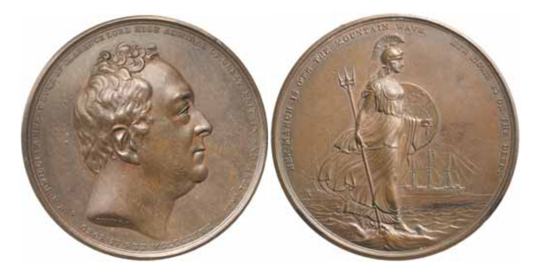
2477* Duke of Clarence, Lord High Admiral 1827 in bronze (65mm) by J.Henning (Eimer 1192; BHM 1296). Even dark brown patina, good very fine. $100