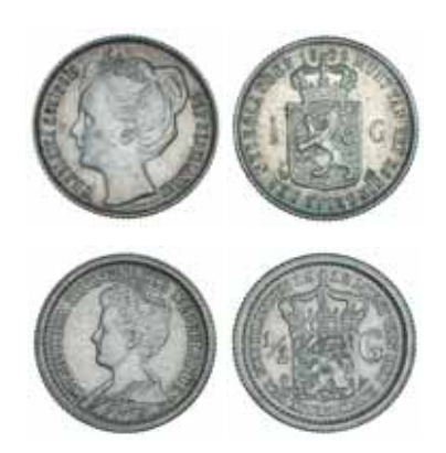
2079* Netherlands, Wilhelmina, silver half gulden, 1905 (KM.121.2), 1912 (KM.147). Extremely fine. (2) $90

Netherlands, Wilhelmina, silver gulden, 1892 (KM.117), 1901 (KM.122.1), 1912 (KM.148). Very fine - good very fine. (3) $250