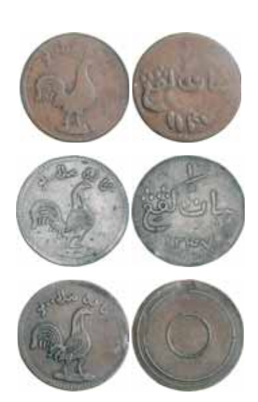
lot 2130 part

Ex W.J.Noble Collection (Sale 61B, lot 1446, from Spink Sale (lot 142) and Mark E.Freehill Collection, ticket states RRR as a proof, 'a manufacturer's sample to secure orders'.