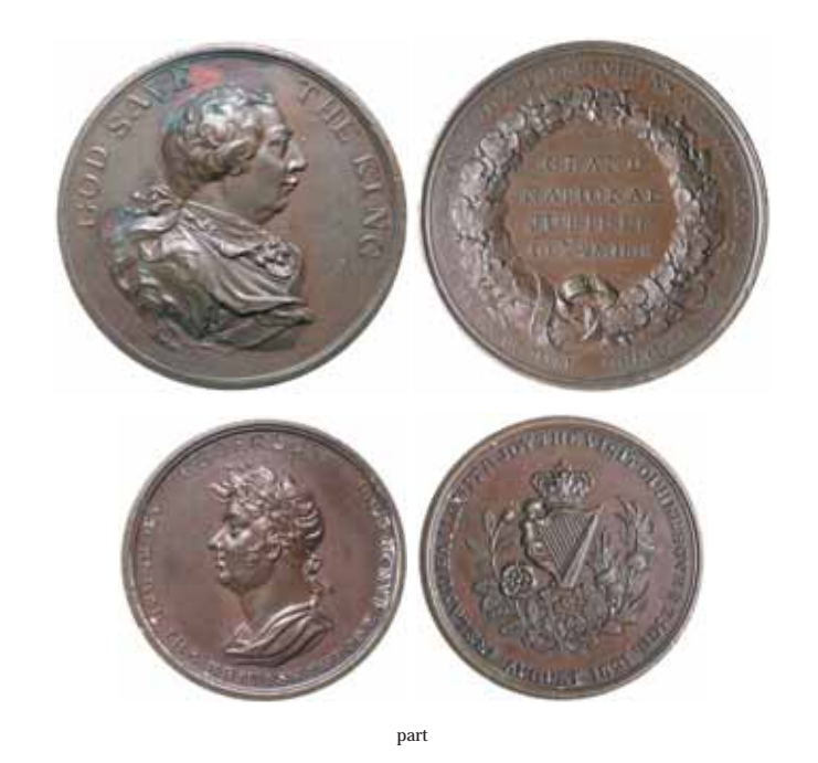
George III , Defeat of Sultan Tipoo 1792, in bronze (48mm) by C.H.Kuchler (Eimer 845); Jubilee 1809, in bronze (42mm) by T.Wyon (Eimer 993); Death of Caroline 1821, in white metal (40mm) 'Though destroyed by the storm...'; Death of Princess Charlotte 1817, memorial of 1821 in bronze (39mm) by K&S; George IV, Visit to Ireland, 1821 in bronze (34mm) (Eimer 1149; BHM 1117); Princess Victoria Birthday May 24 1837 in white metal. First corroded only good, others very fine - extremely fine . (6)