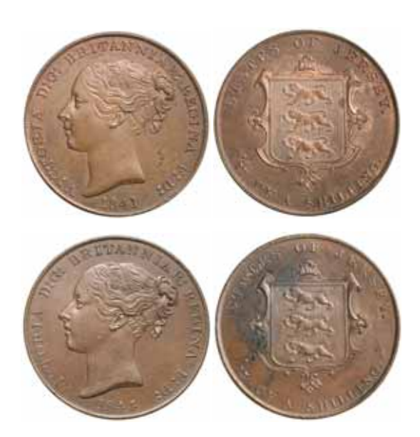
lot 2425 part

collections, from a Spink Sale 102 (lot 3172).