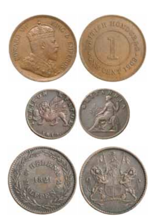
lot 2305 part