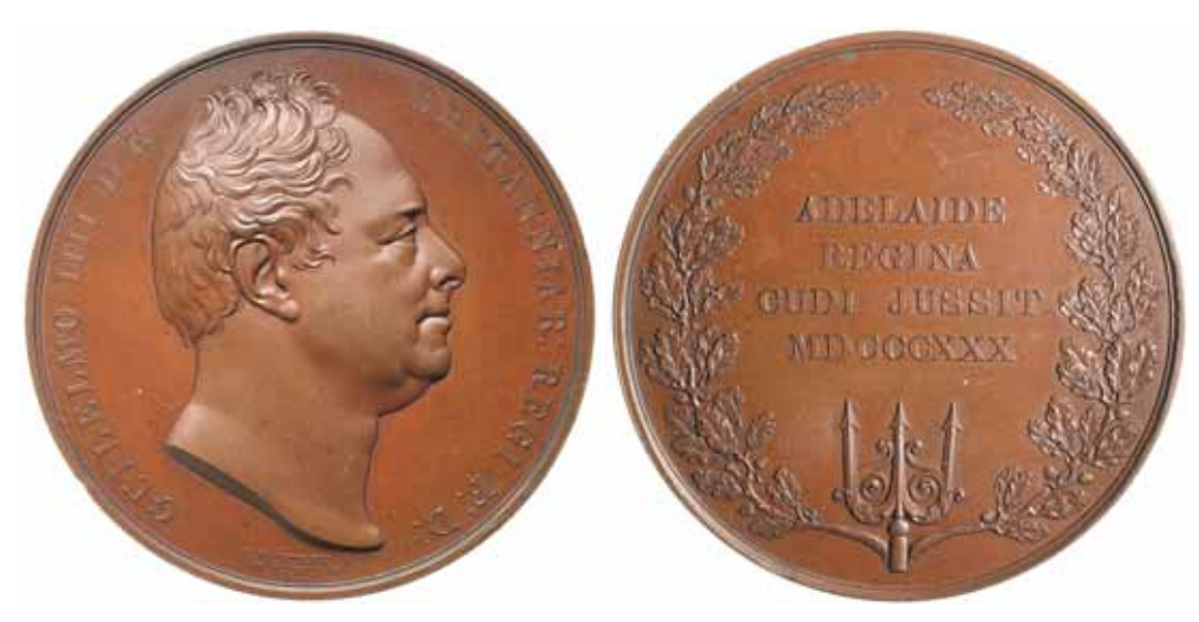
2478^{*} William IV, Accession 1830, in bronzed copper (68mm) by W.Wyon (Eimer 1220; BHM 1414). Nearly uncirculated. $$350

Ex Dr V.J.A.Flynn Collection, from Status Sale 315 (May 2015)(lot 7123).