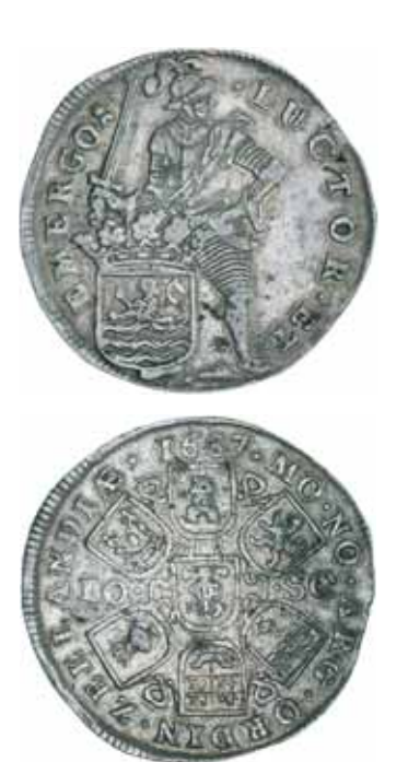
2055* Netherlands , Zeeland, silver sixty stuivers (or ten schilling), 1687 (KM.63; Dav.4973). Light grey tone, very fine or better.

Ex Jim Duncan Collection, Noble Numismatics Sale 84 (lot 2329).