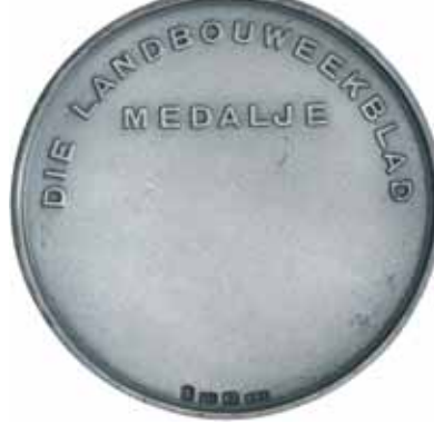
lot 2374 part