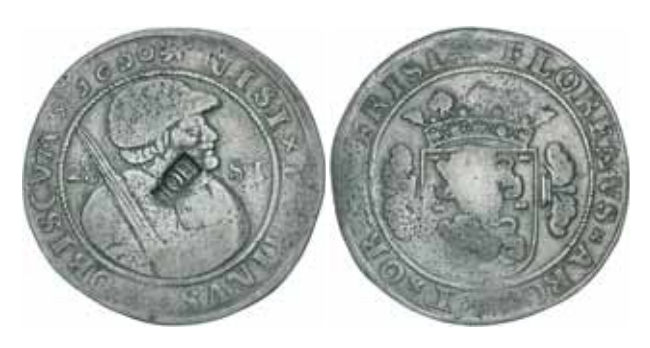
2051^{\ast} Netherlands , Westfriesland, 28 stuivers with 'Hol' countermark, 1690 (KM.69.14/90; Del 1100). Good fine . $200

Ex\ Jim\ Duncan\ Collection,\ Noble\ Numismatics\ Sale\ 84\ (lot\ 2330\ part).