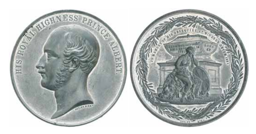
2484 Death of Prince Albert, 1861, in white metal (64mm) by Ottley (Eimer 1547; BHM 2700). Good extremely fine.