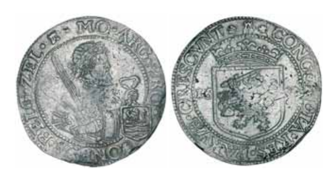
2054* Netherlands, Zeeland, silver rijksdaalder 1630 (KM.17; Del 941; Dav.4844). Nearly very fine. $150

Ex\ Jim\ Duncan\ Collection,\ Noble\ Numismatics\ Sale\ 84\ (lot\ 2330\ part).