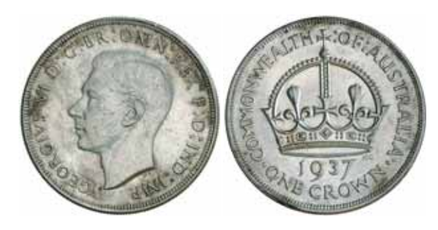
784* George VI , 1937. Uncirculated .