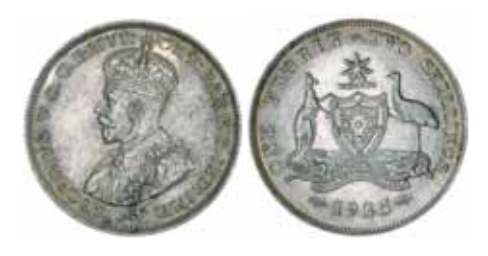
794* George V , 1925. Original subdued mint bloom on the reverse, nearly uncirculated. $660