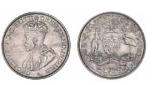
799* George V, 1933. Brown and gold tone, good very fine and rare thus. $200