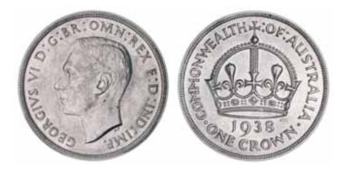
785* George VI, 1938. Frosty mint bloom on the reverse, minor scuff marks on obverse, nearly uncirculated. $650