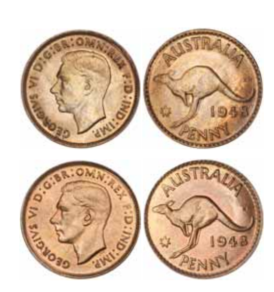
890* George VI, 1948. Uncirculated, one with mirror-like reverse. (2)