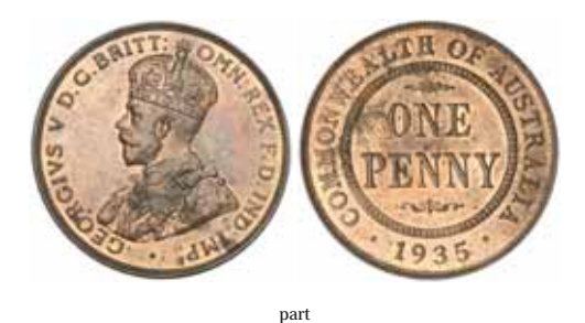
885* George V, 1932, 1935 and 1936. Cleaned good extremely fine; nearly uncirculated; extremely fine. (3)