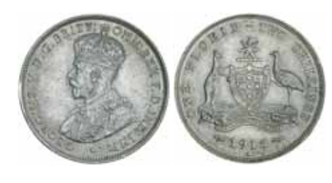
George V, 1915H. Good extremely fine.