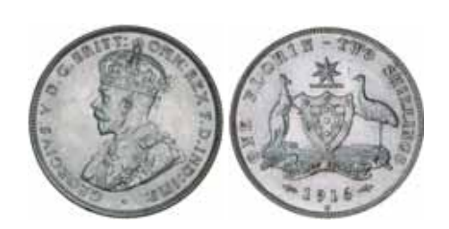
George V, 1916M. Full white silver mint bloom, uncirculated.