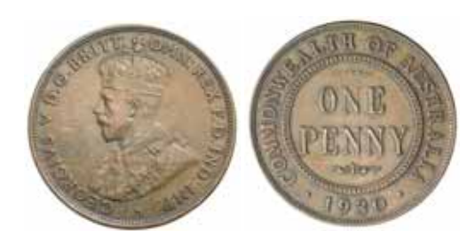
884^{\ast} George V, 1930, Indian die. Six pearls, even brown patina, nearly very fine and rare.