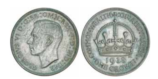
786* George VI , 1938. Toned, good extremely fine.

Private purchase from Noble Numismatics in 2007 with their ticket.