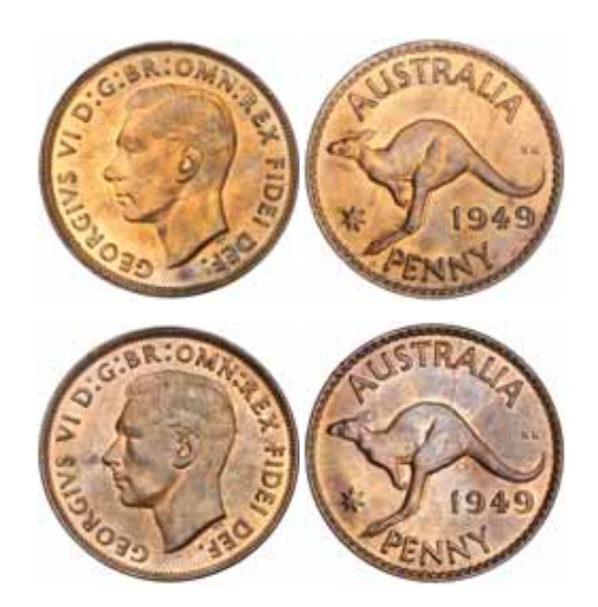
891* George VI , 1949. Mostly red, uncirculated. (2)