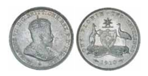
788* Edward VII, 1910. Toned slightly on the obverse, full underlying original mint bloom, uncirculated.