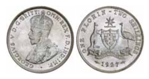
795* George V, 1927. Frosty mint bloom, uncirculated.