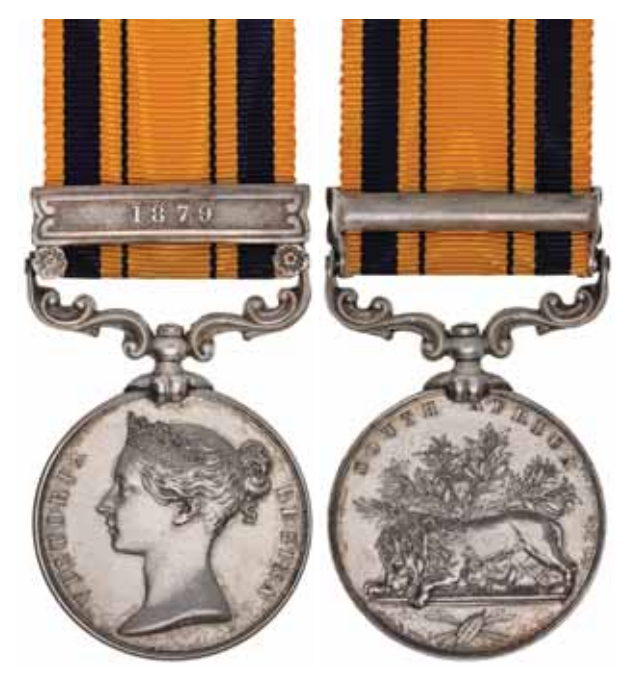
3544* South Africa Medal 1877-79, - clasp - 1879. Troopr F.Scoble. Ferreira's Horse. Officially engraved. A few minor edge nicks, otherwise nicely toned extremely fine.

Only 10 clasps for 1879 to Bettingtons Horse.