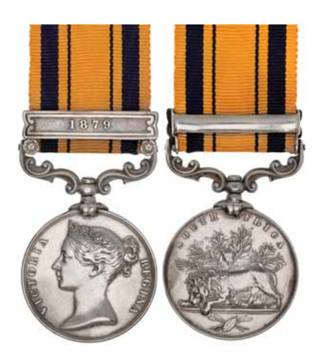
3543* South Africa Medal 1877-79 , - clasp - 1879. Tpr W.Quick. Frontier Lt Horse. Officially engraved. Good very fine. $1,200

44 medals with 1879 clasp issued to Ferreira's Horse.