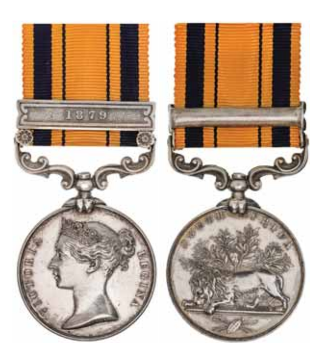
3545* South Africa Medal 1877-79 , - clasp - 1879. Tr H E Wardine. Victoria Md Rifles. Officially engraved. Toned, nearly extremely fine. $1,250

179 medals with 1879 clasp issued to Frontier Light Horse.