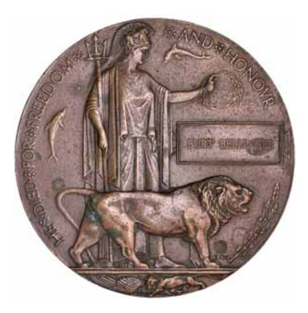
3641* Memorial Plaque WWI, named to Burt Bellinger. Some areas of light oxidation, otherwise fine.