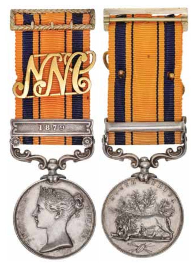
3546* South Africa Medal 1877-79 , - clasp - 1879, with brooch suspender and NNC brass shoulder title. Capt: S.L.G.Wingfield. 1st Nat. Nat: Contgt. Officially engraved. Nicely toned, nearly extremely fine.