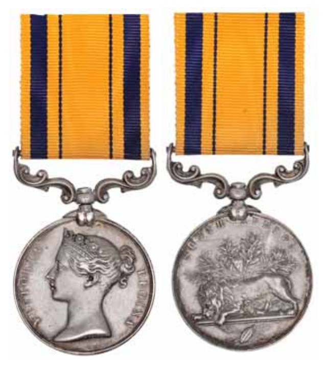
3547* South Africa Medal 1877-79, no clasp. Batty Sergt May. Dn Volr Arty. Officially engraved. Toned very fine. $1,000

45 medals with 1879 clasp issued to 1 Battalion Natal Native Contingent.