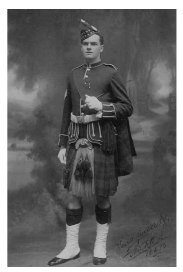
lot 3665 part

With a plastic covered folder of research.