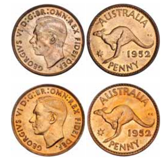
1359* George VI, 1952. Full original mint red, choice uncirculated. (2) $100