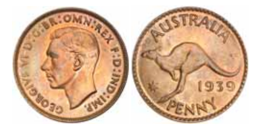
1333* George VI , 1939. Full original mint red, uncirculated. $200

Ex Noble Numismatics Sale 100 (lot 847).