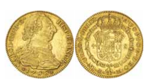
1127^{\ast} Spain, Carlos III, four escudos, 1788M (Madrid) (KM.418.1a). Good very fine. $900