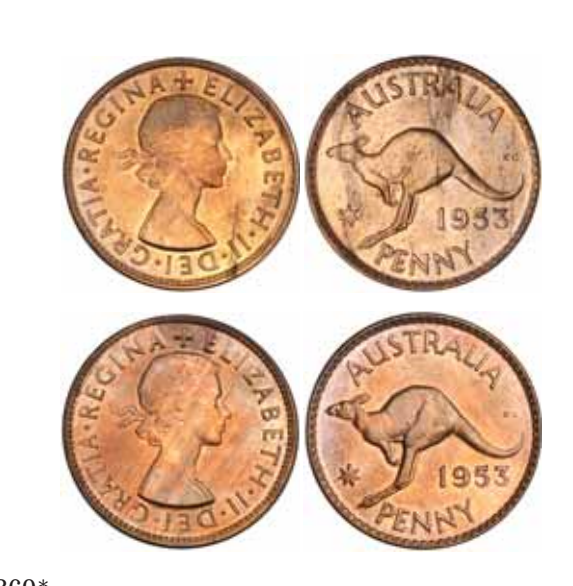
1360\,^* Elizabeth II, 1953. Full mint red, uncirculated. (2)