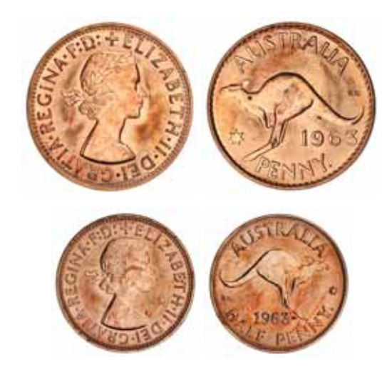
Elizabeth II, Perth Mint proof set, 1963. Slight toning, nearly FDC. (2) $500