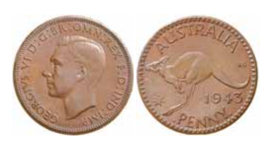
1346* George VI, 1943I, large denticles, as in 1942. Purple brown, nearly extremely fine or better and rare as such. $150