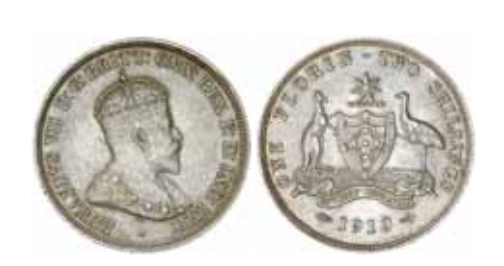
1235^{\ast} Edward VII, 1910. Lighly toned, extremely fine.