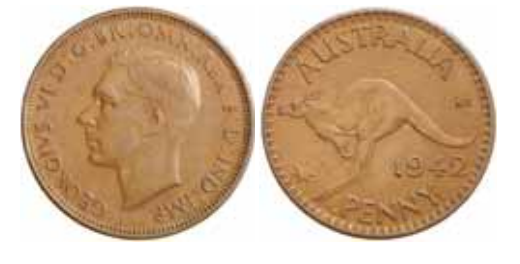
1343^{\ast} George VI, 1942I, missing I mm. Good very fine and rare in this condition. $$100