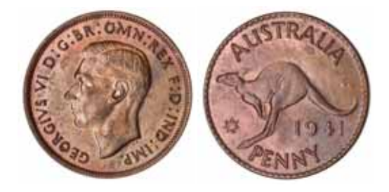
1336* George VI, 1941 K.G. Attractive brown and red nearly uncirculated, hairlines on neck of king, otherwise a choice example of this scarce issue.