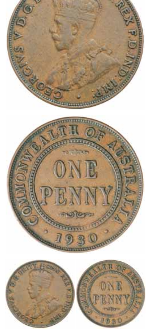
1327* George V, 1930 Indian die. Six pearls, with even brown patina, nearly very fine and rare.