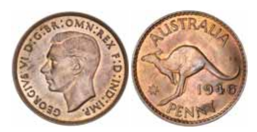
1351* George VI, 1946. Purple, red and brown, uncirculated and rare in this condition. $750