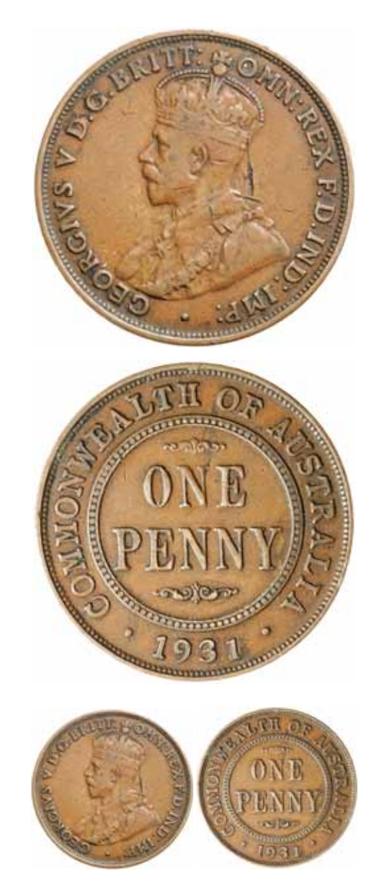
1329* George V, 1931, dropped 1, Indian die. Old scratches behind King's ear, also on base of crown and on shoulder, otherwise good fine and very rare.