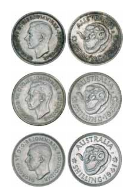
1285* George VI, 1938, 1940 and 1941. The first toned, uncirculated; the third uncirculated, other lightly toned good extremely fine. (3) $300