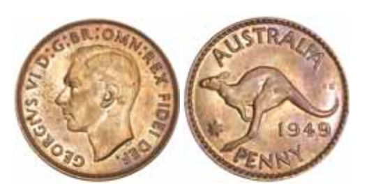
1355* George VI, 1949. Mirror-like, uncirculated.