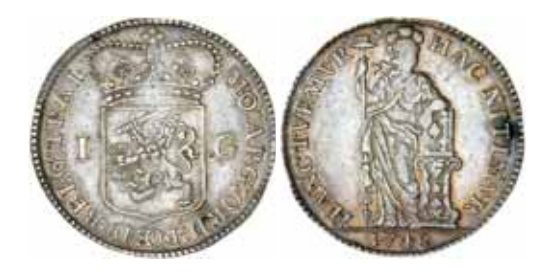
1121* Netherlands, West Freisland, silver gulden, 1748 (KM.97.4). Face not struck up, otherwise good very fine. $150