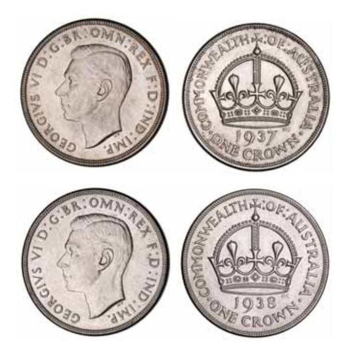
1233* George VI , 1937, 1938. Uncirculated; nearly uncirculated. (2)