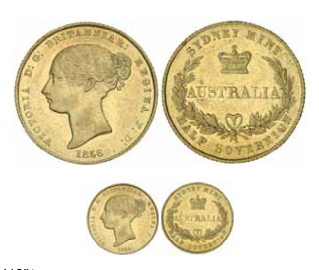
1158* Queen Victoria , first type, 1856, with filletted head of Victoria left, by James Wyon. Good extremely fine and rare in this condition.

Ex Noble Numismatics Sale 87 (lot 2036).