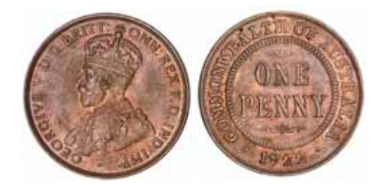
1324* George V, 1922 London die. Brown and red, nearly uncirculatd.