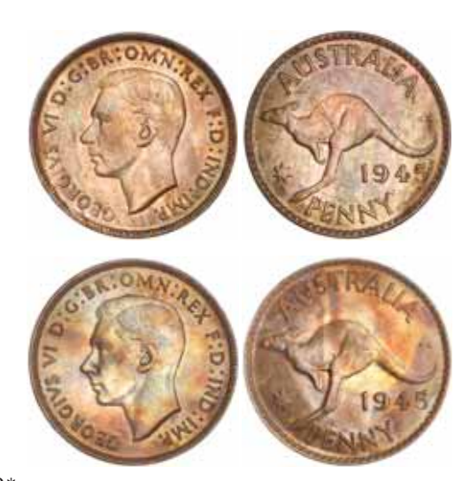
1349* George VI, 1945Y. Streaky tone, and other dark tone areas, otherwise uncirculated. (2) $150