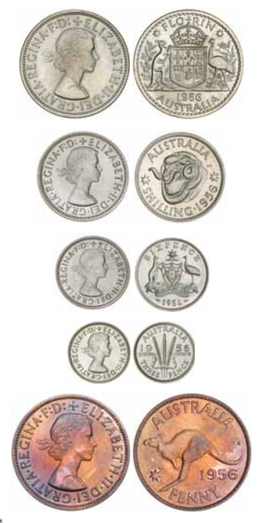
1227* Elizabeth II , Melbourne Mint proof set, 1956. The penny toned, otherwise nearly FDC. (5) $500