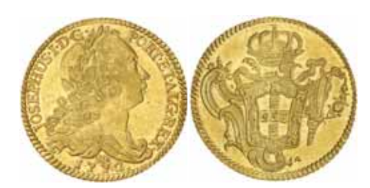
1095* Brazil , Joseph I, gold 6400 reis or half Johanna, 1757 R, Rio de Janeiro Mint, (14.14 g), (KM.172.2). Good very fine . $1,000