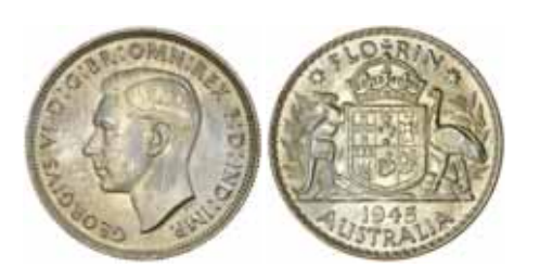
1270* George VI , 1945. Choice uncirculated.