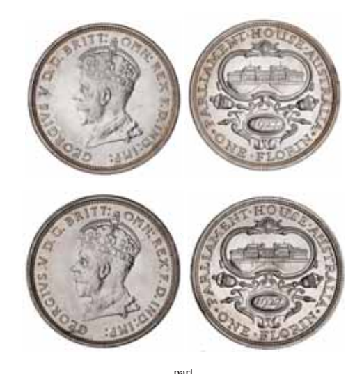
1251* George V, 1927 Canberra. The fourth with three clear steps, choice uncirculated. (5) $400