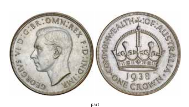
1234* George VI, 1938. Extremely fine; good extremely fine. (2) $200