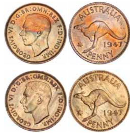
1352* George VI, 1947. Uncirculated, one with streaky tone. (2)