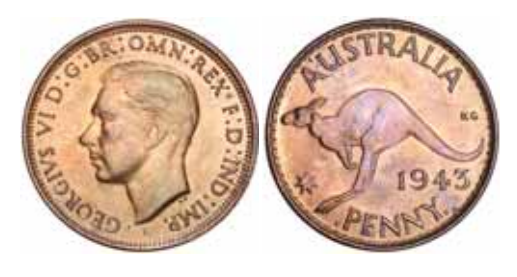
1344* George VI, 1943I. Nearly full mint red, uncirculated. $100