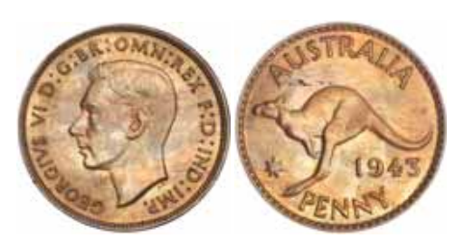
1347* George VI, 1943Y. Unusually red, uncirculated.