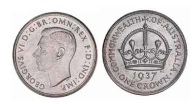
1232* George VI , 1937. Uncirculated.