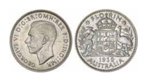
1269* George VI, 1939. Nearly extremely fine.