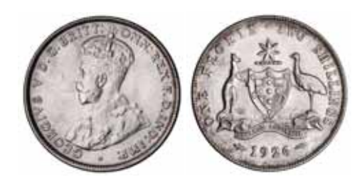
1247* George V , 1926. Good extermely fine.