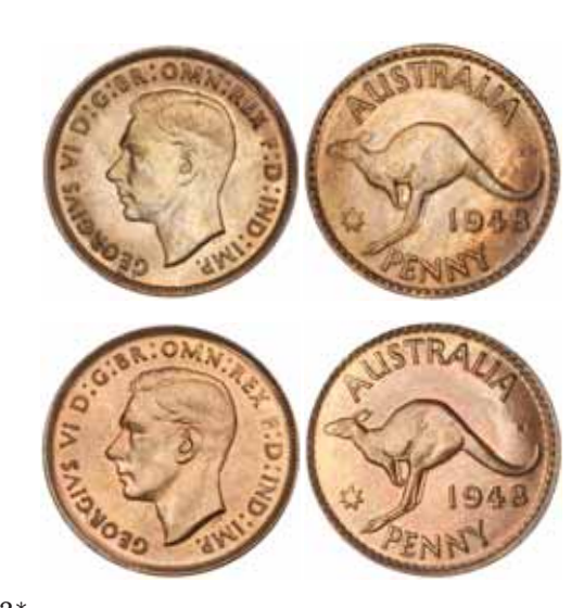
George VI, 1948. Uncirculated, one with mirror-like reverse. (2) $100