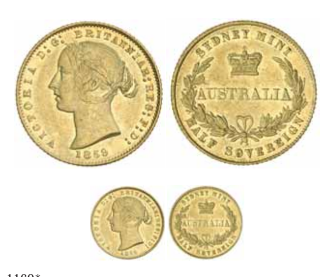
1160* Queen Victoria, second type, 1859. Good extremely fine and rare thus. $3,500