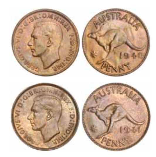
1335* George VI , 1940 K.G; 1941Y. Uncirculated and rare thus. (2)