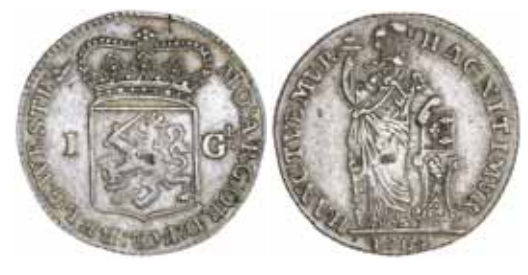
1122* Netherlands, West Friesland, silver one gulden, 1764 (KM.97.5). Good very fine, with several field knocks. $100