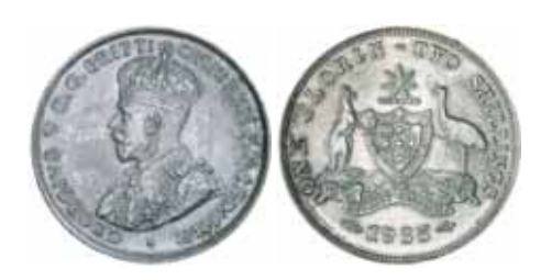
1263* George V, 1935. Original frosty mint bloom, choice uncirculated. $1,700