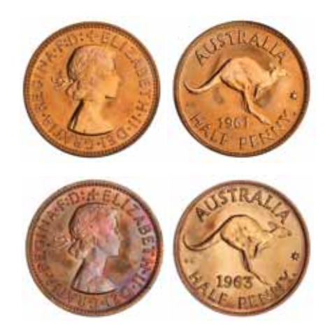
1230* Elizabeth II , proof halfpenny, 1961, 1963. Dark red brown; nearly full mint red, FDC. (2) $200