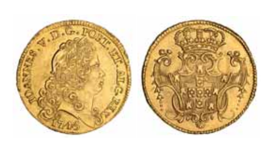
1125* Portugal, John V, four escudos (or peca), 1745 (KM.221). Nearly extremely fine. $1,500