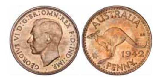
1339* George VI, 1942I. Full original mint red, uncirculated and scarce as such.