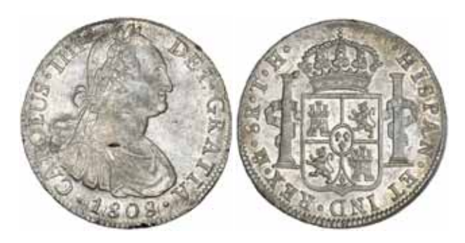
1120* Mexico , Charles IIII, silver eight reales, 1808TH, Mexico City Mint (KM.110). Brilliant, extremely fine.