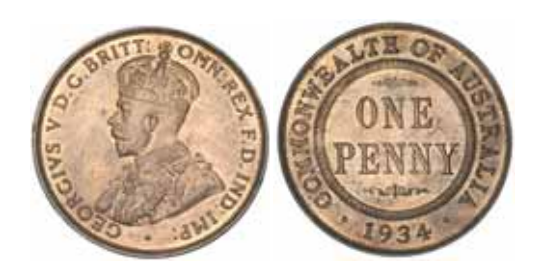
1332* George V , 1934. Subdued full mint red, choice uncirculated.