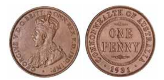
1330* George V, 1931 dropped 1, London die. Hints of red on the reverse, good extremely fine and scarce in this condition. $200