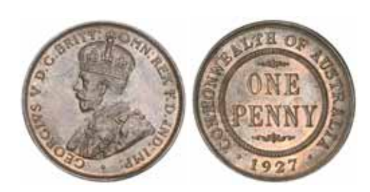
1326* George V, 1927 London die. Red and brown uncirculated. $280