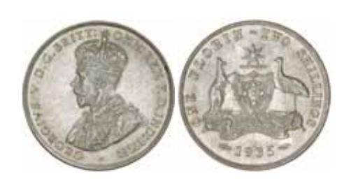
1265* George V, 1935. Dusty tone, subdued mint bloom, uncirculated. $500