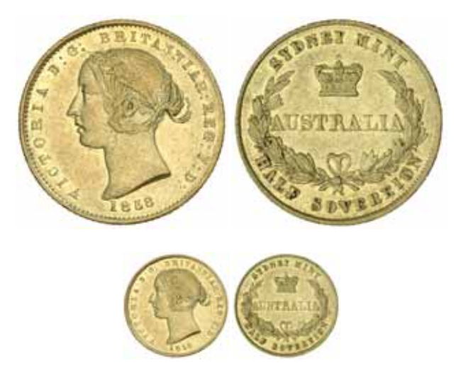
1159* Queen Victoria, second type, 1858. Extremely fine/good extremely fine. $3,000