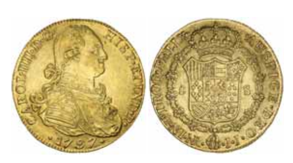
1099* Colombia, Charles IIII, gold eight escudos, Nuevo Reino Mint, 1797JJ (27.03 g), (KM.62.1). Extremely fine or better. $1,800