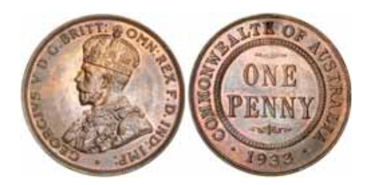
1331* George V, 1933. Attractive brown and red, nearly uncirculated.