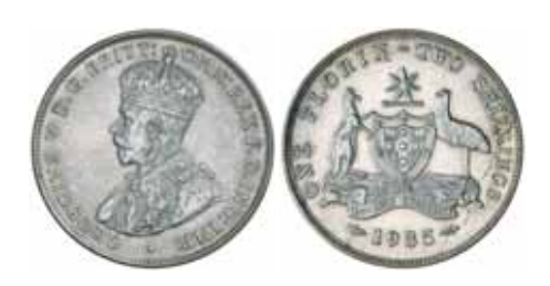
1264* George V, 1935. Uncirculated .