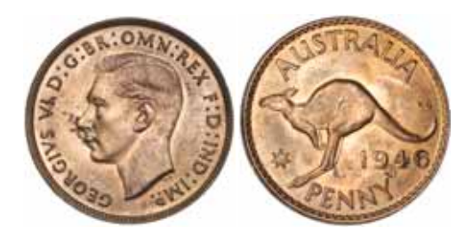
1350* George VI, 1946. Practically full mint red uncirculated and rare in this condition, one of the finest known.