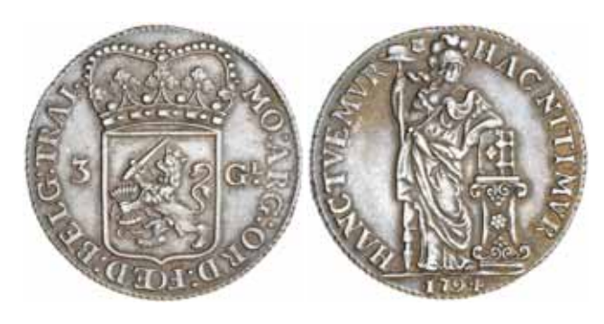
1124* Netherlands, Utrecht Province, silver three gulden, 1794 (KM.117). Attractively toned, extremely fine, scarce. $300