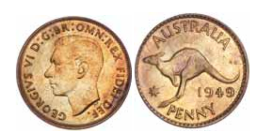
1354* George VI, 1949. Mirror-like obverse, uncirculated.