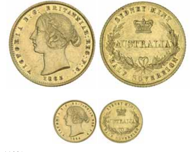
1163* Queen Victoria, second type, 1863. Cleaned, mirror-like fields, good extremely fine and very rare in this condition. $3,000