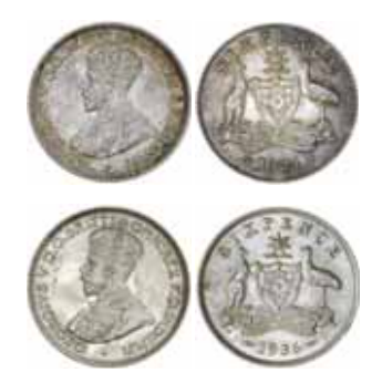
1294* George V , 1921 and 1936. Uneven dark grey toning, extremely fine; mint bloom, nearly uncirculated. (2) $200