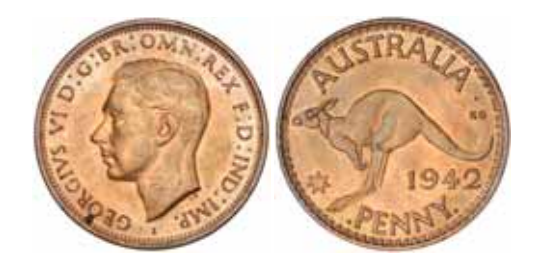
George VI, 1942I. Full original mint red, choice uncirculated one of the finest known.