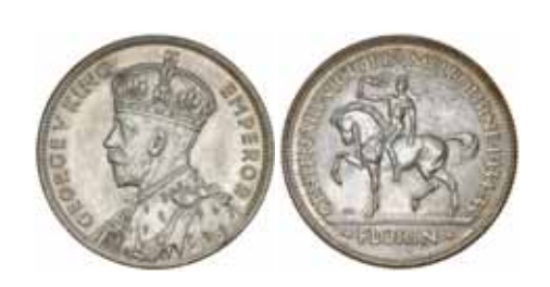
1261* George V , 1934-35 Melbourne Centenary. Well struck up wreath, lightly toned, nearly uncirculated. $400

With a Foy & Gibson Pty Ltd, envelope for a 1934-35 Melbourne Centenary florin (very fine).