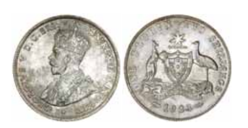
1252* George V , 1928. Full mint bloom, weak strike on star, light toning, choice uncirculated. $1,000

Private purchase from the Rare Coin Company.