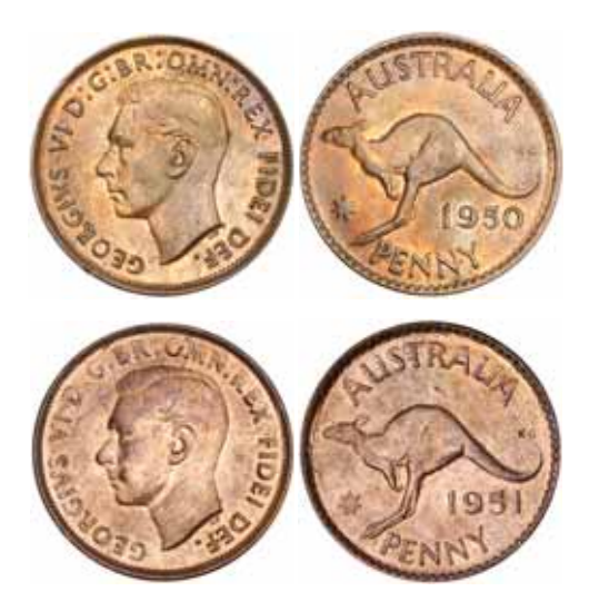
1357* George VI, 1950, 1951. Full mint red, uncirculated. (2) $100