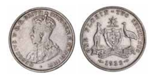
1256* George V, 1932. Nearly fine/fine.