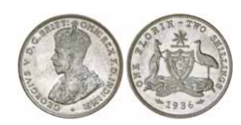
1267* George V, 1936. Subdued mint bloom, uncirculated. $200