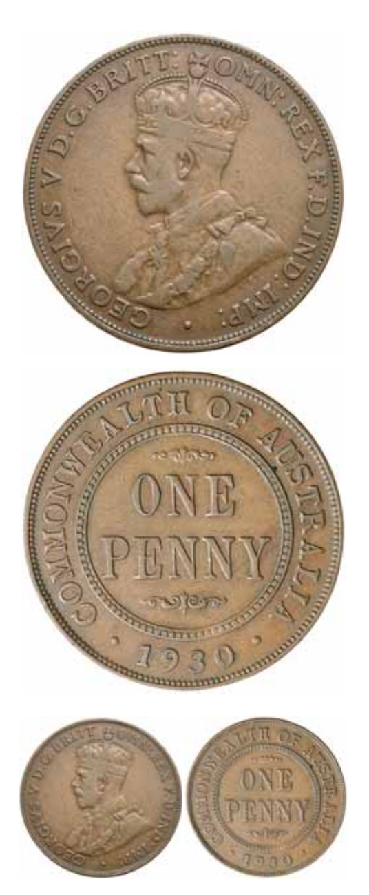
1328* George V , 1930 Indian die. Six pearls, good fine/nearly very fine and rare.