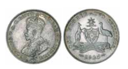
1245* George V , 1925. Original subdued mint bloom on the reverse, nearly uncirculated. $700