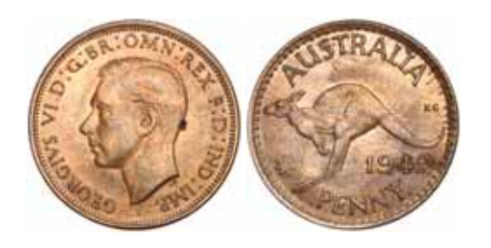
1342* George VI, 1942I. Red and brown, uncirculated. $100