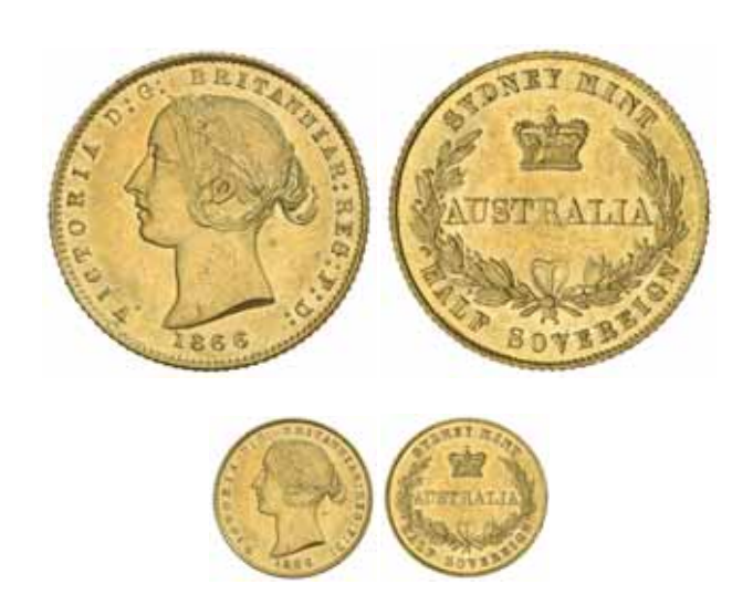
Queen Victoria , second type, 1866. Tiny ding on reverse in crown, die also clashed, smaller ding behind neck, otherwise good extremely fine and rare in this condition. $3,000

Private purchase from Monetarium 25/11/89.