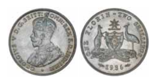
1266* George V, 1936. Full original mint bloom with golden highlights, unfortunate rim mark on obverse at 4 o'clock, otherwise uncirculated.