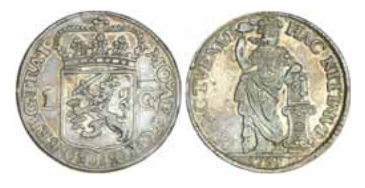
1123\,^* Netherlands, West Freisland, silver gulden, 1765 (KM.97.5). Very fine. $120