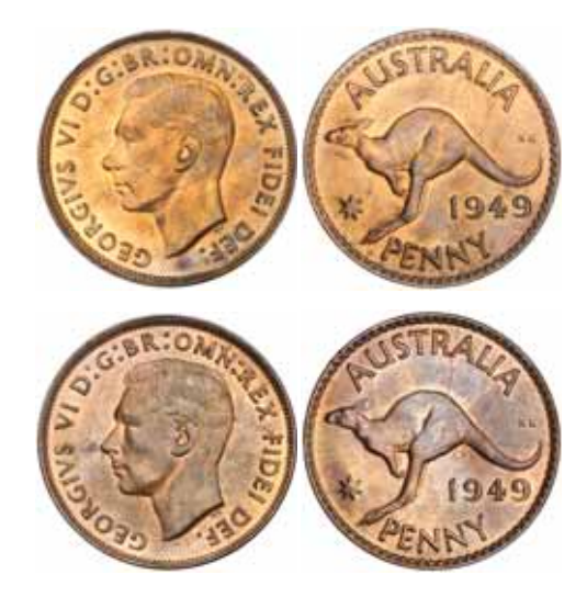
1356* George VI , 1949. Mostly red, uncirculated. (2)