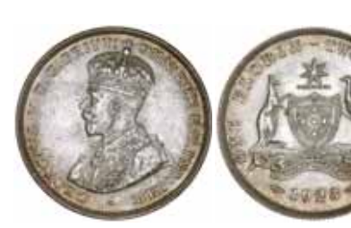
1244* George V, 1923. Olive and gold toned frosty mint bloom, uncirculated. $1,000