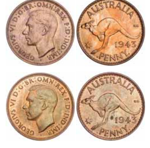
1345* George VI, 1943I. Nearly full mint red, uncirculated. (2) $200