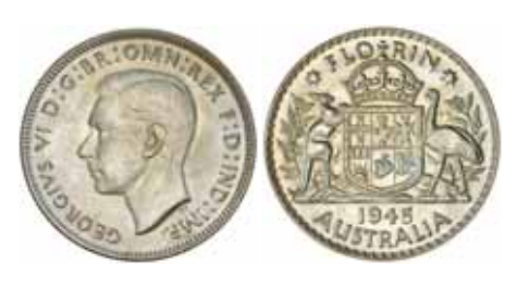
1271* George VI, 1945. Choice uncirculated.