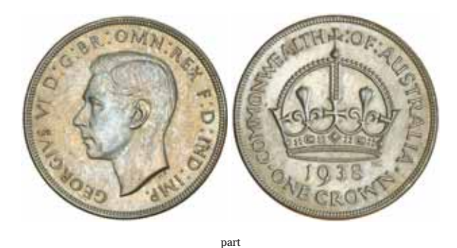
918* George VI, 1938. Extremely fine or better. (4) 919

George VI, 1938. Light tones, extremely fine. (4)