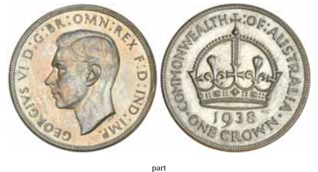
917* George VI, 1938. Extremely fine - good extremely fine. (3)