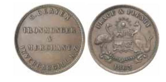
840* Beaven , S., Invercargill penny, 1863 (A.42). Good very fine and very scarce.