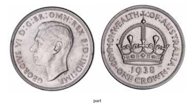
916* George VI, 1938. Extremely fine or better. (2)