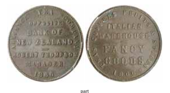
Alliance Tea Company , Christchurch penny, 1866 (A.7, 8). Second with die cuts on rims, fine; first good very fine and scarce. (2) $400