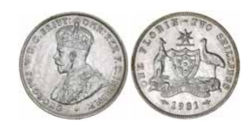
944* George V, 1931. Nearly uncirculated.