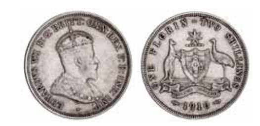
923* Edward VII, 1910. Very fine.