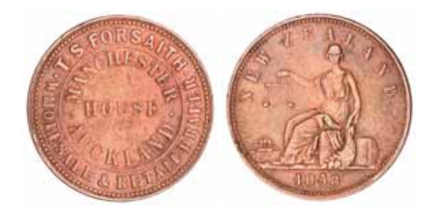
Forsaith, T.S., Auckland penny, 1858 (A.130). Brushed of patina, otherwise very fine. $150