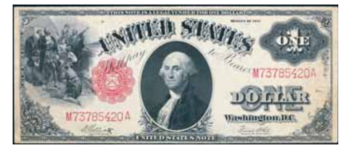
3741* USA, Legal Tender note, one dollar, 1917 (P.187). Good very fine. $120