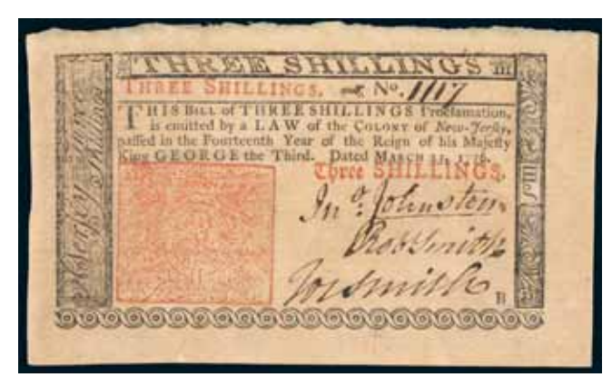
LOT 3739 FRONT