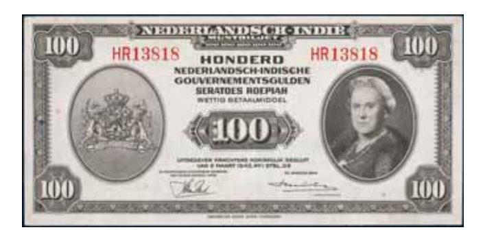
lot 3765 part